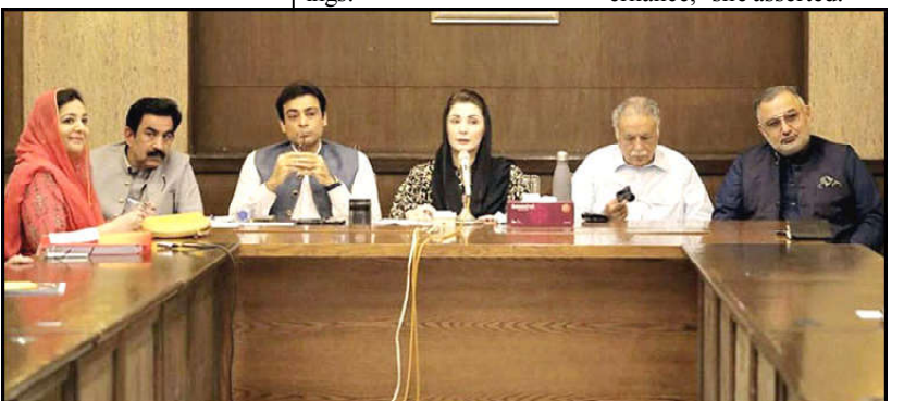
LAHORE: PML-N Senior Vice President and Chief Organizer Maryam Nawaz presides over the party meeting at Model Town. Former chief Minister Punjab Hamza Shehbaz is also present.

Maryam was of the view that the people of Pakistan had to pay the price for Nawaz's ouster. She expressed the hope that from today courts would do justice to the Sharif family. "I pray to the Almighty Allah that justice should be for all. She opined that prejudice against the party supremo was actually against the country and the nation. "What Pakistan needs is a fresh beginning," PML-N's chief organizer said, and stressed the need for ridding the country of politics of confrontation, violence and vengeance. She expressed the resolve that after coming to power, the party would develop all parts of the country, including Sindh. "Our war is against inflation, poverty and bad governance," she asserted.