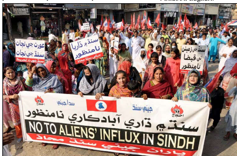
HYDERABAD: Members of Jeay Sindh Mahaz are holding protest demonstration for demanding expelling Afghan refugees from province, held in Hyderabad.