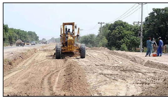
MULTAN: Head Muhammad Road is currently undergoing expansion to ensure smoother traffic flow. This vital route connects several cities in South Punjab, Balochistan, and Khyber Pakhtunkhwa (KPK).

In accordance with statistics provided at the meeting, Balochistan reported the most dengue cases—2,627—followed by Punjab (1,961), Sindh (1,014), and Khyber Pakhtunkhwa (234 instances).