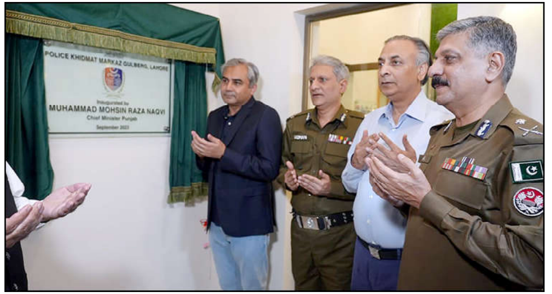
LAHORE: Caretaker Chief Minister Punjab Mohsin Naqvi offering Dua after inaugurating extension project of Police Helpline Centre at Liberty.