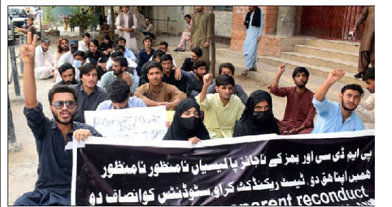
QUETTA: Affected students of MDCAT holding a protest

ISLAMABAD (Online): "Good to see you all my friends". This was said by Chief Justice of Pakistan (CJP) Umar Ata Bandial while talking to the lawyers in his last case in Supreme Court (SC).