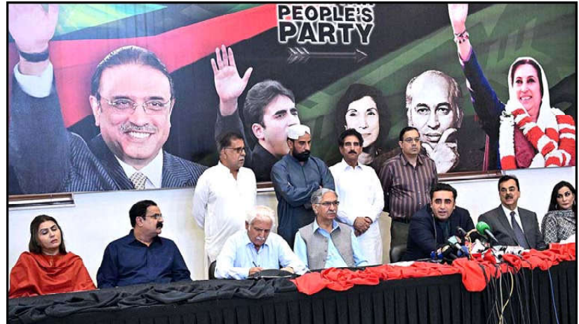
LAHORE: PPP Chairman Bilawal Bhutto Zardari talking to media persons after Central Executive Committee meeting.

limit constituencies after every census is officially published." With elections potentially just a few months away, PPP Chairman Bilawal Bhutto Zardari has been engaging in public gatherings and organising party meetings as part of the party's electoral preparations of late. One such highly-anticipated meeting of the PPP's Central Executive Committee was held today. Speaking to the media after the meeting, Bilawal said the announcement of an election date and schedule was the only way to dispel the "confusion and atmosphere of instability and insecurity" prevalent in the country.