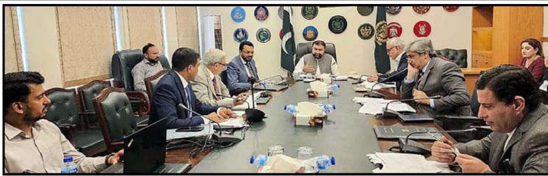
ISLAMABAD: Caretaker Federal Minister for Interior Sarfraz Ahmad Bugti and Federal Minister for Communication and Railways Shahid Ashraf Tarar during meeting of Cabinet Sub-Committee on ECL.

QUETTA: The caretaker Provincial Minister for Public Health Engineering (PHE) and Population Welfare, Sardar Ejaz Ahmed Khan Jaffar has stated that there is a basic role of Balochistan Rural Support Programme (BRSP) in development of rural areas and provision of basic amenities of life there is along with the government.