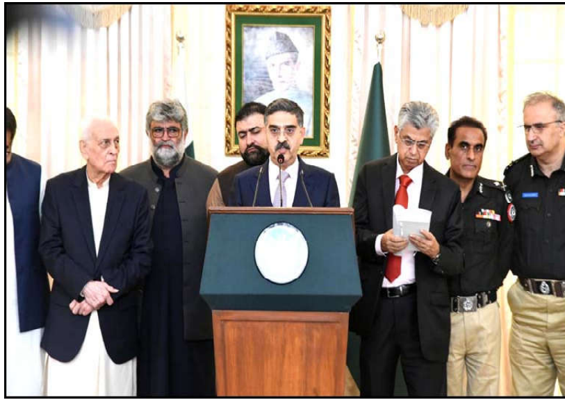
ISLAMABAD: Caretaker Prime Minister Anwarul Haq Kakar addressing a Press conference after a meeting. Caretaker Chief Minister Balochistan Mir Ali Mardan Khan Domki is also present

He said that the Gwadar Port will play a major role in the economic development of Balochistan and Pakistan, and that it will help to boost trade and investment in the region.