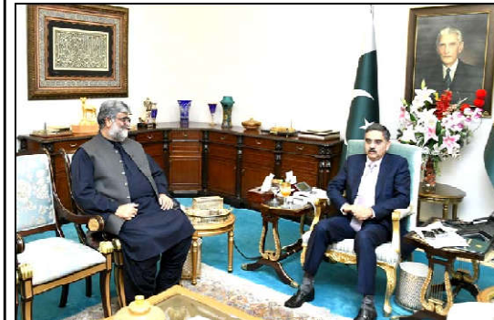
ISLAMABAD: Caretaker Chief Minister Balochistan Mir Ali Mardan Khan Domki meeting with Caretaker Prime Minister Anwarul Haq Kakar