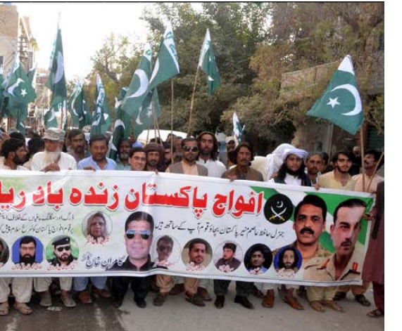
QUETTA: Members of Pakistan Muttahida Mahaz are holding rally to expressing their solidarity with Pakistan Armed Forces, at Quetta press club.

ISLAMABAD (INP): The major Supreme Court verdict on Friday on the amendments made to the National Accountability Bureau's (NAB) laws created a stir in political circles as it restored the corruption cases against political bigwigs.