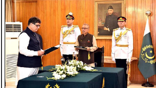
ISLAMABAD: President Dr. Arif Alvi administering the oath of office to Mr. Fawad Hasan Fawad as Caretaker Federal Minister, at Aiwan-e-Sadr.

The president administered him the oath at a ceremony here at Aiwan-e-Sadr.