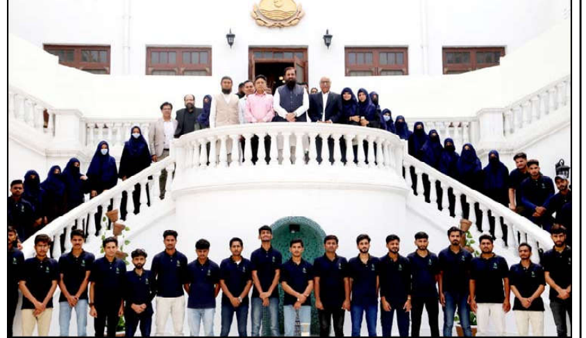
LAHORE: Governor Punjab Muhammad Balighur Rehman in a group photo with IT trainers under the aegis of Akhuwat Foundation at Governor House.