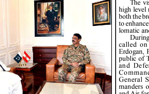
QUETTA: Caretaker Chief Minister Balochistan, MirAli Mardan Khan Domki meeting with Commander 12 Corps Lt. General Asif Ghafoor during his visit to Headquarters Balochistan Corps.

society. Respecting each stakeholders about the conother is must. People don't stitutional matters of the reremain same. The process gion. He mentioned that