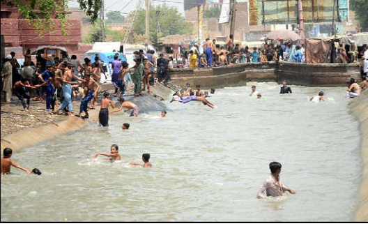
PESHAWAR: Youngsters' enjoying bathing on Kohat Road.

discrimination, and access to effective remedies. The Inaugural Session was attended by the faculty members and directors of the Academy. The two-day training program aims to provide participants with an orientation of District of the sessions. In his Legal Empowerment Committees (DLECs)