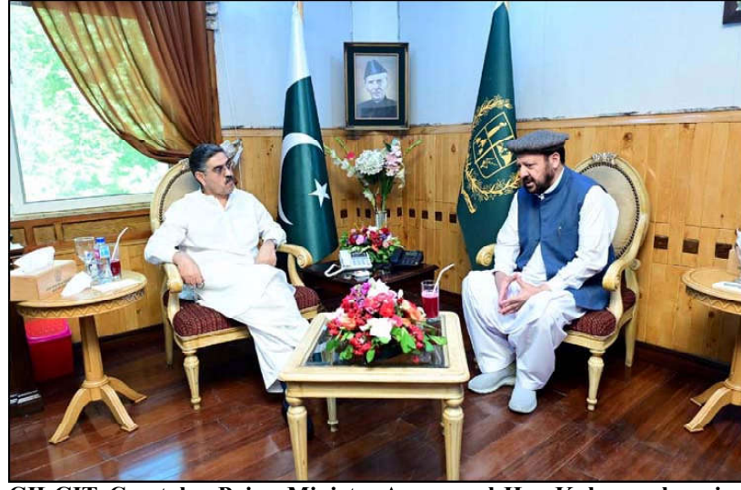
GILGIT: Caretaker Prime Minister, Anwaar-ul-Haq Kakar exchanging views with Gulbar Khan, Chief Minister Gilgit Baltistan during meeting held in Gilgit.