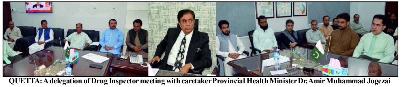
QUETTA: A delegation of Drug Inspector meeting with caretaker Provincial Health Minister Dr. Amir Muhammad Jogezaei

It is pertinent to mention here that Pakistan People's Party (PPP) has convened a meeting of its Central Executive Committee (CEC) to mull over the upcoming general election date. The meeting will discuss the country's current political situation and plan for future political developments. The CEC will also review its stance on general elections. The invitations have been sent to all the CEC members which will take place at 3 p.m. on September 14 in Bilawal House Lahore and PPP chairman Bilawal will preside over the meeting.