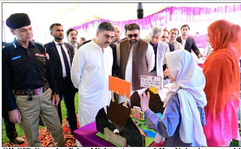
GILGIT: Caretaker Prime Minister, Anwaar-ul-Haq Kakar interacts with school students at the display stalls of various science, technology and artistic projects, at Chief Minister Secretariat in Gilgit.