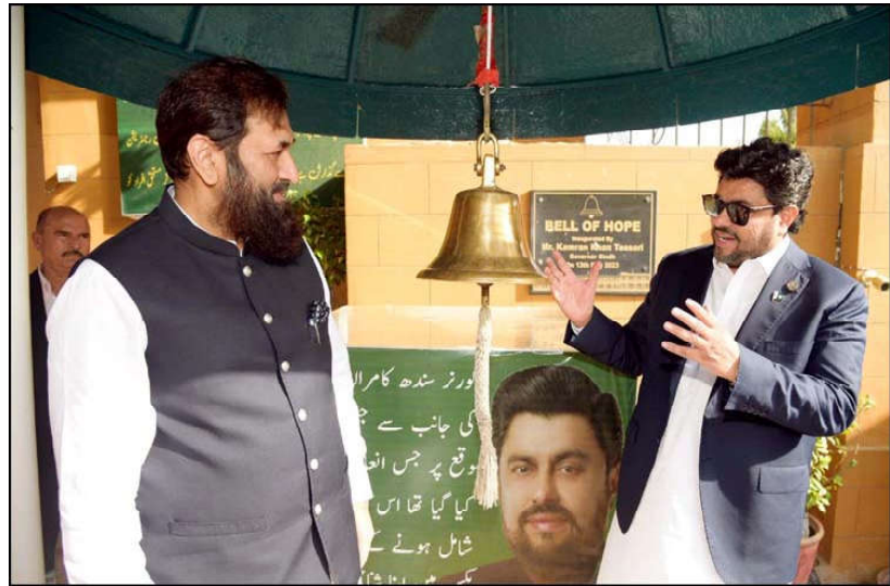
KARACHI: Sindh Governor, Kamran Khan Tessori briefs detail about the aims and objectives of the bell to Punjab Governor, Muhammad Balighur-Rehman during meeting held at Governor House in Karachi.