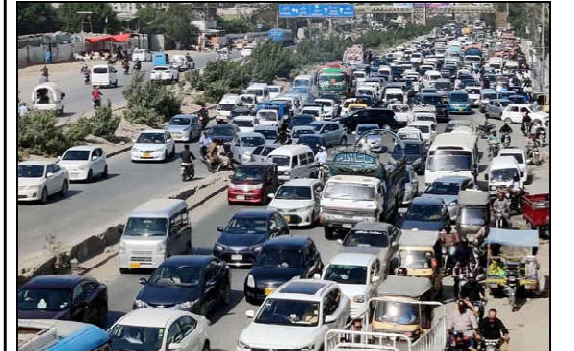
KARACHI: Commuters are facing inconvenience during traffic jam due to construction works of new development projects on University road.