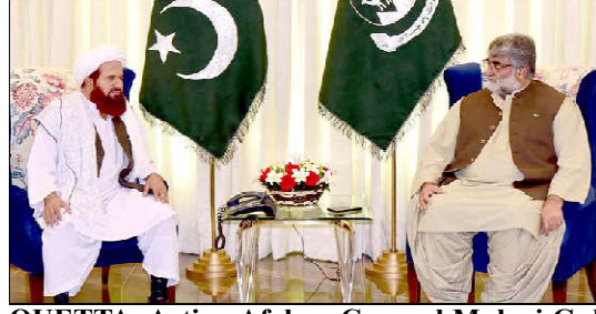
QUETTA: Acting Afghan Counsel Mulawi Gul Hassan calls on Balochistan Caretaker Chief Minister Mir Ali Mardan Khan Domki.

Senator Irfanul Haq Siddiqui contended that the recommendations presented by the Ministry is largely to the extend of law enforcing agencies however it is more an issue of dealing with primitive measures and mindset of the people. Public should be sensitised on tolerance and democratic norms he added.