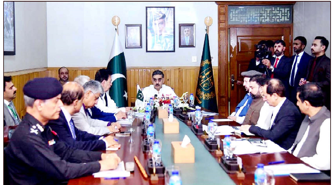
GILGIT: Caretaker Prime Minister Anwaar-ul-Haq Kakar chairs a progress review meeting in Gilgit about development in various sectors and situation of law & order in Gilgit-Baltistan