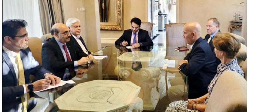
DALLAS TEXAS: Ambassador of Pakistan to the United States, Masood Khan meeting with Congressman Keith Self

He also assured that the caretaker provincial government would extend full cooperation to the Afghan Consul General for resolving all the issues as per the laws and policy of federal government.