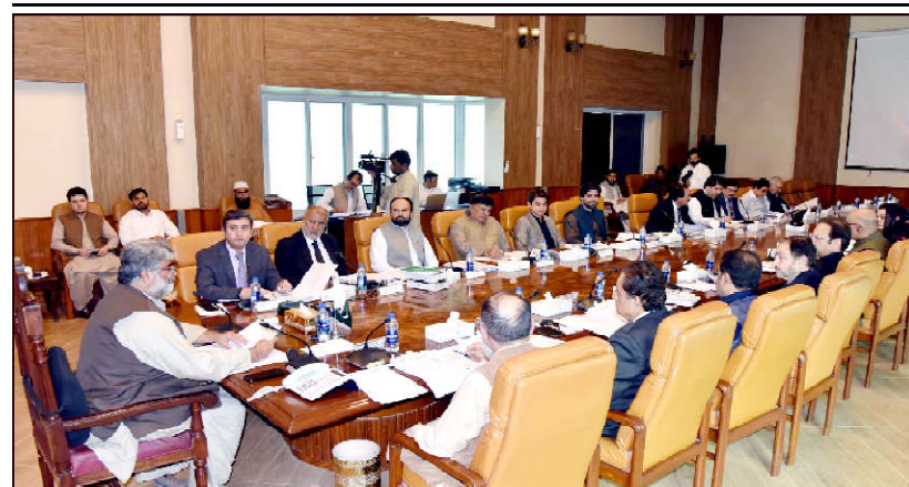
QUETTA: Caretaker Chief Minister Mir Ali Mardan Khan Domki presiding over introductory meeting of Provincial Cabinet