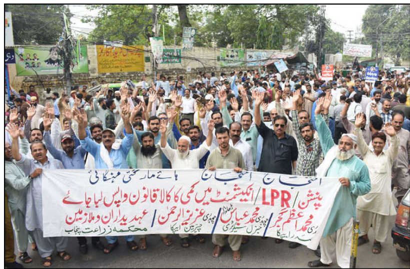
LAHORE: Members of All Pakistan Clerics Association holds protest outside press club against the unbearable inflation in Country.

by female prisoners and issued immediate instructions for their resolution. The Chief Justice toured the newly constructed ward within the jail premises, which functions as a hospital. He paid visits to ailing inmates and ensured their medical care. Additionally, he visited a factory within the jail where prisoners were involved in leatherwork, shoemaking, and stitching, imparting valuable vocational skills. Furthermore, the Chief Justice attended a handicraft and painting class within the jail premises. Addressing the officers of the jail, the judiciary