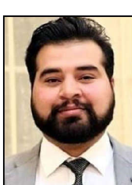
By Hamza Shahzad

When it comes to gender equality Pakistan's Gender Index is the lowest, it is 241 out of 142. We cannot avoid the fact the gender equality indicator of Pakistan is the lowest. Being part of an ultra-religious and male-dominated society, it is not favorable for women to grasp an executive level. Balochistan, a region known for its rich cultural heritage and wonderful landscapes, is also home to irrepressible and trailblazing women who have been gradually breaking barriers and making their mark in leadership roles. Despite facing several challenges, including cultural norms and socio-economic differences, women in Balochistan are resisting the odds and evolving as leaders in various sectors.