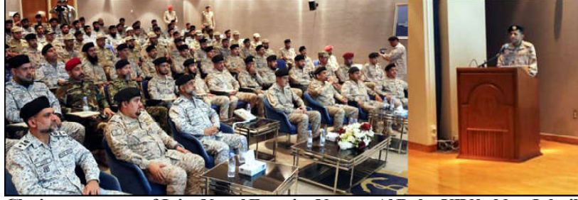
Closing ceremony of Joint Naval Exercise Naseem Al Bahr-XIV held at Jubail, Saudi Arabia

Secretary Health, officers of Balochistan Health Department, MSs of teaching hospitals, heads of various departments, chief executive of institutes, Young Doctor Association, Bolan Medical and Teaching Association, Pakistan Medical Association, Young Consultant Association participated in the meeting.