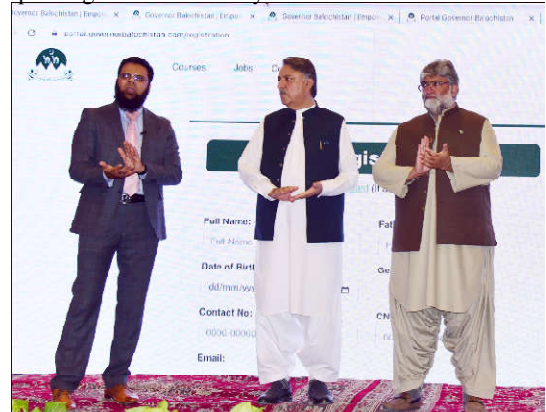
QUETTA: Balochistan Governor Malik Abdul Wali Khan Kakar and Caretaker Chief Minister Mir Ali Mardan Khan Domki inaugurating IT Initiative Program

Independent Report QUETTA: The Governor Balochistan, Malik Abdul Wali Khan Kakar announced to conduct free courses of the modern information technology for the unemployed youth of the province. The youth of Balochistan would be learnt skills by the IT professional team coming from Karachi. The Governor was speaking at the ceremony