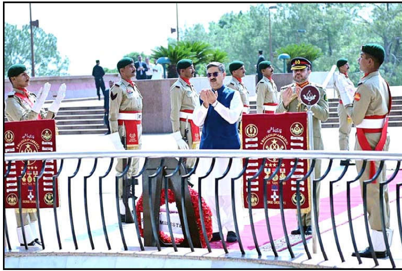
ISLAMABAD: DEFENCE & MARTYRS DAY: To pay homage and tribute to the Martyrs & Ghazis of the 1965 war, Caretaker Prime Minister Anwaar-ul-Haq Kakar laying floral wreath and offering Dua at Pakistan Monument.

Students of various schools also performed tableaux prepared in connection with the Defence Day.