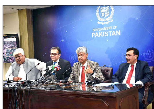
ISLAMABAD: Caretaker Federal Minister for Information and Broadcasting Murtaza Solangi and caretaker Federal Minister for Power Muhammad Ali addressing a press conference.

Moreover, the prompt implementation of the proposed federal projects of dams in Panjgur and Awaran should also be ensured, the caretaker Chief Minister directed further.