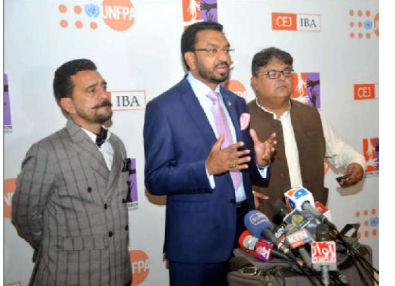
Caretaker Federal Minister for Human Rights Khail George talking to media persons during the opening ceremony of "2nd cycle of National Media Fellowship on gender based violation and child marriage" at IBA city campus Karachi.