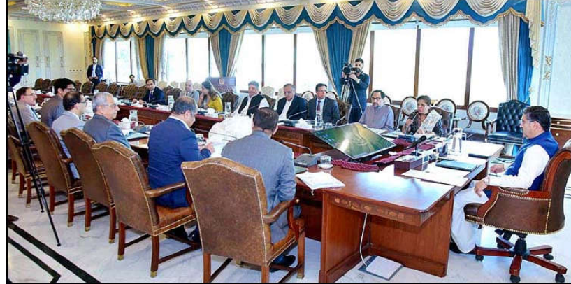
ISLAMABAD: Caretaker Prime Minister Anwaar-ul-Haq Kakar chairs a meeting on Federal Board of Revenue and Privatisation.