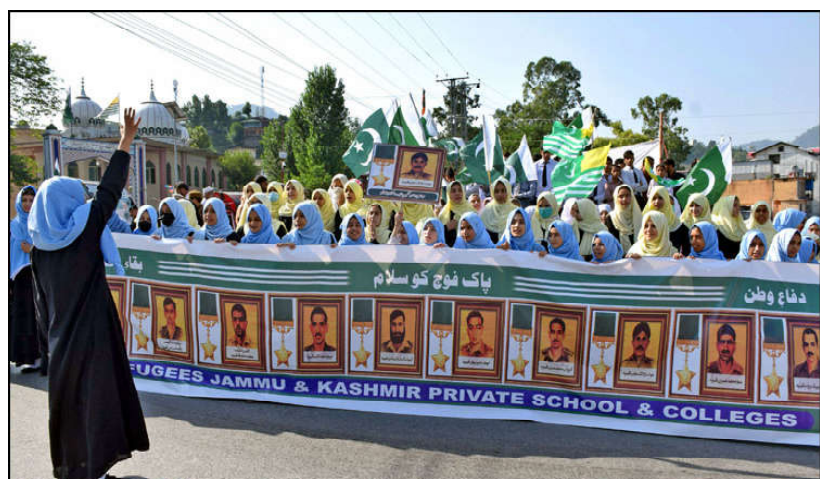
MUZAFFERABAD: Students of different schools and colleges shouting slogans in the favor of Pak Army and Pakistan during demonstrations to mark the "Defense Day" in the Capital of A.J.K.