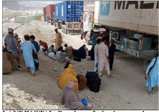
LANDIKOTAL: People are facing inconvenience after Torkham border closed due to an exchange of gunfire between Afghan and Pakistani forces, in Torkham Border.

Speaking on the occasion, Commissioner directed the concerned departments and high ups to take steps on war footing grounds to expedite the work on the roads projects and resolve the public issues.