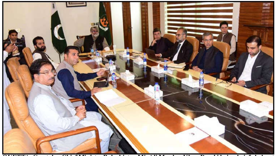
QUETTA: Caretaker Chief Minister Balochistan Mir Ali Mardan Khan Domki being briefed about affairs of Irrigation department

ing the course of meeting, the cooperation of provincial government for vocation training of the lawyers was also discussed. On this, the caretaker Chief Minister assure that the government would extend wholehearted cooperation for welfare and capacity building of the lawyers' community in the province.