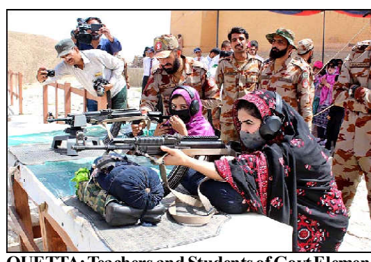
QUETTA: Teachers and Students of Govt Elementary College Jinnah Town Quetta experiencing gunshot at Shooting Range Quetta during their visit on the occasion of Defence Day.

Giving details about the steps to be taken to stop power theft, Muhammad Ali said there is dire need of introducing reforms in the energy sector. He said the government is reviewing the performance of the Board of Directors of power distribution companies and will bring change in their management.