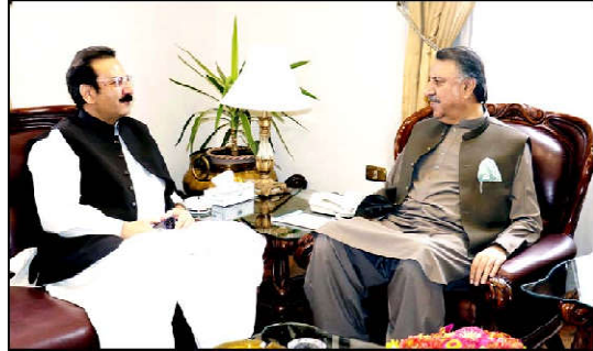
QUETTA: Caretaker Provincial Finance Minister Amjad Rasheed meeting with Governor Balochistan Malik Abdul Wali Khan Kakar

Interim Afghan Government was expected to fulfill its obligations and deny the use of Afghan soil by terrorists for perpetuating acts of terrorism against Pakistan, it added.