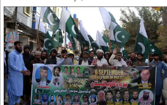
QUETTA: Members of Pak Civil Soldier Organization are holding celebration demonstration to pay homage to the Ghazis and Shuhada of 06 September 1965 Indo-Pak War on the occasion of Defence Day of Pakistan, at Quetta press club.

They said that it is difficult to find an example in the history of the courage and bravery shown by the Pakistani forces in the 1965 India-Pakistan war.