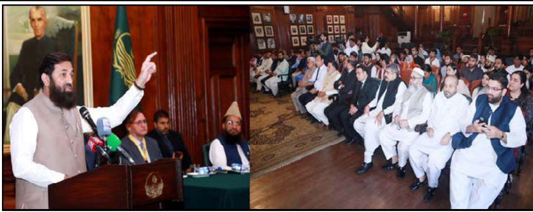
LAHORE: Governor Punjab Muhammad Balighur Rehman addressing ceremony organized in connection with Pakistan Defence Day at Governor House

annations every month to detect breast cancer at early stages and seek medical advice in case of any abnormalities. Highlighting that women make up almost 50 percent of the population, she emphasized the importance of broadcasting messages related to breast cancer and mental health through various media channels, including TV, radio, dramas and newspapers. The First Lady also advocated for individuals with disabilities, calling for their job quotas in both the public and private sectors. She applauded the progress made in spreading awareness about breast cancer over the past five years, resulting in a higher number of cases being diagnosed at stages 1 or 2, which are curable. She stressed the need for con-