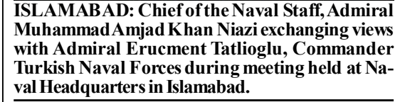
ISLAMABAD: Chief of the Naval Staff, Admiral Muhammad Amjad Khan Niazi exchanging views with Admiral Erumtut Tatlioglu, Commander Turkish Naval Forces during meeting held at Naval Headquarters in Islamabad.

The information minister assured the people of Balochistan that the government will do everything in its power to control the menace of sugar smuggling and ensure that the price of sugar remains affordable.