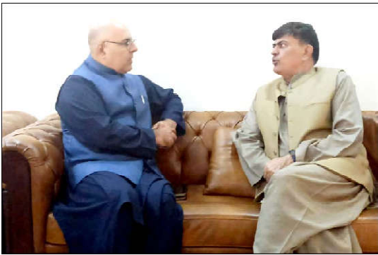
QUETTA: Caretaker Provincial Education Minister Qadir Bakhsh meeting with Caretaker Provincial Information Minister Jan Achakzai