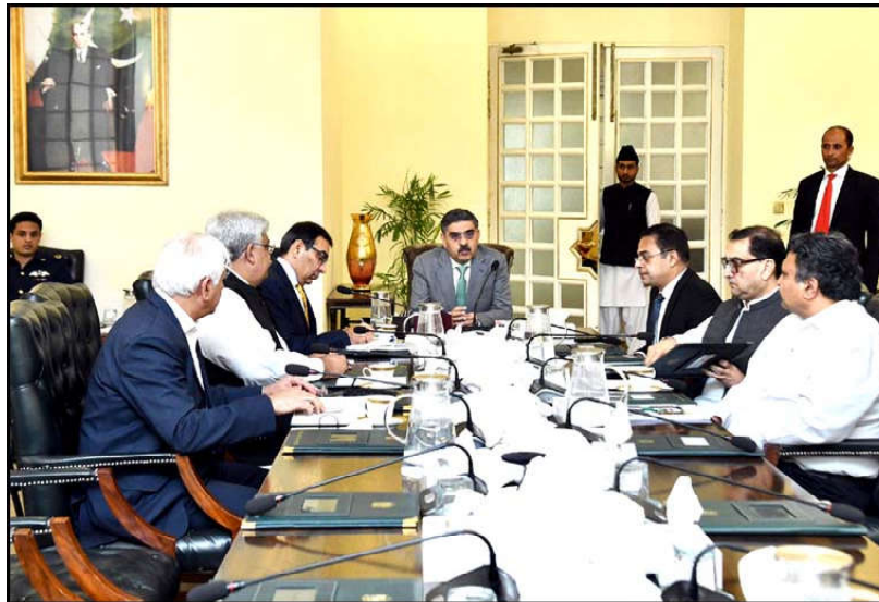
ISLAMABAD: Caretaker Prime Minister, Anwaar-ul-Haq Kakar chairs a meeting regarding power sector in Islamabad

In his condolence message, the minister prayed for the departed souls and the bereaved families.