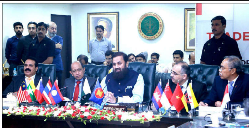
LAHORE: Governor Punjab Muhammad Balighur Rehman addressing the Trade and Tourism Conference on ASEAN at Lahore Chamber of Commerce and Industry.

The police officers said the Safe City cameras were providing full support in police operations and investigations. The plan is very important for guiding law-enforcement agencies. For that, the scope of the Safe Cities project would be extended to the whole of Punjab.