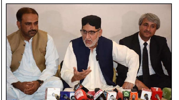
QUETTA: Balochistan National Party-Mengal (BNP-M) President Sardar Akhtar Mengal addressing a press conference.