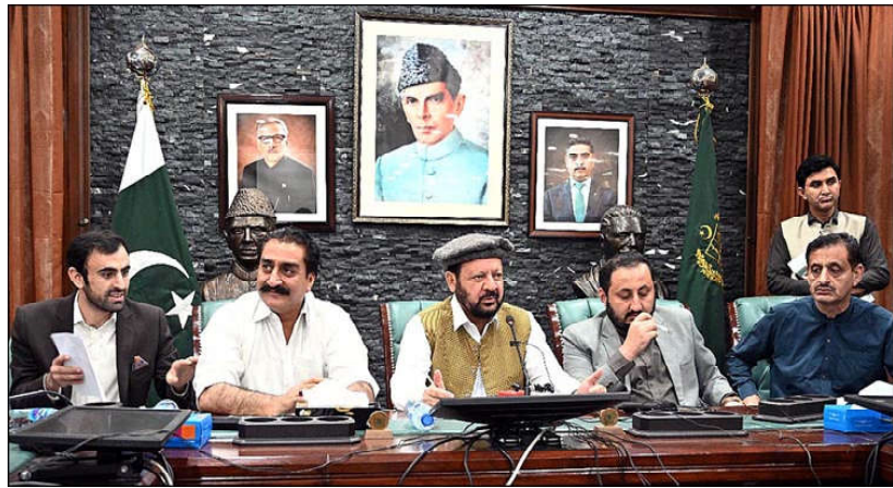
GILGIT: Chief Minister Gilgit-Baltistan Haji Gulbar Khan Addressing a press conference.

country have all the features, adding that investment and proper promotion can make Pakistan the centre of tourism. Punjab Governor emphasized that the expertise of ASEAN countries should be utilized for the development of Pakistan's tourism sector and with their support and guidance, better policies should be formulated to improve basic infrastructure and attract foreign tourists. He further said that new avenues of trade and economic cooperation can be explored within the ASEAN region. He said our presence here today reflects the importance we attach to fostering robust relationship and creating synergies that can pave the way for mutual growth and prosperity.