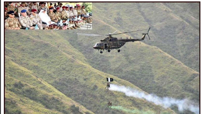
RAWALPINDI : The closing ceremony of Pakistan-KSA Joint Exercise in Counter Terrorism domain, AL BATTAR-I, was held at Cherat on Monday.

The two-week long exercise commenced on August 22 with the participation of Special Forces contingents from two brotherly countries, an Inter Services Public Relations (ISPR) news release said.