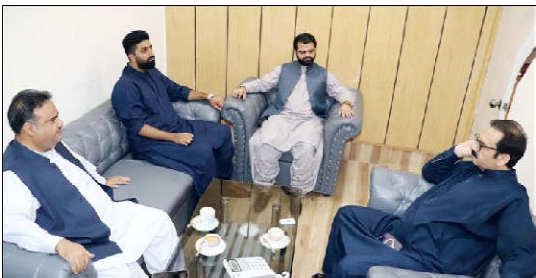
QUETTA: Senator Danesh Kumar meeting with Caretaker Finance Minister Amjad Rasheed and Advisor to Chief Minister Danish Langove

Independent Report QUETTA: The Quetta district administration launched crackdown against the adulterated milk at the dairy farms located in various parts of the city. A person using the same was arrested and Rs. 50 fine was also charged. Meanwhile, the administration and BFA team also visited different areas to check the plantation of different vegetables and crops through use of contaminated sewer water.