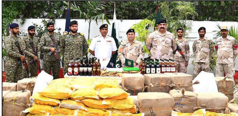
KARACHI: Pakistan Navy officials handing over the sized Narcotics to ANF officials.

Last month, Pakistan International Airlines (PIA) had passed an initial audit by the European Union Aviation Safety Agency (EASA), bringing the national flag carrier one step closer to resuming flights to the UK. The UK's Civil Aviation Authority (CAA).