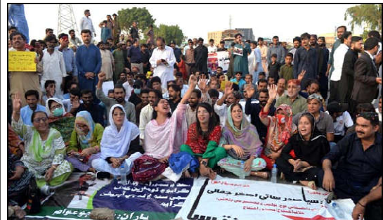
HYDERABAD: Civil society, different political and nationalist parties activists, advocates and people from different walks of life block bypass against kidnapping of Hindu businessmen and children in Kashmir.

The health minister emphasised the need for quality of medicines as per international standards in order to increase exports.