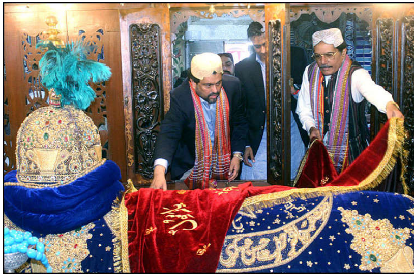
BHITSHAH: Sindh Governor Kamran Khan Tessori laying wreath on the grave of Hazrat Shah Abdul Latif Bhitai on the occasion of 280th urs celebrations.

He said that various problems related to the economy, particularly the energy crisis facing Sindh were discussed in the meeting. Tessori said that such a crisis could not be resolved by a single political party but could be tackled collectively. Governor further said that Sindh was badly affected in last year's flood catastrophe and people of Sindh were still facing its aftermath. He urged all political parties to shun their differences to resolve the problems of the masses and for this purpose he could also consult with political leaders including Muhammad Nawaz Sharif.