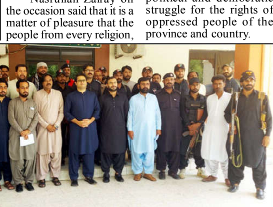
SIBI: Deputy Commissioner Mansoor Ahmed Qazi in a group photo with Staff Levies Officers and Revenue Department employees.

He also criticized the record inflation and law and order issues prevailing in the country. Nasrullah Zairay and other PkMAP leaders vowed to expedite political and democratic struggle for the rights of oppressed people of the province and country.