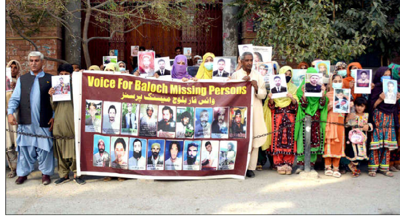
QUETTA: Relatives of Missing persons hold a protest in favor of their demands outside press club, in Provincial Capital.

Independent Report QUETTA: Record increase has been witnessed in the price of sugar in retail market of Quetta city on Sunday. According to the market sources, the sugar price crossed double century of rupees and was sold at Rs. 210 per kilogram in the open retail market and shops. The sharp increase of Rs. 20 rupees was recorded in price of sugar during last two days. The sugar, which was available at Rs. 190 on Friday last, was sold at Rs. 210 on Sunday. The data of price of sugar available shows that it is the highest ever price of per kilogram sugar recorded in Quetta in the history. While per kilogram sugar was available at Rs. 210 per kilogram in the main and other parts of the city, the same was being sold at Rs. 220 per kilogram in the outskirts of Quetta, the sources informed.