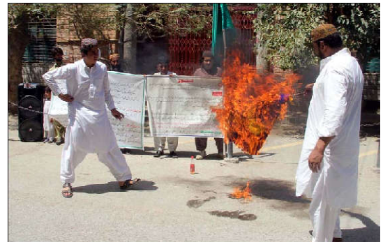
QUETTA: Members of Tanzeem Hidayat Noor League are holding protest demonstration against desecration of Holy Quran in Sweden and Denmark, at Quetta Press Club.

He said that electricity is cheaper in Bangladesh, India and Afghanistan than in Pakistan, and accused the caretaker Prime Minister of being a spokesperson of IMF.