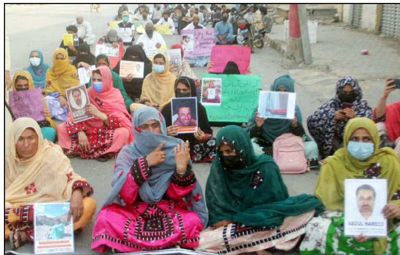
KARACHI: Relatives of Missing persons hold a protest in favor of their demands outside Sindh Assembly, in Provincial Capital.