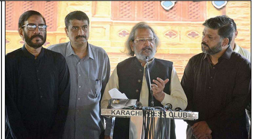
KARACHI: Caretaker Federal Minister for Education and Professional Training Madad Ali Sindhi talking to media persons at Karachi Press Club.

panies, if the decision is implemented, the domestic consumers will have a slab-wise burden. The tariff of 100 units per month will be increased from 13 point four to 18 point 36 rupees per unit without taxes and surcharges. The bill of a user using 100 units will be Rs 1836. The tariff for 200 units per month will be Rs 23.91 per unit and the bill will increase from Rs 3700 to Rs 4700 per month. The electricity bill of those using 300 units per month will increase from 6,000 to 8,000.