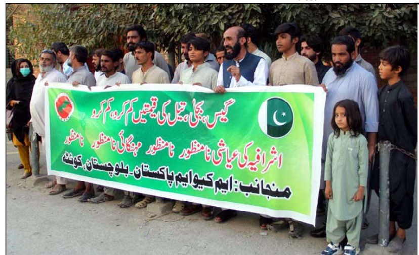
QUETTA: Activists of Muttahida Qaumi Movement (MQM-P) are holding protest demonstration against massive unemployment, increasing price of daily use products, inflation price hiking and the highly inflated electricity bills, at Quetta Press Club.

Ashrafi made it clear that the individuals allegedly involved in the Jaranwala incident were not representatives of any religion but rather of extremism and terrorism.