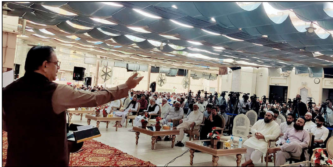
KARACHI: Caretaker Federal Minister for Religious Affairs and Interfaith Harmony Aneeq Ahmed addresses to teachers, students at Jamia Banoria Almia.

She maintained that US investment in Pakistan creates high-paying 21st century jobs, provides training and upskilling for workers and helps ensure compliance with international labor standards.