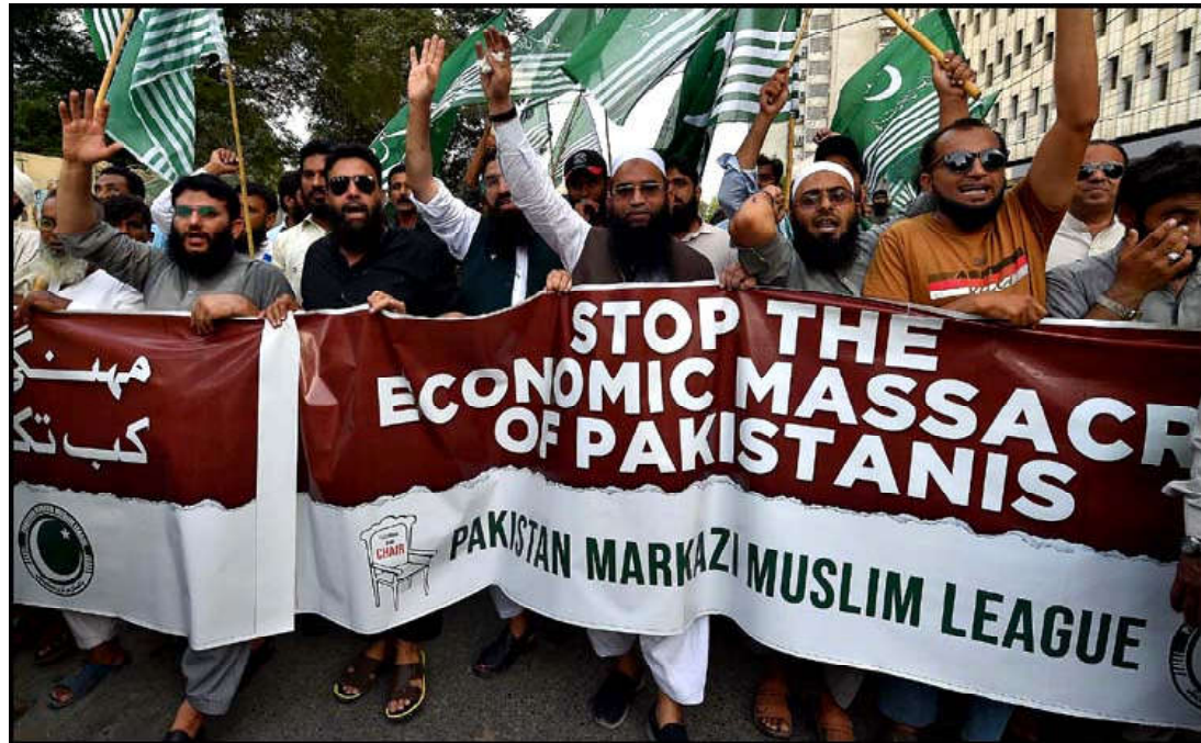
KARACHI: Activists of Pakistan Central Muslim League hold a protest in favor of their demands outside press club, in Provincial Capital.

Ph: 2841470/2841473 Vol: XVI No. 107, Safar 17, 1445 AH Monday September 04, 2023, Pages 08, Price Rs.15