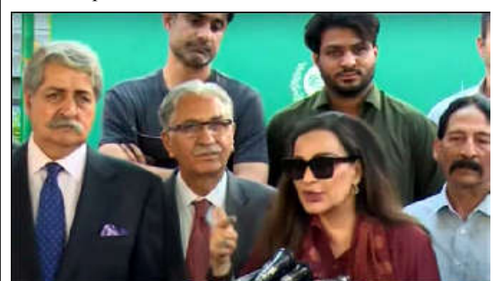
Pakistan Peoples Party (PPP) leaders speaking during a press conference in Islamabad

The top court was urged to declare the CCI decision regarding the delimitation and the census 2023 null and void.