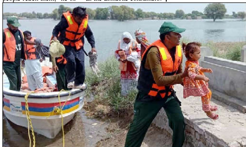
MULTAN: Rescue workers evacuate people from the villages as water from the Sutlej River continued to inundate settlements along its banks, near Multan.

The Secretary emphasized the paramount importance of restoring damaged school structures and providing essential amenities. He underscored the necessity of proactive measures to avert flood-induced harm, highlighting effective communication with the district administrations concerned. He stressed the need for an enhanced coordination mechanism with relevant authorities to bolster preparedness.