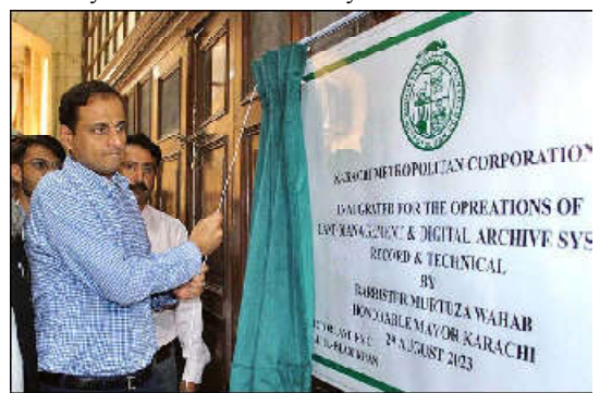
KARACHI: Mayor Karachi Barrister Murtaza Wahab inaugurates the operations of Land Management & Digital Archive System computerized land record at KMC Head Office.

Caretaker Chief Minister Muhammad Azam Khan also attended the oath-taking ceremony.