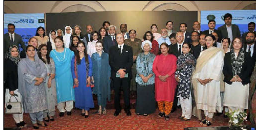
ISLAMABAD: Honourable Justice Supreme Court of Pakistan, Syed Mansoor Ali Shah in a group photograph with other participants during National Conference of Service Providers Gender Based Violence: From Legislation to Implementation.

Islamabad Capital Police is taking all possible measures to safeguard the lives and property of the citizens. Citizens were also requested to cooperate with the police and report any suspicious activity to their respective police station or dial "Pucar-15" helpline.