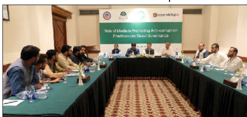
QUETTA: A view of 3-day training workshop regarding Role of Media in Promoting Anti-corruption Practices and Good Governance.

He reiterated that he would never allow traffickers to create problems for the public, strict measures would be taken to prevent smuggling for interest of public.