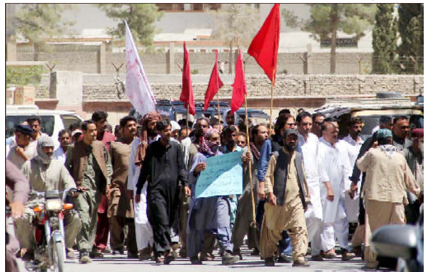
QUETTA: Members of Metropolitan Corporation Tanzeem Ittehad holding protest rally against non-payment of their salaries

by the ECP. The case alleged that Imran had "deliberately concealed" details of the gifts he retained from the Toshakhana — a repository where presents handed to government officials from foreign officials are kept — during his time as the prime minister and proceeds from their reported sales. According to Toshakhana rules, gifts/presents and other such materials received by persons to whom these rules apply shall be reported to the Cabinet Division. Imran has faced a number of legal issues over his retention of gifts. The issue also led to his disqualification by the ECP. On the other hand, on Aug 26, a team of the Federal Investigation Agency (FIA) investigated the PTI chief in Attock Jail in the US cipher case. The former prime minister was questioned about the alleged disappearance of the cipher. The FIA cybercrime team headed by Deputy Director Ayaz investigated the former prime minister. The suspect was questioned for more than an hour regarding the illegal use and disappearance of the cipher.