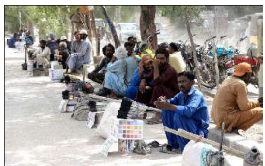
HYDERABAD: Labourers along with their tools waiting for daily work while sitting along road at Latifabad.

He said that 90 percent of loans taken by the country have been spent on non-productive activities due to which the Pakistanis now facing huge foreign debt of USD 140 billion.