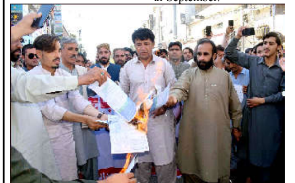
QUETTA: Members of Central Anjuman-e-Tajran Balochistan holding protest demonstration against inflated electricity bills, at Mannan Chowk

JAFFARABAD (INP): Three people were killed and two others injured which armed men opened firing on vehicle at the National Highway on Tuesday. Police said that gunmen sprayed bullets at Quetta bound vehicle coming from Karachi. As a result of firing three people of Marri tribe, hailing from Rohjan Jamali were killed while two sustained bullet wounds.