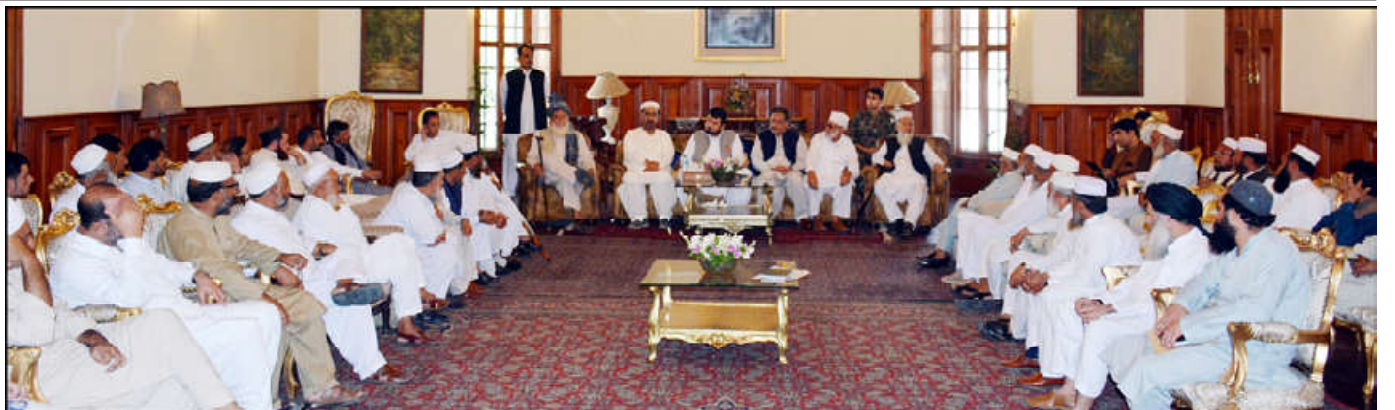
PESHAWAR: 45-members Qaumi Jirga consisting of tribal elders from Dir Bala meeting with Governor Khyber Pakhtunkhwa Haji Ghulam Ali.

In a separate meeting, a delegation led by former provincial assembly member Israr-ul-Haq met with the Governor. The delegation discussed local issues, reaffirming the Governor's commitment to collaborate and assist in finding solutions.