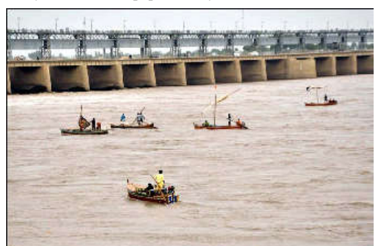
HYDERABAD: Fishermen are hunting into Indus river as the water level increases due to low flood that may cause any life risk for them, near Jamshoro.

He further added, "I strongly believe in the significance of building and strengthening local capacities in disaster preparedness and response. Additionally, he said we need to establish efficient mechanisms to streamline humanitarian efforts and prevent duplication of work during emergencies."