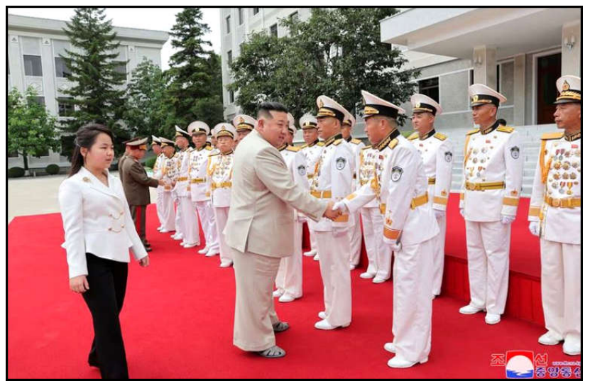
North Korean leader Kim Jong Un visits the Naval Command of the Korean People's Army (KPA) on the occasion of the Navy Day, in North Korea, in this picture released by North Korea's Korean Central News Agency (KCNA).

Monitoring Desk GENEVA: More than 1,300 schools have been totally destroyed in government-held areas of Ukraine since Russia's 2022 invasion and others have been badly damaged, the U.N. children's fund UNICEF said on Tuesday. Persistent attacks mean that only about a third of school-age children there are attending classes fully in person and many are forgetting what they have already learned, it said.