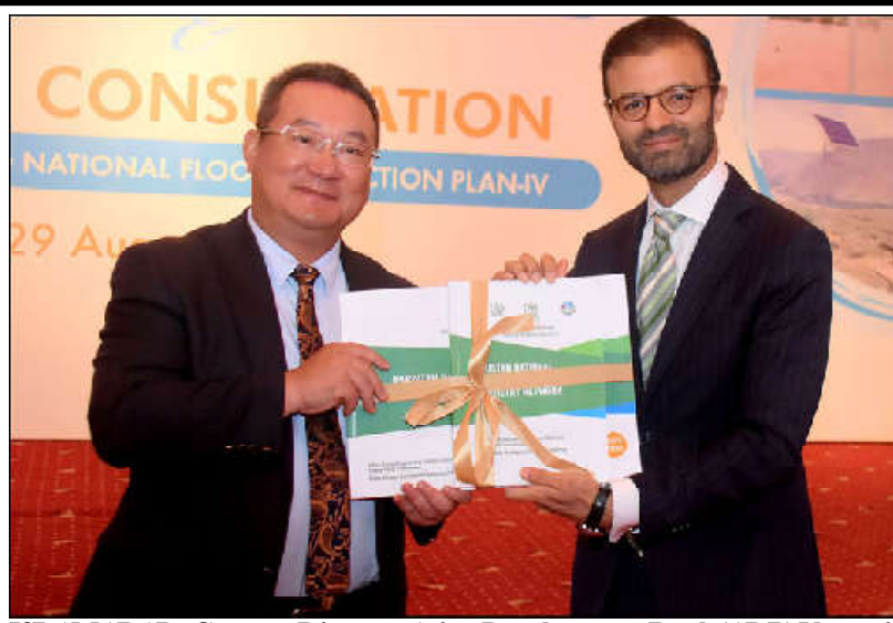
ISLAMABAD: Country Director Asian Development Bank (ADB) Yevgeniy Zhukov presenting a souvenir to Caretaker Federal Minister for Water Resources, Ahmad Irfan Aslam during the launching ceremony of the National Master plan on flood telemetry at local hotel.

He felicitated all stakeholders on the success of the intervention.