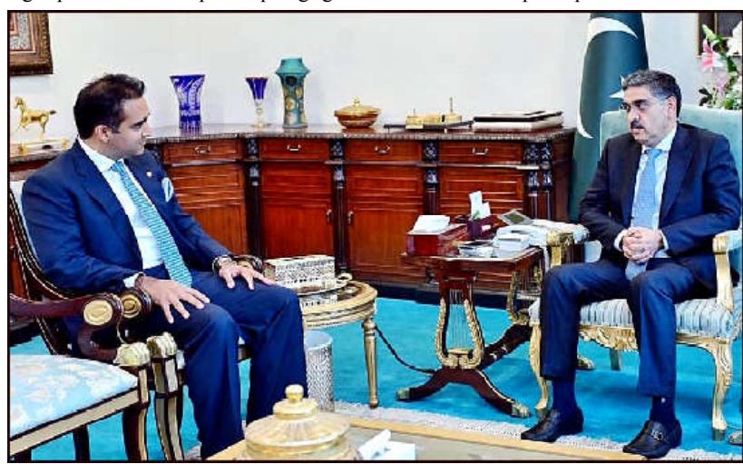
ISLAMABAD: Lord Amir Sarfraz called on Caretaker Prime Minister Anwar-ul-Haq Kakar

Pakistan is an active player in the field of UN peacekeeping, both at the policy and operational levels. Pakistan is among the largest troop contributors and, since 1960, has contributed over 230,000 men and women peacekeepers to 46 UN peacekeeping missions in almost all continents of the world, the spokesperson said.