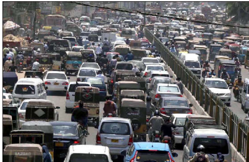
KARACHI: Large numbers of vehicles stuck in traffic jam due to negligence of traffic police staffs and illegal parking, at New M.A Jinnah road in Karachi.

The petitioner has taken the plea that false and unrealistic incident of desecration of the Holy Quran took place on August 16. One person made announcement in the mosque which ignited provocation among others. 25 churches and over 200 homes were set ablaze in Jaranwala. The homes of Christians were looted and later were destroyed. The mob desecrated divine books. JIT has been constituted in regard to this incident but this process can take too much time. Several affectedes still stand deprived of basic facilities despite lapse of two weeks.