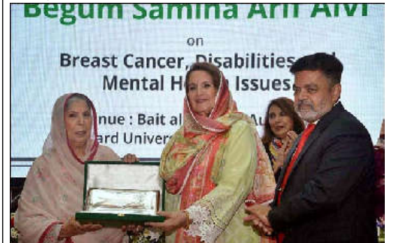
KARACHI: Begum Samina Arif Alvi is being presented with memento during the interactive dialogue Session on Breast Cancer Awareness, Mental Health and Inclusion of Differently Aabled Persons organized by World Health Organization, at Hamdard University.

Governor Punjab Muhammad Balighur Rehman further said Uch Sharif is home to one of the ancient cultures in the country, and it must be preserved. He said Uch Sharif is full of prospects of religious tourism for its affinity with Alexander the