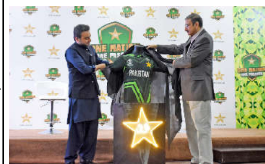
LAHORE: Chairman Pakistan Cricket Board Zaka Ashraf unveiling the new kit of Pakistan Cricket Team for Asia Cup, during media talk at Gaddafi Stadium in Provincial Capital

Zaka Ashraf, Chairman of the PCB Management