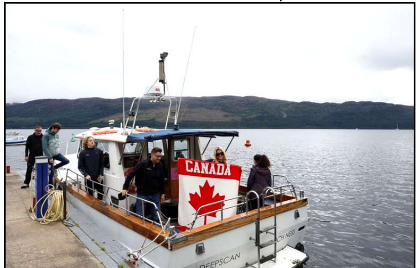
Volunteers get ready to take off in the Loch Ness Project Research Vessel, Deep Scan, as they take part in the largest Loch Ness Monster hunt for 50 years in Scotland, Britain.