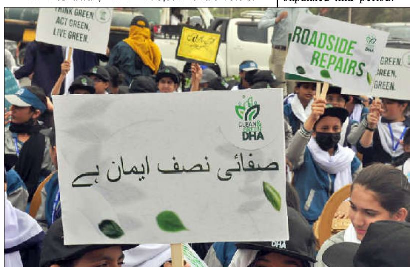
KARACHI: Students of different school and college holding banners are participating in the "Clean and Green Walk" in Provincial Capital.