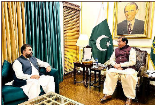
ISLAMABAD: Caretaker Federal Minister for Interior Sarfraz Ahmad Bugti in a meeting with the Speaker National Assembly Raja Pervez Ashraf

Hundreds of citizens surrounded the grid station at Bakra Mandi and burnt electricity bills. They chanted slogans against the government.