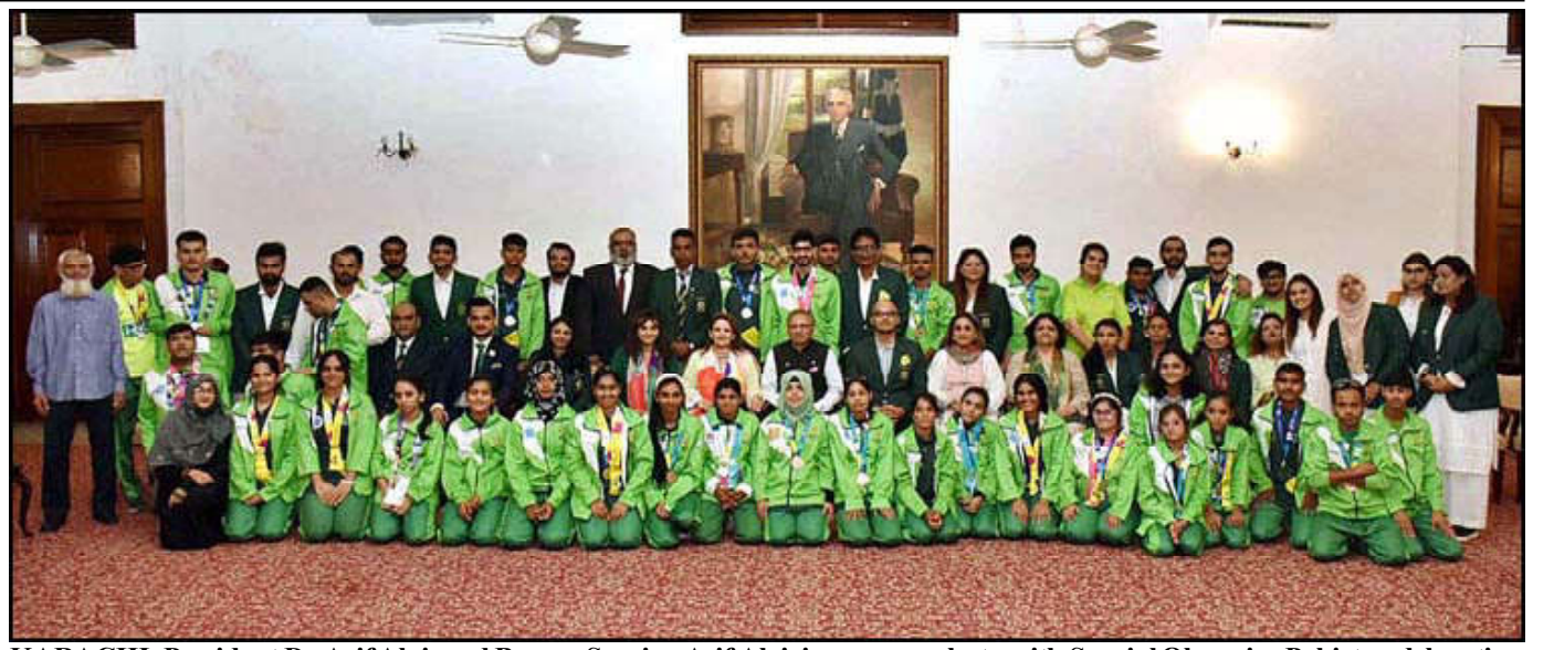
KARACHI: President Dr. Arif Alvi, and Begum Samina Arif Alvi, in a group photo with Special Olympics Pakistan delegation World Summer Games Berlin 2023 at Governor House.

Total 176 countries had participated in the World Summer Games Berlin 2023. Pakistani special athletes participated in 11 sports events and won 83 medals, including 11 gold, 32 silver and 40 bronze.