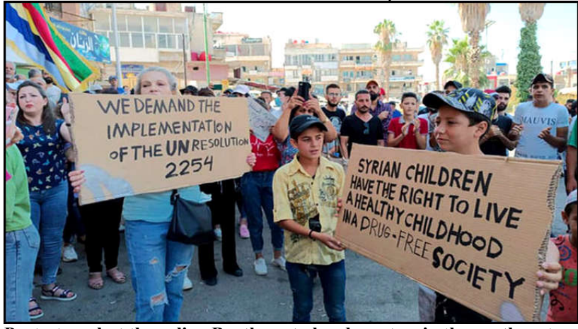
Protesters shut the ruling Baath party headquarters in the southwestern Syrian Druze city.

He added that the deadline would not be extended and that while relations between the two countries are "entirely friendly and warm."