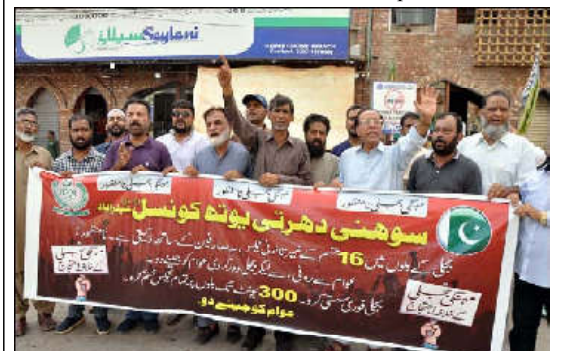
HYDERABAD: Members of Sohni Dharti Youth Council are holding protest demanding a reduction in electricity and fuel prices, at HyderChowk in Hyderabad.

Christian communities, he said and added that religious scholars and civil society played their role in controlling the situation. He confirmed that the three main accused of the tragedy had been arrested and those responsible for the conspiracy would be brought to justice at any cost. He said that showing the true spirit of the religion, Muslims presented their mosque to the Christian community for worship.