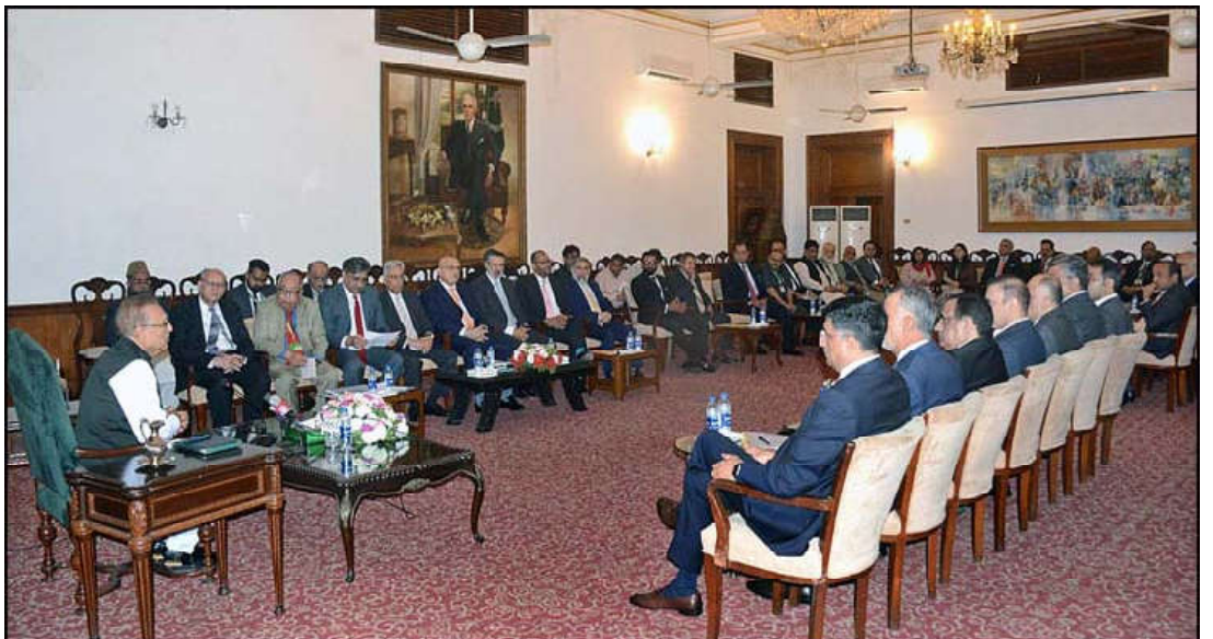
KARACHI: President Dr. Arif Alvi chairing a meeting with representatives of banking industry to review progress on initiatives for financial inclusion, gender equality and issues of banking sector at Sindh Governor House.

opening could be made easy further. President Alvi also proposed the bank officials to explore part-time job avenues in their institutions for the household women. Referring to the fast-paced growth of digital technologies across the world, he said the banking industry in Pakistan had to keep pace with the evolving trends with the maximum use of information technology as "the IT driven financial inclusion at the grassroots level not only encourages taxable economy.