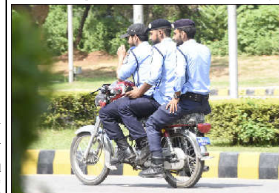
ISLAMABAD: A view of the police personnel riding three colleagues on one bike without wearing helmet at Constitution, which is the open sign of the darkness under the lamp.