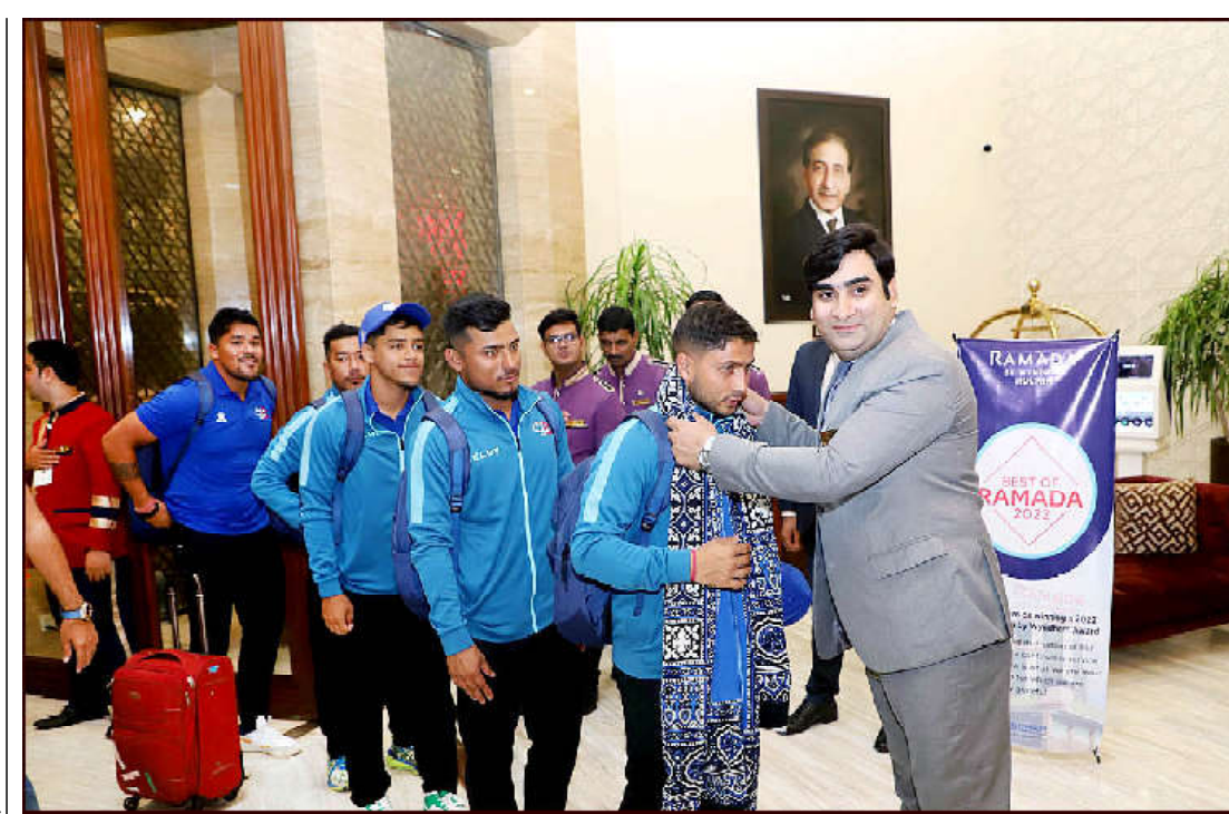
MULTAN: Nepal cricket team arrived for the upcoming First match of Asia Cup 2023 between Pakistan and Nepal teams at Multan Cricket Stadium.

Three injured were taken to a nearby hospital for necessary treatment. A police team rushed to the site and cordoned off the area to arrest the perpetrators behind this gruesome killing. No success has been made so far till the filing of this report. Investigations are underway.