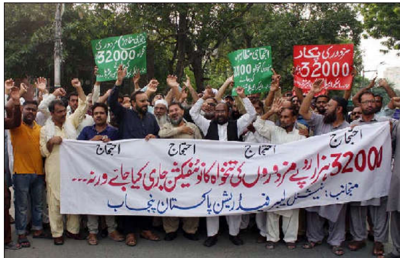
LAHORE: Members of National Labor Federation Pakistan Punjab are holding protest demonstration for rise of basic salary, at Lahore press club.

running until 1 st January 2024, the season's highlights feature the 52 nd Watch & Jewellery Middle East Show, the Gulf Coatings Show, the National Career Exhibition, and the International Education Show. Also on the agenda is the much-awaited Sharjah International Book Fair, an annual celebration of the literary arts. The enriched event calendar underscores Sharjah's continued commitment to fostering business, culture, and education on an international scale. Additionally, the Expo Centre has an action-packed schedule for the upcoming period, featuring five premier events and exhibitions making their debut in the Emirate of Sharjah. The standout events include the "Emirates Perfumes and Oud" exhibition, scheduled from 6 th October to 14 th , 2023; the agenda also features the trade fair, which will be held on 21 st and 22 nd November 2023.