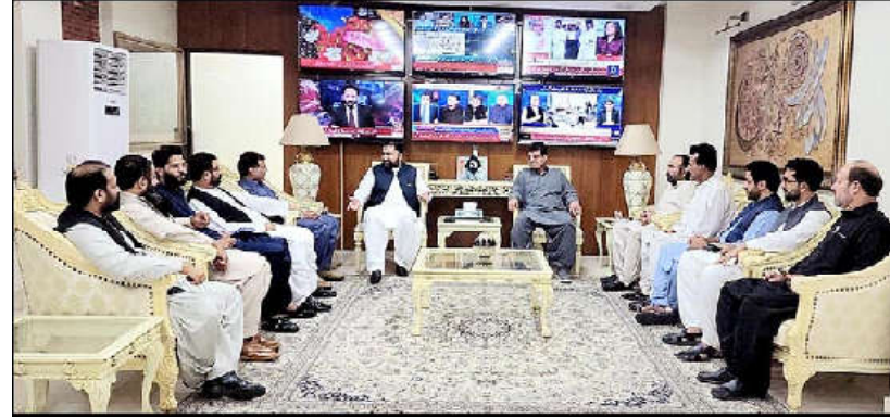
ISLAMABAD: Caretaker Federal Minister for Interior, Sarfraz Ahmad Bugti in a meeting with the dignitaries from Balochistan.

Addressing another crucial aspect, he recommended exploring alternative locations for the Pakistan Houses in Makkah and Medina adding that the structure had been dismantled to pave the way for the expansion of Haram Sharif particularly in Medina. Minister Aneeq emphasized that the Ministry of Religious Affairs and Interfaith Harmony was actively working on a range of plans aimed at reducing the cost of the Hajj pilgrimage.