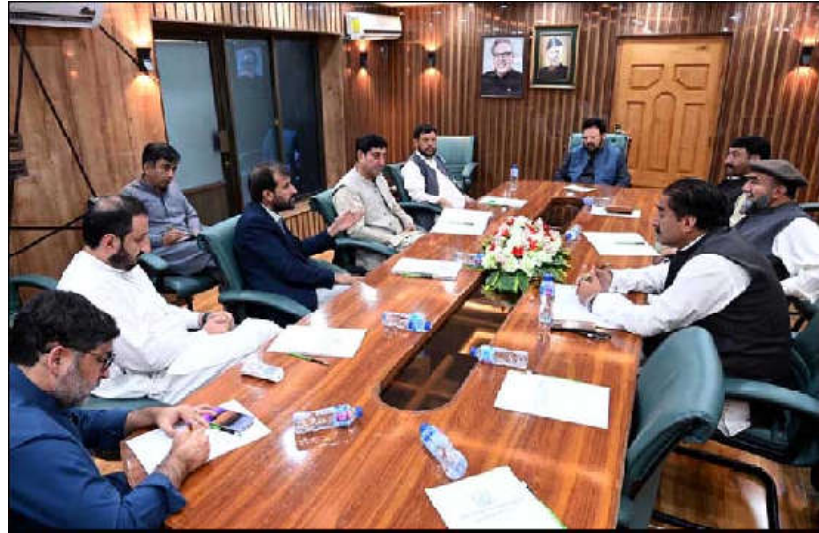
GILGIT: Chief Minister Gilgit-Baltistan Haji Gulbar Khan chairing a high level meeting of Parliamentary Peace Committee on current law and order situation in Gilgit-Baltistan at CM Secretariat.

balanced and healthy lifestyle, women must adopt the habit of a five-minute self-examination every month to detect the disease at early stages and seek medical help if they notice any lump or unusual change in their bodies, she added. She said she had been raising awareness about breast cancer since 2018 and due to the efforts of her team and support from the media, more women with breast cancer were being diagnosed at early stages. As regards mental health and well-being, Begum Alvi said the topic of mental health and stress was often neglected in Pakistan due to its social stigma. "The people neglect their mental health and do not seek professional advice," she added.