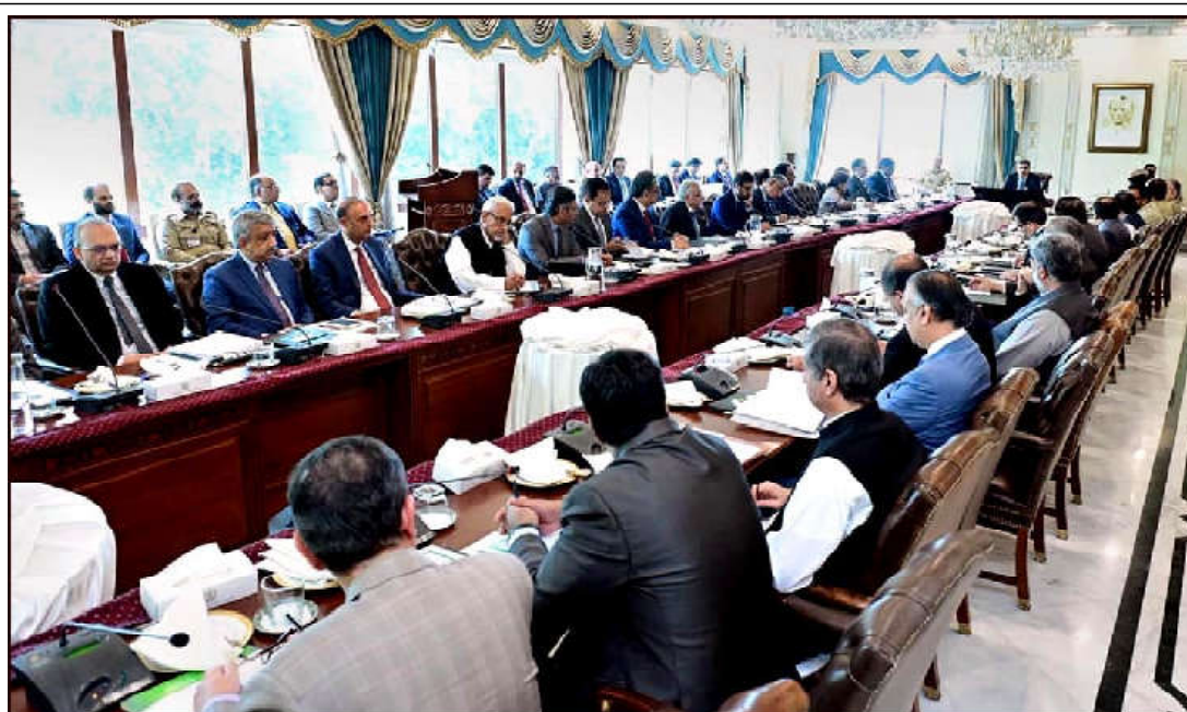
ISLAMABAD: Caretaker Prime Minister Anwaar-ul-Haq Kakar chaired the 4th apex committee meeting of the Special Investment Facilitation Council (SIFC).

The Army Chief reaffirmed Pakistan Army's all-out support to the caretaker government for continuity of policies in a bid to revive country's economy and steer Pakistan towards progress and prosperity.