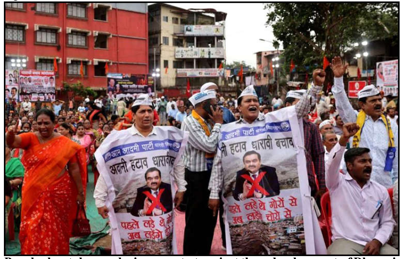
People shout slogans during a protest against the redevelopment of Dharavi, one of Asia's largest slums, in Mumbai, India.