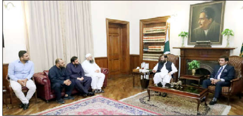
LAHORE: A delegation of All Pakistan Crockery Importers Association met Governor Punjab Muhammad Balighur Rehman at Governor House Lahore.