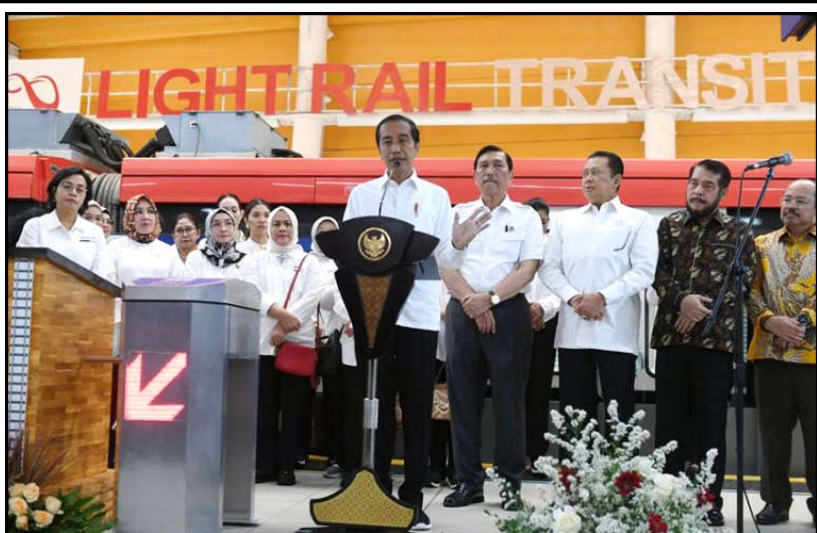
Indonesian President Joko Widodo speaks as he launches the Light Rail Transit (LRT) in Jakarta, Indonesia.

The visits take place under an agreement made by Xi and President Joe Biden during a meeting last November in Indonesia.