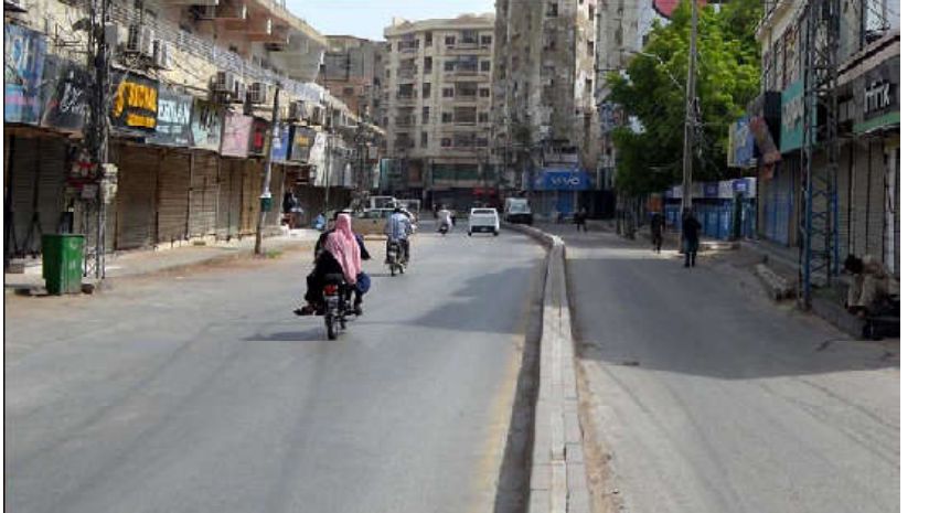
HYDERABAD: Markets are seen closed due to strike call by traders against rise in electricity bills, at Channi market.