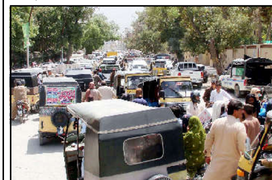
QUETTA: A large numbers of vehicles stuck in traffic jam