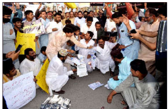
MULIAN: Traders are holding protest demonstration against massive unemployment, increasing price of daily use products, inflation price hiking and the highly inflated electricity bills

The caretaker Chief Minister hoped that Arshad Nadeem would continue to perform in the same manner and get more achievements at the international level brightening the name of country.