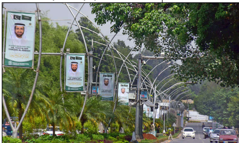
ISLAMABAD: A view of the welcoming banners on poles at Constitution Avenue about the visits of Minister of Hajj and Umrah of Kingdom of Saudi Arabia Tawafiq Bin Fawazan Al-Rabiah, in Federal Capital.

ISLAMABAD (APP): Indian police have arrested at least ten innocent Kashmiri youth in Baramulla district of Indian illegally occupied Jammu and Kashmir (IIOJK). According to Kashmir Media Service, the Indian police along with army and paramilitary personnel arrested the youth from in Churunda, Powarian Thalaj and Sopore areas of the district. The police dubbed the arrested youth as members of mujahid organizations to justify their illegal detention.