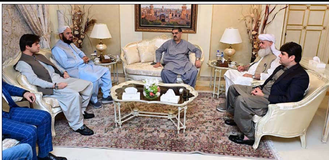
ISLAMABAD: Nawabzada Jamal Raisani calls on Caretaker Prime Minister Anwaar-ul-Haq Kakar. Prominent politicians from Balochistan were also present in the meeting.

He also directed to open mosques and restrooms for passengers after completion of construction work.