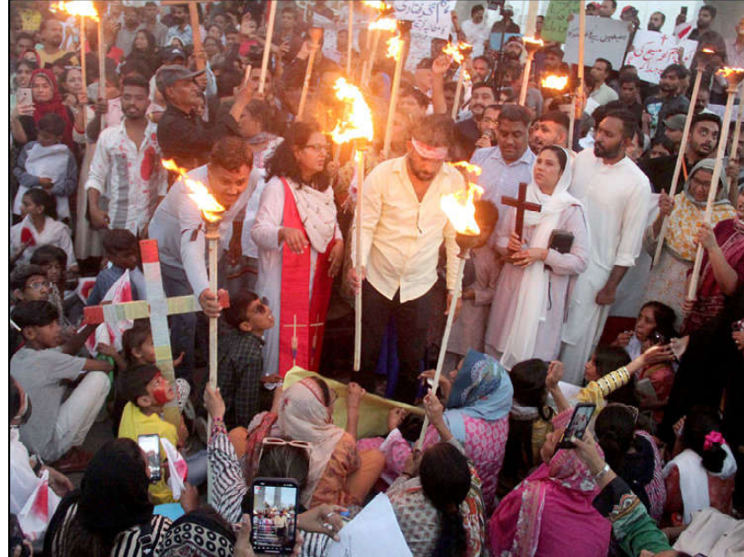
KARACHI: Christians hold a torchlight rally to condemn the attacks on churches in Pakistan at Teen Talwar area of the Provincial Capital.

The data analysis showed that 619 drivers, 49 underage drivers, 162 pedestrians, and 427 passengers were among the victims of road traffic crashes. The statistics show that 297 accidents were reported in Lahore, which affected 308 persons, placing the provincial capital at top of the list, followed by 81 in Multan with 82 victims, and at third Faisalabad with 56 accidents and 56 victims.