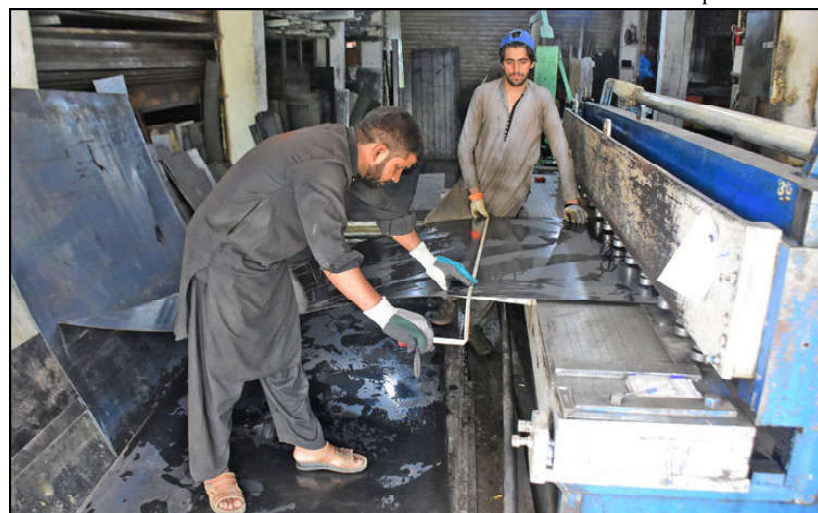
ISLAMABAD: An ironsmiths are busy in their work at Steel products factory in Federal Capital.

their income. According to the Pakistan Economic Survey (PES), direct taxes contributed 37.2% of total FBR tax collection, while indirect tax contribution was 62.8% during FY2022. Within total FBR collection, sales tax remained the top revenue-generating source with a 41.2% share, customs duty 16.4%, and FED 5.2%, respectively. "A substantial portion of the population is engaged in the informal economy, where incomes are irregular and often insufficient. Indirect taxes, being consumption-based, affect these individuals more because their entire income is spent on basic necessities. As a result, they may not have the financial buffer to absorb the impact of increased prices.