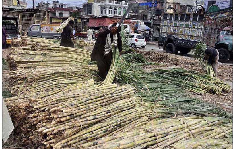
RAWALPINDI: Workers off-loading bundles of sugarcane from a delivery truck at Fruit Market.

A Cambodian exhibitor told Gwadar Pro that she added a lot of WeChat contacts at the expo. "WeChat makes sales easy."