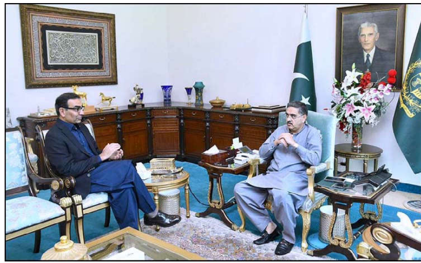
ISLAMABAD: Minister for Energy, Power and Petroleum Muhammad Ali calls on Caretaker Prime Minister Anwaar-ul-Haq Kakar.

Wazir pinpointed that at present, China has obtained a complete drone industry chain, including a full range of products from consumer drones to industrial drones, and a complete cooperation plan integrating research and development, design,