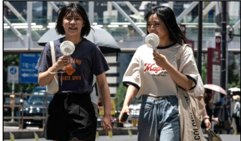
Young women using portable fans to seek relief from the heat while walking outside Shinjuku station, as temperatures of 35C-plus (95F) have scorched the Japanese capital Tokyo for weeks.

Monitoring Desk SEOUL: North Korea's military said it had scrambled warplanes after a U.S. reconnaissance aircraft intruded into its economic zone off its east coast, state news agency KCNA reported on Friday. The incident, which occurred on Thursday, was "a dangerous military provocation" and North Korea was considering measures to deter future incursions, an unnamed spokesperson of the General Staff of the Korean People's Army said in the report.