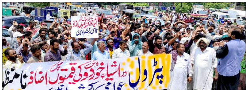
LAHORE: Members of Awami Rickshaw Union are holding protest demonstration against the price hike of petroleum products, at Lahore press club.

President KCCI Mohammed Tariq Yousuf, while underscoring the need to explore new avenues between the two countries for trade and investment growth suggested expanding trade and investment ties and setting up a proper banking channel.