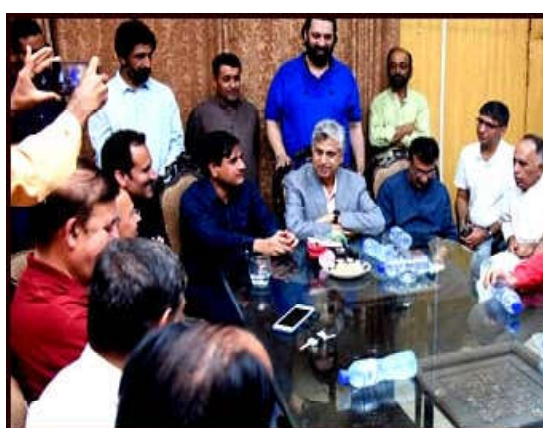
ISLAMABAD: Caretaker Minister for Information and Broadcasting Murtaza Solangi visited multiple media houses and the National Press Club (NPC) to discuss matters of mutual interest with the journalist community.

As per new census 20805 census blocks increased. Some were changed. Delimitation and voters lists free from errors is need of election.