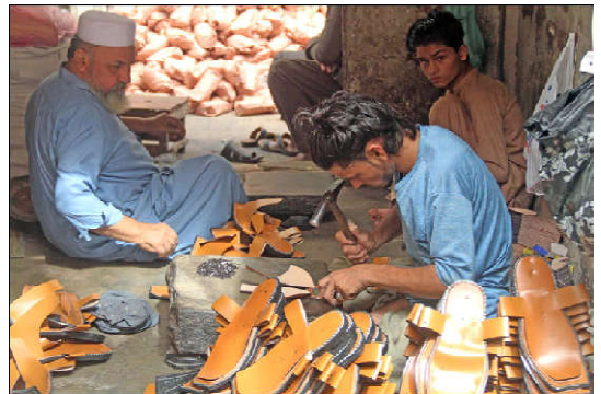
KARACHI: Cobblers are busy in making "Peshawari Chappal" at their working area in Lee-Market of Provincial Capital.

Over the same period, China's foreign contracted project earnings saw a 6.3% boost to reach RMB563.76 billion. The value of newly signed contracts tallied up to RMB746.36 billion, marking a slight 0.6% uptick year-on-year. Chinese enterprises operating within Belt and Road countries contributed substantially, driving completed turnover from contracted projects to the tune of RMB312 billion. Newly inked contracts within the same countries reached RMB 367.23 billion constituting 55.3% and 49.2% of the total, respectively, for that period.