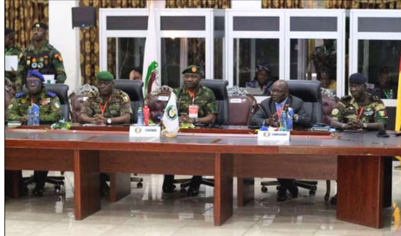
ECOWAS Committee of Chiefs of Defense staff brief the press on plans to deploy its standby force to the Republic of Niger, in Accra, Ghana.

Monitoring Desk BANGKOK: Thailand's self-exiled former Prime Minister Thaksin Shinawatra plans to return to the country on Tuesday, his daughter said, as the country is struggling to overcome a political deadlock after a May national election. The former telecommunications tycoon, premier from 2001 until he was ousted in a 2006 coup, lives in self-imposed exile after fleeing Thailand to avoid a jail sentence for graft in 2008. He would still be subject to jail upon a return. In a social media post on Saturday, Thaksin's youngest daughter, Paetongtarn Shinawatra,