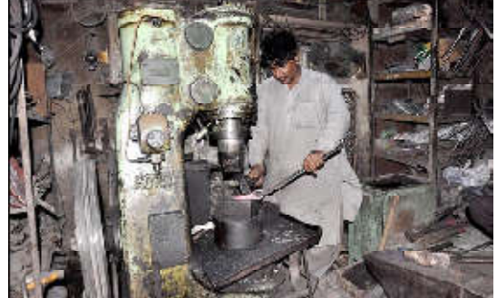
RAWALPINDI: A blacksmith preparing iron tools at his workplace.

launched the program in a ceremony that was attended by the senior officials of SBP, PRI, BE&OE and representatives of the large remittance mobilizing banks, said a statement issued here. The Pre-Departure Briefing Program, developed by Pakistan Remittance Initiative (PRI) in collaboration with Bureau of Emigration and Overseas Employment (BE&OE) and banks, is considered the key initiative for domestic outreach for educating outgoing workers to use formal channels for sending home remittances. As the outgoing workers are required to register with PE Offices across Pakistan; therefore, the program presents an excellent opportunity, on ongoing basis, to educate outgoing workers for using formal channels for sending remittances back home and opening their own and their beneficiary's bank accounts, it claimed.