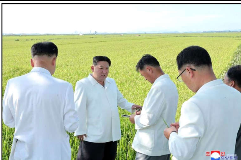
North Korean leader Kim Jong Un tours typhoon-affected farms in Anbyon County, North Korea