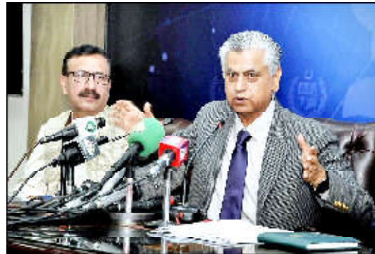
ISLAMABAD: Federal Caretaker Minister for Information and Broadcasting, Murtaza Solangi addresses press conference at PID media centre.