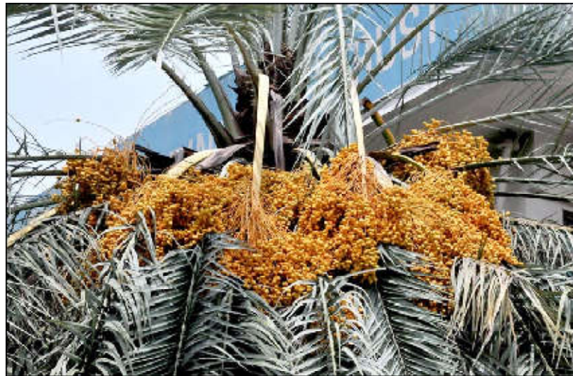
ISLAMABAD: A plant full of Dates at melody area in the federal capital.

ISLAMABAD (APP): Pakistani rupee on Friday witnessed an 86-paisa devaluation against the US dollar in the interbank trading and closed at Rs 295.77 against the previous day's closing of Rs 294.91. However, according to the Forex Association of Pakistan (FAP), the buying and selling rates of the dollar in the open market stood at Rs 301.5 and Rs 303.8 respectively. The price of the Euro increased by 85 paisa to close at Rs 321.60 against the last day's closing of Rs 320.75, according to the State Bank of Pakistan (SBP). The Japanese Yen went up by 02 paisa and closed at Rs 2.03.