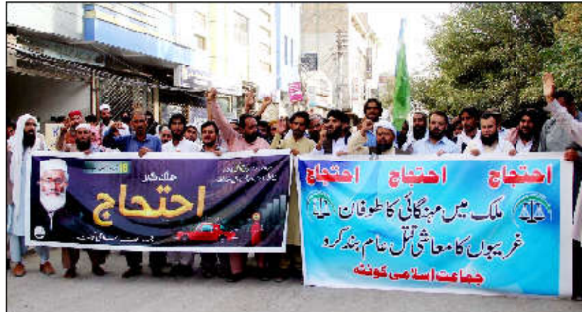
QUETTA: Activists of Jamaat-e-Islami (JI) holding protest demonstration against the price hike of petroleum products in front of Quetta press club