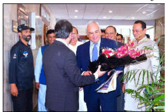
ISLAMABAD: Secretary/ Chairman Railways is welcoming the Caretaker Federal Minister for Railways, Captain (R) Shahid Ashraf Tarar at Ministry of Railways.