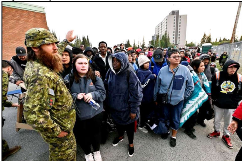
People line up outside of a local school to register to be evacuated, as wildfires threatened the Northwest Territories town of Yellowknife, Canada.

The military junta, which seized power in a coup last month, said it would prosecute Bazoum for high treason over his exchanges with foreign heads of state and international organisations.