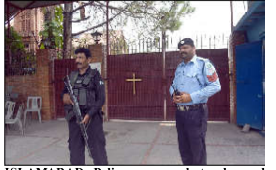
ISLAMABAD: Police personnel stand guard outside Church at Sector G-7 to counter any unexpected situation in Federal Capital.