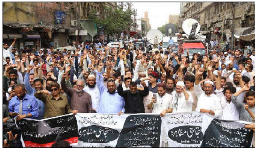
KARACHI: Traders hold protest against increasing petrol price.

ISLAMABAD (APP): The 100-index of the Pakistan Stock Exchange (PSX) on Friday shed 107.34 points, a negative change of 0.22 per cent, closing at 48,218.50 points against 48,325.84 points the previous trading day. A total of 254,814,045 shares were traded during the day as compared to 48,146.44 shares the previous day, whereas the price of shares stood at Rs 10,414 billion against Rs 10,021 billion on the last trading day.