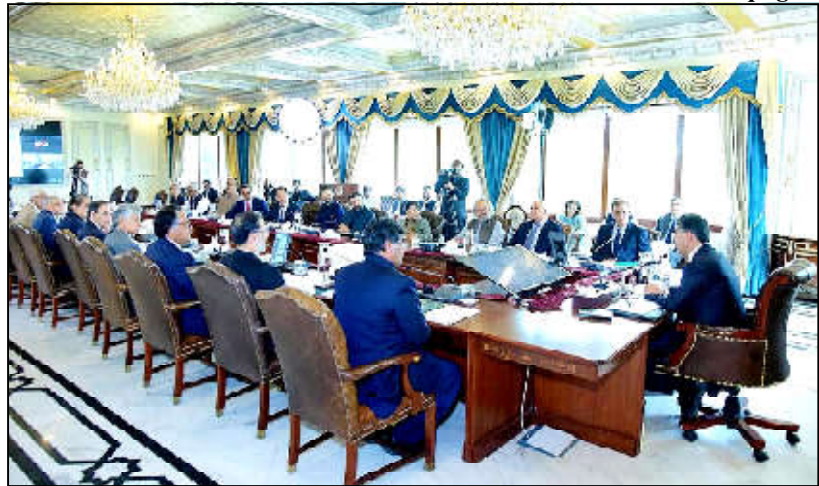
ISLAMABAD: Caretaker Prime Minister Anwaar-ul-Haq Kakar chairs the first meeting of the Federal Cabinet.