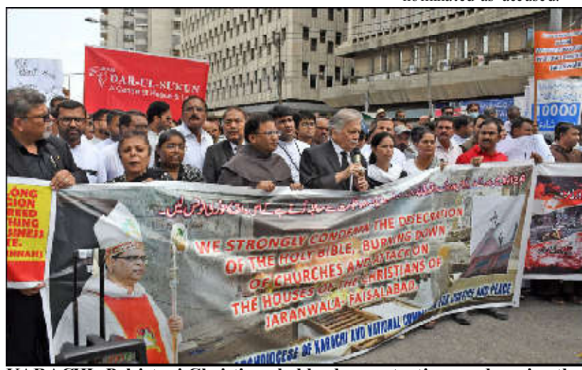
KARACHI: Pakistani Christians hold a demonstration condemning the recent attack on a Christian area by an angry Muslim mob in Provincial Capital.