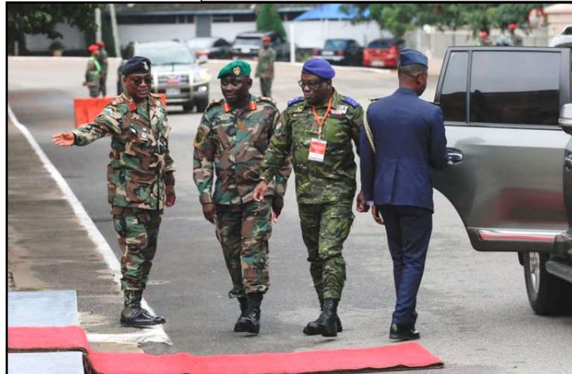
Military personnel arrive at the headquarters of the Ghana Armed Forces as the ECOWAS Committee of Chiefs of Defense staff meet on the deployment of its standby force in the Republic of Niger, in Accra, Ghana.

Monitoring Desk BEIJING: China's President Xi Jinping will attend the BRICS leaders' meeting and visit South Africa on Aug. 21-24, the Chinese foreign ministry said in a statement on Friday. Leaders from the five BRICS countries of Brazil, Russia, India, China and South Africa meet in Johannesburg next week from Aug. 22 to discuss how to turn a loose club of nations accounting for a quarter of the global economy into a geopolitical force that can challenge the West's dominance in world affairs. Russian President Vladimir Putin, who faces an international arrest warrant over alleged war crimes in Ukraine, will dial in by video call instead of attending in person. Expansion is expected to be high on the agenda, as some 40 nations have shown interest in joining, either formally or informally, according to South Africa. They include Saudi Arabia, Argentina and Egypt.