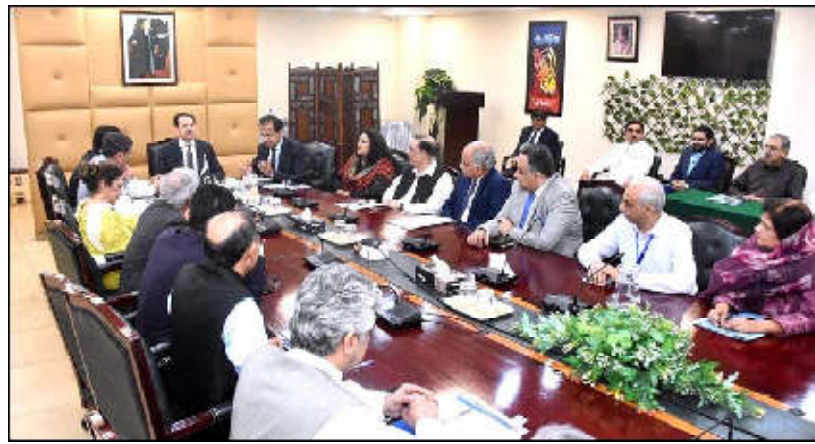
ISLAMABAD: Care taker Federal Health Minister Dr. Nadeem Jan chaired introductory meeting of the Senior Officers of Ministry and all head of attach departments.