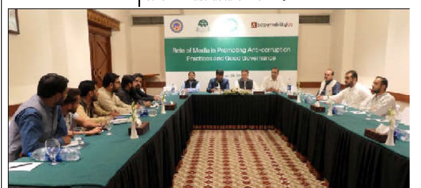
QUETTA: A view of 3-day training workshop regarding Role of Media in Promoting Anti-corruption Practices and Good Governance.

During the course of meeting, C&W department high ups provided details to the NHA about rehabilitation of the highways of the province.