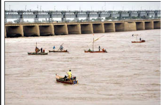
HYDERABAD: Fishermen are hunting into Indus river as the water level increases due to low flood that may cause any life risk for them, near Jamshoro.

District Population Officer Shireen Sukhan, while speaking said that population growth was the main cause of development challenges faced by Pakistan resulting in an alarming increase in poverty, illiteracy, gender inequality, environmental pollution, maternal and child mortality.