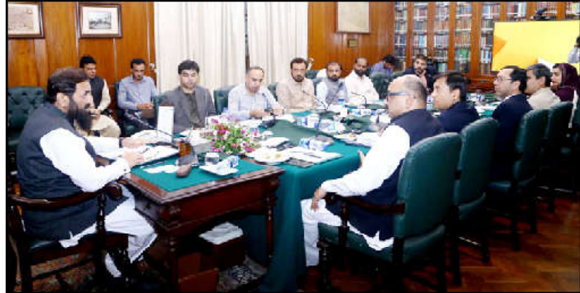
LAHORE: Governor Punjab Muhammad Balighur Rehman briefed by officials of the relevant departments on Jamia Masjid Al-Sadiq, Bahawalpur Zoo and the remains of ancient civilization Ganveriwala in Cholistan.

He said that work on the preservation of archaeological sites is being carried out on various sites in Khyber Pakhtunkhwa. He invited the people to visit the archaeological sites wherein the guides would inform them about their history.