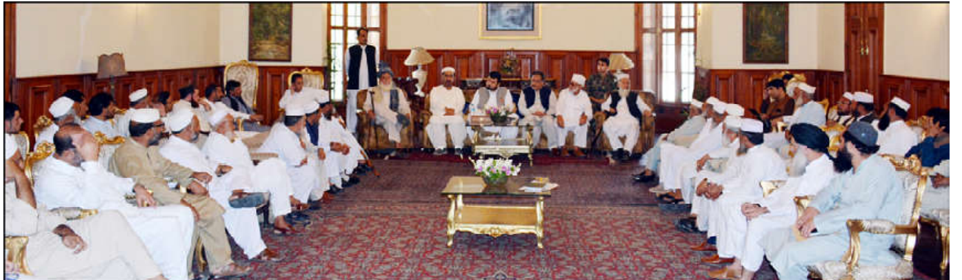
PESHAWAR: 45-members Qaumi Jirga consisting of tribal elders from Dir Bala meeting with Governor Khyber Pakhtunkhwa Haji Ghulam Ali.

In a separate meeting, a delegation led by former provincial assembly member Israr-ul-Haq met with the Governor. The delegation discussed local issues, reaffirming the Governor's commitment to collaborate and assist in finding solutions.