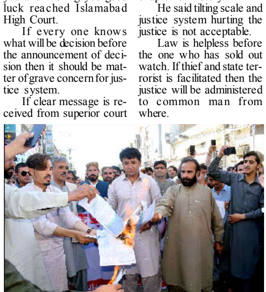
QUETTA: Members of Central Anjuman-e-Tajran Balochistan holding protest demonstration against inflated electricity bills, at Mannan Chowk

This role of justice system will be written in black chapter of history. He said tilting scale and justice system hurting the justice is not acceptable. Law is helpless before the one who has sold out watch. If thief and state terrorist is facilitated then the justice will be administered to common man from where.