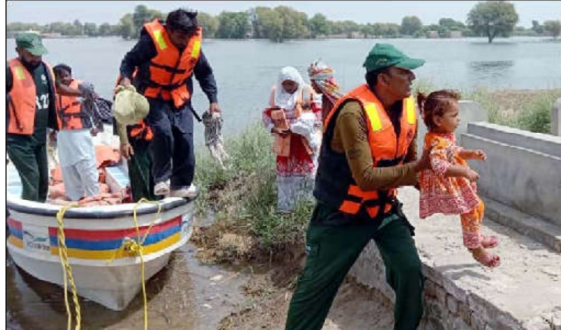
MULTAN: Rescue workers evacuate people from the villages as water from the Sutlej River continued to inundate settlements along its banks, near Multan.

The Secretary emphasized the paramount importance of restoring damaged school structures and providing essential amenities. He underscored the necessity of proactive measures to avert flood-induced harm, highlighting effective communication with the district administrations concerned. He stressed the need for an enhanced coordination mechanism with relevant authorities to bolster preparedness.