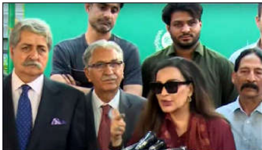
Pakistan Peoples Party (PPP) leaders speaking during a press conference in Islamabad

The top court was urged to declare the CCI decision regarding the delimitation and the census 2023 null and void.