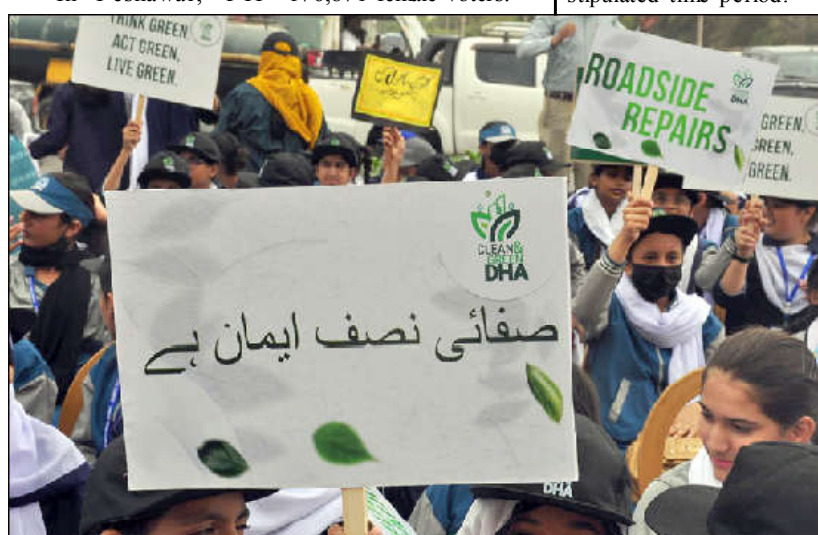
KARACHI: Students of different school and college holding banners are participating in the "Clean and Green Walk" in Provincial Capital.