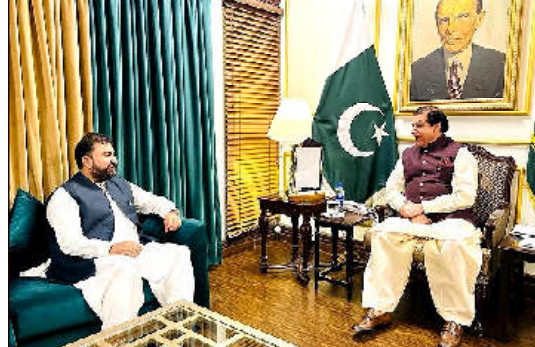
ISLAMABAD: Caretaker Federal Minister for Interior Sarfraz Ahmad Bugti in a meeting with the Speaker National Assembly Raja Pervez Ashraf

Independent Report QUETTA: The caretaker Chief Minister Balochistan, Mir Ali Mardan Khan Domki reached Karachi on Monday on a brief visit. During the stay in Karachi, Ali Mardan Khan Domki would meet the former Chief Minister, Jam Kamal Khan and other personalities. It may be mentioned here the caretaker Chief Minister went to Islamabad from Quetta a couple of days back. From Islamabad, Mr. Domki reached Karachi on Monday.