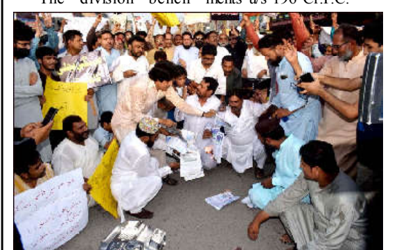
MULTAN: Traders are holding protest demonstration against massive unemployment, increasing price of daily use products, inflation price hiking and the highly inflated electricity bills

available resources for the improvement of the highways saying that the NA 65 Bolan National Highway was badly affected by heavy rains and high level floods last year and the Pinjra Bridge was completely destroyed.