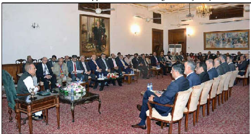
KARACHI: President Dr. Arif Alvi chairing a meeting with representatives of banking industry to review progress on initiatives for financial inclusion, gender equality and issues of banking sector at Sindh Governor House.