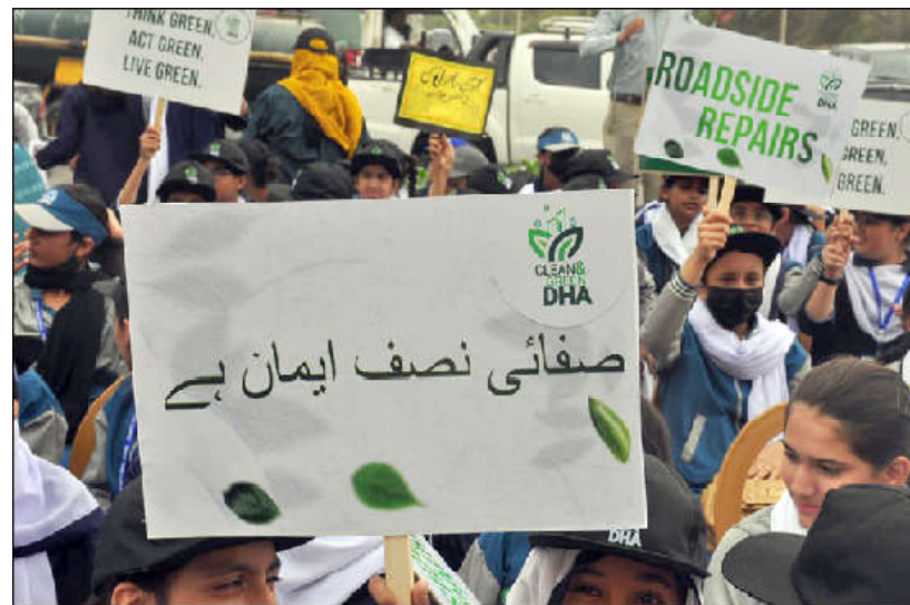
KARACHI: Students of different school and college holding banners are participating in the "Clean and Green Walk" in Provincial Capital.