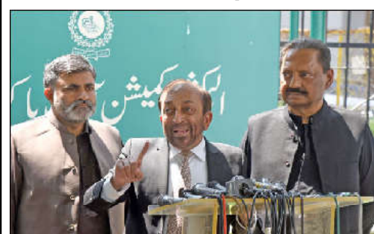
ISLAMABAD: Former Mayor of Karachi Farooq Sattar is talking to media persons along with others outside Election Commission of Pakistan in Federal Capital.

In a key development, Caretaker Federal Minister for Commerce and Industries Dr Gohar Ejaz had stressed the need for early operationalization of the EXIM Bank for enhancing Pakistan's exports. The enhancement of exports is critical as Pakistan struggles with low foreign exchange reserves. The central-bank held foreign exchange reserves decreased by $125 million on a weekly basis, clocking in at $7.93 billion as of August 18, on account of debt repayments, data released on Thursday last showed.