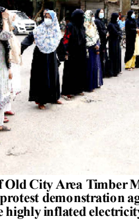
KARACHI: Residents of Old City Area Timber Market blocked road burn tyres as they are holding protest demonstration against prolog and electricity load shedding and the highly inflated electricity bills, held in Karachi

10 people were nominated in cases at Bahadurabad police station, 15 at Brigade, 17 at Tipu Sultan, seven at Soldier Bazaar, eight at Malir city and 23 at Khokhrapar police stations.