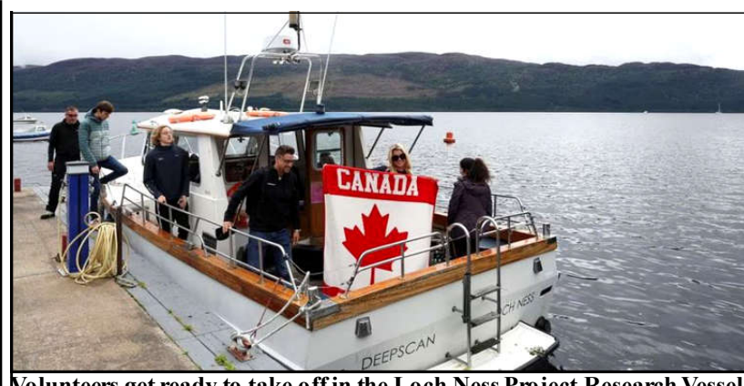
Volunteers get ready to take off in the Loch Ness Project Research Vessel, Deep Scan, as they take part in the largest Loch Ness Monster hunt for 50 years in Scotland, Britain.