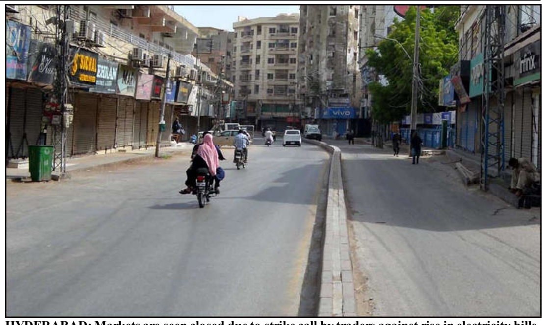
HYDERABAD: Markets are seen closed due to strike call by traders against rise in electricity bills, at Channi market.

Total 176 countries had participated in the World Summer Games Berlin 2023. Pakistani special athletes participated in 11 sports events and won 83 medals, including 11 gold, 32 silver and 40 bronze.