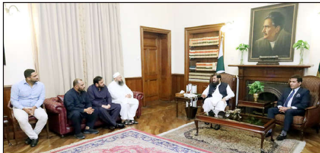
LAHORE: A delegation of All Pakistan Crockery Importers Association met Governor Punjab Muhammad Balighur Rehman at Governor House Lahore.

In Green Line, quality service and food standard was well maintained, he