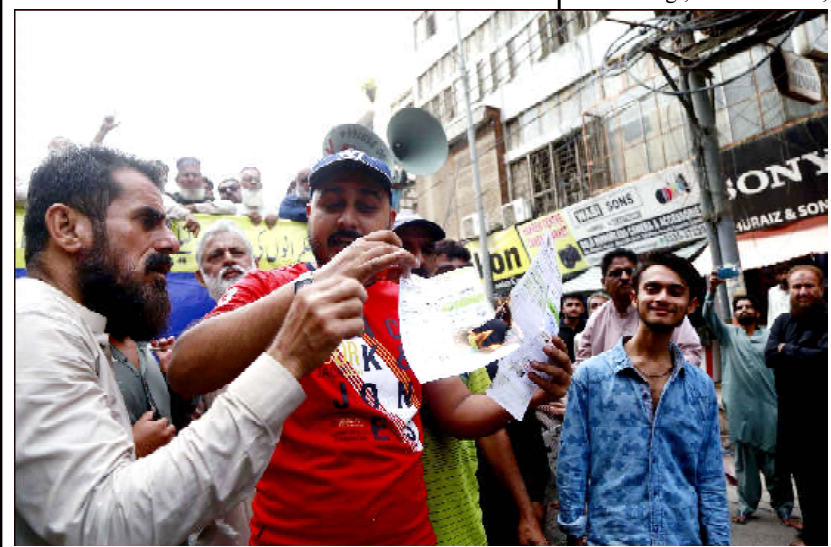
KARACHI: People holding protest demonstration against massive unemployment, increasing price of daily use products, inflation price hiking and the highly inflated electricity bills

Hundreds of citizens surrounded the grid station at Bakra Mandi and burnt electricity bills. They chanted slogans against the government.