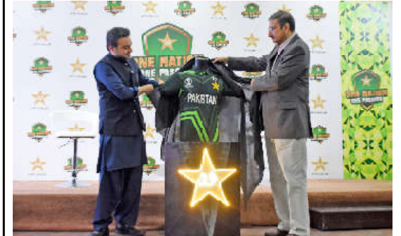
LAHORE: Chairman Pakistan Cricket Board Zaka Ashraf unveiling the new kit of Pakistan Cricket Team for Asia Cup, during media talk at Gaddafi Stadium in Provincial Capital

LAHORE (INP): The Star Nation Jersey signifies more than a mere piece of apparel; it embodies the profound connection between Pakistan's cricketing heroes and their steadfast supporters. The Pakistan Cricket Board unveiled the Star Nation Jersey today at a grand ceremony held at Gaddafi Stadium, Lahore. The ceremony, led by Mr Zaka Ashraf, Chairman of the PCB Management Committee, marked a significant step as the national team prepares for the forthcoming ICC Cricket World Cup 2023. The Star Nation Jersey signifies more than a mere piece of apparel; it embodies the profound connection between Pakistan's cricketing heroes and their steadfast supporters. Drawing inspiration from celestial bodies, each star symbolises brilliance, aspiration, and the radiant glow of cricketing achievements. This design philosophy encapsulates the spirit of cricketing excellence, resonating deeply with every Pakistani cricket enthusiast. Zaka Ashraf, Chairman of the PCB Management Committee: "The Star Nation Jersey bears witness to the enduring bond between our cricketers and the passionate fans who stand by them through every match. This jersey encapsulates our rich cricketing heritage and the luminous future that awaits." Usman Waheed, Director - Commercial: "The Star Nation Jersey isn't just a uniform; it's a canvas woven with stories, sacrifices, and triumphs. Each star on this jersey represents the unwavering support of our fans and the radiant legacy of our cricketing heroes."