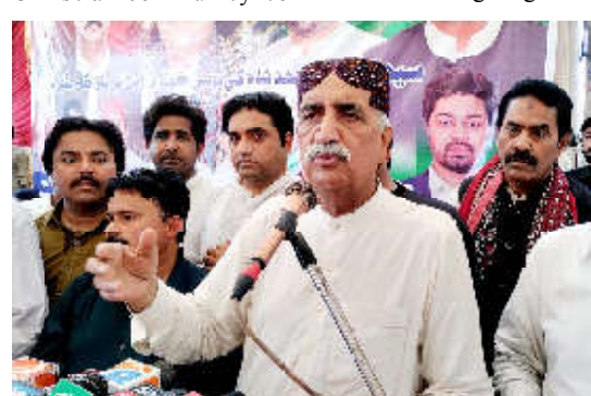
SUKKUR: Peoples Party (PPP) Senior Leader, Khurshed Shah addresses during public gathering meeting held in Sukkur

He condemned the actions of a radical mob and called for an immediate impartial inquiry to determine the facts and bring the culprits to justice.