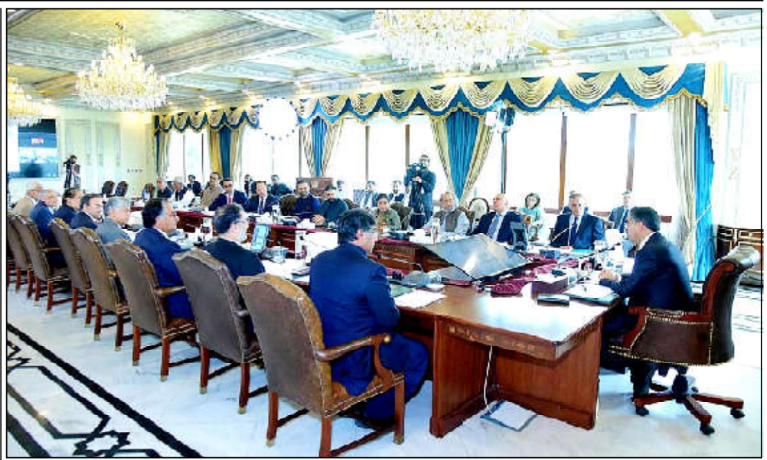
ISLAMABAD: Caretaker Prime Minister Anwar-ul-Haq Kakar chairs the first meeting of the Federal Cabinet.

During the meeting, he individually acknowledged the services of all the cabinet members saying "I am very proud that we have got one of the best team".