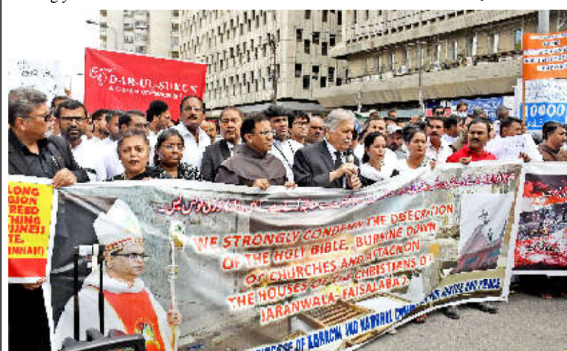
KARACHI: Christians hold a demonstration condemning the recent attack on a Christian area by an angry mob in Jaranwala