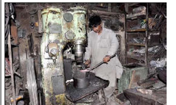
RAWALPINDI: A blacksmith preparing iron tools at his workplace.

He also gave an update on important initiatives of FBR including the Broadening of Tax Base, Track and Trace System, and Point of Sale System whereby efforts are afoot to further enhance revenue generation.