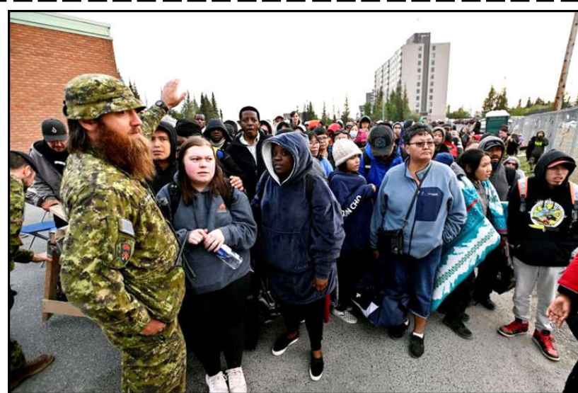
People line up outside of a local school to register to be evacuated, as wildfires threatened the Northwest Territories town of Yellowknife, Canada.