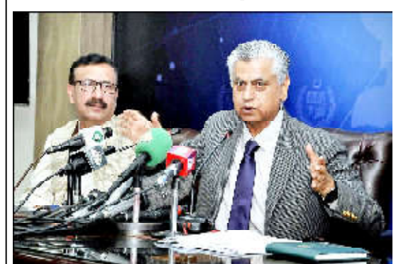
ISLAMABAD: Federal Caretaker Minister for Information and Broadcasting, Murtaza Solangi addresses press conference at PID media centre.