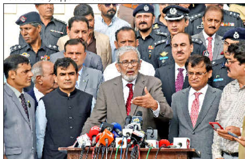
KARACHI: Caretaker Chief Minister of Sindh Justice (R) Maqbool Baqir talking to media persons at Mazar-e-Quaid in Provincial Capital.