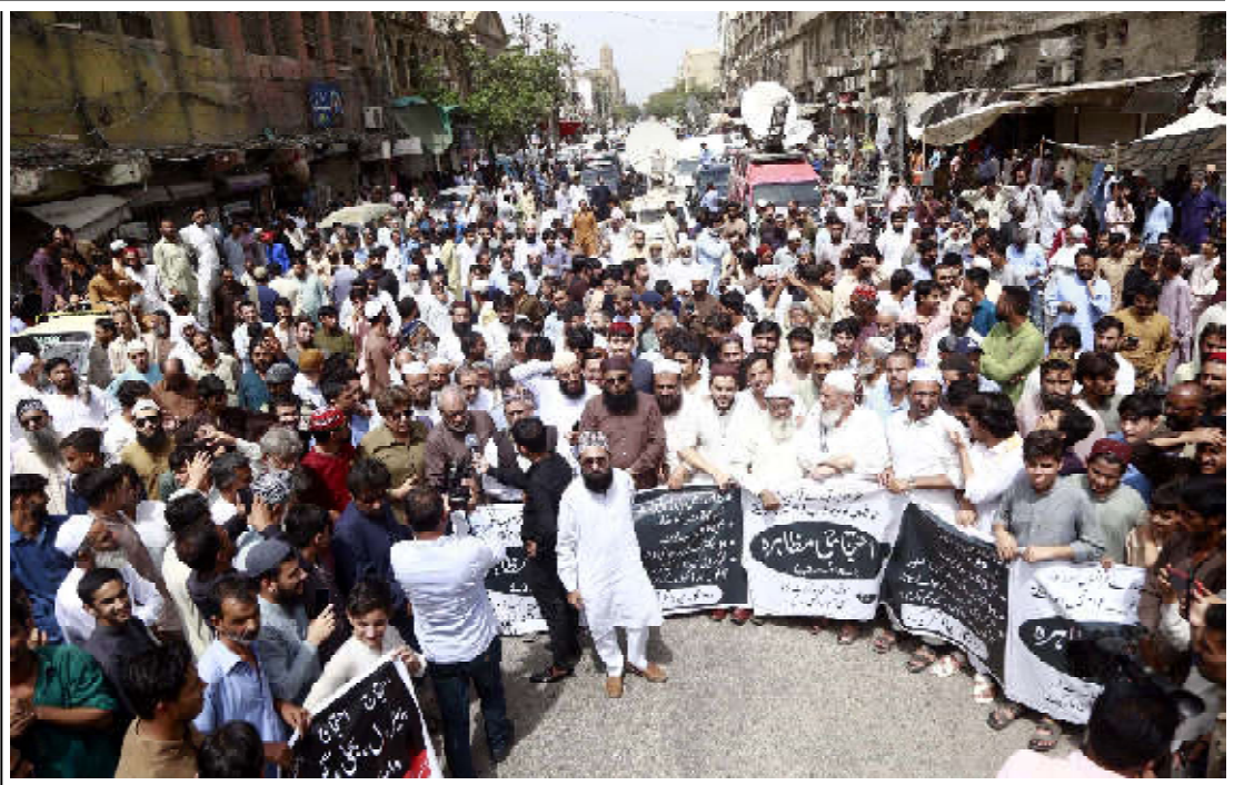
KARACHI: Traders are holding protest demonstration against the price hike of petroleum products, at Boltan Market in Karachi

The Internal Harassment Committee (IHC) of NEPRA conducted a detailed inquiry and concluded that the allegations of harassment stood established against the accused and recommended imposing the major penalty of “reduction to a lower post” from Director to Deputy Director.