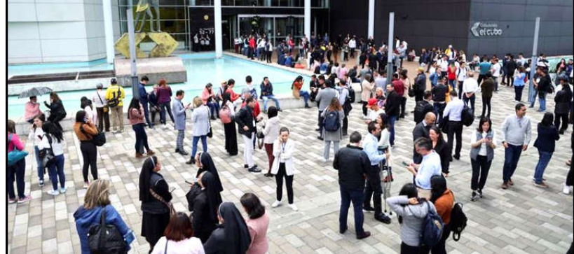
People gather outside a building after a strong earthquake shook Colombian capital Bogotá, prompting evacuations of offices and restaurants, in Bogotá, Colombia.