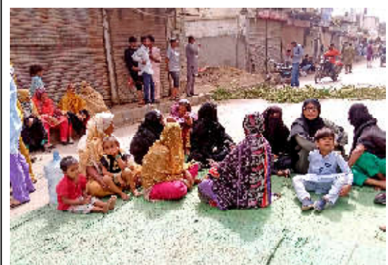
KARACHI: Residence of Martin Quarter holds protest on road at PIB Colony against the shortage of water and load shedding of electricity in Provincial Capital

The Pre-Departure Briefing Program, developed by Pakistan Remittance Initiative (PRI) in collaboration with Bureau of Emigration and Overseas Employment (BE&OE) and banks, is considered the key initiative for domestic outreach for educating outgoing workers to use formal channels for sending home remittances.