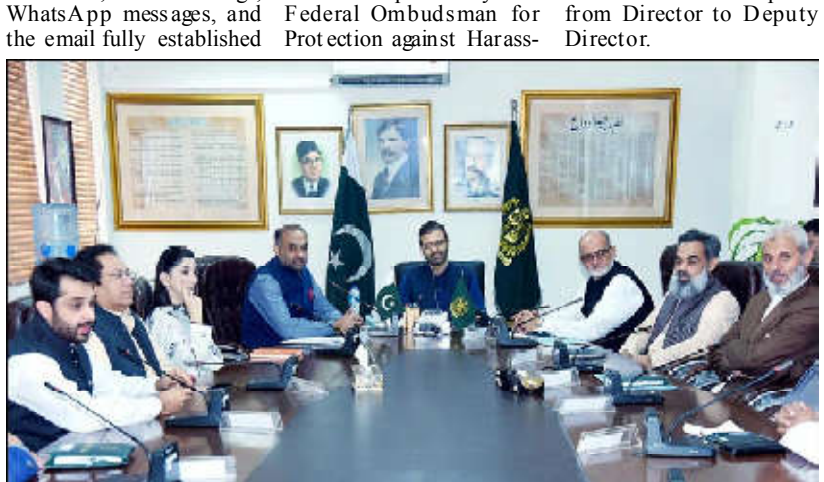
ISLAMABAD: Caretaker Federal Minister for Law and Justice Ahmad Irfan Aslam was given a presentation by the Secretary Law on his arrival at the

The Internal Harassment Committee (IHC) of NEPRA conducted a detailed inquiry and conof harassment stood established against the accused and recommended imposing the major penalty of "reduction to a lower post'