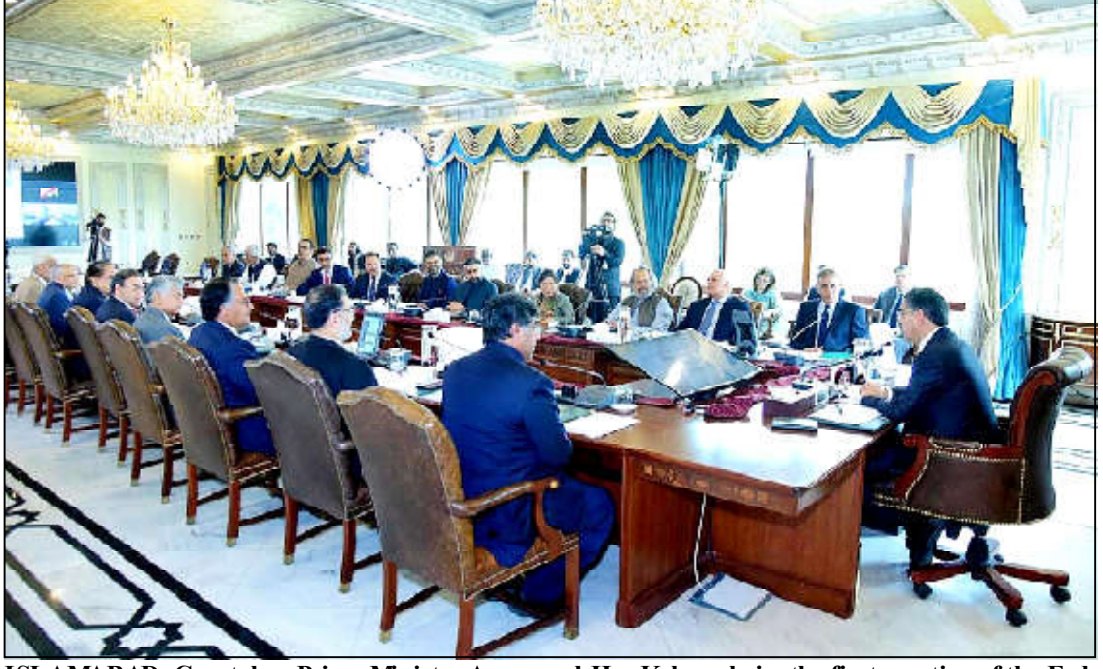
ISLAMABAD: Caretaker Prime Minister Anwaar-ul-Haq Kak ar chairs the first meeting of the Fed-

edged the services of all the cabinet members say ing "I am very proud that we have got one of the best