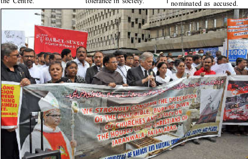
KARACHI: Pakistani Christians hold a demonstration condemning the recent attack on a Christian area by an angry Muslim mob in Provincial