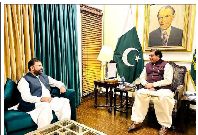
ISLAMABAD: Caretaker Federal Minister for Interior Sarfraz Ahmad Bugti in a meeting with the Speaker National Assembly Raja Pervez Ashraf

The minister said the cross-cutting function of the governance section called for its proper and efficient monitoring of all projects. Sami Saeed underscored that the economic and social outcomes obtained from the projects should be closely monitored while focusing on the optimal utilization of every single penny incurred on the projects. He added that projects of national importance should be continued on a priority basis to pass on their due benefits to the masses.