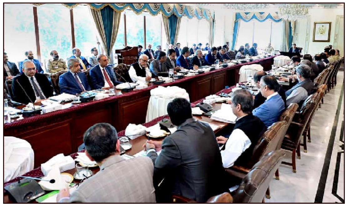
ISLAMABAD: Caretaker Prime Minister Anwaar-ul-Haq Kakar chaired the 4th apex committee meeting of the Special Investment Facilitation Council (SIFC).

The Army Chief reaffirmed Pakistan Army's all-out support to the caretaker government for continuity of policies in a bid to revive country's economy and steer Pakistan towards progress and prosperity.