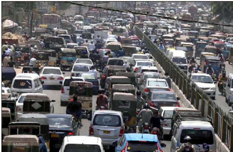
KARACHI: A large numbers of vehicles stuck in traffic jam due to negligence of traffic police staffs and illegal parking, at New M.A Jinnah road in Karachi.

The petitioner has taken the plea that false and unrealistic incident of desecration of the Holy Quran took place on August 16. One person made announcement in the mosque which ignited provocation among others. 25 churches and over 200 homes were set ablaze in Jaranwala. The homes of Christians were looted and later were destroyed. The mob desecrated divine books. JIT has been constituted in regard to this incident but this process can take too much time. Several affectees still stand deprived of basic facilities despite lapse of two weeks.