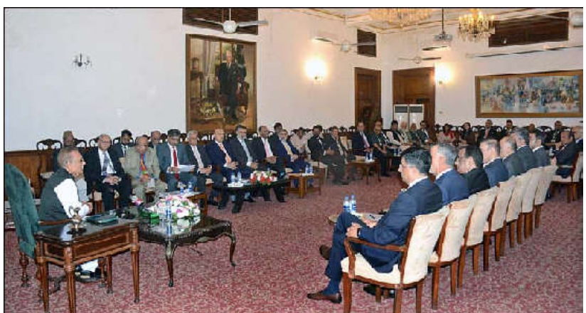
KARACHI: President Dr. Arif Alvi chairing a meeting with representatives of banking industry to review progress on initiatives for financial inclusion, gender equality and issues of banking sector at Sindh Governor House.