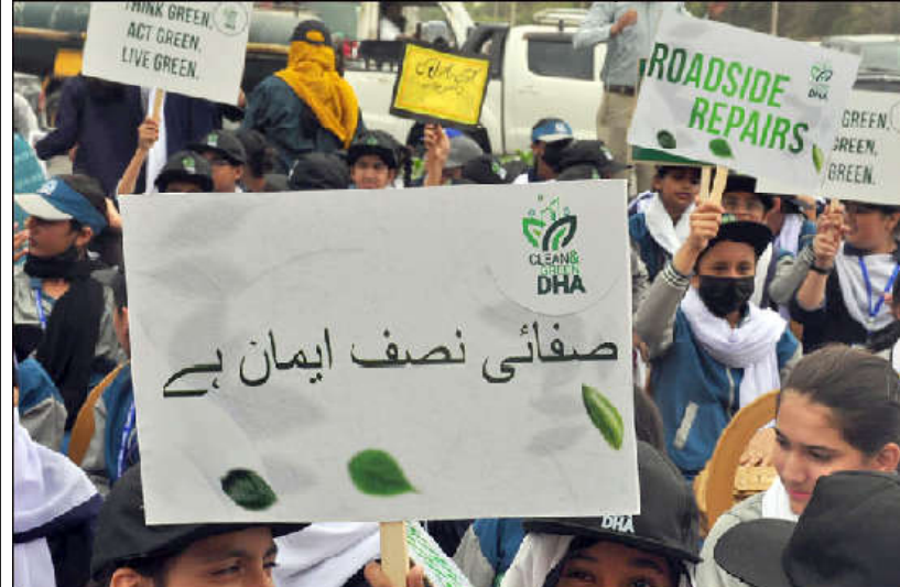
KARACHI: Students of different school and college holding banners are participating in the "Clean and Green Walk" in Provincial Capital.