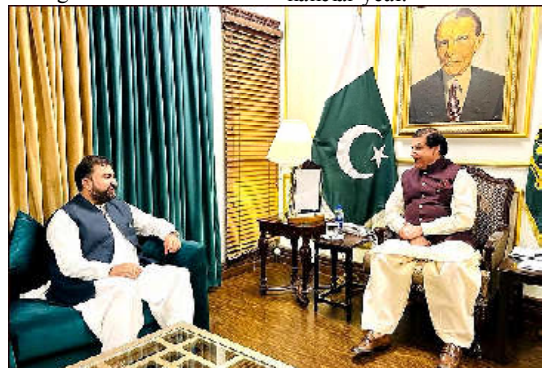
ISLAMABAD: Caretaker Federal Minister for Interior Sarfraz Ahmad Bugti in a meeting with the Speaker National Assembly Raja Pervez Ashraf