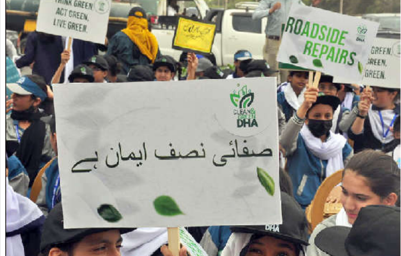
KARACHI: Students of different school and college holding banners are participating in the "Clean and Green Walk" in Provincial Capital.