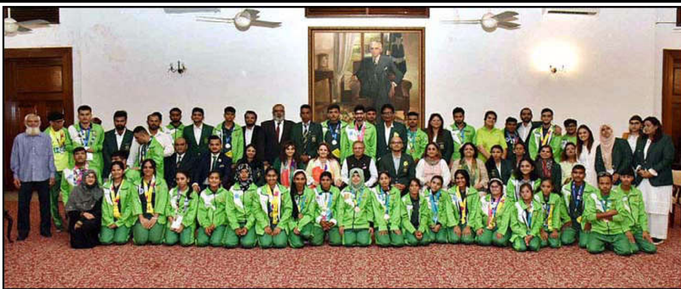
KARACHI: President Dr. Arif Alvi, and Begum Samina Arif Alvi, in a group photo with Special Olympics Pakistan delegation World Summer Games Berlin 2023 at Governor House.

Total 176 countries had participated in the World Summer Games Berlin 2023. Pakistani special athletes participated in 11 sports events and won 83 medals, including 11 gold, 32 silver and 40 bronze.