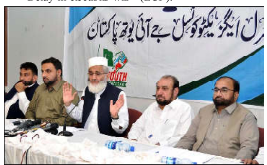
ISLAMABAD: Jamaat-e-Islami leader Sirajul Haq addressing a press conference.

Last week, Pakistan People's Party (PPP) Central Executive Committee (CEC) decided to advocate the organisation of the general elections in 90 days after the dissolution of the National Assembly. Bilawal Bhatto Zardari chaired the session of the PPP CEC to make key decisions including general elections and consultations with the Election Commission of Pakistan (ECP).