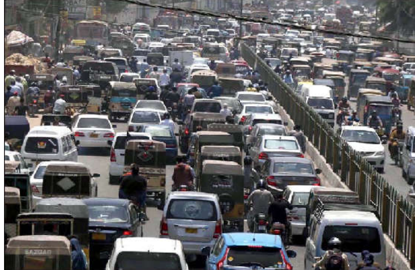
KARACHI: Large numbers of vehicles stuck in traffic jam due to negligence of traffic police staffs and illegal parking, at New M.A Jinnah road in Karachi.

The petitioner has taken the plea that false and unrealistic incident of desecration of the Holy Quran took place on August 16. One person made announcement in the mosque which ignited provocation among others. 25 churches and over 200 homes were set ablaze in Jaranwala. The homes of Christians were looted and later were destroyed. The mob desecrated divine books. JIT has been constituted in regard to this incident but this process can take too much time. Several affectedes still stand deprived of basic facilities despite lapse of two weeks.