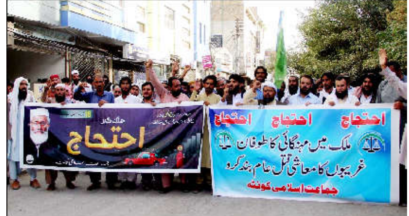
QUETTA: Activists of Jamaat-e-Islami (JI) holding protest demonstration against the price hike of petroleum products in front of Quetta press club