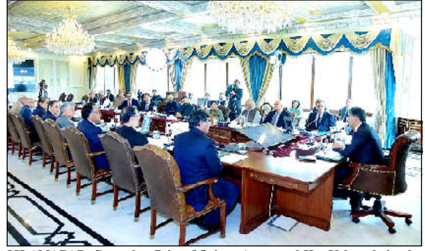
ISLAMABAD: Caretaker Prime Minister Anwaar-ul-Haq Kakar chairs the first meeting of the Federal Cabinet.

ISLAMABAD (APP): Caretaker Prime Minister Anwaar-ul-Haq Kakar vowed on Friday to comply with the commitments made by the previous government on national and international levels with different forums, besides ensuring rule of law and financial discipline during the interim period. "We do not have perpetual mandate to serve the nation but during the given allocated time we will try to lay foundation where we have sense of continuation of national and international commitments that He said in fact SIFC was not a new idea but it was an old national dream that was going to be materialized now. "Day has arrived when with the support of all institutions including Pakistan military leadership, we support, facilitate, encourage, and realize this old national dream." He said this initiatives was not held by any institution but it was collectively owned by around 250 million people of the country. "We all own it and we will contribute towards it."