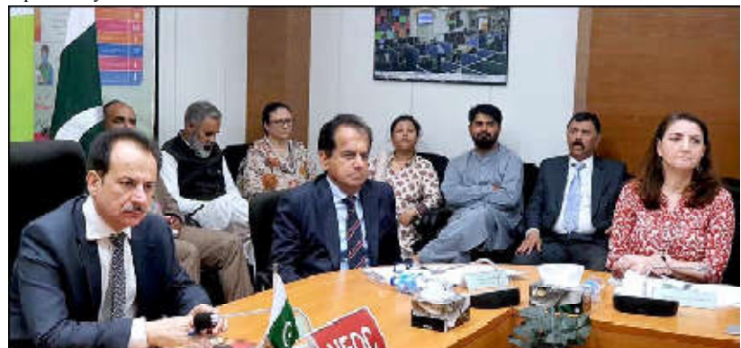
ISLAMABAD: Caretaker Federal Health Minister Dr. Nadeem Jan chaired high level meeting regarding Polio in National Emergency Polio Centre.

She prayed for him to successfully perform national responsibility as caretaker information minister. The caretaker information minister Murtaza Solangi also met with the children and family members of Marriyum Aurangzeb.