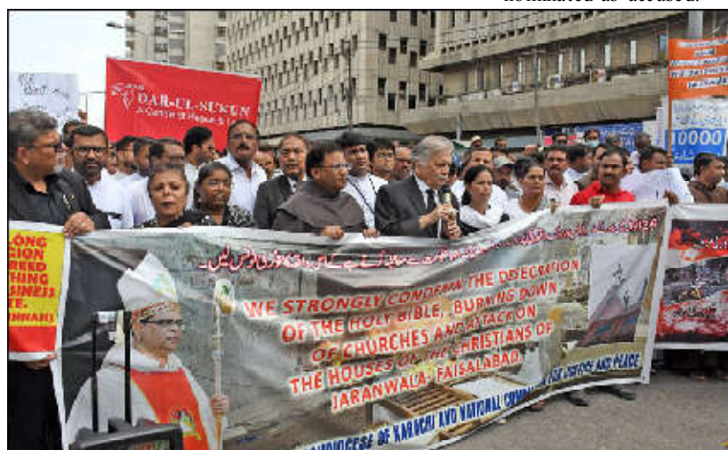
KARACHI: Pakistani Christians hold a demonstration condemning the recent attack on a Christian area by an angry Muslim mob in Provincial Capital.