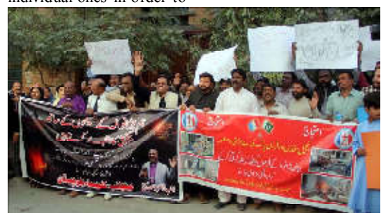
QUETTA: Members of Christian Community are holding protest demonstration against attack on churches in Jaranwala, at Quetta Press Club.