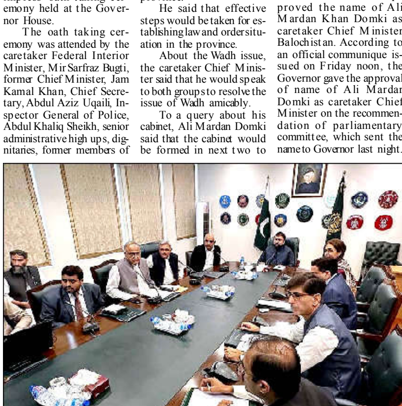
ISLAMABAD: Caretaker Federal Minister for Interior Sarfraz Ahmad Bugti chairing a briefing regarding the Ministry for Interior