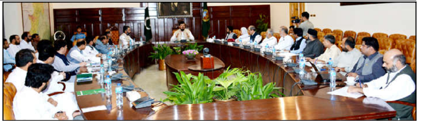
PESHAWAR: Khyber Pakhtunkhwa Governor Haji Ghulam Ali presides over the Pakistan Red Crescent society merged District (PRCS MDs) performance review meeting in Governor House.