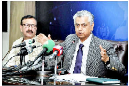
ISLAMABAD: Federal Caretaker Minister for Information and Broadcasting, Murtaza Solangi addresses press conference at PID media centre.

and apprised him about the commitment of the Federal Cabinet regarding assistance in holding free elections in the country and implementing the ECP recommendations for necessary transfer and posting of officials in that regard. He said the cabinet decided that on the election day, the first vote would be cast by the caretaker prime minister and then by the ministers. The minister said the country would be ultimately run by the elected representatives of the people as was envisaged in the Constitution of Pakistan and the caretaker government would look after the affairs only till the elections. He said that the cabinet decided to reduce the government's spending in view of the prevailing economic conditions, and it was also the government's responsibility not to waste taxpayers' money.