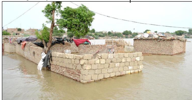
HYDERABAD: A view of flood water entered houses in Kacha area at Saharash Nagar near Indus River.

Of whom, 614 people with serious injuries were shifted to different hospitals, while 539 people with minor injuries were treated on the spot by Rescue Medical Teams. Analysis show that 553 drivers, 30 underage drivers, 127 pedestrians, and 485 passengers were among the victims of road crashes. Statistics show that 233 road accidents were reported in Lahore which affected 221 people placing the provincial capital at top of the list followed by 75 in Gujranwala with 74 victims.