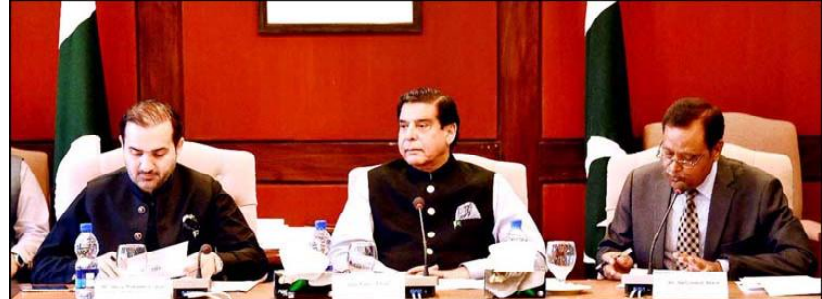
ISLAMABAD: Speaker National Assembly Raja Pervez Ashraf chairing meeting of the PIPS Board of Governors at PIPS.

decided to allocate 1 per cent of the Divisible Pool's net proceeds to Khyber Pakhtunkhwa (KP) as an acknowledgement of its front line role against terrorism. However, Dar expressed concern that the provincial government had not effectively utilized the allocated funds to build the intended counter-terrorism capacity. Expressing condemnation for the gruesome incident in Bajaur, he expressed regret that terrorism has resurged, prompting the need for introspection into the reasons behind its resurgence in the country. He called upon the House to organize a briefing from the Interior Ministry, urging them to share terror data from the last decade. He emphasized that a collective decision should be taken to determine the future course of action in combating the menace of terrorism.