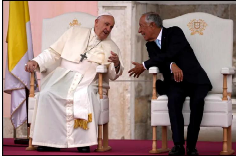
Pope Francis and Portugal's President Marcelo Rebelo de Sousa, right, converse at the Welcome Ceremony at the Belem presidential palace in Lisbon.