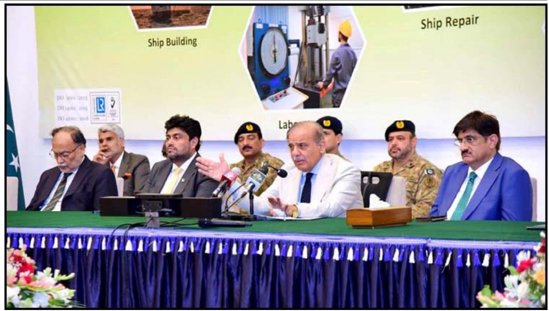
ISLAMABAD: Prime Minister Muhammad Shehbaz Sharif addresses a meeting organized by Karachi Chamber of Commerce and Industries (KCCI).

He assured that the government would provide electricity to the traders in Karachi at similar rates.