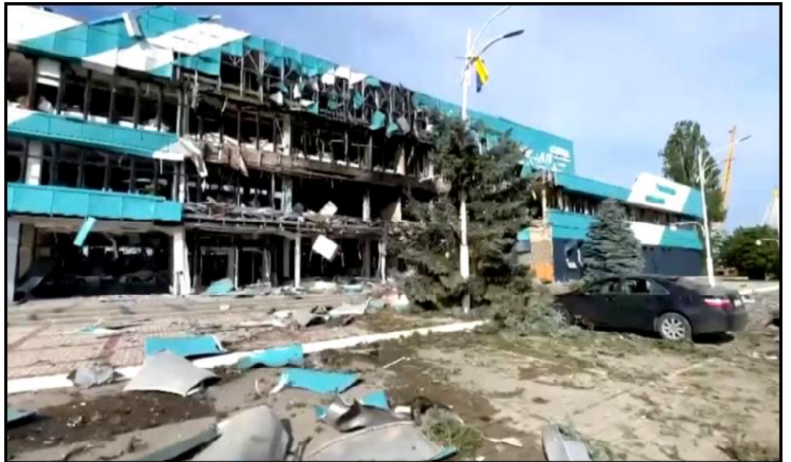
A general view of damaged property, following a Russian drone attack, amid Russia's attack on Ukraine, at IZMAIL, Odesa region, Ukraine.

Earlier on Wednesday, Russia attacked Ukraine's main inland port on the Danube River, sending global food prices higher as Moscow ramps up its use of force to reimpose a blockade of Ukrainian grain exports. The port, across the river from NATO-member Romania, has served as the main alternative route out of Ukraine for grain exports since Russia reintroduced its de facto blockade of Ukraine's Black Sea ports in mid-July.