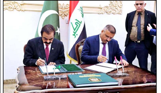
BAGHDAD: Federal Minister for Interior Rana Sana Ullah Khan and Interior Minister of Iraq Abdul Amir Al Shammari during an agreement signing ceremony.

The SC maintained let high court decide first. If you don't get relief then the case is pending hearing in SC.