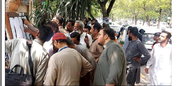
ISLAMABAD: Parents searching names in list of their daughters at F-7/2, thousands of girls apply but few got admission as government not yet able to fulfill demand of residents of Federal Capital due to small number of Colleges in Islamabad.

ISLAMABAD (Online): Five years disqualification period of PML-N leader and former state minister Talal Chaudhry has expired. Supreme Court (SC) had awarded punishment of five years disqualification to him on August 02, 2018 in contempt of court case. Former Chief Justice of Pakistan (CJP) Saqib Nisar took suo motu notice of speech delivered by Talal Chaudhry in a public meeting. During a public meeting in 2018 in Faisalabad Talal Chaudhry had criticized judges who had provided legal shelter to dictatorship. Upon it a 3-member bench of SC had declared that Talal Chaudhry committed contempt.