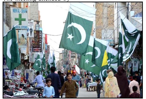
QUETTA: A view of national flag install onazaar for selling purpose on ahead of 76th Pakistan Independence Day

The BISP Board approved Rs. 471 billion budget for FY-2023-24 which included Rs. 361.5 billion for Benazir Kafalat Programme, covering 9.3 million families, Rs. 32.7 billion for Benazir Nashonuma Programme covering 1.5 million