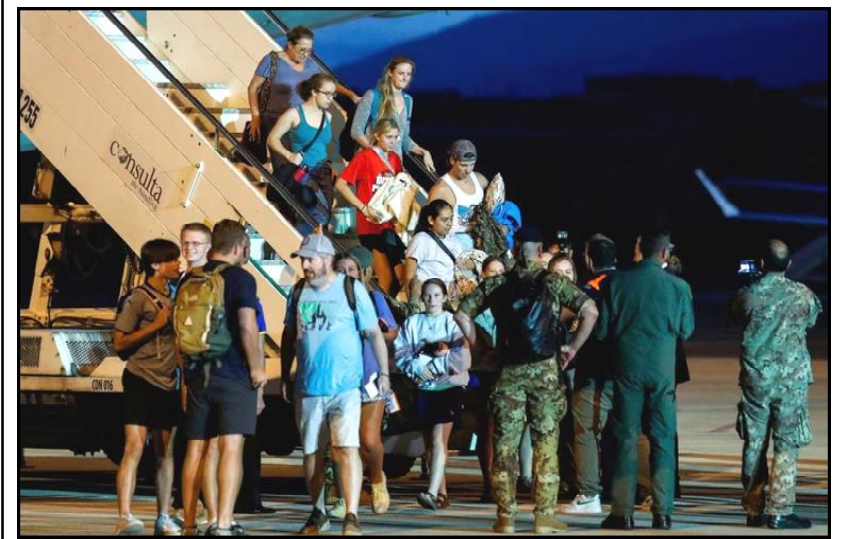
Italian nationals and other European and American citizens, who have been evacuated from Niger, days after a junta seized power in the west African country, arrive at Ciampino Airport, near Rome, Italy.

There was no sign the change of command was related to the recent sacking of Chinese Foreign Minister Qin Gang, who had disappeared from public view for weeks before he was replaced by his predecessor, Wang Yi, analysts said.