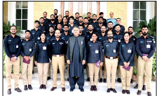
QUETTA: Governor Balochistan Malik Abdul Wali Khan Kakar in a group with under trainee ASPs of National Police Academy currently on study tour of Quetta

The COAS felicitated the PLA and lauded the PLA's role in China's defence, security and nation-building. While highlighting various facets of the deep-rooted ties between the two states, militaries and the people, COAS said that the "Pakistan-China relationship is unique & robust that has proven its resilience in the face of all challenges."