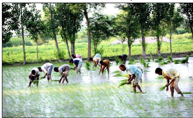
FAISALABAD: Farmers seeding the rice crop on their field.

As many as 353 companies transacted their shares in the stock market; 194 of them recorded gains and 128 sustained losses, whereas the share price of 31 companies remained unchanged.