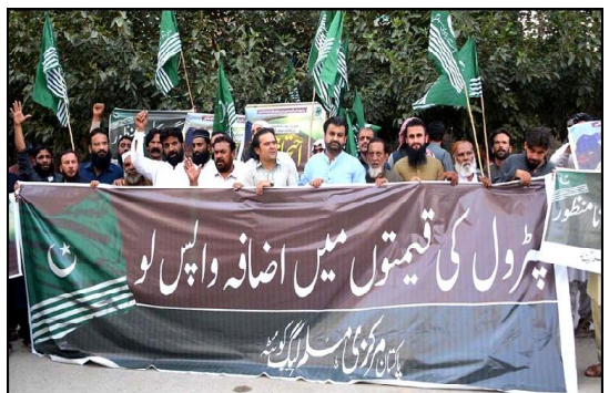
QUETTA: Activists of Pakistan Markazi Muslim League hold a protest rally against increase in electricity, gas and petroleum prices.