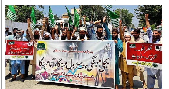
PESHAWAR: Pakistan Central Muslim League activists hold protest against petrol price outside PPC.