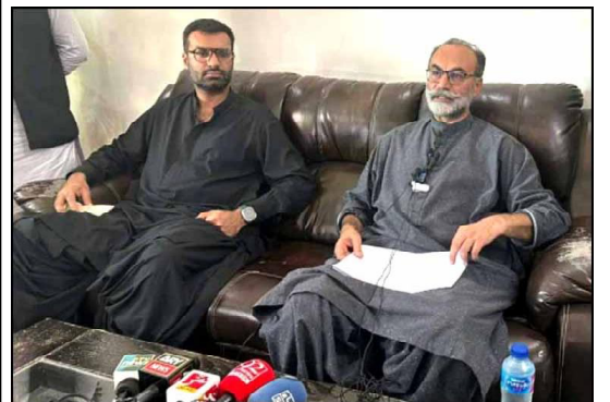
KHUZDAR: Former Senator Nawabzada Haji Lashkari Khan Raisani addressing a Press conference