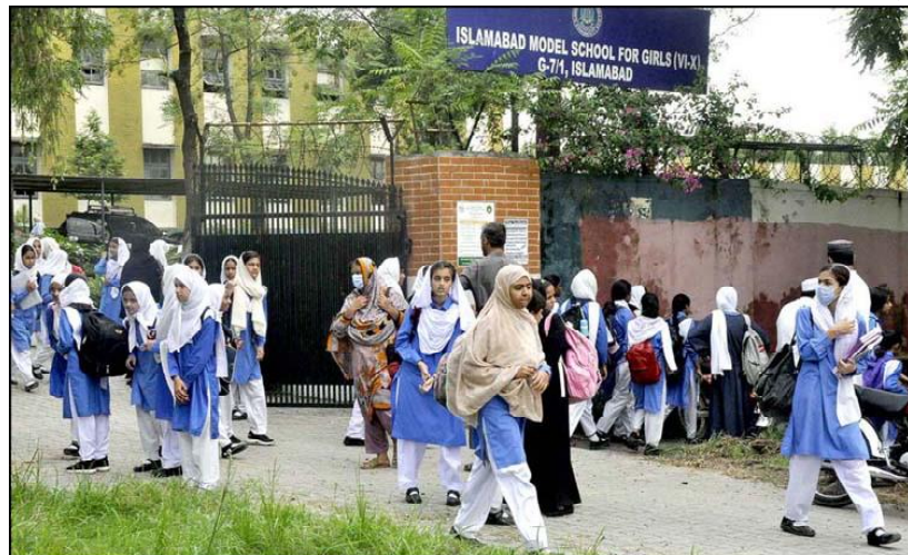
ISLAMABAD: Students attending school after the summer vacation on the opening day after two month at G-7 sector.