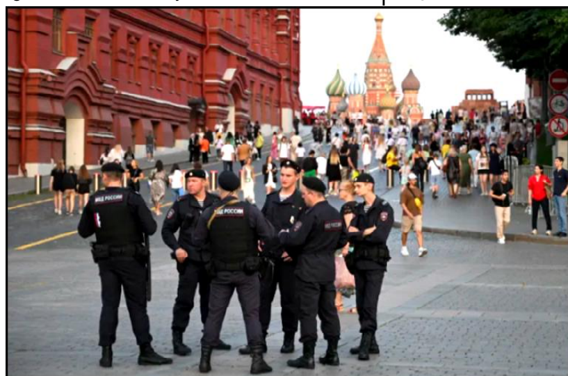
Police officers stand near the Red Square in Moscow, Russia.