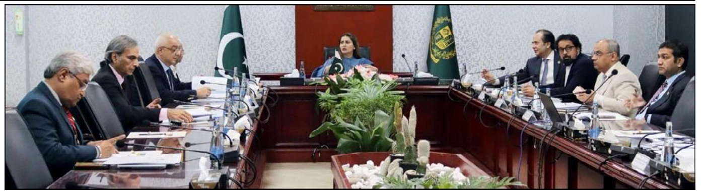
Ms. Shazia Marri, Federal Minister for Poverty Alleviation and Social Safety and Chairperson Benazir Income Support Programme (BISP) Chairs the 60th BISP Board of Directors Meeting in Islamabad.

militancy in the country. Condemning the indecent incidents of desecration of the Holy Quran in Sweden and Denmark, Ashrafi on behalf of all Ulema and Mashaykh of Pakistan, seconded the stance of the Organisation of Islamic Cooperation (OIC) for legislating against these blasphemous acts at the international level. He assured full cooperation to Jamiat Ulema-e-Islam (Fazl) Chief Maulana Fazl-ur-Rehman as it is the biggest religiopolitical party and contributing to the peace, progress and prosperity of the country since day one. He announced to hold countrywide Ulema and Mashaykh conventions for a stable Pakistan in the entire month of August and made it clear that they would not surrender before the terrorism and extremism anyway. He further assured the national security institutions that they were standing by them for the security and sovereignty and the supremacy of Islam through thick and thin.