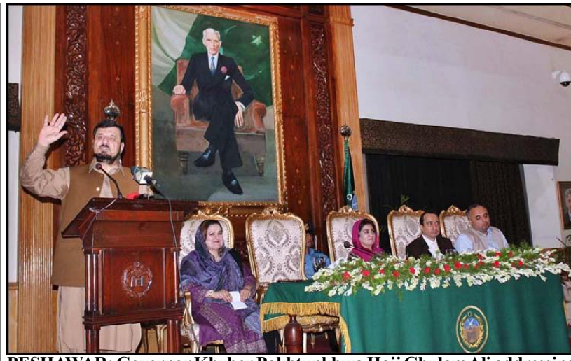
PESHAWAR: Governor Khyber Pakhtunkhwa Haji Ghulam Ali addressing during Women Excellence Award 2023 ceremony at Governor House.

The CM reaffirmed his commitment to invest billions in the coming months to improve Services Hospital without any limitations. He emphasized that Services Hospital would be transformed into a brand new facility in a short span of time, provided ownership and responsibility were ensured. He questioned why government hospitals were unable to match the standards of the best private hospitals. He stressed that if senior doctors did not fulfill their duty hours, it set a negative example for lower staff to follow. However, he assured that positive results would follow if everyone fulfilled their responsibilities. Doctors and paramedics should observe their duty timings and may perform their work after official duties were completed.