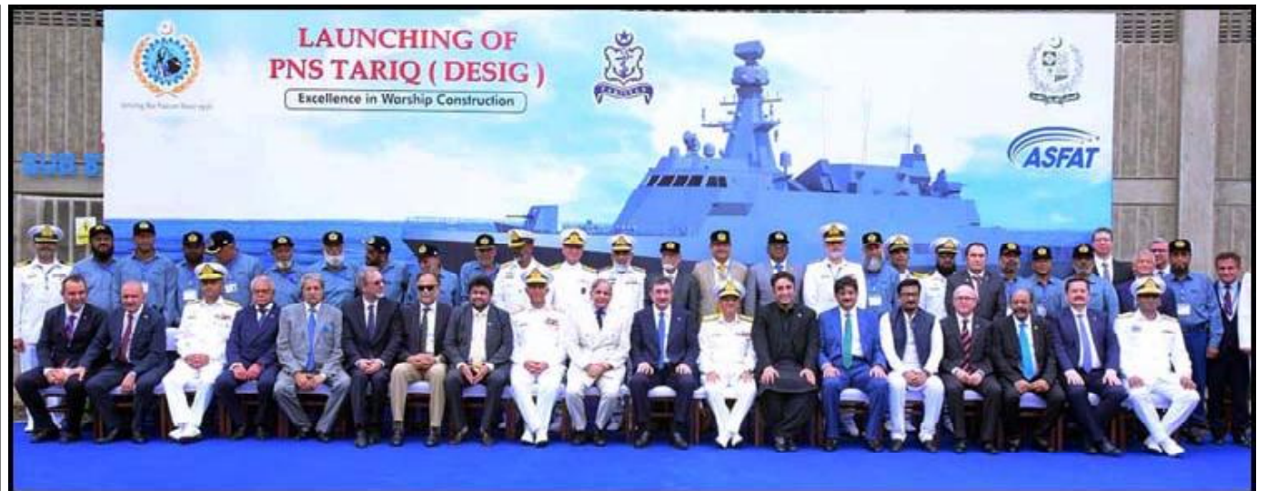
KARACHI: Prime Minister Muhammad Shehbaz Sharif, Turkiye's Vice President Ceydet Yilmaz and other dignitaries in a group photo at the launching ceremony of Pakistan's 4th MILGEM Corvette "PNS Tariq".

The Minister mentioned that Pakistan possesses the largest gas pipeline valued at 40 to 50 billion dollars and has reserves of minerals and mines worth $600 billion. To start with, seven such valuable assets, amounting to $8 billion, will be placed in the Pakistan Sovereign Wealth Funds.