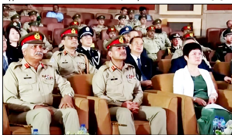
ISLAMABAD: Chief of Army Staff (COAS), General Syed Asim Munir attending 96th anniversary of the founding of the People's Liberation Army (PLA) of China commemorated at General Headquarters (GHQ)