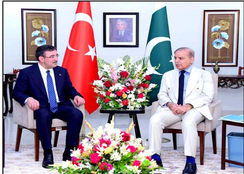
KARACHI: Vice President of Türkiye, Cevdet Yilmaz meeting with Prime Minister Muhammad Shehbaz Sharif.