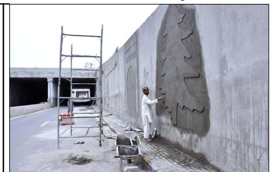
ISLAMABAD: Skilled laborer busy in work to enhance the beauty of underpass wall at 7th Avenue during development work in Federal Capital.

Twelve dengue patients are under treatment in Holy Family Hospital and 10 dengue patients are under treatment in DHQ hospital. 76% of dengue patients are male and 24% are female.