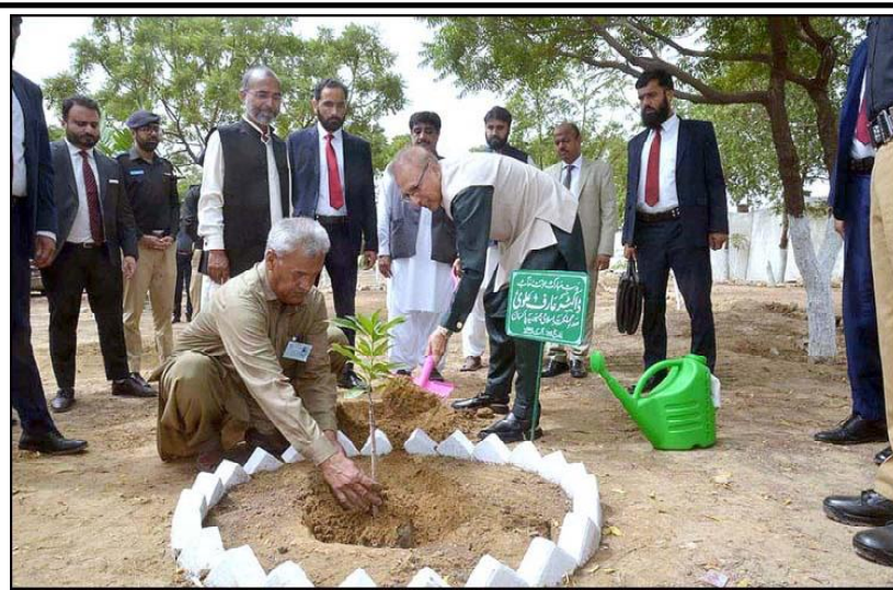
KARACHI: President Dr. Arif Alvi planting a Mango sapling at Mizar-e-Quaid.