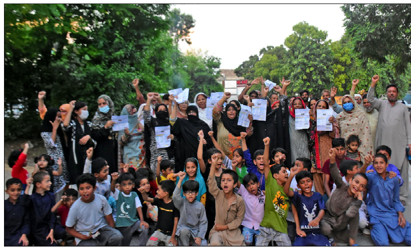
ISLAMABAD: People holds their electricity bills block the road at Sector G-7 during protest against the extremely over billing, as the common people are now helpless for paying such huge amount, in Federal Capital.