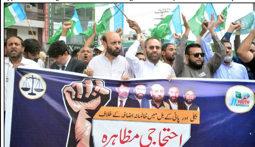
RAWALPINDI: Workers of Jamat-e-Islami holds protest outside WASA Office against the unbearable price hike of electricity, fuel and inflation across the country.

consumed. The wildlife staff also discovered three lizards that had been prepared for cooking. Reports suggest that the lizards with broken backs were intended for sale to producers of 'sanda oil'. This incident raises concerns about the illegal trading of wildlife and its impact on biodiversity. In addition to the lizard rescue operation, a hunter engaged in the illegal hunting of a rare falcon was apprehended by the wildlife team in the Tabi area of Mianwali. The authorities confiscated hunting equipment, including a snare basket, as well as two live mice. The accused was fined Rs30,000 for his actions.