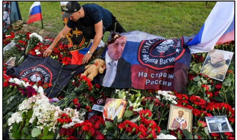
A man arranges a flag bearing the logo of private mercenary group Wagner at a makeshift memorial for Yevgeny Prigozhin in front of the Private Military Company (PMC) Wagner Centre in Saint Petersburg.

face escalating terrorist threats. Thomas-Greenfield was asked after the council meeting what the West should do to stabilize the situation in those countries and others in Africa where Wagner is active, including Libya, following Prigozhin's death and uncertainty about the future of Wagner's African operations. The U.S. ambassador had no comment on Prigozhin but said: "Our position on Wagner is very well known."