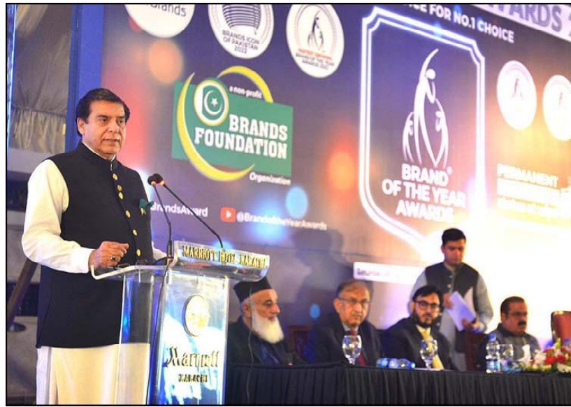
KARACHI: Raja Pervaz Ashraf, Speaker National Assembly of Pakistan is addressing to the participants at Brands of the Year Awards Ceremony at Marriott Hotel.