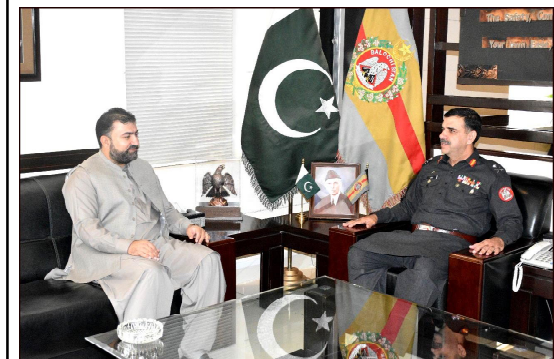
He said that we present salute to the Pak Army and FC who contributed and rendered sacrifices for establishing peace in the province.

Meanwhile, the Interim Minister also visited the Media Academy and inspected its different parts.