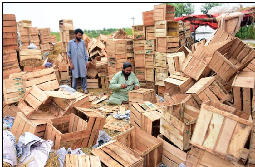
ISLAMABAD: A worker is busy in making wooden crates at working area in Sector I-11/1 in Federal Capital.