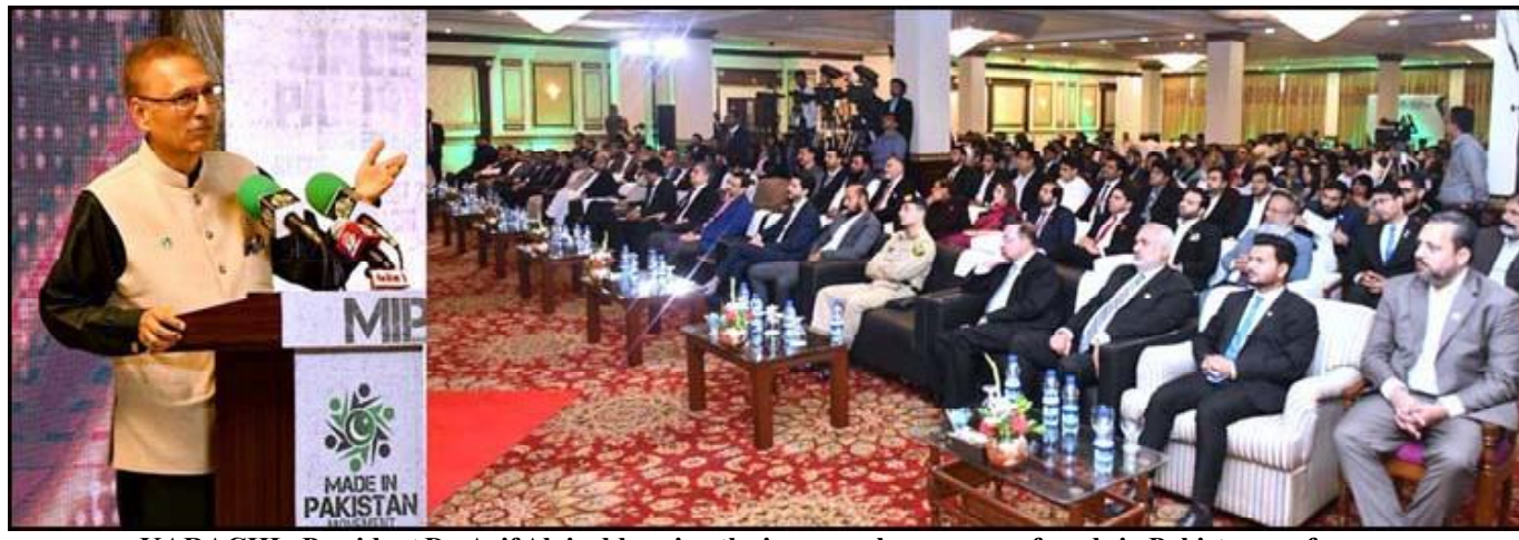
KARACHI: President Dr. Arif Alvi addressing the inaugural ceremony of made in Pakistan conference.