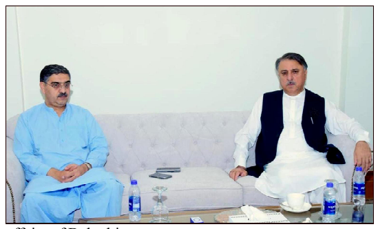
affairs of Balochistan. The overall situation of law and order was also discussed during the meeting.

During the course of meeting, the Governor discussed with the caretaker Prime Minister about administrative