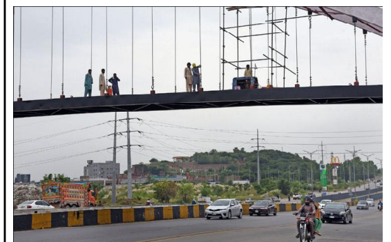
ISLAMABAD: Workers are busy in their work of installing over head pedestrian bridge at Srinagar Highway in Federal Capital.

The IHRA inspection teams also visited the Blood Bank of KRL Hospital and Islamabad Medical Complex (Nescom) and instructed their managements to comply with the directions given by the inspection teams for improvements.