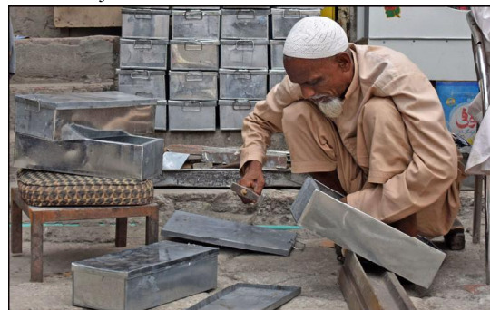
LAHORE: A worker is busy in making different kinds of iron pots at his shop on Nisbat Road, to earn daily wages for the livelihood of his family.