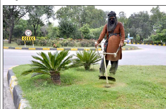
ISLAMABAD: CDA worker busy in trimming grass on roadside greenbelt.

It was also hoped that the UN's member states would move towards the idea of nuclear disarmament.