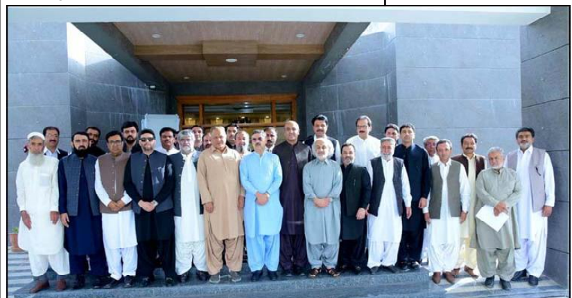
QUETTA: A delegation of coal mining companies owners in a group photo with Caretaker Prime Minister Anwaar-ul-Haq Kakar.