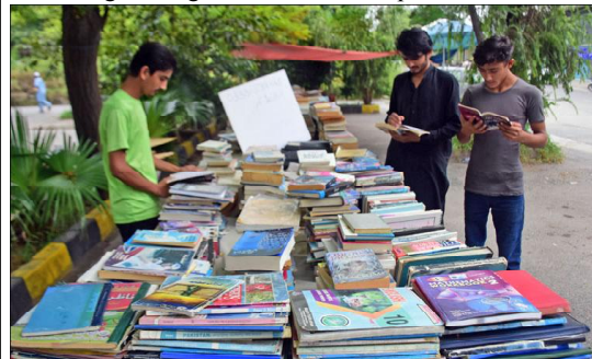
ISLAMABAD: People are buying books from vendor at G-8 Markaz as due to the modern technology such ambitions are now decreasing day by day across the country.

Complaints can be submitted 24/7 through phone, fax, or email. As per an ECP spokesperson, the election process will be monitored by senior officers from the control room. The Control Room maintains continuous communication with District Monitoring Officers and Monitoring Teams in KP. Setting up the central control room showcases the ECP's proactive approach to ensuring a smooth and equitable local government election process in KP.