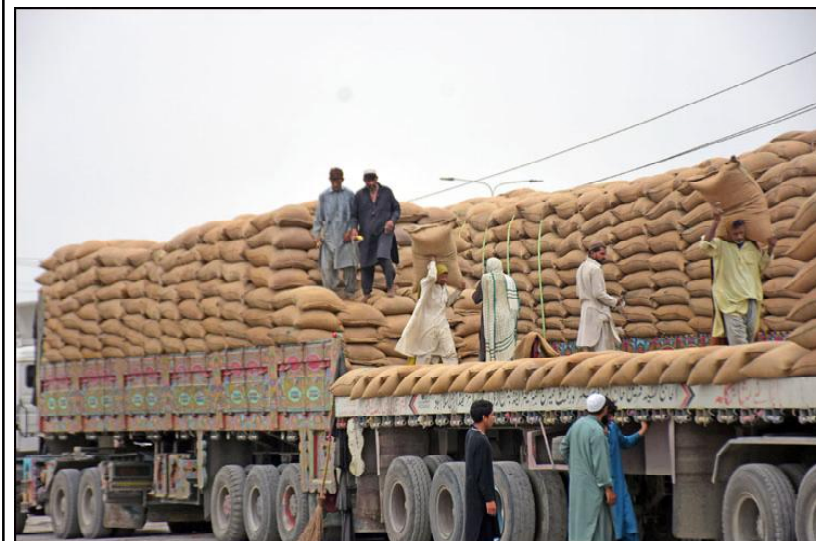
ISLAMABAD: Laborers are transferring the wheat sacks to other truck from out of order one at Industrial area of I-9 in Federal Capital.

LAHORE (APP): Price control magistrates arrested 71 shopkeepers and sealed three shops over profiteering and hoarding in a crackdown launched across the provincial capital by the district administration. On the directions of Lahore Deputy Commissioner Rafia Haider, more than 1,539 sales points and shops had been inspected during the last 24 hours, while legal action was taken against 192 sales points. The spokesperson for the district administration told media on Saturday that cases were also registered against 55 shopkeepers over violations of the rules.