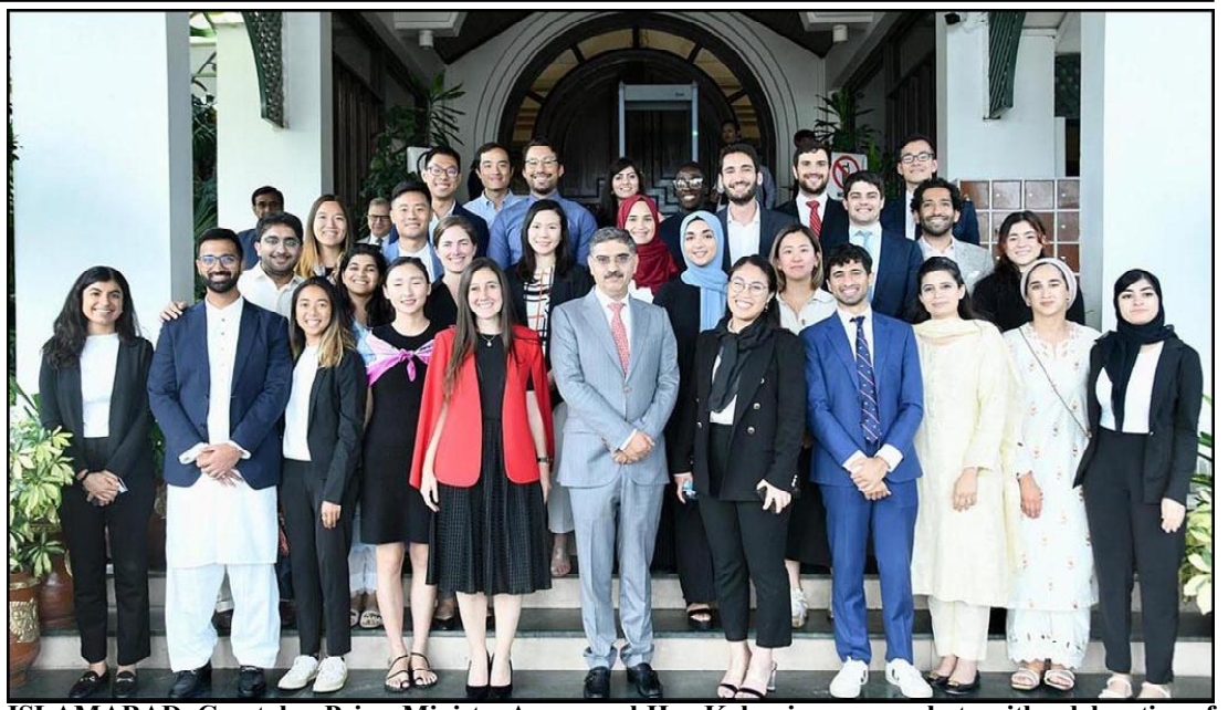
ISLAMABAD: Caretaker Prime Minister Anwaar-ul-Haq Kakar in a group photo with a delegation of Harvard University Students.

He said, despite the relentless suppression, the women of occupied Kashmir have significantly contributed to the ongoing freedom movement while fighting shoulder to shoulder with the Kashmiri freedom fighters.