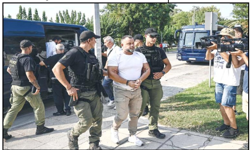
Police escort a Greek citizen to a court in Alexandroupoli after charging him with incitement to commit racially motivated crimes, including racially motivated kidnappings.

to testify. While acts of protest big and small are common in legislatures, states often have rules in place to limit disruptions to government proceedings, with authorities given wide latitude to remove people who jeer, chant or are otherwise seen to interrupt debates. People who go to capitols to voice their opinions often face a varied set of regulations that limit the display of signs, political messaging on clothing and even where people can gather, with penalties ranging from expulsion to criminal charges. In some cases, lawmakers have pursued policies that effectively limit acts of protest, such as requiring people to get permission before protesting, leading to legal resistance and criticism that lawmakers are trying to tamp down on dissent and free speech rights.