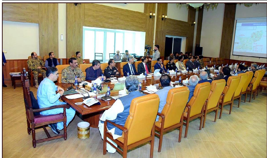
QUETTA: Caretaker Prime Minister Anwaar-ul-Haq Kakar chairs a meeting to review security situation in the country, especially Balochistan.

Ph: 2841470/2841473 REG: No. BC-116 B/ID-445 Vd XXV No 06, Safar 09, 1445 AH Sunday August 27, 2023 Pages 12, Price Rs.15