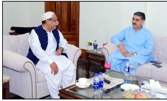
Former Speaker Balochistan Assembly, Jan Muhammad Jamali calls on Caretaker Prime Minister Anwaar-ul-Haq Kakar in Quetta.

Expressing concern over the poor law and order in the country particularly in KP, Aftab Sherpao asked the government to take corrective steps as soon as possible or else the situation could spin out of control. Commenting on the Battagram chairlift incident, he said that it showed that the remote areas in KP were still underdeveloped and lacked even the basic road infrastructure.