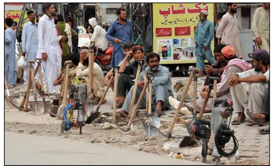
ISLAMABAD: Daily wages workers with their tools waiting for costumers at roadside in the Federal Capital.