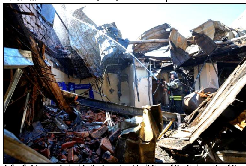
A firefighter works inside the burnt-out building of the University of Economics and Trade, which was reportedly hit by shelling in the course of Russia-Ukraine conflict in Donetsk, Russian-controlled Ukraine.

Monitoring Desk KYIV: The Chonhar road bridge linking mainland Ukraine to Crimea was damaged by a Ukrainian missile strike on Sunday, Russia's RIA news agency cited the Moscow-appointed head of Crimea, Sergei Aksyonov, as saying. RIA cited acting Kherson regional governor Vladimir Saldo—another Moscow appointee—as saying the strike on the bridge, one of three road links between Crimea and mainland Ukraine, involved an Anglo-French Storm Shadow missile. He did not provide any evidence.