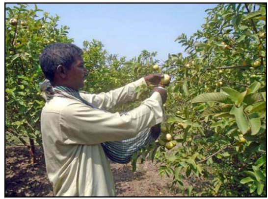
CHINIOT: A farmer is plucking Guavas fruit from trees in a farm outskirts area of city.

Speaking on the occasion, Provincial Minister of Industry and Commerce SM Tanveer said that the government is following an effective strategy to provide business and commercial opportunities in the province.