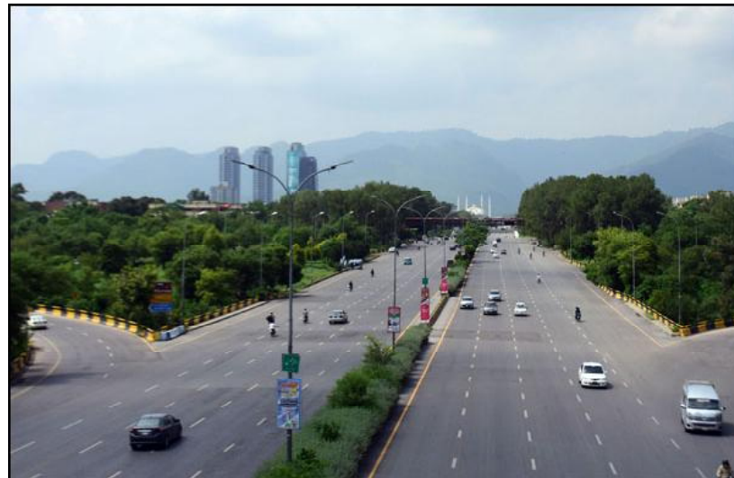
ISLAMABAD: Motorists on their way at Islamabad Highway in Federal Capital, Section 144 imposed in major Pakistani cities after Chairman PTI arrest.

ISLAMABAD (APP): The Federal Flood Commission (FFC) has said currently Rivers Indus in Guddu-Sukkur reach and Sutlej in Sulemanki-Islam reach are experiencing low flood. According to daily FFC report on Sunday, rest of the major rivers of Indus River System (Jhelum, Chenab & Ravi) are discharging normal flows. Present Combined Live Storage of major reservoirs (Tarbela, Chashma & Mangla) is 12.367 MAF i.e. 92% of the total value of 13.443 MAF.