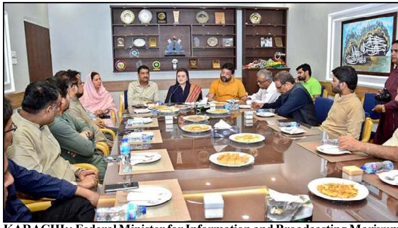
KARACHI: Federal Minister for Information and Broadcasting Mariyum Aurangzeb in a meeting with Karachi Press Club Member Governing Body during her visit to Karachi Press Club.

operate on the same track, then why the railway authorities were demanding value of the land," he questioned. The chief minister directed the DS Railways, present in the meeting, to resolve the issue and give the go-ahead to the provincial authorities so that it could be communicated to the Chinese authorities to initiate the KCR project. It was pointed out that the National Railways Administration (NRA), China required to conduct an updated feasibility study of the KCR Project. At this the P&D Chairman told the CM that the feasibility study has been done and sent to Chinese authorities. The chief minister said that now the Chinese authorities have to make a Framework agreement to start the project.