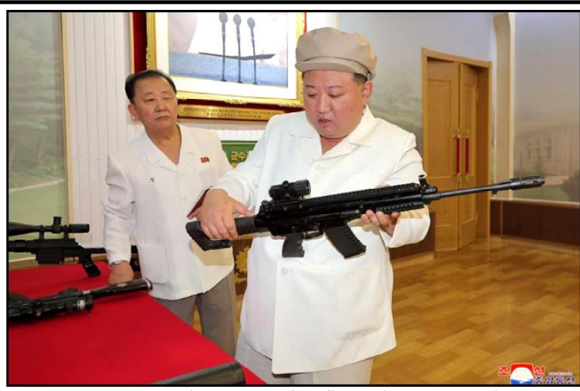
North Korean leader Kim Jong Un gives field guidance at a major weapon factory in this image released by North Korea's Korean Central News Agency.

Monitoring Desk RIYADH: A senior Ukrainian official said on Sunday that talks in Saudi Arabia to make headway towards a peaceful settlement of the war with Russia had been productive, but Moscow called the meeting a doomed attempt to swing the Global South behind Kyiv. More than 40 countries, including China, India, the United States, and European countries, but not Russia, are taking part in the Jeddah talks that are expected to end on Sunday without any written concluding statement. Ukraine and its allies have said the talks are an attempt to secure broad international support for principles that Kyiv wants to be the basis for peace, including the withdrawal of all Russian troops and the return of all Ukrainian territory to its control. President Volodymyr Zelenskyy has said he wants a global summit to take place based on those principles later this year. Eighteen months after Russia invaded Ukraine, any prospect of direct peace talks between Kyiv and Moscow appears remote.