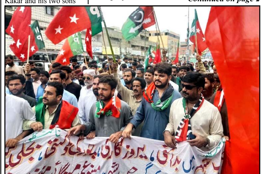
HUB: Activists of National Party are holding protest demonstration against massive unemployment, increasing price of daily use products and inflation price hiking, in Hub.