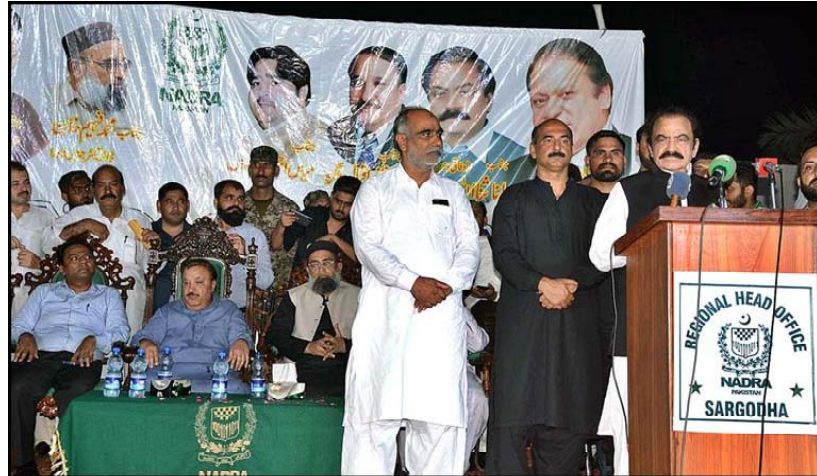
FAISALABAD: Interior Minister Rana Sana Ullah Khan is addressing a public gathering during inauguration of Nadra Registration Centre at Union Council 117 Dhanola.