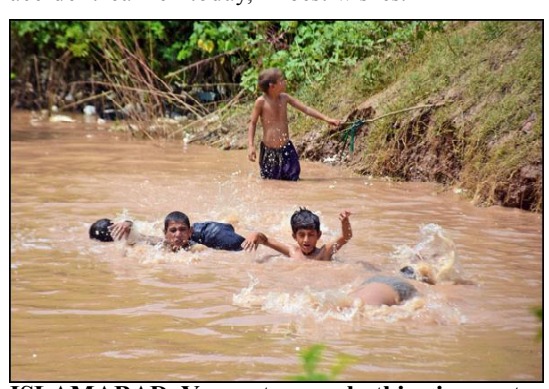
ISLAMABAD: Youngsters are bathing in a water pond alongside road in Federal Capital.

As news of the accident spread, fans and well-wishers flooded social media with messages of concern and support. They sent their heartfelt prayers and best wishes.