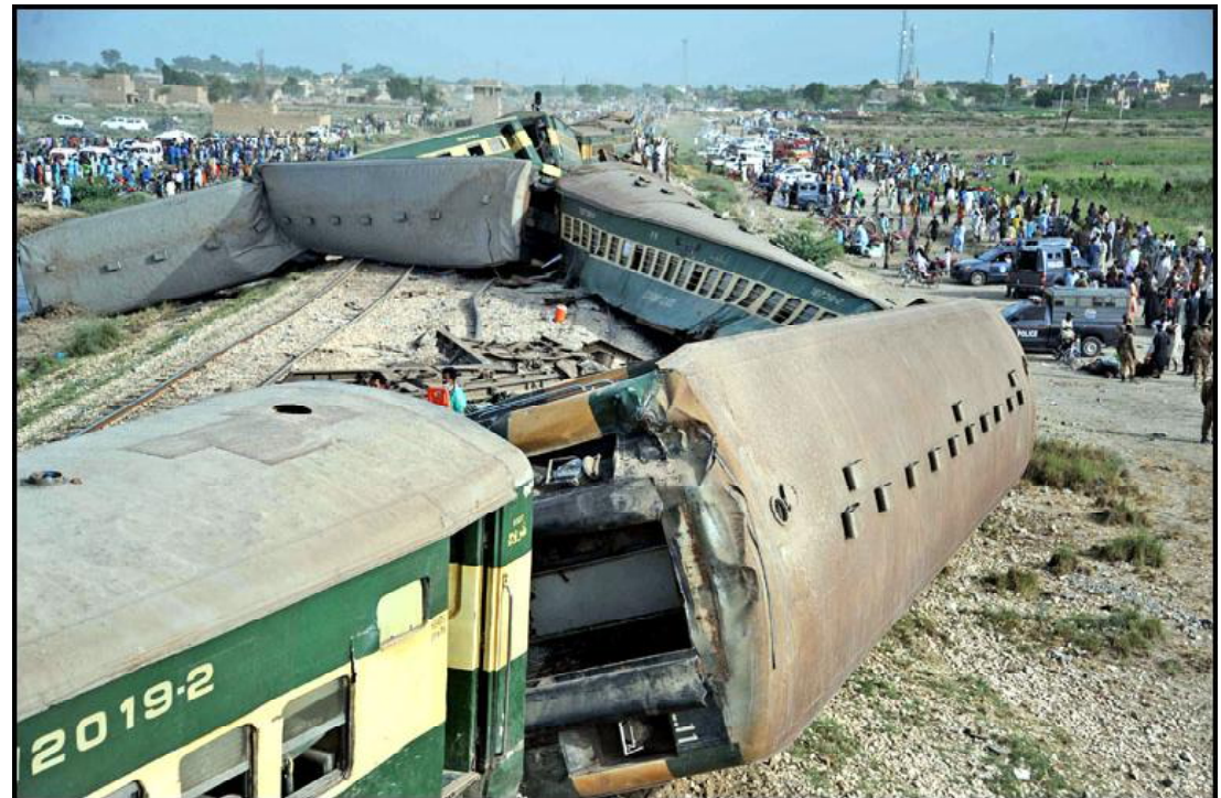
NAWABSHAH: A large numbers of people gathered at the accident site following the derailment of a Hazara Express in Nawabshah

tion, dozens of cars, tractors, rickshaws and motorcycles were seen parked on a road that runs alongside the track at the site of accident. Volunteers were witnessed through a canal that separates the road from the railway line to help, and lifting the injured to get them assistance. Some passenger compartments were upright but off the tracks, while others lay on their side, mangled steel from the undercarriage