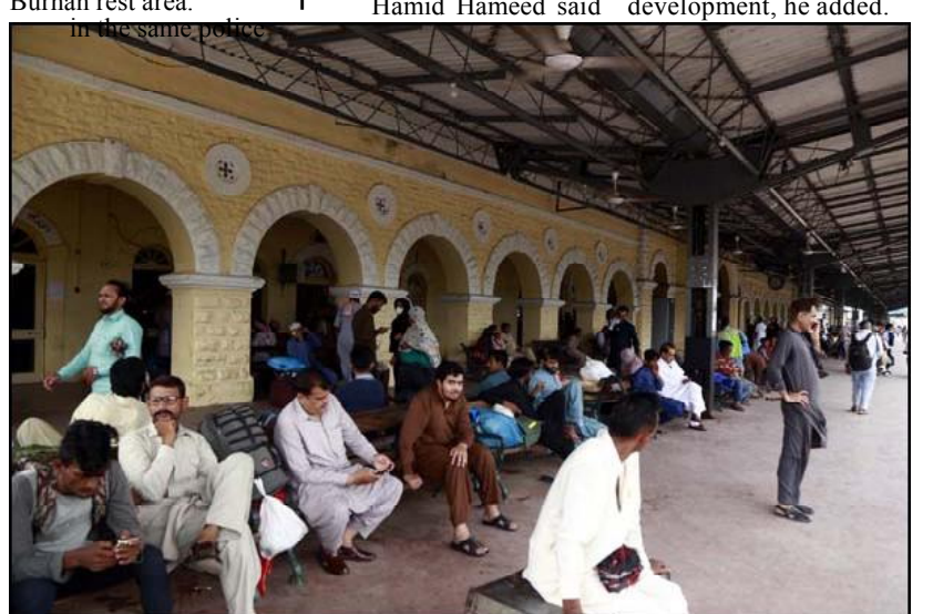
KARACHI: Passengers sit worried at platform as trains are late from their original schedules after a Hazara Express accident near Nawabshah, at Cantt Station in Karachi.

The details of approved schemes had been submitted to the provincial government. The most important project presented to the provincial government was the reconstruction of 6.5-km Old GT Road passing through Sahiwal city, in which 2.2 km of single-track road would be made dual carriage-way at a cost of Rs 1.73 billion, and the entire road would be carpeted.