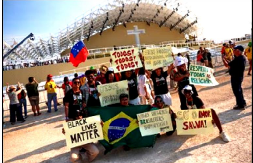
A group of people shows posters in front of the Parque Tejo stage for the XXXVII World Youth Day, in Lisbon, Portugal.

Monitoring Desk WARSAW: Exiled opponents of President Alexander Lukashenko met in Poland on Sunday, on the eve of the third anniversary of their unsuccessful post-election protests, to display unity and plan strategy including the issuance of "New Belarus" passports. Set up in August 2022 by Sviatlana Tsikhanouskaya, the self-declared government-in-exile has opened more than 20 alternative embassies and information centres abroad. Tsikhanouskaya, 40, a former English teacher who fled after running against Lukashenko in a 2020 vote.