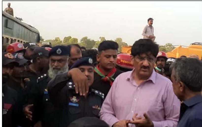
NAWABSHAH: Sindh Chief Minister, Syed Murad Ali Shah visit site after a train derailed as rescue operation is underway, at Sarhari Railway Station.