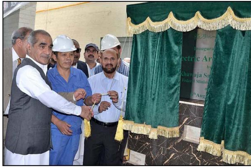
LAHORE: Railway Minister Khawaja Saad Rafique Inaugurate Steel Shop at Mughalpur Railway workshop.

He said the region was too vulnerable to climate change impacts, including erratic monsoon patterns, droughts, floods, and cyclones. These factors were resulting in crop failures, livestock losses, and disruptions in food production and distribution systems, exacerbating food insecurity, he added.