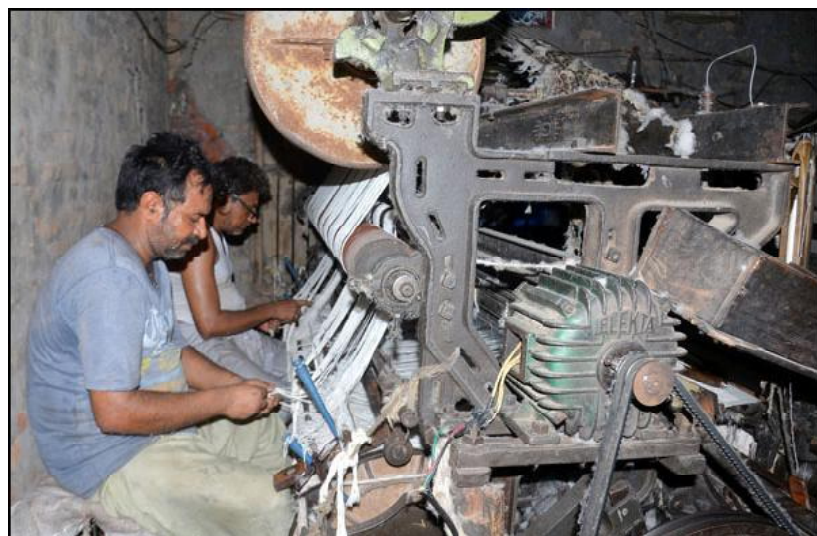
FAISALABAD: Workers are busy in their work on power loom in a local factory.