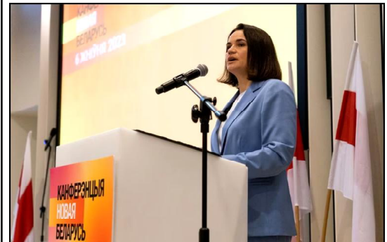
Belarus' exiled opposition leader Sviatlana Tsikhanouskaya gives an opening speech during the New Belarus conference in Warsaw, Poland.

Kim praised the factory's efforts to employ "scientific and technological measures" to improve the quality of shells, reduce processing times for propellant tubes and increase manufacturing speed, but also called for the need to develop and produce new types of shells.