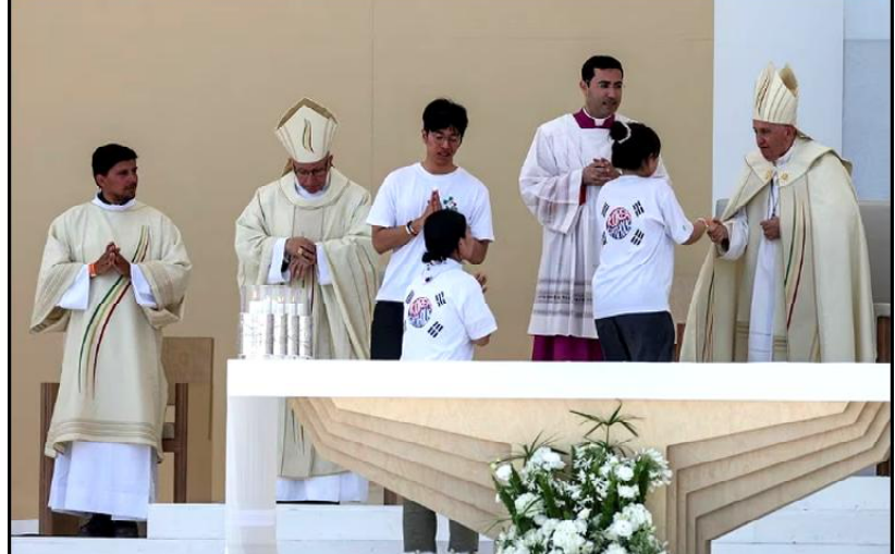
South Korean pilgrims greet Pope Francis after he announced the city of Seoul, South Korea, the next celebration of the World Youth Day (WYD) 2027, at the end of the Holy Mass on the last day of World Youth Day (WYD) at Parque Tejo in Lisbon, Portugal.

Monitoring Desk MOSCOW: Former Russian President Dmitry Medvedev on Saturday suggested Moscow would launch more strikes against Ukrainian ports in response to Kyiv's attacks on Russian ships in the Black Sea, and threatened to hand Ukraine "an ecological catastrophe". Medvedev, who is deputy chairman of Russia's Security Council, a body chaired by President Vladimir Putin, spoke after Ukrainian sea drone attacks on a Russian warship in the port of Novorossiysk, and against a tanker near Crimea, which Russia annexed from Ukraine in 2014. Putin chaired a meeting of the Security Council on Friday which Medvedev attended following the attack on Novorossiysk, in which the Olenegorsk Gornyy, a Russian Navy landing ship, was reported to have been badly damaged. The United Nations and some Western and African countries have urged Russia to return to the grain deal.