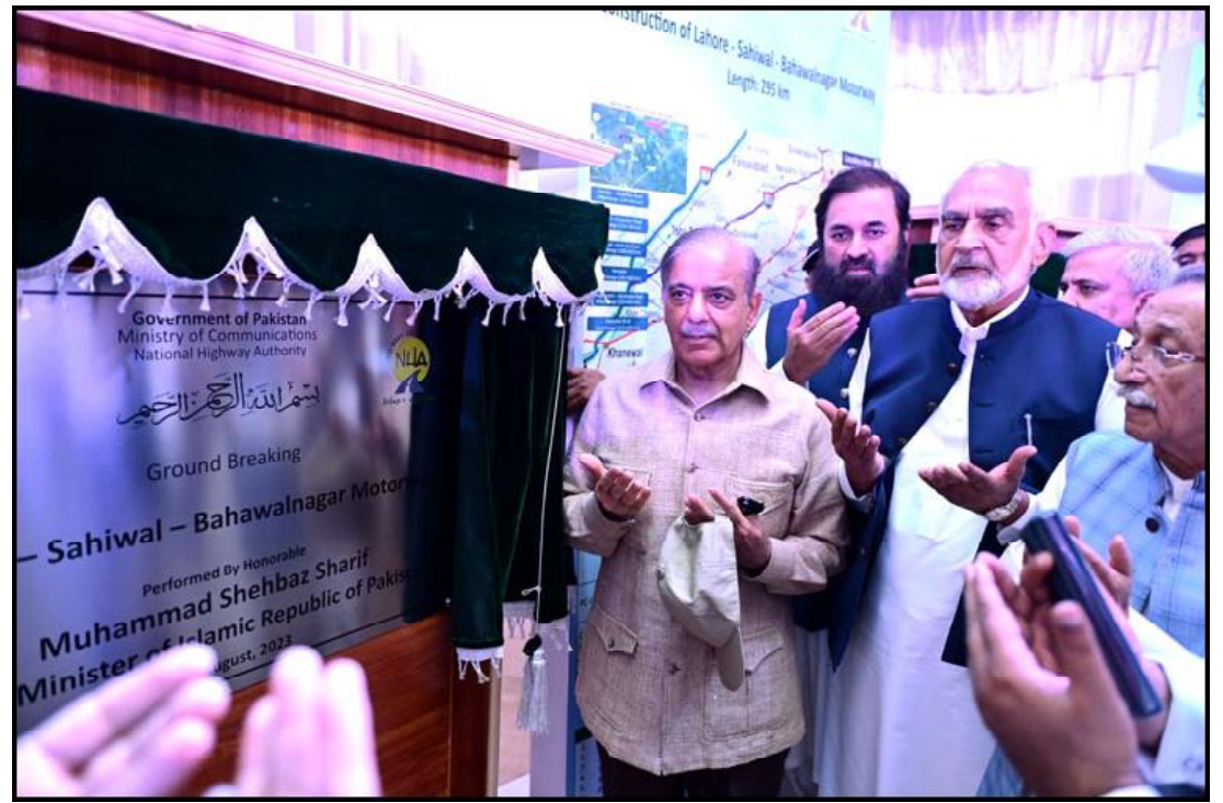
Prime Minister Muhammad Shehbaz Sharif unveils a plaque to mark the ground breaking of Lahore-Sahiwal-Bahawalnagar moterway in Kasur.

The Supreme Court in its judgment, dated 06.06.2023, had interpreted the word 'harassment' by elaborating that harassment had two components, first pertained to sexual favors and the second was about creating a hostile or offensive working environment.