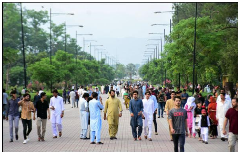
ISLAMABAD: large numbers of people are arrive to enjoying at Lake view Park during Sunday Holiday in Federal Capital.

Experiments confirmed that a particular strain of Delftia tsuruhatensis, which has been named TC1, was responsible for the loss of infectivity.