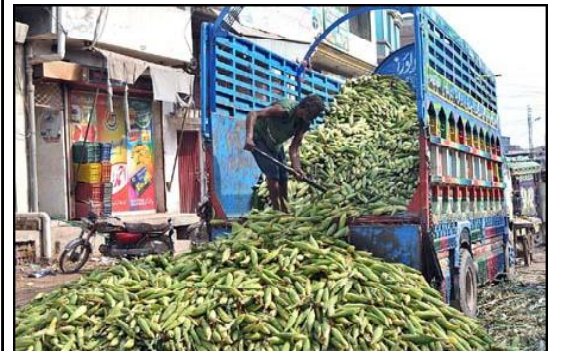
MULTAN: Labourer is busy unloading corn cobs from a delivery truck at the vegetable market.