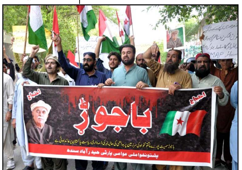
HYDERABAD: Activists of Pashtunkhwa Mili Awami Party (PKMAP) are holding protest demonstration against Bajaur Blast, at Hyderabad press club.

To a question, she said that the public cannot be hoodwinked every time, Imran Khan incited violence to avoid the law, provoked his workers who attacked the police, rangers and state institutions. He even used children and women as human shields to avoid arrest, she remarked.