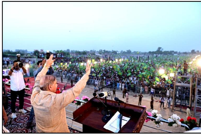
Prime Minister Muhammad Shehbaz Sharif addressing a public gathering in Kasur.