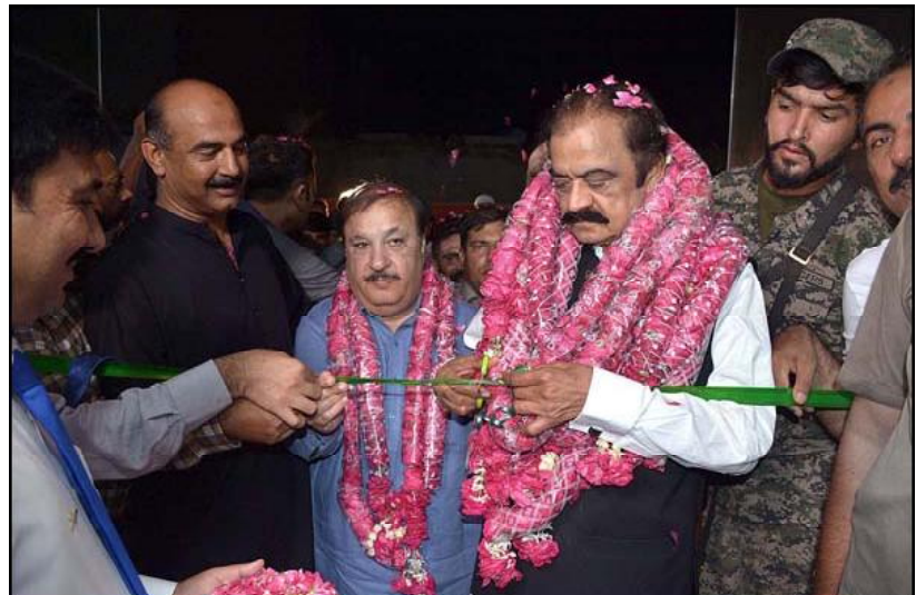
FAISALABAD: Interior Minister Rana Sana Ullah Khan is cutting ribbon to inaugurate Nadra Registration Centre at Union Council 117 Dhanola.

that Imran Khan failed in his nefarious designs as people recognised his true face on May 9, adding that Imran Khan was a hypocrite as he dubbed others as looters but at the same time he plundered national wealth through his cronies. He said that Imran Khan enjoyed power for four years but due to ill-conceived policies of his government, the country mired into multifaceted crises and people experienced its consequences badly. The SAPM said the PML-N always introduced pro-people policies for national development. It steered the country out of crises in 2013 when the menace of load-shedding and terrorism were afflicting the nation. Mian Nawaz Sharif not only controlled load-shedding and terrorism but also put the country on the road to progress and prosperity, he recalled. Now, Pakistan was again passing through a critical phase. If masses repose confidence in the PML-N again during upcoming general election, it would not only overcome the crises but also restart national development, he added.