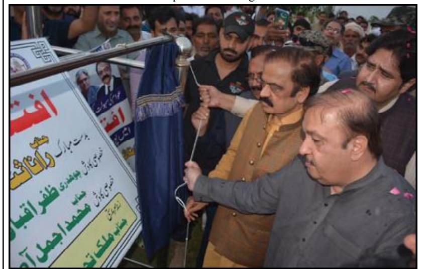
Federal Minister for interior, Rana Sanaullah Khan, inaugurating various projects of Electricity supply to sadhar, Faisalabad.

He underscored the significance of mutual collaboration, given that both Pakistan and Malaysia are integral partners in the Belt and Road Initiative (BRI), with Pakistan implementing the China-Pakistan Economic Corridor (CPEC) under the BRI framework.