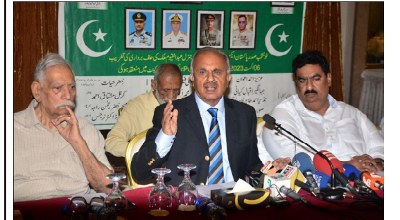
RAWALPINDI: President Ex-Servicemen Society Rtd Gen Abdul Qayyum Abdul Qayyum addressing during a ceremony title Pakistan Day.

The finance minister also revealed that a minister from the previous government had caused harm to Pakistan International Airlines (PIA). He asserted that reforms were being implemented to enhance aviation.