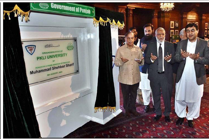
LAHORE: Prime Minister Muhammad Shehbaz Sharif offering dua after unveiling plaque during the groundbreaking ceremony of PKLI University and Launching of the National Hepatitis C Elimination Campaign.

The PKLI had now Rs 15 billion in the trust fund which would help in providing free treatment to the poor people, he added. He observed that previously, they used to send liver disease patients to other neighbouring countries. PKLI was established in the country which entertained patients irrespective of class and without discrimination, he said, adding it was also an essence for the creation of Pakistan for which Quaid and a large number of people gave huge sacrifices. He regretted that the poor people in the country suffered while the rich had all the resources to get treatment for themselves at the best facilities in the world. The prime minister said during 2018, about 26 Hepatitis C filter clinics were established in the province under the umbrella of PKLI where patients were treated with great care and with free medicines.