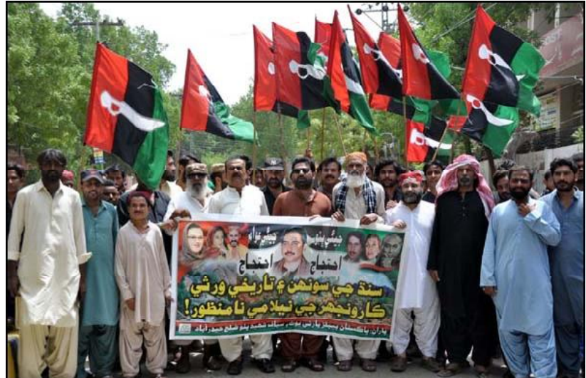
HYDERABAD: Activists of Peoples Party Shaheed Bhutto (PPP-SB) are holding protest demonstration against the auction and excavation of Karoonjhar, at Hyderabad press club.

Responding to problems in the areas, he stated that the government should increase number of medical professionals as some people were facing health complications. Similarly, the availability of fodder for cattle should be managed properly and the administration should provide "Wanda" to feed animals as due to flood, there was a shortage of fodder for cattle.