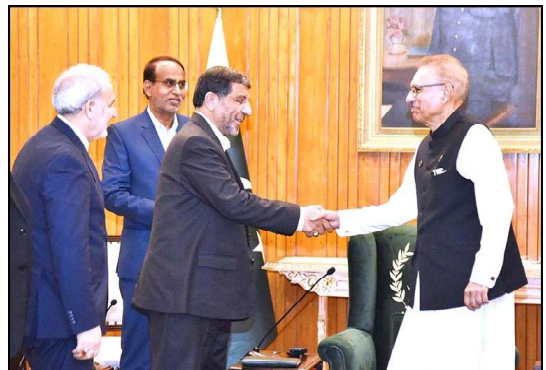
ISLAMABAD: President Dr Arif Alvi welcomes the Iranian Minister for Cultural Heritage, Tourism, and Handicrafts, Syed Ezzatollah Zarghami, at Aiwan-e-Sadr.