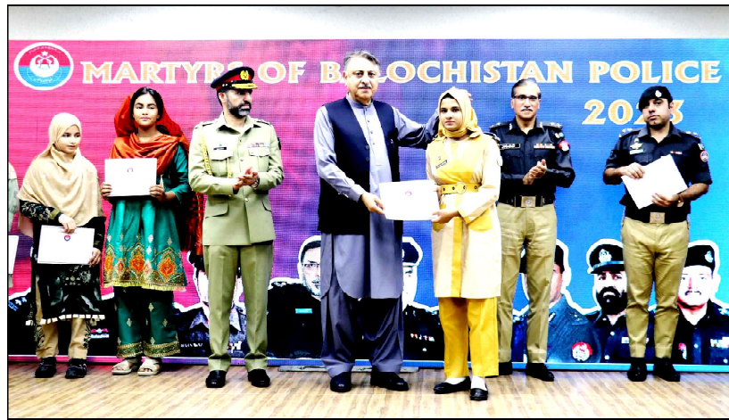
QUETTA: Governor Balochistan Malik Abdul Wali Khan Kakar distributing scholarship awards among heirs of Shahuda on eve of Youm-e-Shahuda-e-Police

Abusing its G-20 presidency, he said, India organized a meeting of the group on tourism in Srinagar in May amid extraordinary security, but nothing was "normal" there, noting a UN Rapporteur comment that India was "seeking to normalize...military occupation."