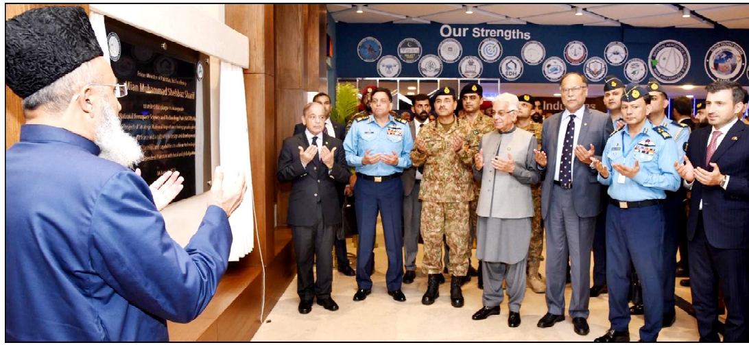
RAWALPINDI: Prime Minister Muhammad Shehbaz Sharif along with Services Chiefs and Federal Ministers inaugurating National Aerospace Science and Technology Park