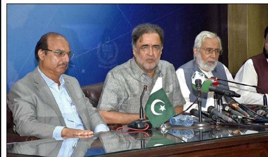
ISLAMABAD: Incumbent Advisor to Prime Minister on Kashmir Affairs, Qamar Zaman Kaira addresses press conference.

The Advisor to the Prime Minister said the Kashmir dispute was not an issue between Hindus and Muslims, rather it was a just freedom cause of the people residing over there. Kaira regretted that India is giving the impression that Kashmir is an issue between Hindus and Muslims through propaganda. He said that in that regard, the resolution will be presented in the National Assembly session on Monday. "We are proud of our friendship with China", he said, adding that China has also expressed concerns over the Indian move of August 5.