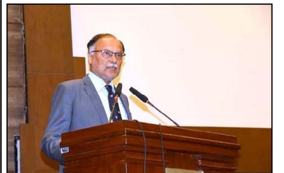
ISLAMABAD: Federal Minister for Planning Ahsan Iqbal addressing at NUTECH.

marks a significant milestone in enhancing educational facilities in Pakistan. Covering an expansive area of 365,000 square meters, the campus features 15 faculties across various disciplines including Sciences, Engineering, Arts, Economics, Linguistics, Islamic Studies, and Law. It also includes accommodation for students with six hostels and several other prominent buildings such as an auditorium, a grand mosque, and a services center. The primary objective of this project is to contribute to the development and expansion of the university, enabling a higher influx of students and providing them with modern facilities. The project includes the provision of technical laboratories, classrooms, and equipment for administrative departments.