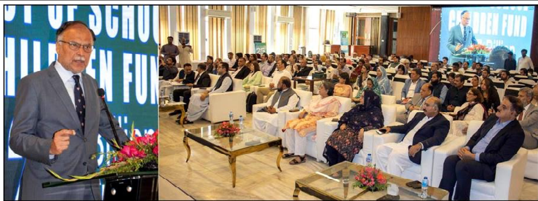
ISLAMABAD: Federal Minister for Planning Ahsan Iqbal launches Rs. 25 Billion Performance-based Challenge Fund for Out-of-School Children and Early Childhood Education.