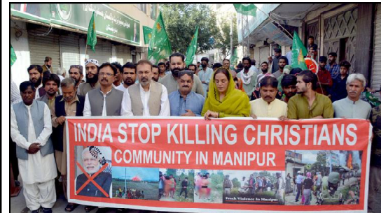
QUETTA: Workers of Pakistan Muslim League (N) holds protest rally against India, in Provincial Capital.