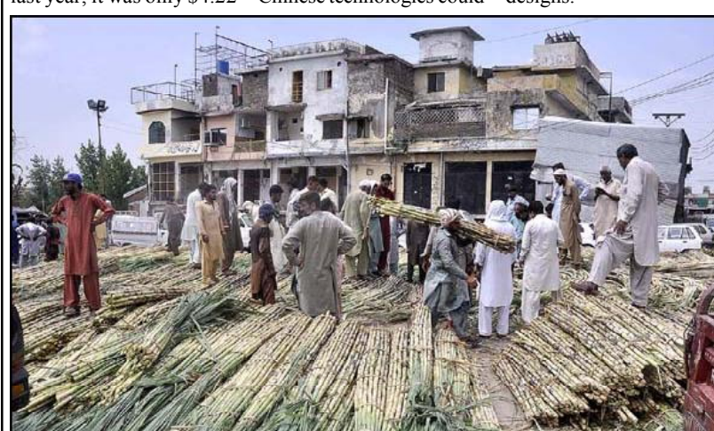
ISLAMABAD: Laborers carrying a bundle of sugarcane after off load from a delivery truck at fruit and vegetable market.

Answering a question that how Pakistan can convert from traditional sports goods to innovative designs.