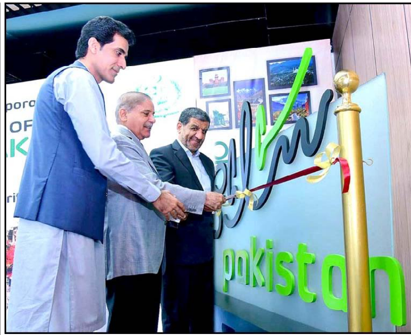
ISLAMABAD: Prime Minister Muhammad Shehbaz Sharif inaugurating Pakistan's tourism brand 'Salam Pakistan'.

In a message on the Youm-e-Istehsal to be observed on August 5, 2023, he said, "It is Pakistan's abiding commitment and promise to our Kashmiri brothers and sisters that we will echo their voices, at every forum until the world takes action and urges India to end its egregious human rights violations and forcible occupation of IIOJK, undo all unilateral and illegal measures it has taken since 5 August 2019, and take necessary steps to carry out a fair and impartial plebiscite in accordance with the United Nations Security Council resolutions."