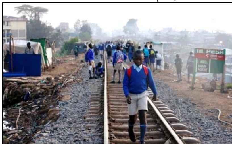
A schoolboy walks along the Kenya-Uganda railway line during the reopening of schools in Kibera slums of Nairobi, Kenya.

Commodity prices have been falling since hitting record highs last year in the wake of Russia's invasion of Ukraine. Disrupted supplies from the two countries exacerbated a global food crisis because they're leading suppliers of wheat, barley, sunflower oil and other affordable food products, especially to nations in parts of Africa.