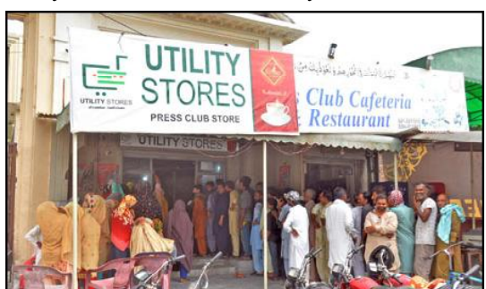
FAISALABAD: Deserving people stand in long queue outside utility store at District Council Chowk to get grocery on subsidized prices in City.

On the matter of visa-free access to Malaysia, the Envoy said that visa free facility.