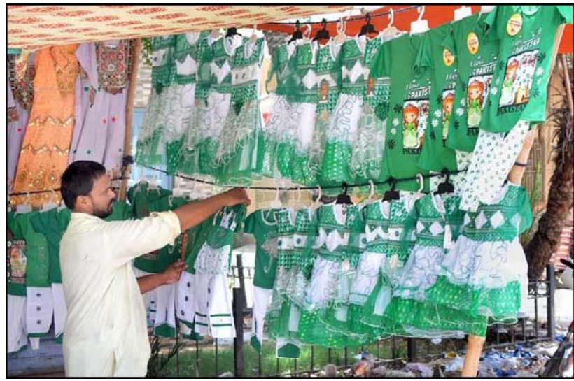
MULTAN: Vendor is busy arranging and displaying national flag color children's garments to attract customers at his roadside setup for the upcoming Independence Day celebrations.

To avail this service, customers can dial *2445# activation code