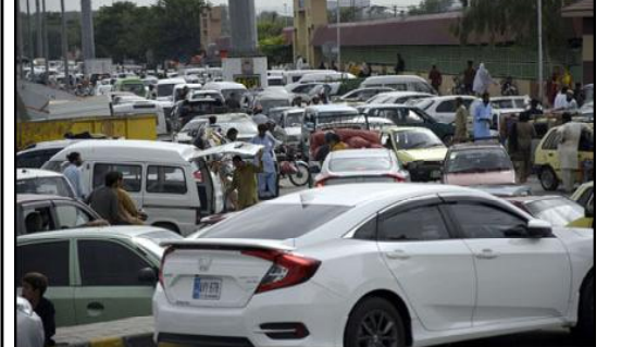
ISLAMABAD: A large numbers of people parked their vehicles outside Friday Weekly Bazaar at Peshawar Morr area at sector H-9 in Federal Capital.

ISLAMABAD (APP): The Federal Flood Commission (FFC) has said that River Indus continues to flow in medium flood at Guddu and Sukkur with falling trend. According to daily FFC report on Friday, owing to heavy rainfall in the upper catchment areas above rim station during the last two weeks or so, Eastern Rivers Ravi & Sutlej have been experiencing mild category floods since July 27, 2023. The flows have receded gradually and at present, Rivers Ravi & Sutlej at Suleimanki & Islam are in low flood. Other major Rivers i.e. Kabul, Jhelum & Chenab are discharging normal flows. Tarbela and Mangla Reservoirs are at 1542.29 feet and 1232.90 feet respectively. Total live storage attained to date is 90.24% as compared to 54.31% last year. Yesterday's depression over North Chattisgarh (India) has now moved slightly Westwards, converted into monsoon low and lies over Northeast Madhya Pradesh (India). Besides, trough of Westerly Wave continues to prevail over Northeastern Afghanistan with Seasonal Low lies over Northern Balochistan. These meteorological conditions are bringing light to moderate moist currents from Arabian Sea which are penetrating into upper parts of Pakistan.