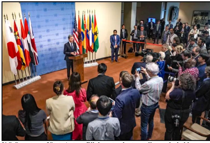
U.S. Secretary of State Antony Blinken stands at a podium as he holds a press conference, during a meeting of the United Nations Security Council where he presides as president.

On Sunday, Russian-installed authorities in Crimea said 25 Ukrainian drones were destroyed over the peninsula.