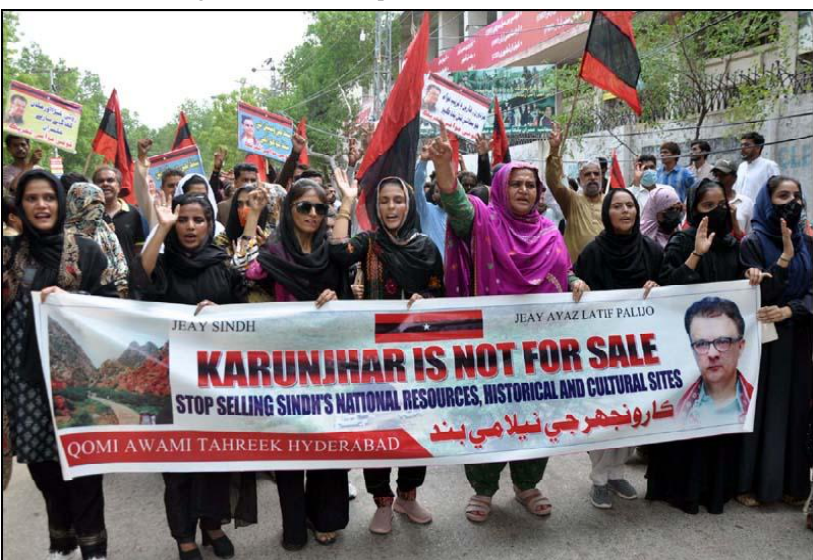
HYDERABAD: Activists of Qaumi Awami Tehreek are holding protest demonstration against auction of Karoonjhar Mountains, at Hyderabad press club.

and reviewed the performance. Syed Sardar Shah also met people present in the secretariat, listened to their problems and issued on-the-spot instructions in this regard.