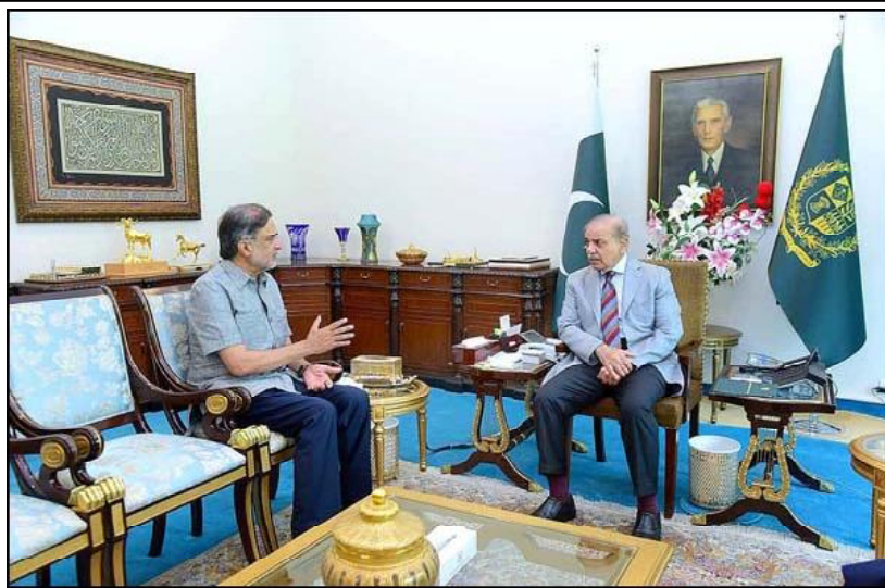
ISLAMABAD: Advisor to Prime Minister on Kashmir Affairs and Gilgit Baltistan Qamar Zaman Kaira calls on Prime Minister Muhammad Shehbaz Sharif.

ISLAMABAD (Online): Rain with wind and thundershower is expected in Kashmir, Gilgit-Baltistan, Islamabad, Pothohar region, northeast Punjab and upper Khyber Pakhtunkhwa during the next twelve hours. Heavyfalls may also occur at few places in upper Khyber Pakhtunkhwa, Pothohar region, northeast Punjab and Kashmir during the forecast period. Hot and humid weather is expected elsewhere in the country. Temperature of some major cities recorded this morning: Islamabad twenty-seven degree centigrade, Lahore thirty-one, Karachi and Peshawar twenty-nine, Quetta twenty-two, Gilgit twenty, Murree eighteen and Muzaffarabad twenty-five degree centigrade.