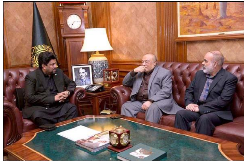
KARACHI: Sindh Governor Kamran Khan Tessori meets with Iran's Deputy Foreign Minister Mahdi Safari and Governor of Sistan Muhammad Kumari at the Governor's House.

In response to inquiries about the Islamia University Bahawalpur incident, Chief Minister Naqvi said that a judicial commission will be formed and the Punjab government will submit a detailed report to the commission.