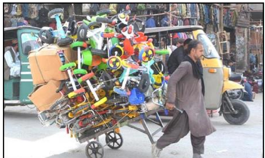
QUETTA: A man push wheelbarrow loaded with delivery stuff in local market.

The SPI for consumption groups from Rs 17,732-22,888, Rs 22,889-29,517, Rs 29,518-44,175 and above Rs 44,175 increased by 0.92 percent, 0.97 percent, 1.11 and 1.53 percent respectively.