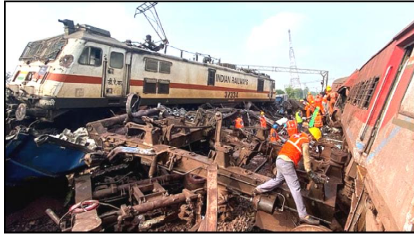
Rescue workers sift through wreckage at the accident site of a three-train collision near Balasore, about 200 km (125 miles) from the state capital Bhubaneswar.

While Russian exports of food and fertilizer are not subject to Western sanctions imposed after Russia's February 2022 invasion of Ukraine, Moscow has said restrictions on payments.