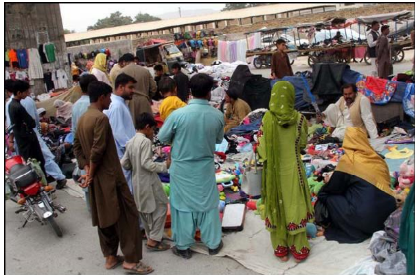
QUETTA: People purchase used goods due to price hiking, at makeshift weekly market located on Benazir Flyover road in Quetta.