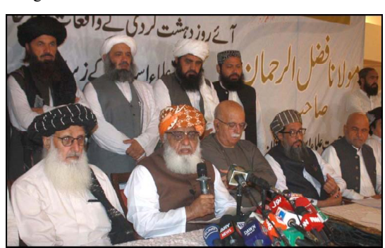
PESHAWAR: Jamiat Ulema-e-Islam (JUI-F) Chief, Maulana Fazal-ur-Rehman talking to media persons after Grand Tribal Jirga, in Peshawar.