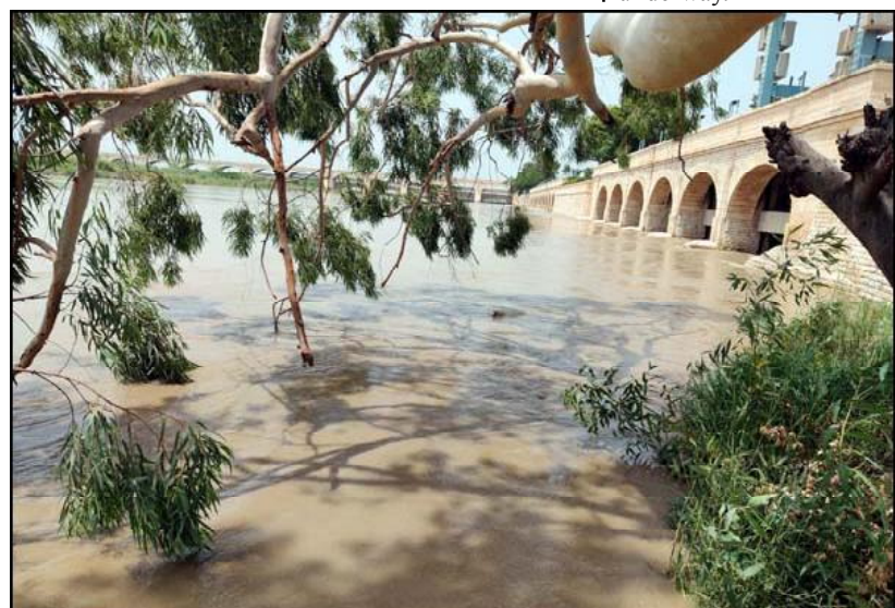
SUKKUR: Water level increases while high grade flood water reaches at Sukkur Barrage into River Indus due to heavy downpour of monsoon season, in Sukkur.

SWABI (APP): Unknown assailants killed shopkeeper by indiscriminate firing in village Adina of District Swabi here on Friday.