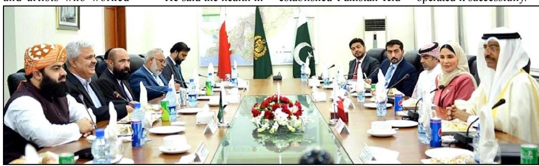
ISLAMABAD: Federal Minister for Communications and Postal Services, Maulana Asad Mehmoed in a meeting with Mohammad Bin Thamer Al Kaabi, Minister of Transport and Telecommunication, The Kingdom of Bahrain, to discuss cooperation in postal service and road networks.