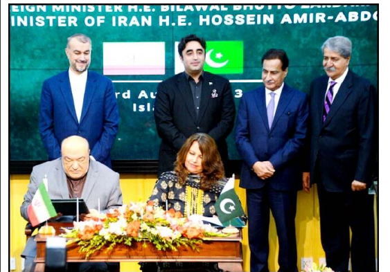
Foreign Minister Bilawal Bhutto-Zardari and Iran Foreign Minister Hossein Amir Abdollahian witnessing signing of memoranda of understanding between Pakistan and Iran in Islamabad.