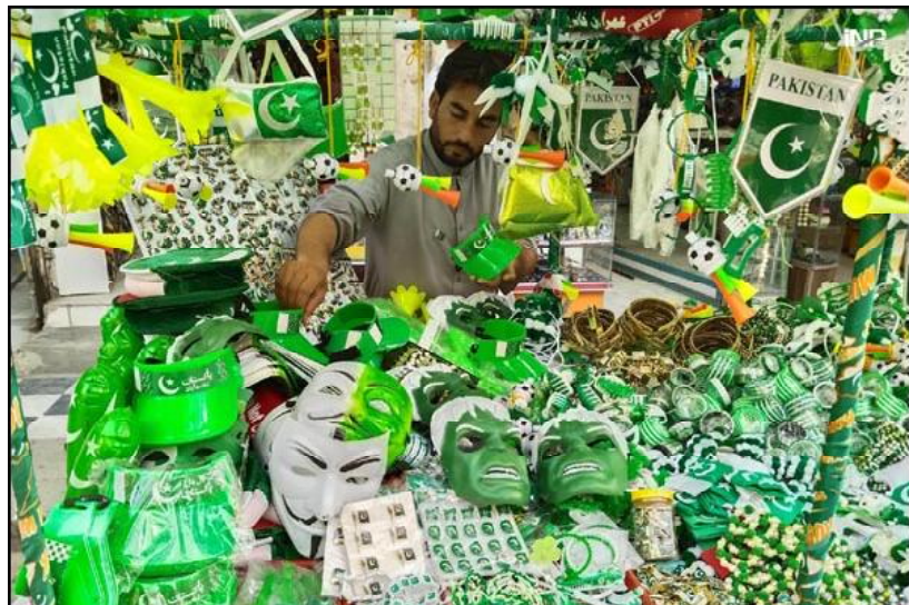
PESHAWAR: A vendor displaying national flags color decoration and wearing stuff to attract customers at Qassa-Khwani Bazaar on ahead of 76th Independence Day of Pakistan on 14 August.

under review against the exports of US$ 2201.080 million during last year, showing a decline of 10.66 percent, SBP data revealed. Among other countries, Pakistani exports to Germany stood at US$ 1600.172 million against US$ 1751.423 million last year, showing a decrease of 8.63 percent while the exports to UAE were recorded at US$ 1475.809 million opposed US$ 1848.991 million last year. During July-June (2022-23), the exports to Holland were recorded at US$ 1446.927 million against US$ 1499.671 million whereas the exports to Afghanistan stood at US$ 521.999 million against US$ 522.781 million. Pakistan's exports to Italy were recorded at US$ 1151.448 million against the exports of US$ 1087.434 million.