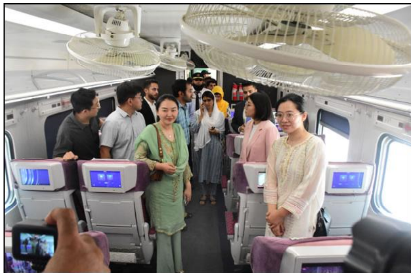
ISLAMABAD: Aug 03- Members of Chinese delegation travelling by the coaches given by the Chinese government in connection with 10 years celebration of CPEC at Margalla Railway Station, in Federal Capital.