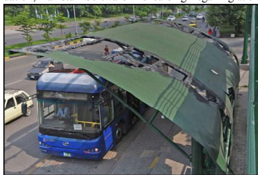
ISLAMABAD: A view of the broken shed of Blue Line Bus Stop at Express Way, which needs the attention of concern authority.

ISLAMABAD (APP): Minister for Overseas Pakistan and Human Resources Development Sajid Turi and Minister of State for Foreign Affairs Hina Rabbani Khar on Thursday co-chaired inaugural meeting of PM Steering Committee on Legal Migration Opportunities to European Union countries. The meeting was attended by SAPM Tariq Fatemi and representatives of NAVTTC, Overseas Employment Corporation, Overseas Pakistanis Foundation, Pakistan Square Export Board, Higher Education Commission, Federal Investigation Agency, TEVTA (Punjab) and NUML. The meeting reviewed progress and discussed opportunities as well as challenges. The steering committee stressed the need for better coordination on skills development and certification, language proficiency and importance of regulations. The participants also underscored the importance for curbing illegal migration.