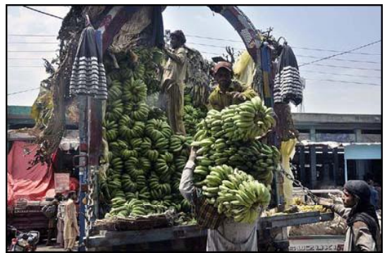
ISLAMABAD: Labourers busy in unloading bunches of bananas from a delivery truck at Fruit and Vegetable Market.

The "voluntary cut comes to reinforce the precautionary efforts made by OPEC Plus countries with the aim of supporting the stability and balance of oil markets," the energy ministry said. Announcing the cut following a June meeting of the 23-nation OPEC+ alliance, which also includes Russia, Saudi Energy Minister Prince Abdulaziz bin Salman noted that it was potentially "extendable". It followed a decision in April by several OPEC+ members to slash production voluntarily by more than one million bpd.