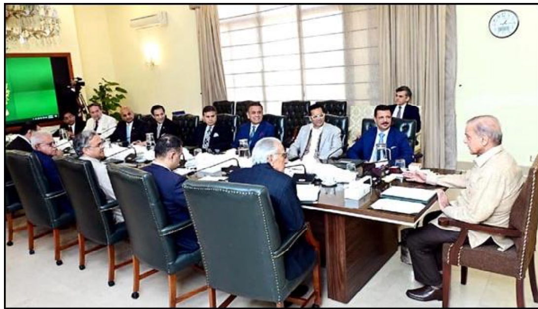
ISLAMABAD: A group of prominent Pakistani-American businessmen and entrepreneurs call on Prime Minister Muhammad Shehbaz Sharif.

approach. He said under the SIFC framework, the government was working on a comprehensive plan to attract investment in the five select fields of agriculture, information technology, energy, and defence production. He said the purpose of establishing the SIFC was to provide a one-window facility to the potential investors.