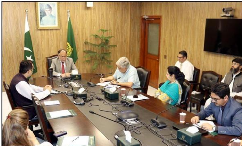
Federal Minister for Planning Development & Special Initiatives, Prof. Ahsan Iqbal chairs a meeting of Education Research Commission in Islamabad.

Senator Sherry Rehman in her keynote speech said, "We stand at the crossroads of history during this crucial decade leading up to 2030. Our people have been uprooted from their homes repeatedly due to the climate carnage, and in many areas, often when we start to rebuild, disaster strikes once more, pushing us into a recovery trap. Climate change has interrupted human history in ways that only World Wars and the nuclear bomb did, bringing the human race and those at the epicenter of the carnage in an arc of extreme vulnerability."