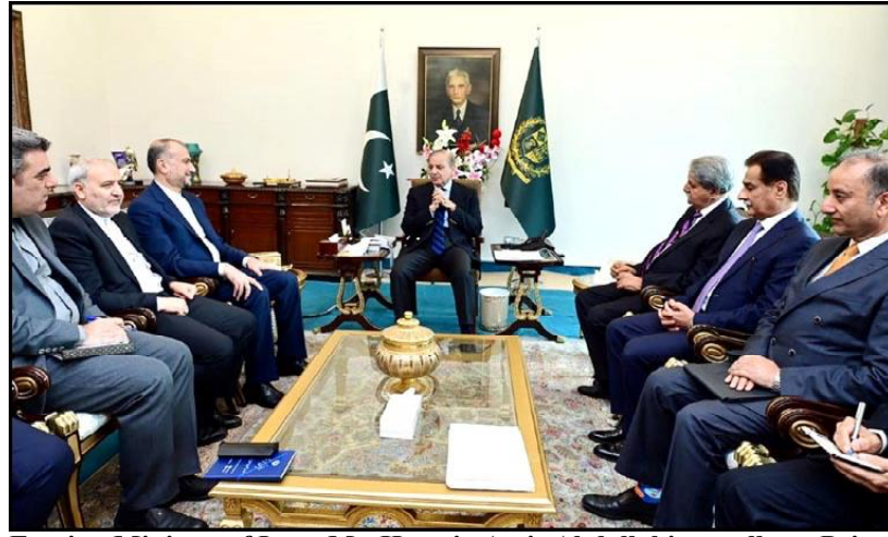
Foreign Minister of Iran, Mr. Hossein Amir Abdollahian, calls on Prime Minister Muhammad Shehbaz Sharif in Islamabad.

As per Provincial Disaster Management Authority (PDMA), death toll from recent monsoon rains and floods in different parts of Balochistan has risen to 16, including 8 men, 2 women and 6 children, while 24 persons have been injured.