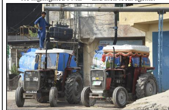
ISLAMABAD: Workers filling drinking water in their water tankers outside Ghori Town area due to drinking water shortage in Ghori Town, which needs the attention of concern authority.

ISLAMABAD (APP): Federal Minister Javed Latif on Thursday categorically said that the Pakistan Muslim League Nawaz (PML-N) is against any postponement of elections because it believes that for achieving a fresh mandate on timely elections is also essential for national unity. Talking to media, he asserted that his party firmly opposes any delay in the upcoming general elections, believing that the elections will undoubtedly benefit the country. While some people claim democracy has weakened in the past 15 months, he countered that the Pakistan Tehreek-e-Insaf (PTI) government had a deliberate agenda to undermine the democracy. He highlighted PML-N's commitment to the country by making bold decisions to safeguard the state and preserve democracy. He emphasized that the people place their hopes in former Prime Minister Nawaz Sharif as the only leader capable of leading the country towards prosperity and progress. He said Nawaz Sharif was ousted from power by international adversaries, working alongside local collaborators, due to his endeavors in fortifying Pakistan's defense and launching the game-changing China (Pakistan Economic Corridor (CPEC) projects. Similarly, he contended that former Prime Minister Zulfikar Ali Bhutto was executed through the involvement of international forces and their local agents.