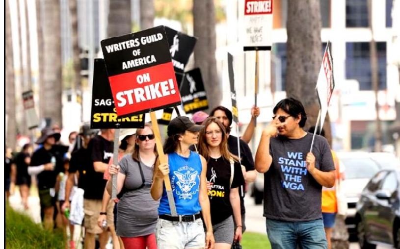
SAG-AFTRA actors and Writers Guild of America (WGA) writers walk the picket line during their ongoing strike outside Netflix, in Los Angeles, California, U.S.

Monitoring Desk NEW YORK: Russia has added Norway to its list of foreign states that have committed so-called "unfriendly" acts against Russian diplomatic missions, news agencies reported on Thursday. Countries on the list are limited in the number of local staff they can hire in Russia, with Norway restricted to 27, state news agency RIA Novosti said. Norway expelled 15 Russian diplomats for alleged spying in April, and Russia responded by ordering out 10 Norwegian diplomats.