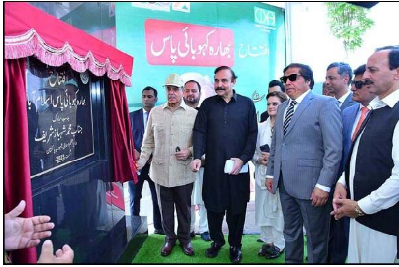
ISLAMABAD: Prime Minister Muhammad Shehbaz Sharif inaugurates Barakahu Bypass.