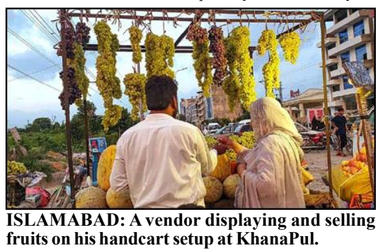
ISLAMABAD: A vendor displaying and selling fruits on his handcart setup at Khana Pul.

corporate farming the farmer's clusters would be established to start collaborative farming to enhance the output of all major and minor crops by adopting modern and innovative cultivation technologies and they would be enabled for purchasing of latest tools including tractors, combine harvesters and land levellers. The farmers would be given their due right through future market practice as it was protecting farmers' rights farming in the world, he said adding that they would also provide proper seeds and other agriculture inputs to enhance their farm income to alleviate poverty in the country.