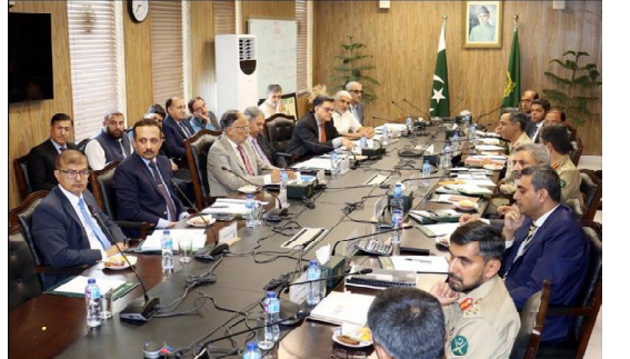
ISLAMABAD: The 67th meeting of the National Logistics Board (NLB). Chaired by Chairman NLB, the honourable Federal Minister for Planning, Development & Special Initiatives (PDSI), Prof. Ahsan Iqbal, the meeting was attended by other members of the apex logistics body.