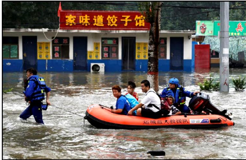
Rescue workers from Shanxi province evacuate people through floodwaters with a boat after the rains and floods brought by remnants of Typhoon Doksuri, in Zhuozhou, Hebei province, China.

It is unclear if Qin, who would be qualified to holiday at Beidaihe with the leadership since he retains the title of state councillor, will turn up. Qin has not been seen in public since June 25. One of Xi's last tasks before going on vacation was to instruct emergency responders to work harder at rescuing those affected by floods battering northern China as a result of Typhoon Doksuri. At least 100,000 people in the province where Beidaihe is located have been evacuated, but the resort itself has not been affected. Since the founding of the people's republic, current and retired party and government leaders have gathered for summer vacations at Beidaihe, 3-1/2 hours east of Beijing by car.