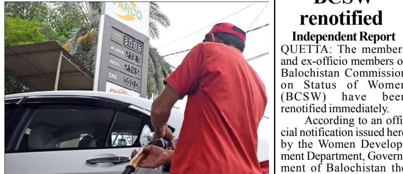
KARACHI: worker pumps petrol in a car at a fuel station, in Provincial Capital. As Pakistan announced an increase in petrol and diesel prices.