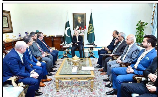
ISLAMABAD: A delegation of Barrick Gold led by CEO Mark Bristow calls on Prime Minister Muhammad Shehbaz Sharif.

FM said the prices of petroleum products were to be determined on previous night. The price of crude oil has gone up in international market. Consultation in this regard was made with Prime Minister and it was decided to pass on minimum possible burden to the masses. We are in agreement with IMF, he added therefore we cannot make such decision which lands the country in difficult situation.