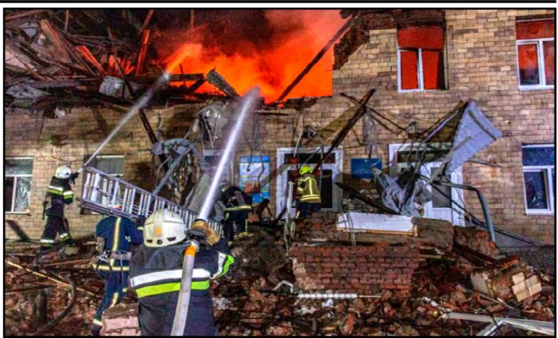
Rescuers work at a site of a building damaged by a Russian drone strike, amid Russia's attack on Ukraine, in Kharkiv, Ukraine.

Some analysts say that the moves reflect China's perception of increased external threats from the United States and its allies, and that Beijing is flexing its military muscle to send political messages. "The reason is simple: the world is not peaceful and the external environment that China faces continues to deteriorate," said Chinese military analyst Song Zhongping, noting the increasing intensity and frequency of Chinese drills. The US is also expanding regional deployments and tightening ties with longstanding allies and newer friends - sparking calls from Chinese officials that Washington should steer clear of China's coasts if dialogue between the two militaries is to resume. Drew Thompson, visiting senior research fellow at National University of Singapore's Lee Kuan Yew School of Public Policy, told Reuters that China's drills represent more of a political message than a military one. "Everything the PLA (People's Liberation Army) does is inherently political," Thompson said. "When the Chinese military conducts an exercise, it is showing force - it is bestowing or sending a message to other countries."