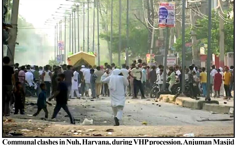
Communal clashes in Nuh, Haryana, during VHP procession. Anjuman Masjid set ablaze; 3 injured, 1 deceased. 2 home guards killed, dozen cops injured.