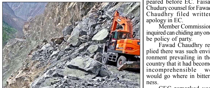
GILGIT: FWO workers busy in clearing block area of Juglote-Skardu road after land sliding during rain in city.