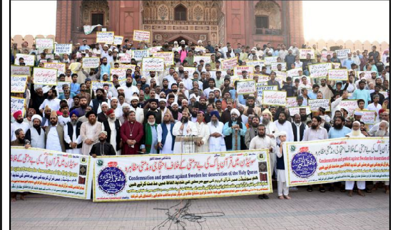
LAHORE: Activists of Majlis-e-Ulema Pakistan hold a protest against the burning of the Quran in Sweden, at Badshahi Mosque in Provincial Capital.