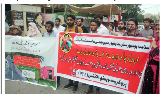
KARACHI: Activists of Progressive Youth Alliance hold a protest in favor of their demands outside press club in Provincial Capital.