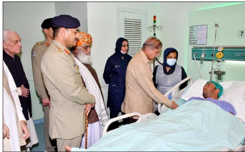
Prime Minister Muhammad Shehbaz Sharif and Chief of Army Staff General Syed Asim Munir visiting those injured in Khar (Bajaur) suicide blast in CMH Peshawar