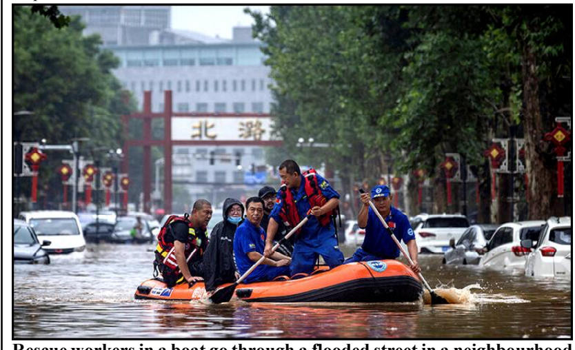
Rescue workers in a boat go through a flooded street in a neighbourhood where days of heavy rain from remnants of Typhoon Doksuri have caused heavy damage in Beijing, China.