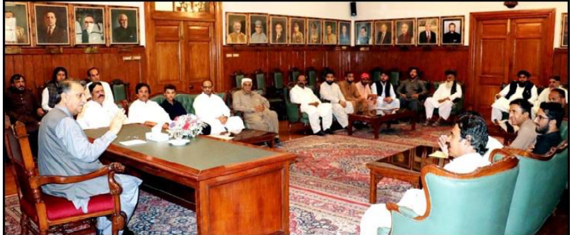
QUETTA: A delegation from different walk of life meeting with Governor Balochistan Malik Abdul Wali Khan Kakar

ISLAMABAD (APP): The National Assembly on Tuesday took up legislative business and passed three government bills as well as other legislative proposals sponsored by a private member. The House transacted the government business on private members' day after passage of the motion while private members' agenda was also taken up in routine. Moved by the Minister for Parliamentary Affairs Murtaza Javed Abbasi moved the Toshakhana (Management and Regulation) Bill, 2023 and the Pakistan Airports Authority Bill, 2023. Both bills were passed by the House as the Senate has already approved both legislative proposals. The Toshakhana Management and Regulation Bill 2023 passed by the house today envisaged that the existing and future gifts to be received in Toshakhana shall be disposed of through an open auction. The proceeds of such an auction shall be kept in a separate account and will be utilized for promoting female primary education in the most backward areas of the country. Three private members' bills passed by the House included the Promotion and Protection of Gandhara Culture Authority Bill, 2023; the Margalla International University Bill, 2023 and the Thar International Institute Bill, 2023.