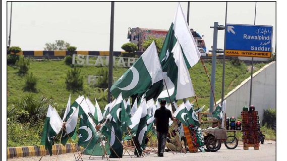
ISLAMABAD: A vendor displaying national flags to attract customers at Koral Chowk.

both countries is going to prosper further in the coming years," she said.