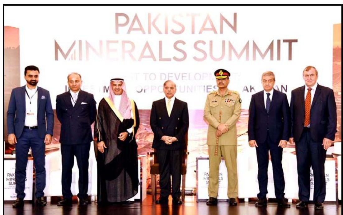
ISLAMABAD: Prime Minister Muhammad Shehbaz Sharif along with COAS General Syed Asim Munir and Foreign Dignitaries attends Pakistan Mineral Summit as Chief Guest.

ISLAMABAD (Online): Interior Minister Rana Sana Ullah along with delegation of Ulema has left for Iraq on 4 days visit. During his visit he will meet Iraqi interior minister, president and prime minister. Every year million of pilgrims travel to Iraq and they have to face difficulties in connection with their stay therein and acquisition of visa. Last year these problems had created crisis like situation. These matters will be discussed with Iraqi government and an agreement will also be executed in this regard. Interior minister will also inaugurate machine readable passport system for Pakistanis settled in Iraq in Pakistan embassy in Iraq.