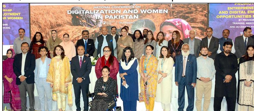
ISLAMABAD: Federal Minister for Human Rights, Riaz Hussain Pirzada along with National Commission on the Status of Women (NCSW) Chairperson Nilofar Bakhtia in a group photo with participants' during closing ceremony of Pakistan Framework on Digitization and Woman.

vention and protection of citizens' lives and property. He further informed that the delegation that Islamabad Capital City Police Officer (ICCCO) Dr. Akbar Nasir Khan, after assuming office, extended the coverage of the Safe City Project to different areas of the city and installed 900 more cameras on the special interest and orders of the Federal Interior Minister Rana Sana Ullah Khan. The Safe City services have been integrated with important commercial centers, buildings, metro bus stations, shopping malls, and private housing societies across the city, he added. SSP Safe City further said that facial recognition cameras have been installed on the city's entry and exit points, which play a significant role in identifying suspicious elements. The SSP Safe City presented an honorary shield to the delegation. The delegation appreciated the successful visit and expressed special thanks to the CPO Safe City/Traffic.