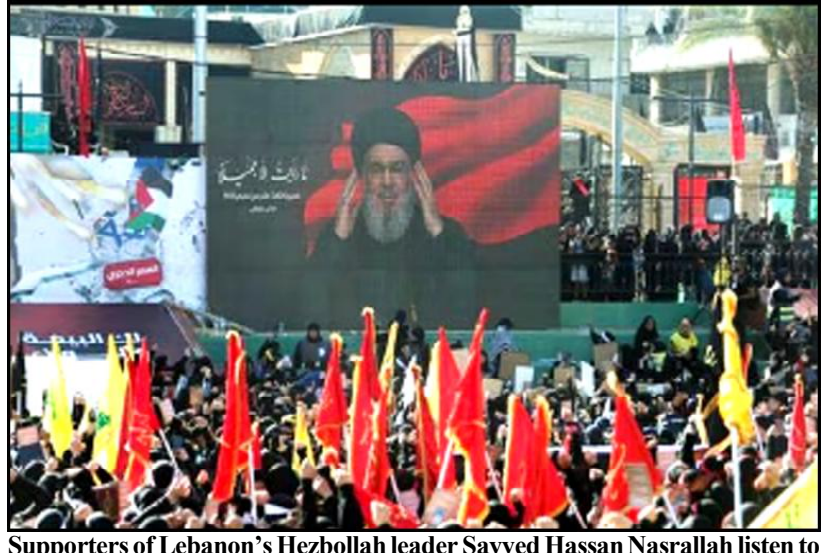
Supporters of Lebanon's Hezbollah leader Sayyed Hassan Nasrallah listen to him as he addresses them through a screen during a rally marking Muharram, a period of mourning for Shi'ite Muslims around the world, in Nabatiyeh, southern Lebanon.