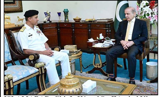
ISLAMABAD: Chief of Naval Staff Amjad Khan Niazi calls on Prime Minister Muhammad Shehbaz Sharif.

ISLAMABAD (APP): President Dr Arif Alvi on Tuesday telephoned Governor of Khyber Pakhtunkhwa Haji Ghulam Ali and expressed condolence over deaths in the recent suicide attack in Bajaur district. The president conveyed his condolences to the KP governor and the people of the province over the loss of precious lives. Talking to the governor, the president said Islam did not allow such heinous acts as well as terrorist attacks. He said the people of KP province had rendered immense sacrifices against terrorism. He reiterated that the elimination of terrorism and extremism from the country was inevitable. He said the terrorists were enemies of the country and the nation, and that they would never succeed in their evil designs.