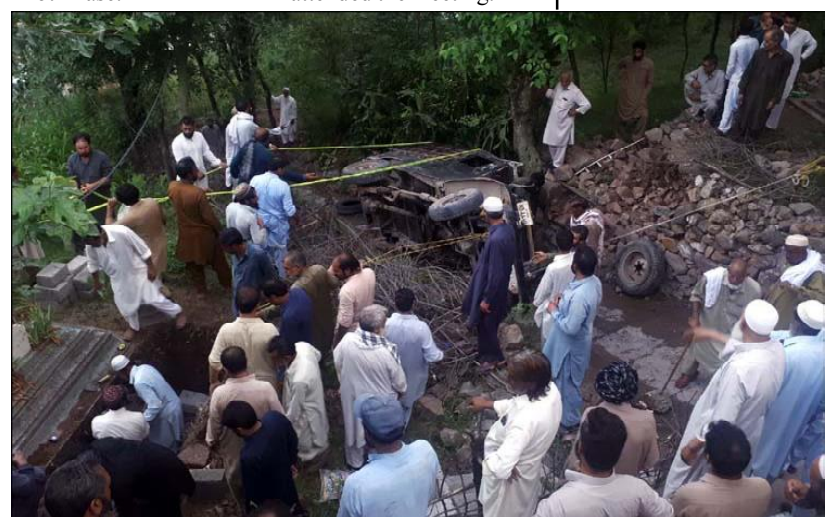
ABBOTTABAD: View of site after traffic accident of jeep that fell down due to over speeding and break failed, at Link road located on Bakote area of Abbottabad.