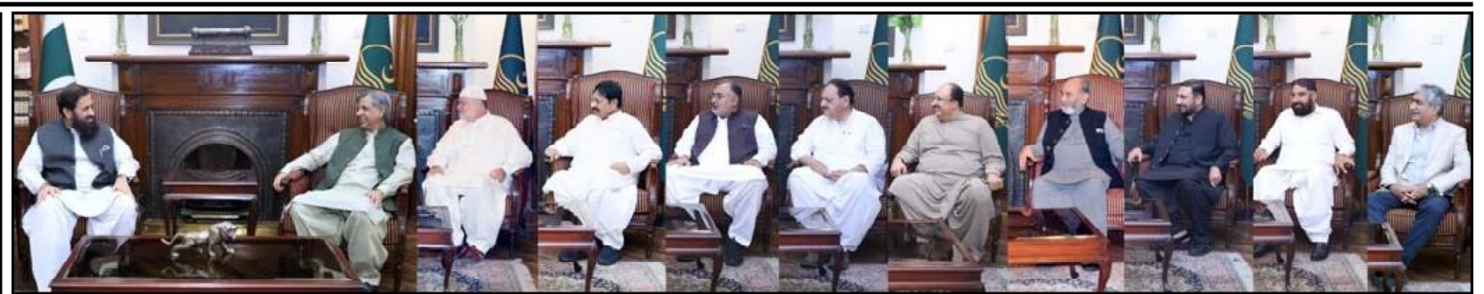
LAHORE: Federal Law Minister Azam Nazir Tarar, MNAs and former provincial ministers meeting with Governor Punjab Muhammad Balighur Rehman

electric, metro and people's bus services across the province, including Karachi and Hyderabad, which provided travel facilities to the people. He said documents of the housing schemes were distributed among people belonging to Jacobabad, Qambar-Shajsdkot, Dadu, Naushehro Feroze and Shikarpur while the same will be given to the people of district Khairpur on Wednesday. The housing documents would be distributed among people of Badin, Shaheed Benazirabad, Matiari and Jamshoro in the coming days, the minister said. He said the routes of newly launched electric buses will cover more than 50 kilometer distance from Malir Cant to Numaish and