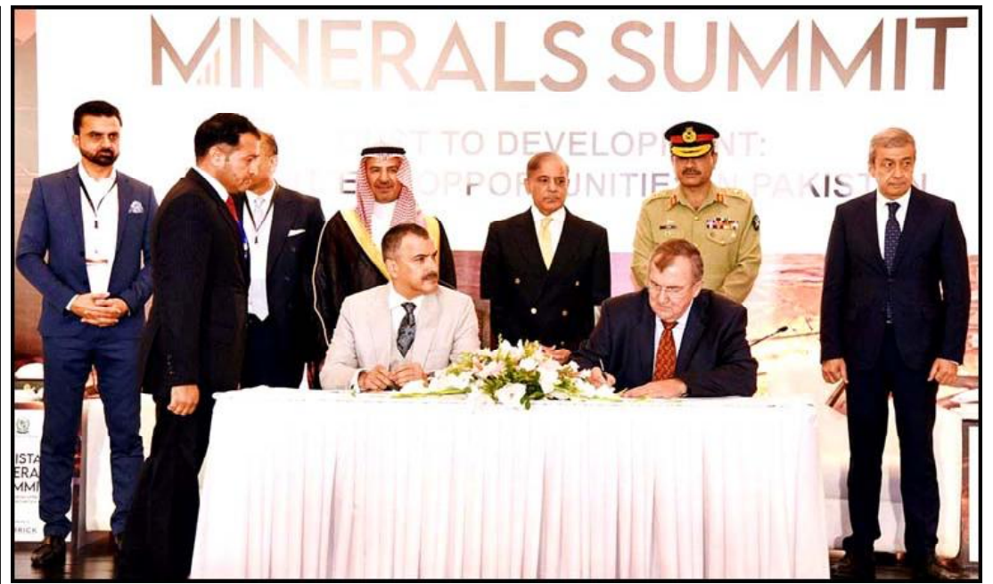
ISLAMABAD: Prime Minister Muhammad Shehbaz Sharif and COAS General Syed Asim Munir witnessing the signing of MoUs for increasing foreign investment in the mining industry of Pakistan during Pakistan Mineral Summit.