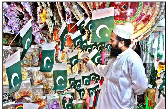
QUETTA: Vendor displaying national flags for attracting customers on the occasion of first August.

Reko Diq project to prove a... Continued from page 1 ternational firms in Pakistan Mineral Summit held earlier on the day manifested the revival of investors' confidence in Pakistan. This revival of the investors' confidence including that of Barrick Gold in Pakistan was made possible consequent to the formation of Special Investment Facilitation Council. In the meeting, Mark Bristow apprised the prime minister of progress in the ongoing development works in Reko Diq. Prime Minister Shehbaz said that the Reko Diq project agreement would prove to be beneficial for both the parties. He instructed all the relevant institutions to fulfill their responsibilities re-