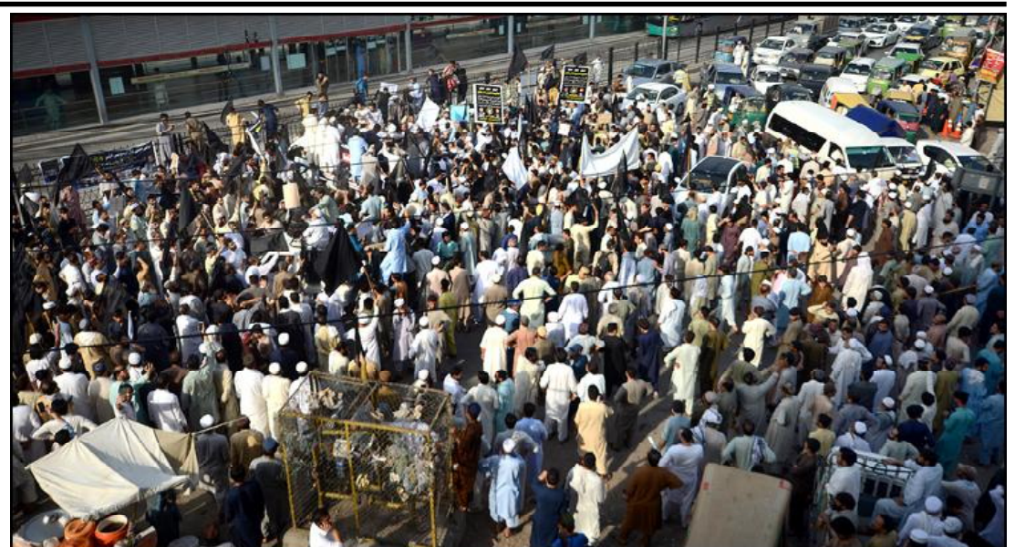
PESHAWAR: Traders of Peshawar protesting against the high rate of electricity bill at GT road.