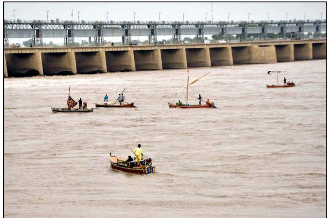
HYDERABAD: Fishermen are hunting into Indus river as the water level increases due to low flood that may cause any life risk for them, near Jamshoro.