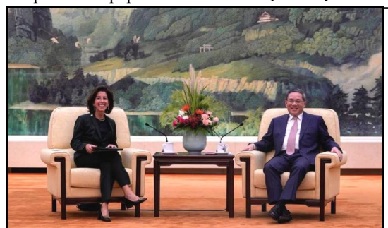
U.S. Commerce Secretary Gina Raimondo and Chinese Premier Li Qiang have a light moment during a meeting at the Great Hall of the People in Beijing, China.