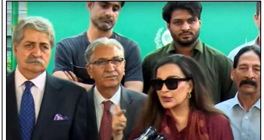
Pakistan Peoples Party (PPP) leaders speaking during a press conference in Islamabad