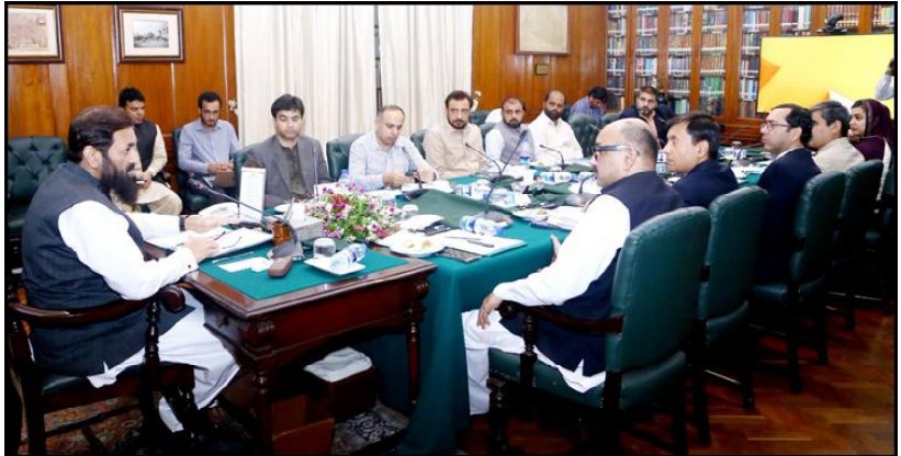
LAHORE: Governor Punjab Muhammad Balighur Rehman briefed by officers of the relevant departments on Jamia Masjid Al-Sadiq, Bahawalpur Zoo and the remains of ancient civilization Ganweriwala in Cholistan.

ISLAMABAD (INP): All requisite information related to the 7th Population and Housing Census has provided to the Election Commission of Pakistan (ECP) by Pakistan Bureau of Statistics (PBS). According to press release issued on Tuesday, the PBS stated, "The information includes gazette notification of Census Charges, Circles and Blocks, colour prints of Digitized maps of 1,85,514 Blocks, Circles and Charges (excluding Sindh) and Census Block wise data etc." However, it said the colour prints of Digitized maps of Sindh would be handed over by August 30.