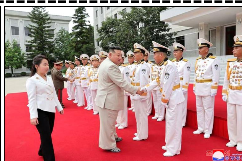
North Korean leader Kim Jong Un visits the Naval Command of the Korean People's Army (KPA) on the occasion of the Navy Day, in North Korea, in this picture released by North Korea's Korean Central News Agency (KCNA).