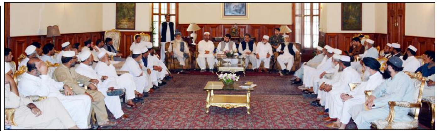
PESHAWAR: 45-members Qaumi Jirga consisting of tribal elders from Dir Bala meeting with Governor Khyber Pakhtunkhwa Haji Ghulam Ali.