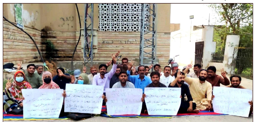
LARKANA: IBA passed candidates are holding protest demonstration for PST and JEST appointment letters, at Jinnah Bagh

Members of care taker cabinet, advisors and Special assistants will accompany care taker PM during his visit to Kenya. It has been said agreements and MOUs on bilateral ties, trade and investments will be signed during the care taker PM visit to Kenya.