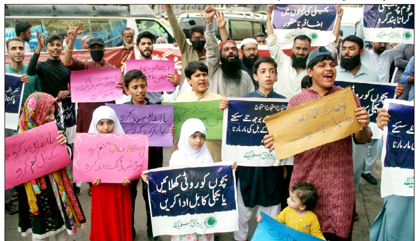
KARACHI: Activists of Pakistan Markazi Muslim league holds protest outside K-Electric against the unjust price hike of electricity and overall inflation across the country