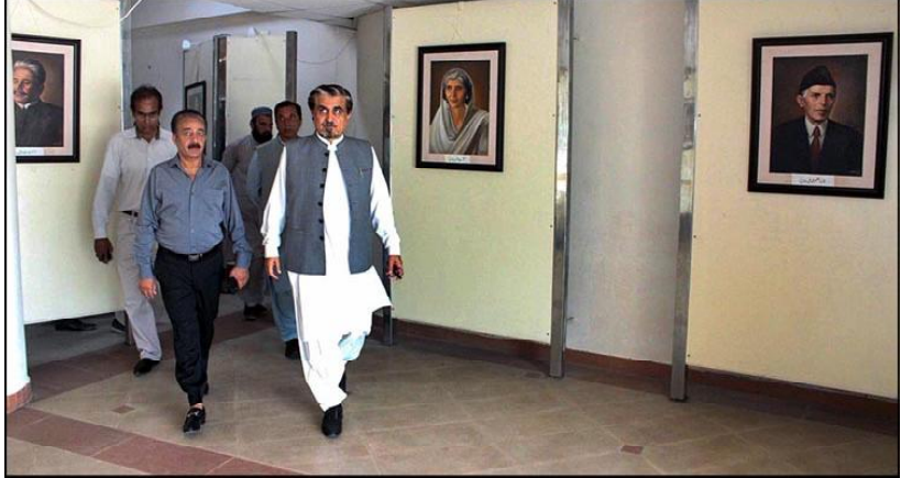
ISLAMABAD: Jamal Shah, Interim Federal Minister for National Heritage and Culture visiting Aiwan-e-Quaid Building at Fatima Jinnah Park.