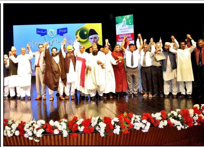
ISLAMABAD: A group photo of participants during interfaith harmony conference at PNCA