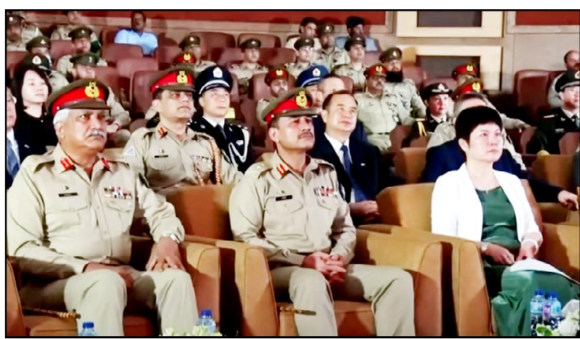
ISLAMABAD: Chief of Army Staff (COAS), General Syed Asim Munir attending 96th anniversary of the founding of the People's Liberation Army (PLA) of China commemorated at General Headquarters (GHQ)

10th anniversary of the launch of CPEC and in the past months, COAS and other military leaders paid successful visits to China, which has strongly promoted the relationship between the two militaries", the Chinese Charge d'Affaires endorsed. The COAS felicitated the PLA and lauded the PLA's role in China's defence, security and nation-building. While highlighting various facets of the deep-rooted ties between the two states, militaries and the people, COAS said that the "Pakistan-China relationship is unique & robust that has proven its resilience in the face of all challenges."