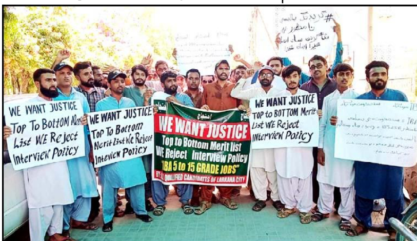
LARKANA: Candidates who passed the IBA Sukkur test for Grade 5 to 15 grade government jobs are holding protest demonstration against the grading policy and interview call, held in Larkana.

Hangu having a total accumulative water storage capacity of 13,014 AF with 14,935 acres CCA were completed. He said 24 small dams with accumulative water storage capacity of 75,008 AF having 49,523 acres CCA were being built in different districts of KP with assistance of Federal government. He said that 37 small and medium dams were constructed in Khyber Pakhtunkhwa including 15 operated by the provincial government.