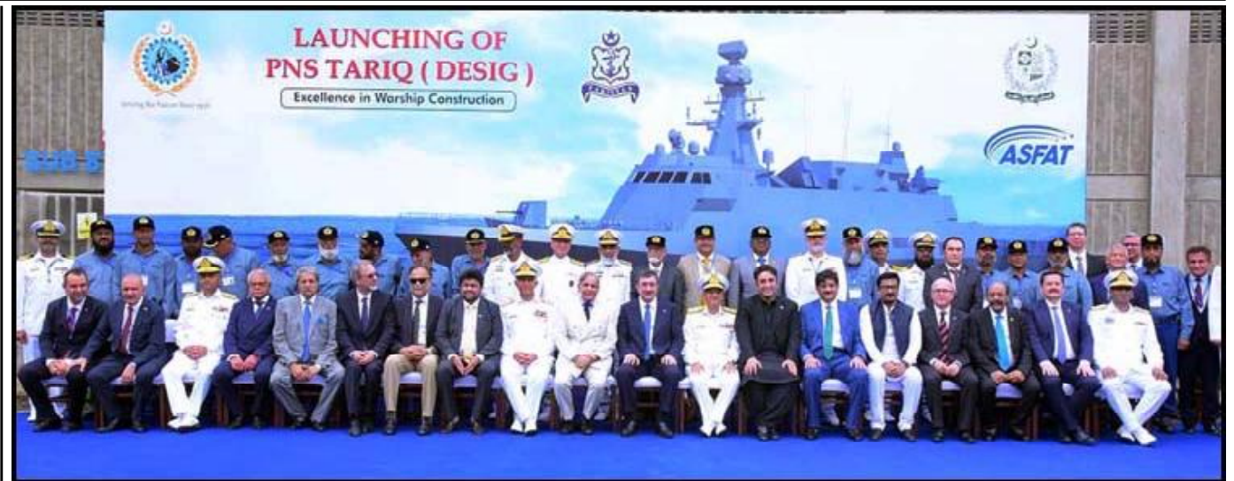
KARACHI: Prime Minister Muhammad Shehbaz Sharif, Turkiye's Vice President Cevdet Yilmaz and other dignitaries in a group photo at the launching ceremony of Pakistan's 4th MILGEM Corvette "PNS Tariq".

Development). Minister for Finance, Mohammad Ishaq Dar, moved The Pakistan Sovereign Wealth Funds Bill, 2023, in the National Assembly. The bill aims to establish Pakistan Sovereign Wealth Funds to promote sustainable economic development through the management of fund assets, following the best international standards, policies, and practices. The objective is to maximize the value of these funds for the benefit of future generations. The Minister mentioned that Pakistan possesses the largest gas pipeline valued at 40 to 50 billion dollars and has reserves of minerals and mines worth $600 billion. To start with, seven such valuable assets, amounting to $8 billion, will be placed in the Pakistan Sovereign Wealth Funds.