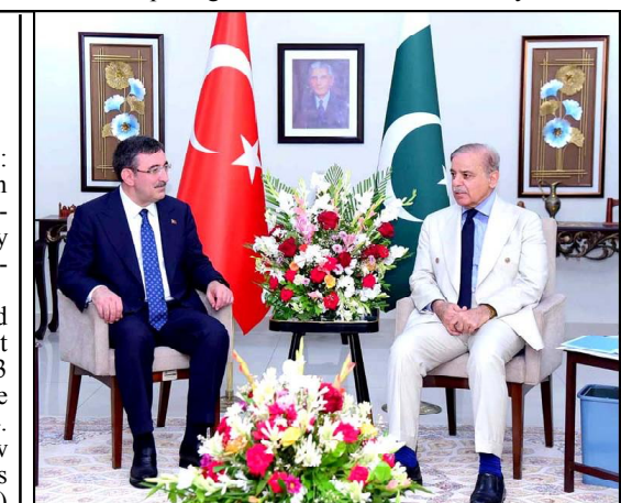
KARACHI: Vice President of Türkiye, Cevdet Yilmaz meeting with Prime Minister Muhammad Shehbaz Sharif.

ISLAMABAD (APP): President Dr Arif Alvi on Wednesday granted his assent to two bills after they were passed by the parliament. The president signed Qanun-e-Shahadat (Amendment) Bill 2023 providing for amending the Qanun-e-Shahadat of 1984. He also signed into law the Control of Narcotics Substances (Amendment) Bill 2023 which provided for amending the Control of Narcotics Substances Act of 1997.