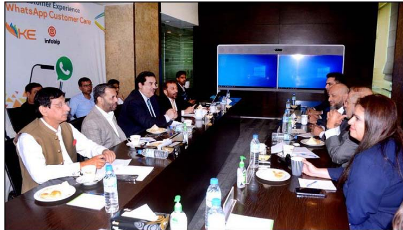
KARACHI: Federal Minister for Energy Khurram Dastagir, Federal Minister for Information Technology Syed Ameen-ul-Haque, MQM Pakistan senior leaders Farooq Sattar and Mustafa Kamal in a meeting with K-Electric Management at the KE head office.