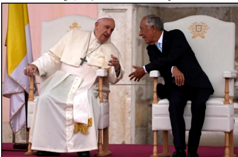
Pope Francis and Portugal's President Marcelo Rebelo de Sousa, right, converse at the Welcome Ceremony at the Belem presidential palace in Lisbon.