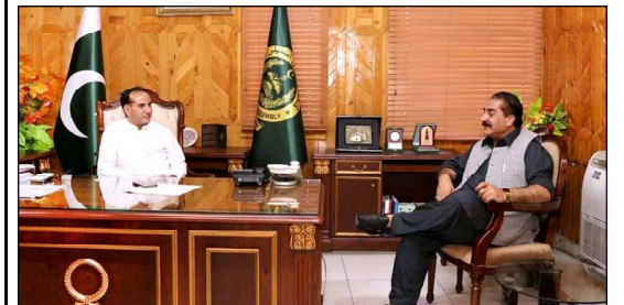
GILGIT: Speaker Gilgit-Baltistan Assembly Nazir Ahmad Advocate in a meeting with Minister Home Gilgit-Baltistan Shams Lone at Assembly Secretariat.

Equipped with essential medical tools such as a backpack, pulse oximeter (CE/FDA), BP apparatus, cervical collar, nebulizer, glucometer, portable oxygen cylinder set, tourniquets, digital clinical ear thermometer, silicon Ambo bags, CPR mask, and dressing scissor.