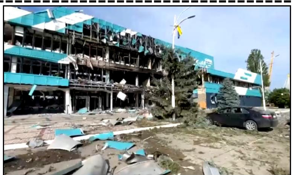
A general view of damaged property, following a Russian drone attack, amid Russia's attack on Ukraine, at Izmail, Odesa region, Ukraine.

Earlier on Wednesday, Russia attacked Ukraine's main inland port on the Danube River, sending global food prices higher as Moscow ramps up its use of force to reimpose a blockade of Ukrainian grain exports. The port, across the river from NATO-member Romania, has served as the main alternative route out of Ukraine for grain exports since Russia reintroduced its de facto blockade of Ukraine's Black Sea ports in mid-July.