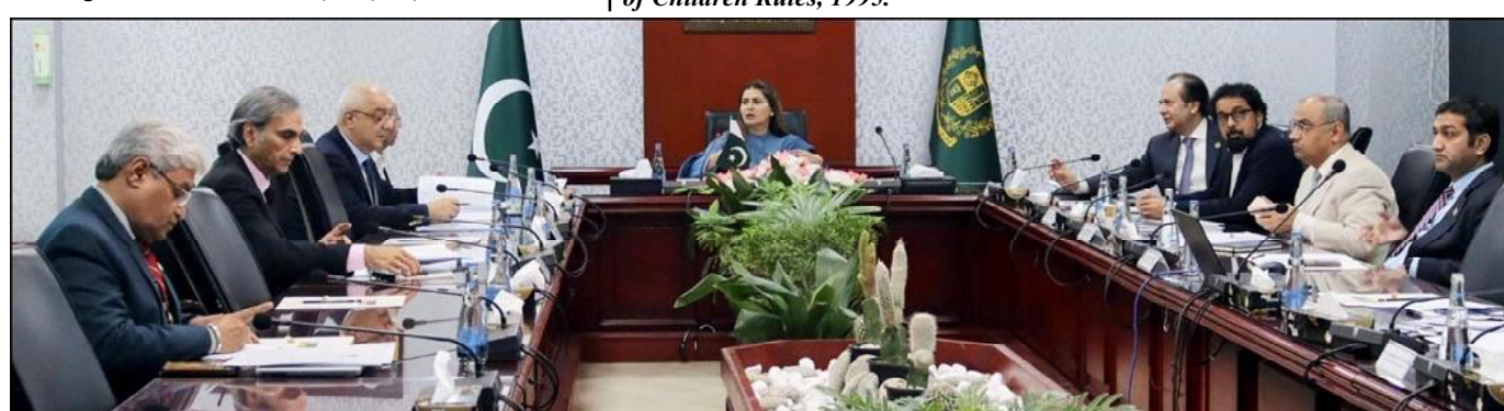
Ms. Shazia Marri, Federal Minister for Poverty Alleviation and Social Safety and Chairperson Benazir Income Support Programme (BISP) Chairs the 60th BISP Board of Directors Meeting in Islamabad.

ISLAMABAD (Online): Meeting of Senate Standing Committee on Science and Technology was held here at Parliament House on Wednesday with Senator Sardar Muhammad Shafiq Tareen in Chair. The Senate Committee deliberated on the recruitment process in Pakistan Standards and Quality Control Authority (PSQCA). Senator Sardar Muhammad Shafiq Tareen expressed reservations on acquiring the services of UTS and inquired as to why the Services of Public Testing Service (NTS&NUST) have not been acquired. He further stated that the irregularities have also been observed in the recruitment process, and several candidates have approached the standing committee in this regard. PSQCA officials apprised that the contract is being awarded to the lowest bidder as per government policy. The Chairman Committee raised concerns about the 'Promotion vacancies' issue, which were advertised by the Pakistan Standards and Quality Control Authority (PSQCA).