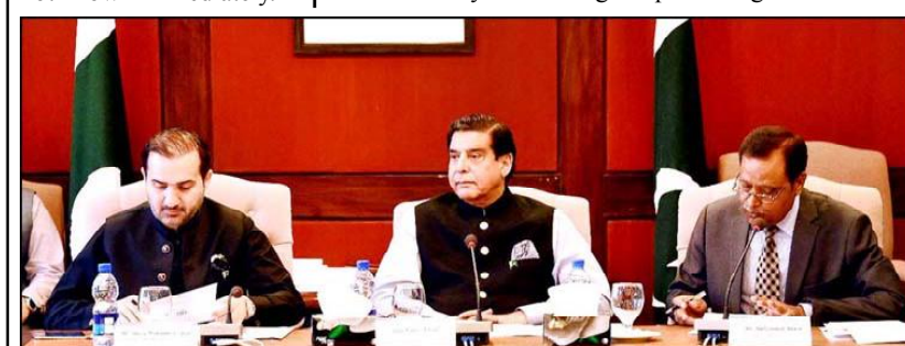
ISLAMABAD: Speaker National Assembly Raja Pervez Ashraf chairing meeting of the PIPS Board of Governors at PIPS.

Independent Report QUETTA: An alleged suicide bomber died in a compound near Sabzal and Spinnay roads' intersection on Wednesday night. According to reports, the alleged suicide bomber was attempting to carry the suicide jacket to some where when it exploded by the time due to the reasons not known immediately.