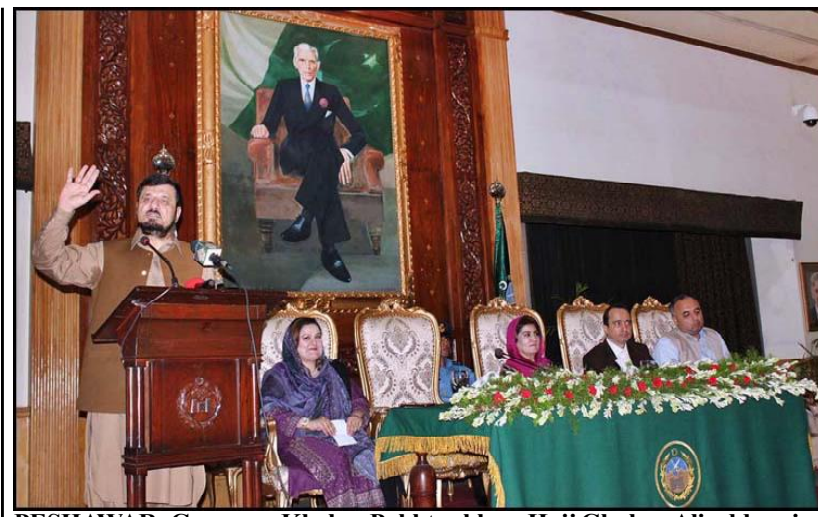
PESHAWAR: Governor Khyber Pakhtunkhwa Haji Ghulam Ali addressing during Women Excellence Award 2023 ceremony at Governor House.

Of whom, 614 people with serious injuries were shifted to different hospitals, while 539 people with minor injuries were treated on the spot by Rescue Medical Teams. Analysis show that 553 drivers, 30 underage drivers, 127 pedestrians, and 485 passengers.