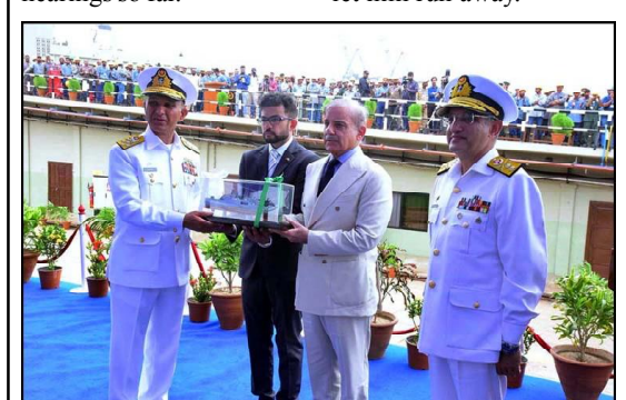
KARACHI: Chief of Naval Staff Admiral Muhammad Amjad Khan Niazi presenting a model of a ship to Prime Minister Muhammad Shehbaz Sharif during the launching ceremony of PNS Tariq.