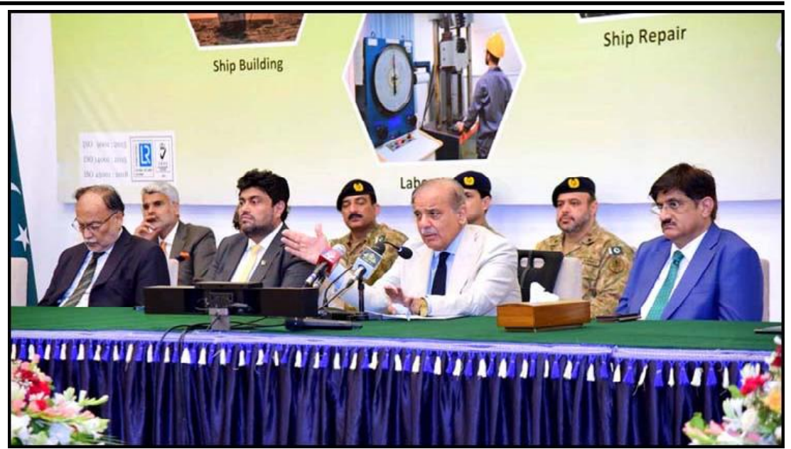
ISLAMABAD: Prime Minister Muhammad Shehbaz Sharif addresses a meeting organized by Karachi Chamber of Commerce and Industries (KCCI).

He assured that the government would provide electricity to the traders in Karachi at similar rates.