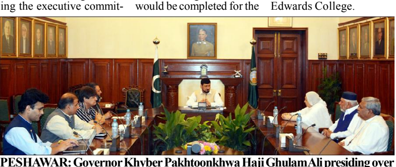
a meeting regarding academic and administrative affairs of Edward College

Bishop Diocese of Peshawar lauded the efforts of the Governor to improve the education standard in the college and assured to make joint efforts for the betterment of