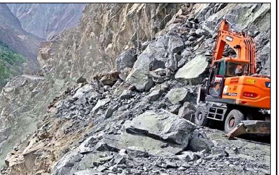
GILGIT: FWO workers busy in clearing block area of Juglote-Skardu road after land sliding during rain in city.