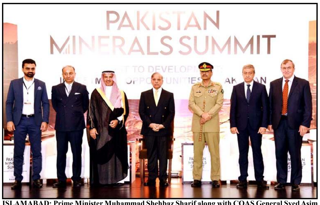
SLAMABAD: Prime Minister Muhammad Shehbaz Sharif along with COAS General Syed Asim Munir and Foreign Dignitaries attends Pakistan Mineral Summit as Chief Guest.

Meeting of JUI-F markazi majlis-e-Shoora has been summoned in the prevailing situation. But proposal has come to summon tribal elders