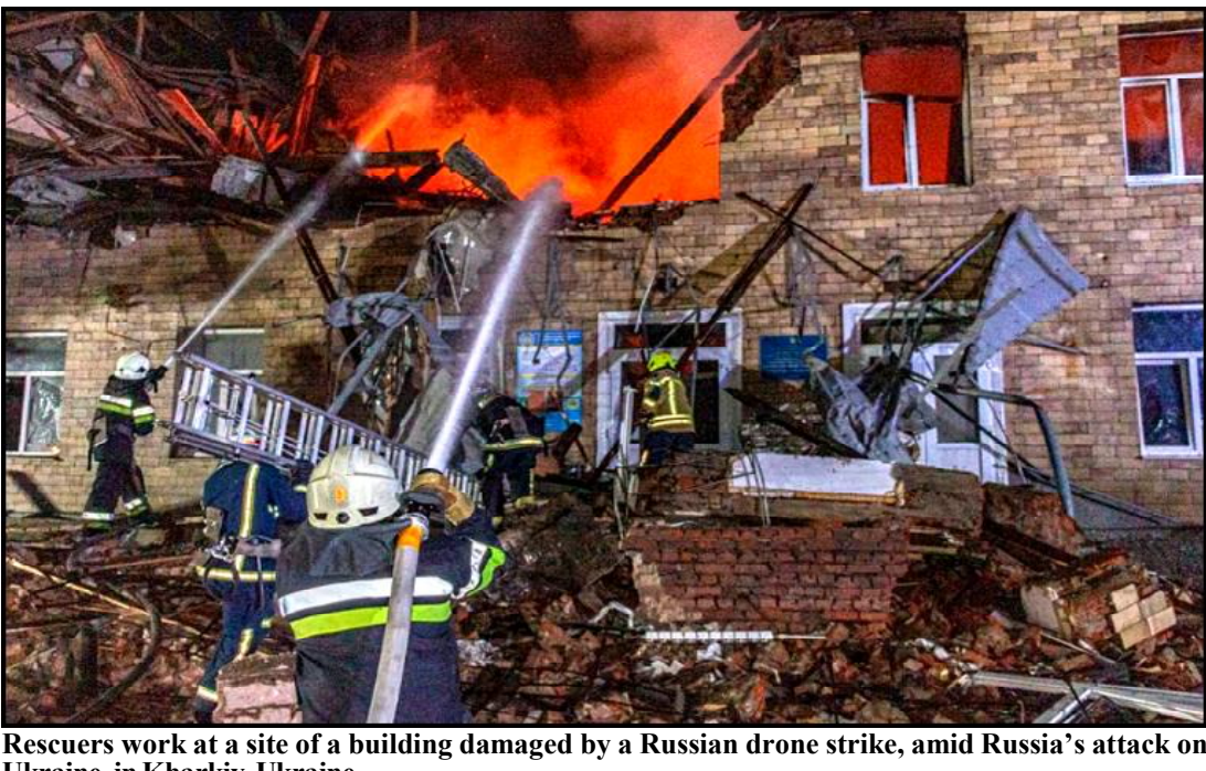
Ukraine, in Kharkiv, Ukraine.