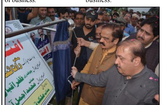
Federal Minister for interior, Rana Sanaullah Khan, inauguration various projects of Electricity supply to sadhar, Faisalabad.

He said that he went to London in 1963 and started his professional life there as a bus driver. However, later he started business life from a small shop and achieved remarkable success in the field of business.