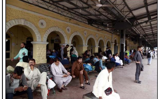
KARACHI: Passengers sit worried at platform as trains are late from their original schedules after a Hazara Express accident near Nawabshah, at Cantt Station in Karachi.