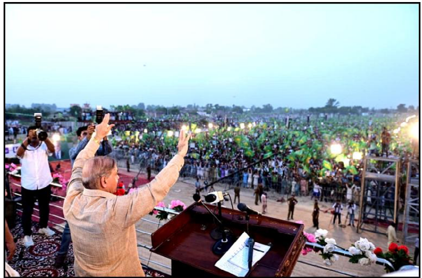
Prime Minister Muhammad Shehbaz Sharif addressing a public gathering in Kasur.

jured. He sought a report from the railways authorities about the accident. He praised the efforts of personnel of Pakistan Railways, Rescue and Pakistan army for their timely help.