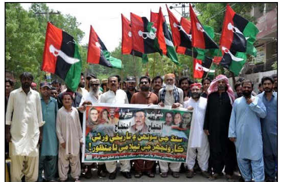
HYDERABAD: Activists of Peoples Party Shaheed Bhutto (PPP-SB) are holding protest demonstration against the auction and excavation of Karoonjhar, at Hyderabad press club.

informed that he also provided residence facility to two families, while a good number of flood-hit families were living in their village. Responding to problems in the areas, he stated that the government should increase number of medical professionals as some people were facing health complications. Similarly, the availability of fodder for cattle should be managed properly and the administration should provide "Wanda" to feed animals as due to flood, there was a shortage of fodder for cattle.