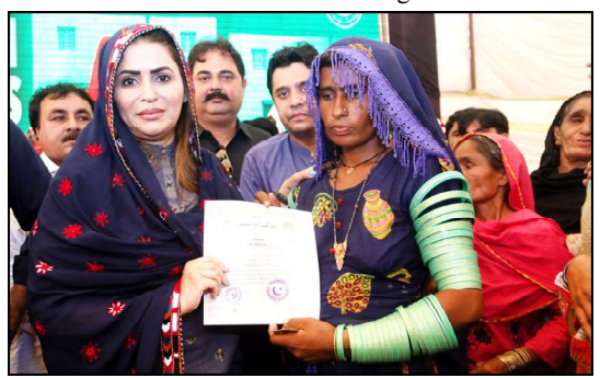
SANGHAR: Federal Minister for Poverty Alleviation and Social Safety & Chairperson, Benazir Income Support Programme Ms. Shazia Marri distributing ownership (Sanad) of houses built by Sindh Government to the deserving people during the ceremony Distribution of Land Title to Flood Affectees.

The august House, he said, rejects the India's attempted annexation of the held territory of Jammu and Kashmir and considers all its actions as illegal and against the spirit of the UN resolutions and international law.