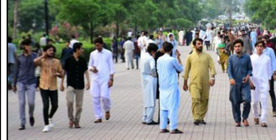
ISLAMABAD: large numbers of people are arrive to enjoying at Lake view Park during Sunday Holiday in Federal Capital.

Shedding light on one of King Fahd's most significant contributions in fostering Islamic solidarity through the establishment of the Organization of the Islamic Conference (OIC), now known as the Organization of Islamic Cooperation.