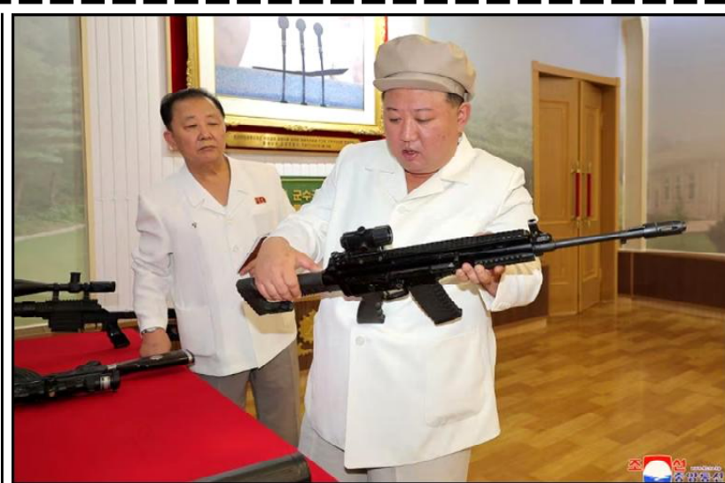
North Korean leader Kim Jong Un gives field guidance at a major weapon factory in this image released by North Korea's Korean Central News Agency.

Saudi Arabia, Bahrain urge citizens to leave Lebanon after Palestinian refugee camp clashes Monitoring Desk BEIRUT: Bahrain called on its citizens Saturday to leave Lebanon "for their own safety" hours after Saudi Arabia did the same without giving a reason. The decision by the two Gulf nations came after days of fighting in the largest Palestinian refugee camp in Lebanon between members of Palestinian President Mahmoud Abbas' Fatah group and militants of Islamic groups. The four days of fighting in Ein el-Hilweh camp near the southern port city of Sidon has left 13 people dead and dozens wounded. Bahrain's Foreign Ministry said Bahrainis should abide by the government's previous decisions to avoid travel to Lebanon. The Saudi embassy in Beirut posted a statement late Friday night on X, formerly known as Twitter.