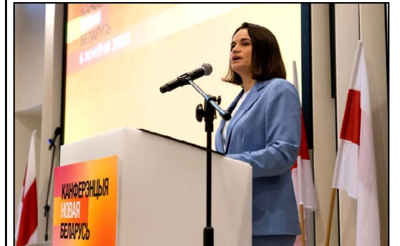
Belarus' exiled opposition leader Sviatlana Tsikhanouskaya gives an opening speech during The New Belarus conference in Warsaw, Poland.

Korean threat. Tensions on the Korean Peninsula are at their highest level in years as the pace of North Korea's missile tests and the joint U.S.-South Korea military drills, which Kim portrays as invasion rehearsals, have both intensified in a tit-for-tat cycle. Some experts say Kim's tour of the weapons factories could also be related to possible military cooperation with Moscow that may involve North Korean supplies of artillery and other ammunition as Russian President Vladimir Putin reaches out to other countries for support in the war in Ukraine.