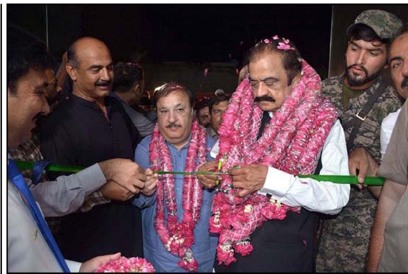
FAISALABAD: Interior Minister Rana Sana Ullah Khan is cutting ribbon to inaugurate Nadra Registration Centre at Union Council 117 Dhanola.

prioritized serving the people and make efforts for the development of the area and its people." He regretted that the people of Paniala were deprived of CPEC interchange, adding, he would write a letter to National Highways and Motorway Chairman to build an interchange here on CPEC route. Faisal Kundi said he would request to the prime minister to release funds for the mega projects which the premier had inaugurated in Dera Ismail Khan recently. He said that he was always ready to join hands with his political opponents for the sake of regional development and prosperity.