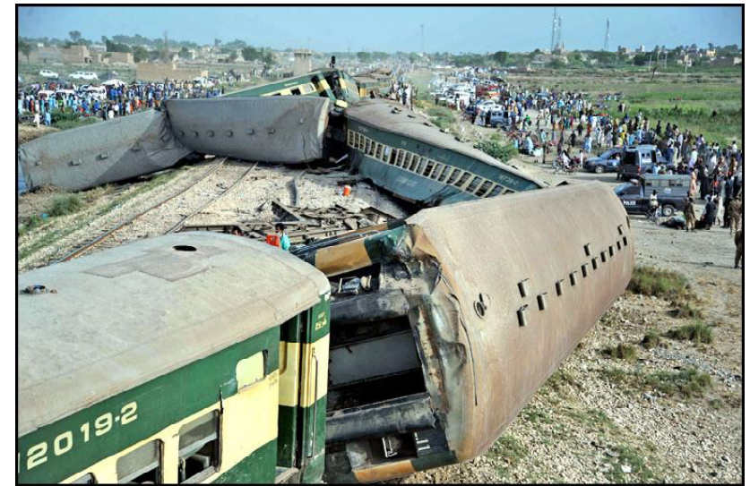
NAWABSHAH: A large numbers of people gathered at the accident site following the derailment of a Hazara Express in Nawabshah

reached the site of the accident soon after the incident and began relief activities. The incident comes a day after the Allama Iqbal Express escaped a major disaster when two of its bogies derailed near Padidan railway station in the wee hours of Saturday, resulting in the suspension of traffic on the affected railway track. However, no casualty was reported in the incident, said rescue officials. President Dr Arif Alvi Sunday expressed grief over the loss of lives in the accident of Hazara Express train. He sympathised with