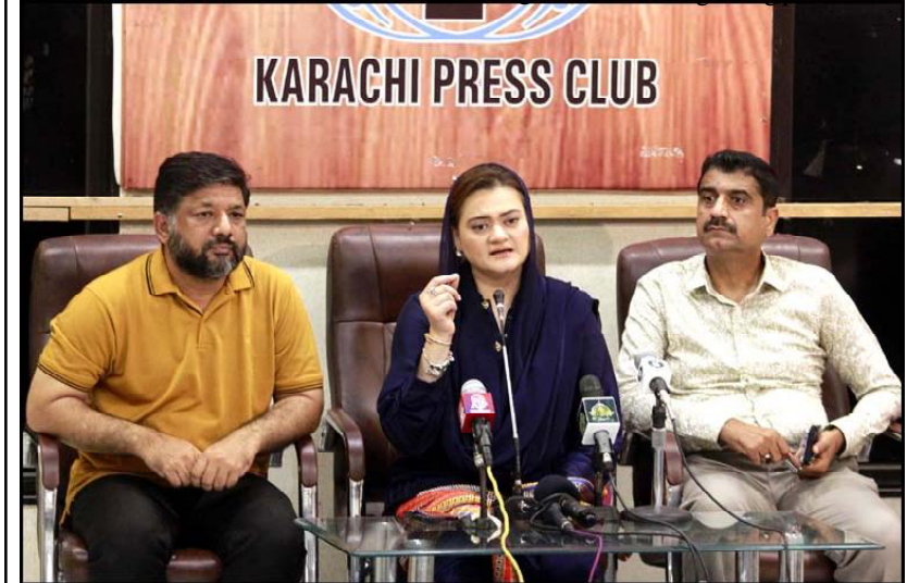
KARACHI: Federal Minister for Information and Broadcasting, Marriyum Aurangzeb addresses to media persons during meet the press program held at Karachi press club.

She said that when the court saw that dishonesty was proved beyond any doubt, it issued its verdict.