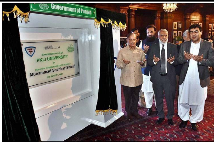
LAHORE: Prime Minister Muhammad Shehbaz Sharif offering dua after unveiling plaque during the groundbreaking ceremony of PKLI University and Launching of the National Hepatitis C Elimination Campaign.

Senator Ishaq Dar emphasized that matters of national interest should not be politicized. Additionally, he informed the Senate that PIA flights to the United Kingdom (UK) would resume in October.