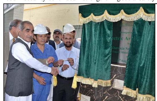
LAHORE: Railway Minister Khawaja Saad Rafique Inaugurate Steel Shop at Mughalpur Railway workshop.

He said that Pakistan had a rapidly growing population, which placed significant pressure on food production and availability. "As the population increases, the demand for food increases, and meeting the nutritional needs of all individuals becomes more challenging," he added. Tasneem Qureshi said high poverty rate was a major contributor to food insecurity, not only in Pakistan but in South Asia as well, as many people in the region lacked financial resources to access an adequate and nutritious diet consistently.