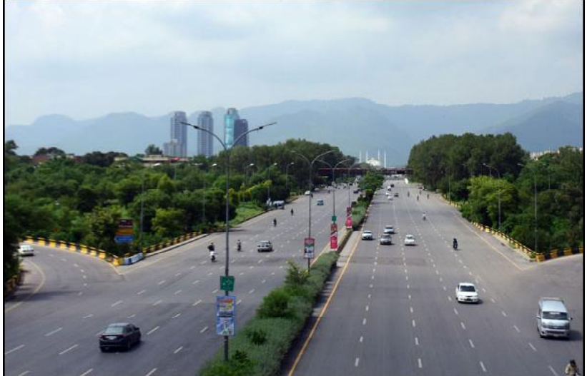
ISLAMABAD: Motorists on their way at Islamabad Highway in Federal Capital. Section 144 imposed in major Pakistani cities after Chairman PTI arrest.

and freedom of expression during the four-year of the PTI, however, the press clubs across the country provided a platform to the then opposition leaders to spread their messages among the masses and highlight fascism of the previous regime. She said the PTI chairman was declared "predator" for media by the international organization, but Pakistan ranking in press freedom improved during the last fifteen months of the coalition government. She said the PEMRA Ordinance of 2022 was a "black law" which was enacted by a dictator, but it was the coalition government which introduced amendments after twelve months of extensive consultation.