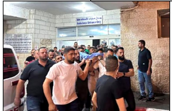
Mourners carry the body of Palestinian who was killed during clashes with Israeli settlers, in a hospital in Ramallah, in the Israeli-occupied West Bank.

that the coastguard found the survivors about 23 nautical miles (46 km) south-west of Lampedusa, as well as the two victims - a woman from Ivory Coast and her one-year-old child. A coastguard spokesperson said he could only confirm the number of survivors and the recovery of two bodies. More than 2,000 people have arrived in Lampedusa in the last few days after being rescued at sea by Italian patrol boats and NGO groups, as strong winds further complicate the situation around the island.