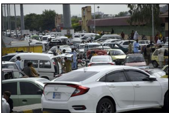
ISLAMABAD: A large numbers of people parked their vehicles outside Friday Weekly Bazaar at Peshawar Morr area at sector H-9 in Federal Capital.

The president also asked the Banking Mohtasib Pakistan to approach the SBP and other banks that on the rejection of complaints about disputed transactions, the customers concerned should be informed in a simple letter that they could approach the institution of Banking Mohtasib for relief.