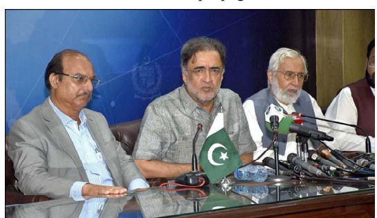
ISLAMABAD: Incumbent Advisor to Prime Minister on Kashmir Affairs, Qamar Zaman Kaira addresses press conference.

Kaira regretted that India is giving the impression that Kashmir is an issue between Hindus and Muslims through propaganda.