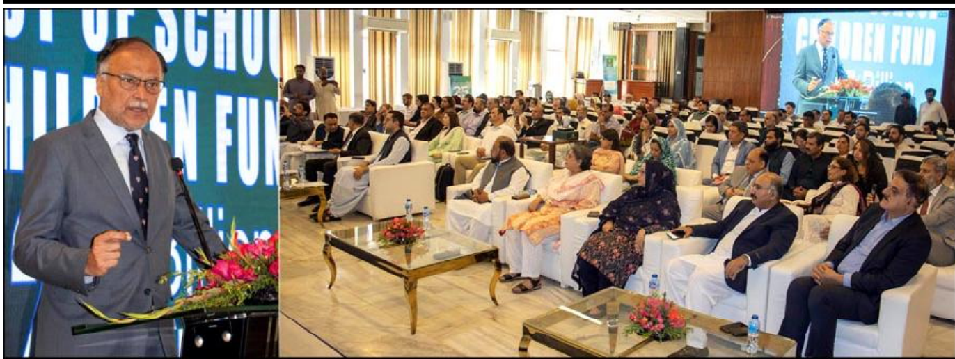
ISLAMABAD: Federal Minister for Planning Ahsan Iqbal launches Rs. 25 Billion Performance-based Challenge Fund for Out-of-School Children and Early Childhood Education.