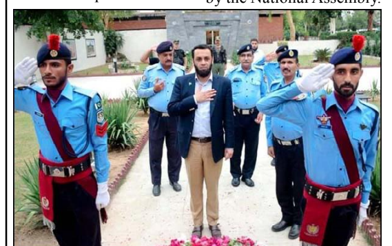
ISLAMABAD: Special Assistant to the Prime Minister, Atta Ullah Tarar paying homage to the martyrs of Police during his visit to Police Lines in Islamabad.

Talking to the media outside the Parliament House, on a question about the economic crisis, inflation and violation of the IMF agreement, she said the PTI chief just manoeuvred to shift the blame from his economic team and his cabinet for the theft of 190 million pounds.