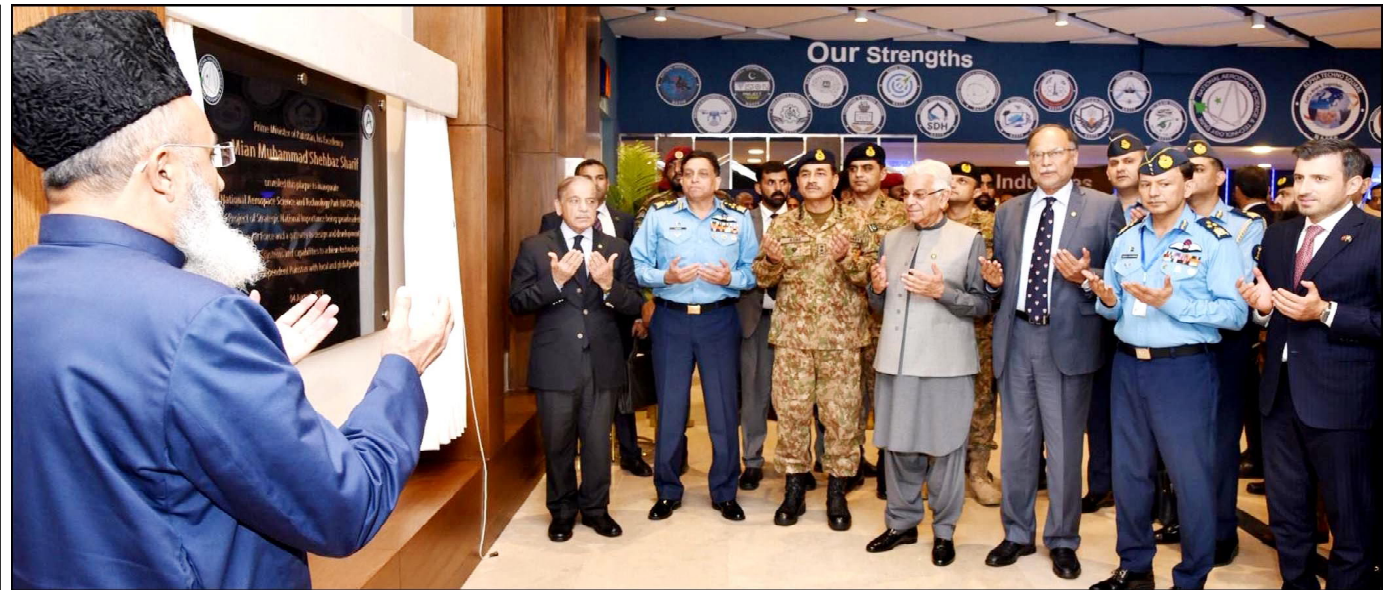
RAWALPINDI: Prime Minister Muhammad Shehbaz Sharif along with Services Chiefs and Federal Ministers inaugurating National Aerospace Science and Technology Park

Congratulating the Iranian leadership and Saudi Crown Prince Mohammad bin Salman, over the normalization of relations between the two countries, the president expressed the hope that the breakthrough in their relations would not only benefit the two countries but also the entire region.