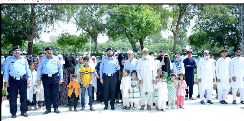
Floral wreaths were laid, and a special prayer was offered for the high ranks of the martyrs. Police contingents presented salutations at the occasion, and the families of the martyrs were also present, who planted trees in their memory.

According to details, 4th August, the Police Martyrs' Day is being observed across the country with full enthusiasm. CPO Headquarters and senior police officers paid tribute to the fallen heroes.