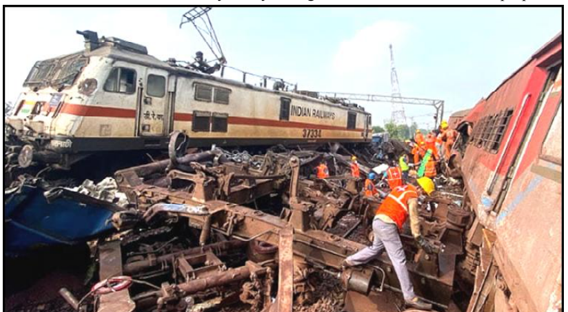
Rescue workers sift through wreckage at the accident site of a three-train collision near Balasore, about 200 km (125 miles) from the state capital Bhubaneswar.

Monitoring Desk STOCKHOLM: More than 50 people were injured and dozens detained in Stockholm on Thursday as clashes broke out at an Eritrean pro-government festival, police and health officials said, with anti-government protesters trashing property at the site. "Another public gathering took place close to the festival site, during which a violent riot broke out," police said, adding in a statement they had detained "around a hundred people".