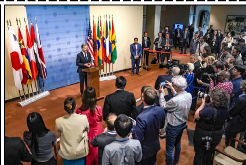
U.S. Secretary of State Antony Blinken stands at a podium as he holds a press conference, during a meeting of the United Nations Security Council where he presides as president.

targeted since the beginning of Moscow's military campaign in Ukraine more than a year ago, but attacks have increased in recent weeks. On Tuesday, Russia's defence ministry said it foiled a Ukrainian drone attack targeting patrol boats in the Black Sea. Three drones were trained on ships navigating in waters 340 kilometres southwest of Sevastopol, the base of Russia's Black Sea fleet in Crimea. A similar attack was repelled a week earlier. The ministry also said on Friday it had downed 13 drones over the Crimean peninsula. There were no casualties or damage in either attack, the ministry said.