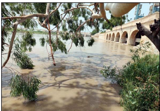
SUKKUR: Water level increases while high grade flood water reaches at Sukkur Barrage into River Indus due to heavy downpour of monsoon season, in Sukkur.

In response to inquiries about the Islamia University Bahawalpur incident, Chief Minister Naqvi said that a judicial commission will be formed and the Punjab government will submit a detailed report to the commission.