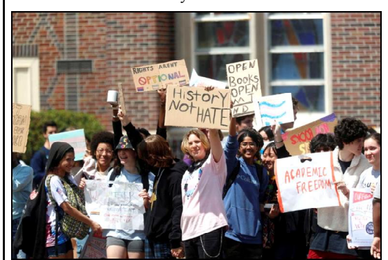
Students stage a walk out from Hillsborough High School to protest after Florida education officials voted to ban classroom instruction on gender identity and sexual orientation in all public school grades, expanding on a law signed by Republican Governor Ron DeSantis that barred such lessons for younger students and was derided by critics as the "Don't Say Gay" bill in Tampa, Florida, U.S.

The House received the resolution, which aims to foster better understanding and respect for the Islamic faith within American society, on July 28 and referred it to the House Committee on Foreign Affairs.