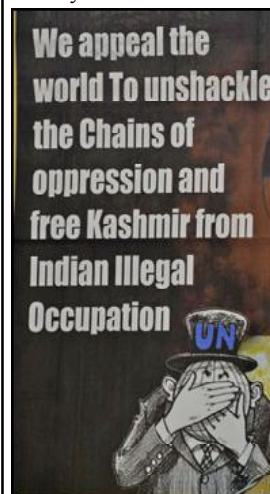
ISLAMABAD: A police man on his way in front of a banner showing solidarity with the people of Kashmiri, August 5 is being observed as a black day as it marks the completion of 3 years since the people of IO Kashmir were deprived of their fundamental human rights.

Temperature of some major cities recorded this morning: Islamabad twenty-seven degree centigrade, Lahore thirty-one, Karachi and Peshawar twenty-nine, Quetta twenty-two.