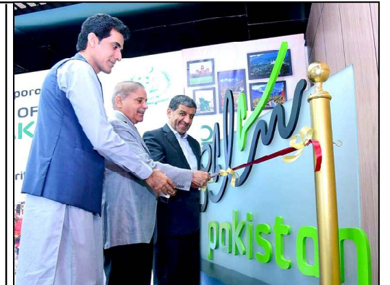
ISLAMABAD: Prime Minister Muhammad Shehbaz Sharif inaugurating Pakistan's tourism brand 'Salam Pakistan'.

He indicated a holding company will be set up for this purpose. PIA control will have to be given to private sector.