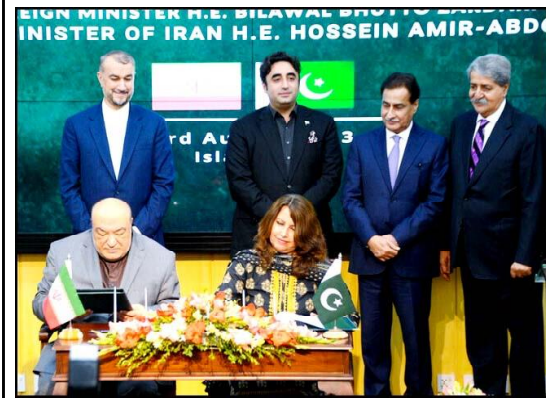
Foreign Minister Bilawal Bhutto-Zardari and Iranian Foreign Minister Hossein Amir Abdollahian witnessing signing of memoranda of understanding between Pakistan and Iran in Islamabad.

ISLAMABAD (Online): Senate Chairman Muhammad Sadiq Sanjrani has said that Pakistan Iran bilateral relations are rooted in historical linkages and based on religious, linguistic, cultural similarities and spiritual affiliation. He expressed these views in a meeting with Iranian Foreign Minister Hossein Amir Abdollahian here at Parliament House on Thursday. He further said that Iran was the first country to acknowledge Pakistan's sovereignty and to support our membership in the United Nations. "I view this as a solid foundation upon which we have built close bilateral ties that we continue to nature", Chairman Senate observed. He observed that Parliamentary ties between Pakistan and Iran have also grown stronger over the years, with multiple bilateral visits and cooperation at international forums such as the IPU and the APA.