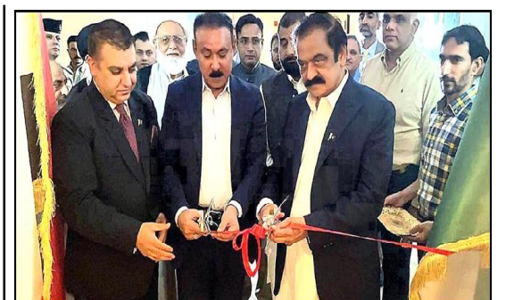
BAGHDAD: Federal Minister for Interior Rana Sana Ullah Khan inaugurating Machine Readable Passport System at Pakistan Embassy.

WASHINGTON (APP): Pakistan's Ambassador to the United States, Masood Khan, Wednesday discussed with the US Under Secretary for Economic Growth, Energy, and Environment, Jose Fernandez, steps to strengthen the economic partnership between the two countries. "Today I discussed with Pakistani Ambassador Masood Khan strengthening US-Pak economic partnership and climate resilience via the U.S.-Pakistan Green Alliance and investment in the technology sector," tweeted Under Secretary Fernandez. "I look forward to working together on mutually beneficial priorities," he said. Reciprocating, Ambassador Masood Khan thanked Fernandez for receiving him with warmth, according to a press release issued by the Pakistani embassy. "Together Pakistan and the US - will work to take our cooperation in trade, technology, agriculture, energy, and climate resilience to a higher plane", he said in his tweet. He also expressed the hope to attract more foreign direct investment (FDI) from the US for Pakistan.