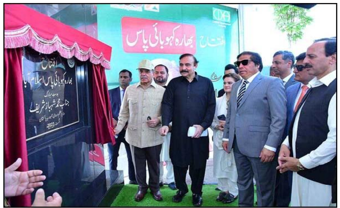
ISLAMABAD: Prime Minister Muhammad Shehbaz Sharif inaugurates Barakahu Bypass.

Earlier, Attorney General of Pakistan (AGP) Mansoor Awan assured the court that the 102 civilian suspects currently under military custody will be fairly treated during ongoing trials. AGP Awan claimed that his assurance are coming from the military's top leadership. Concessions are being made for May 9 suspects on the court's insistence, said the AGP. At one point the AGP also reminded the court that the military is armed. "No efforts are being made to overturn the Constitution of Pakistan... What happened on May 9 is before everyone," said AGP Awan. "Remember one thing — they are the armed forces. If they are attacked, they have weapons to defend themselves." The AGP further said that the army is equipped to fire bullets. "It is not possible that if they are attacked, they first approach an SHO to lodge a formal complaint." "They [the military] could have opened fire [on citizens] on May 9," said the AGP.