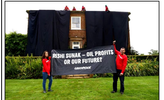
Greenpeace activists hold a banner while others cover British Prime Minister Rishi Sunak's £2m manor house in oil-black fabric in protest of his backing for a major expansion of North Sea oil and gas drilling amidst a summer of escalating climate impacts, in Yorkshire, Britain.

The port, across the river from Nato-member Romania, is the main alternative route out of Ukraine for grain exports, since Russia's blockade halted traffic at Ukraine's Black Sea ports in mid-July. Video released by the Ukrainian authorities showed firefighters on ladders battling a huge blaze several stories high in a building covered with broken windows. Several other large buildings were in ruins, and grain spilled out of at least two wrecked silos.