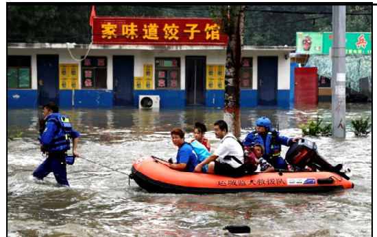
Rescue workers from Shanxi province evacuate people through floodwaters with a boat after the rains and floods brought by remnants of Typhoon Doksuri, in Zhuozhou, Hebei province, China.

One of Xi's last tasks before going on vacation was to instruct emergency responders to work harder at rescuing those affected by floods battering northern China as a result of Typhoon Doksuri.