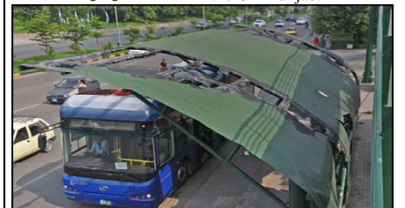
ISLAMABAD: A view of the broken shed of Blue Line Bus Stop at Express Way, which needs the attention of concern authority.

He informed the committee about ongoing investigations by the Punjab Higher Education Department and a special inquiry committee established by the CM Punjab.