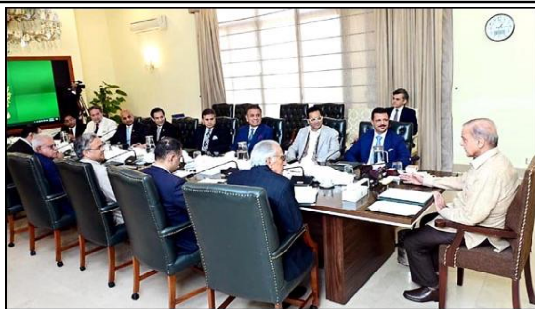
ISLAMABAD: A group of prominent Pakistani-American businessmen and entrepreneurs call on Prime Minister Muhammad Shehbaz Sharif.

approach. He said under the SIFC framework, the government was working on a comprehensive plan to attract investment in the five select fields of agriculture, information technology, mine and minerals, energy, and defence production.