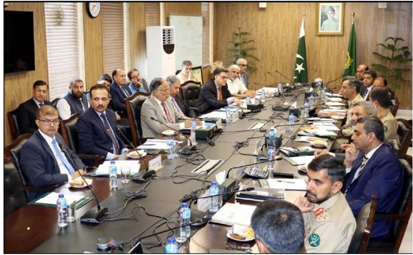
ISLAMABAD: The 67th meeting of the National Logistics Board (NLB). Chaired by Chairman NLB, the honourable Federal Minister for Planning, Development & Special Initiatives (PDSI), Prof. Ahsan Iqbal, the meeting was attended by other members of the apex logistics body.