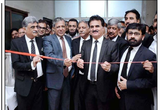
ISLAMABAD: Federal Minister for Law and Justice Senator Azam Nazeer Tarar along with SAPM on Interior and Legal Affairs Attaullah Tarar inaugurated the Extended Blocks of Islamabad Bar Council Complex at Federal Judicial Complex.

"We will write a letter of displeasure to the Special Assistant to Prime Minister on Water Resources to take actions against the officials and ask them to appear before the committee to settle the audit paras," Noor Alam Khan added.