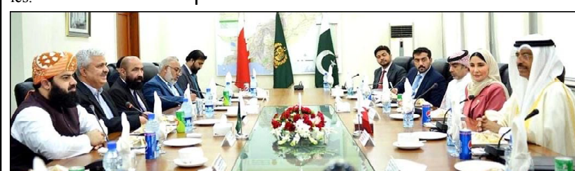
ISLAMABAD: Federal Minister for Communications and Postal Services, Maulana Asad Mehmoos in a meeting with Mohammad Bin Thamer Al Kaabi, Minister of Transport and Telecommunication, The Kingdom of Bahrain, to discuss cooperation in postal service and road networks.

ISLAMABAD (APP): Federal Minister for Communication and Postal Services Maulana Asad Mehmoos on Thursday stressed the need to enhance cooperation in postal and communication sectors between Pakistan and Bahrain. He welcomed high-level delegation of Bahrain led by Minister of Transport and Telecommunication Muhammad Bin Tahmeer al-Kaabi in his office. The minister, on the occasion, informed the delegation that Pakistan was heavily investing to build state-of-the-art road infrastructure spreading from Kashghar to Gwadar for countries in the region to take full advantage through trade. He also briefed the delegates about the investment opportunity for the investors from Bahrain in road infrastructure development. The postal services of Pakistan is also being upgraded to bring it par with the global postal services, said the minister added. He said National Highways and Motorway Police is also part of his ministry and the government is introducing more stringent traffic rules to avoid accidents and to facilitate commuters on Motorways. Federal Secretary Ministry of Communication and Chairman National Highway Authority (NHA) Capt (Rtd) Muhammad Khurram Agha also briefed the delegation upon ongoing and completed projects.