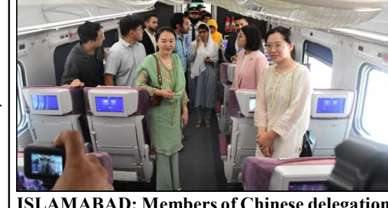
ISLAMABAD: Members of Chinese delegation travelling by the coaches given by the Chinese government in connection with 10 years celebration of CPEC at Margalla Railway Station, in Federal Capital.

PM cancelled the foundation stone laying ceremony besides ordering to issue tenders of the project again. PM left his chair in displeasure saying new tenders be issued. In the light of it best committee be selected. PM left the ceremony with issuing new directives.