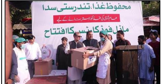
vessels among 291 food peddlers on Thursday.

to ensure food hygiene. He said that training sessions will also be arranged for small food points including tandoor, roadsides carts and food pedlars. He said that the purpose of the training is