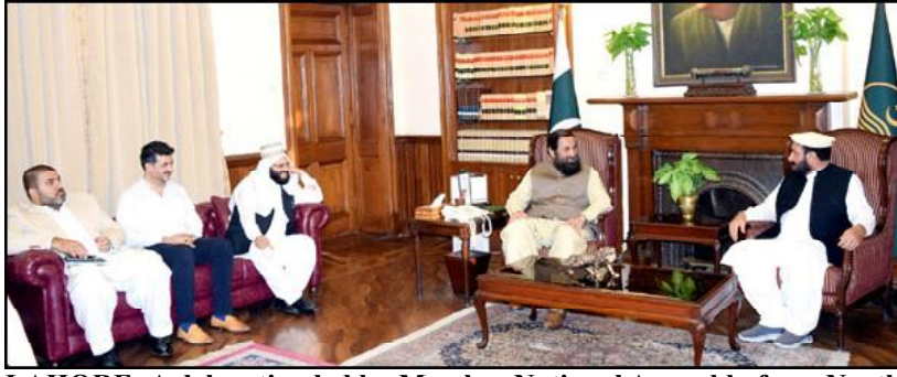
LAHORE: A delegation led by Member National Assembly from North Waziristan, Nazir Khan, meeting with Governor Punjab Muhammad Balighur Rehman at Governor House.

The director general said that the purpose of the PFA is to bring reforms in food industry. All resources will be utilized to ensure the availability of safe, quality and standard food to the people. Despite the awareness, strict action will be taken against those FBO who sell substandard food, he added.