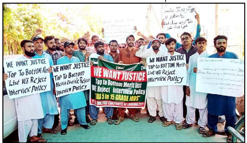
LARKANA: Candidates who passed the IBA Sukkur test for Grade 5 to 15 grade government jobs are holding protest demonstration against the grading policy and interview call, held in Larkana.

Hangu having a total accumulative water storage capacity of 13,014 AF with 14,935 acres CCA were completed. He said 24 small dams with accumulative water storage capacity of 75,008 AF having 49,523 acres CCA were being built in different districts of KP with assistance of Federal government. He said that 37 small and medium dams were constructed in Khyber Pakhtunkhwa including 15 operated by the provincial government.