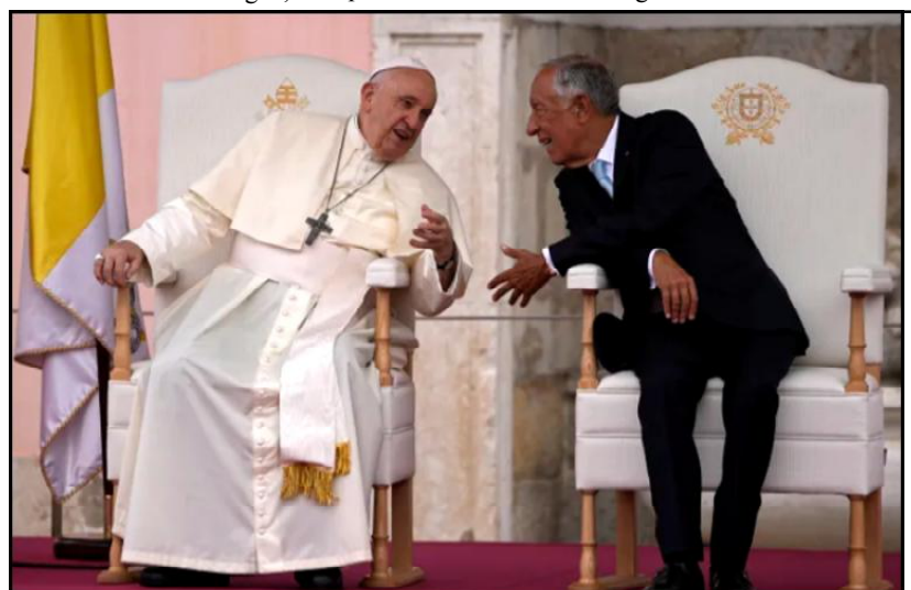
Pope Francis and Portugal's President Marcelo Rebelo de Sousa, right, converse at the Welcome Ceremony at the Belem presidential palace in Lisbon.