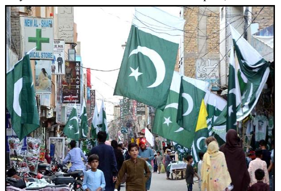
QUETTA: A view of national flag install on bazaar for selling purpose on ahead of 76th Pakistan Independence Day

Pakistan's every citizen will continue playing its constructive role toward a peaceful solution to the Jammu and Kashmir dispute, he added.