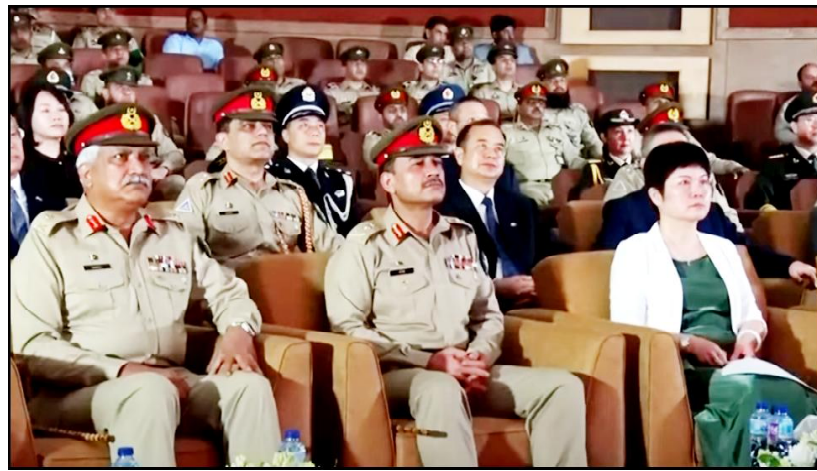
ISLAMABAD: Chief of Army Staff (COAS), General Syed Asim Munir attending 96th anniversary of the founding of the People's Liberation Army (PLA) of China commemorated at General Headquarters (GHQ)

The COAS felicitated the PLA and lauded the PLA's role in China's defence, security and nation-building. While highlighting various facets of the deep-rooted ties between the two states, militaries and the people, COAS said that the "Pakistan-China relationship is unique & robust that has proven its resilience in the face of all challenges."