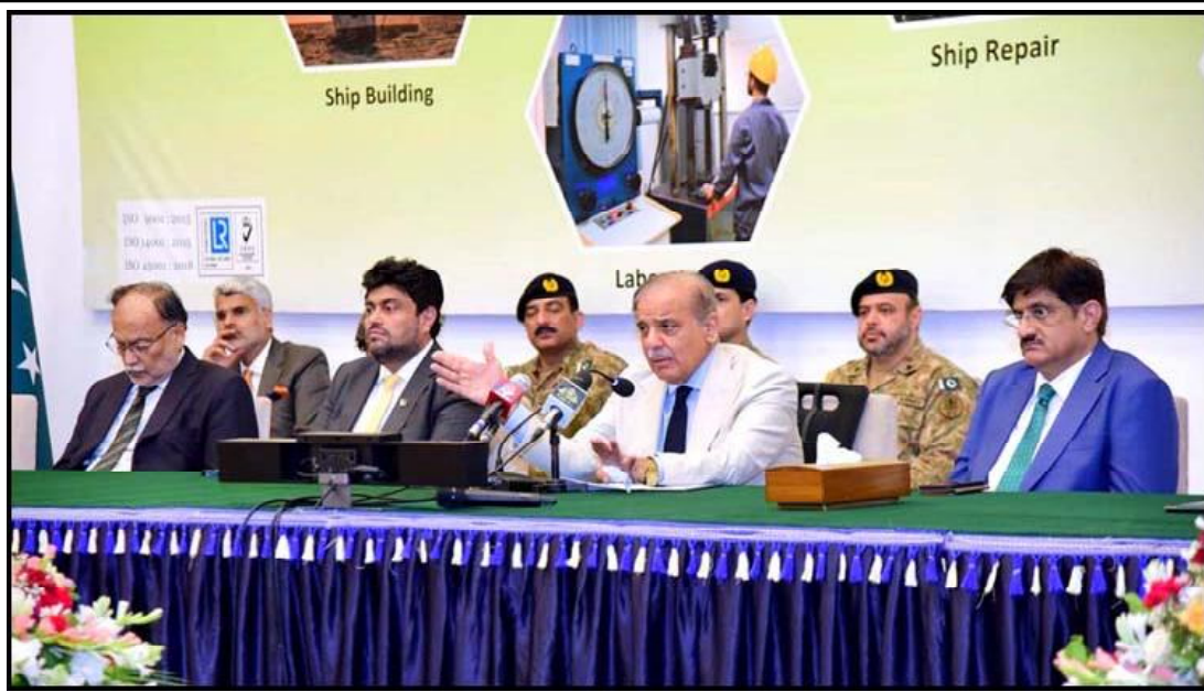
ISLAMABAD: Prime Minister Muhammad Shehbaz Sharif addresses a meeting organized by Karachi Chamber of Commerce and Industries (KCCI).

He assured that the government would provide electricity to the traders in Karachi at similar rates.