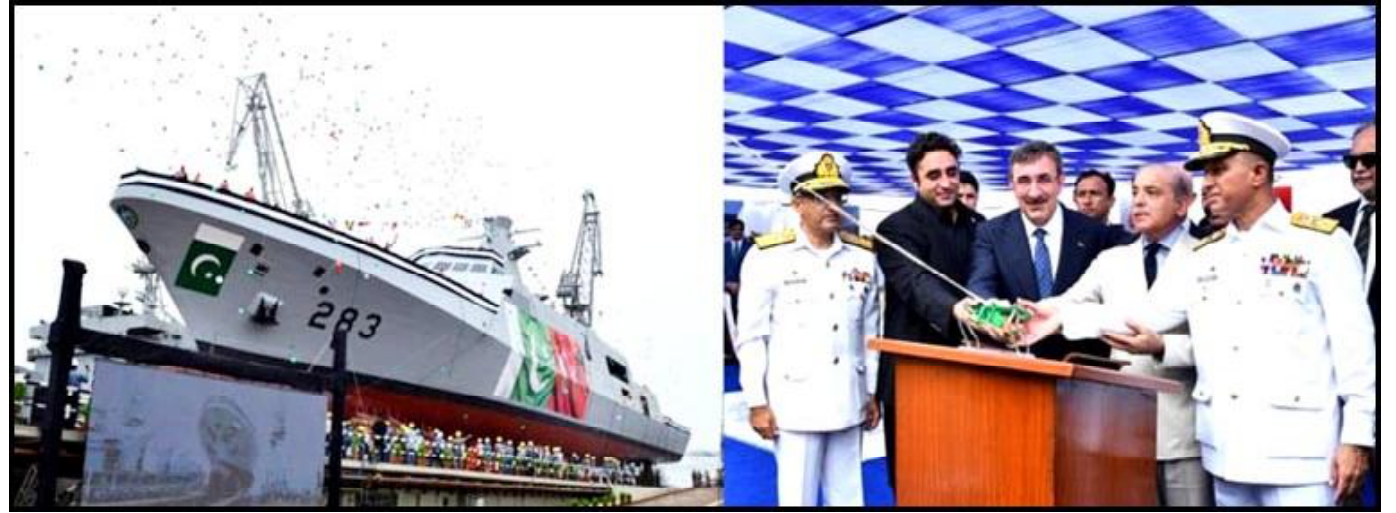
KARACHI: Prime Minister Muhammad Shehbaz Sharif, Türkiye's Vice President Cevdet Yilmaz and Chief of Naval Staff Admiral Muhammad Amjad Khan Niazi applaud after cutting a rope to launch Pakistan's 4th MILGEM Class Corvette "PNS Tariq" into sea at Karachi Shipyard & Engineering Works.

ISLAMABAD (APP): Foreign Minister of Iran Hossein Amir Abdollahian, will undertake his first bilateral visit to Pakistan from August 2-4 to discuss entire gamut of bilateral ties and the emerging regional situation with the leadership of Pakistan. Foreign Minister Abdollahian will hold talks with Foreign Minister Bilawal Bhutto Zardari on Thursday.