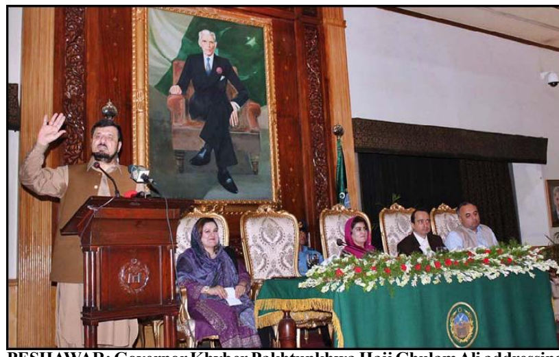
PESHAWAR: Governor Khyber Pakhtunkhwa Haji Ghulam Ali addressing during Women Excellence Award 2023 ceremony at Governor House.

Of whom, 614 people with serious injuries were shifted to different hospitals, while 539 people with minor injuries were treated on the spot by Rescue Medical Teams. Analysis show that 553 drivers, 30 underage drivers, 127 pedestrians, and 485 passengers.