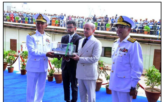
KARACHI: Chief of Naval Staff Admiral Muhammad Anjad Khan Niazi presenting a model of a ship to Prime Minister Muhammad Shehbaz Sharif during the launching ceremony of PNS Tariq.

The president appreciated the efforts of COMSTECH for enhancing cooperation among the Muslim nations in the field of science and technology.