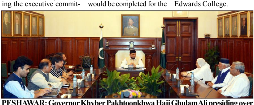
PESHAWAR: Governor Khyber Pakhtoonkhwa Haji Ghulam Ali presiding over a meeting regarding academic and administrative affairs of Edward College

Bishop Diocese of Peshawar lauded the efforts of the Governor to improve the education standard in the college and assured to make joint efforts for the betterment of Edwards College