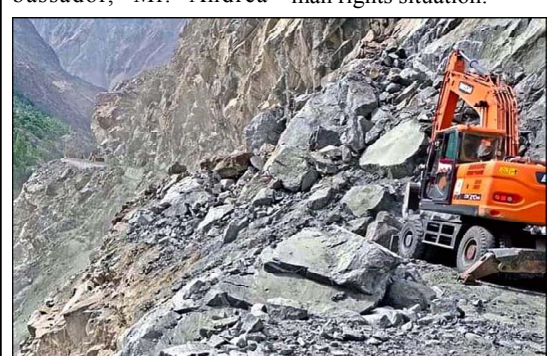
GILGIT: FWO workers busy in clearing block area of Juglote-Skardu road after land sliding during rain in city