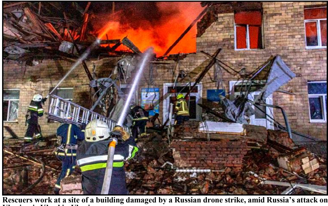
Ukraine, in Kharkiv, Ukraine.

"Everything the PLA (People's Liberation of Army) does is inherently political," Thompson said. 'When the Chinese military conducts an exercise, it is showing force - it is bestowing or sending a mes-