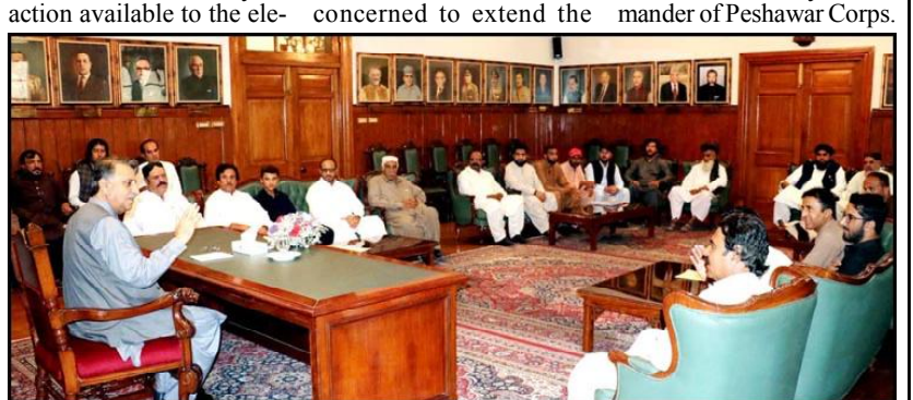
QUETTA: A delegation from different walk of life meeting with Governor Balochistan Malik Abdul Wali Khan Kakar

Earlier on arrival, the prime minister and COAS were received by Com-