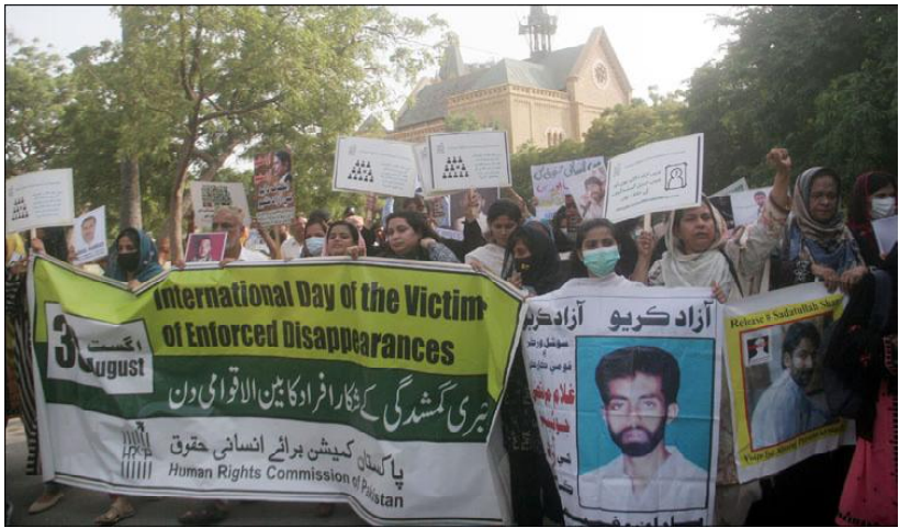
KARACHI: Activists of Pakistan Commission for Human Rights hold placards and banner during protest on the eve of International Day of the Victims of Enforced Disappearances, at Frere Hall in Provincial Capital.