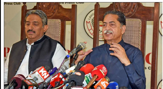
LAHORE: Former Federal Minister Mian Javed Latif addressing press conference at Press Club in Provincial Capital.

SUKKUR (APP): The Hindu community observed their brotherhood festival commonly known as 'Raksha Bandhan' at the main Sadhu Bela Temple here on Wednesday. Wearing colorful clothes, the participants observed their religious festival by tying the knot of protection and distributed sweets. They said that they used to observe the festival every year in this month, adding that Hindus celebrated the festival on sighting full moon in the lunar calendar's Savan or Sravana month, during which Hindu women used to tie a thread of Rakhi around their brothers' wrist and pray for their safety.