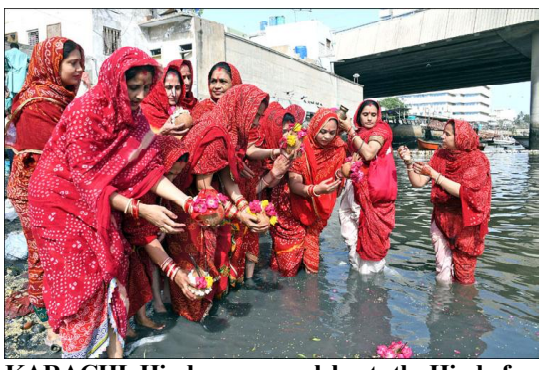
KARACHI: Hindu women celebrate the Hindu festival Raksha Bandhan at Laxmi Narayan Temple in Provincial Capital.