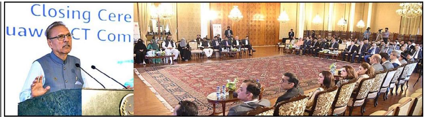
ISLAMABAD: President Dr. Arif Alvi addressing the closing ceremony of Huawei ICT Competition 2022-23 at Aiwan-e-Sadr.

petitions. The students from Pakistan had won second and third prize in the Network Track and third prize in the Innovation Track at the Huawei ICT Competition 2022-2023 Global Final concluded at Huawei Headquarters in Shenzhen, China. The first to be held in person since 2019, the event's culmination was a competition between finalists in 146 teams from 36 countries. The president said in today's time, every person irrespective of which filed he or she was in, should be familiar with the basics of modern technology including Artificial Intelligence, IT, and clouding etc. He said the political and bureaucratic leadership must also be equipped with the basic skills of IT and modern technology. He said a program was initiated by the government to train 1000 bureaucrats in IT field but despite several years, only 800 received the required training due to lack of will by the officers.