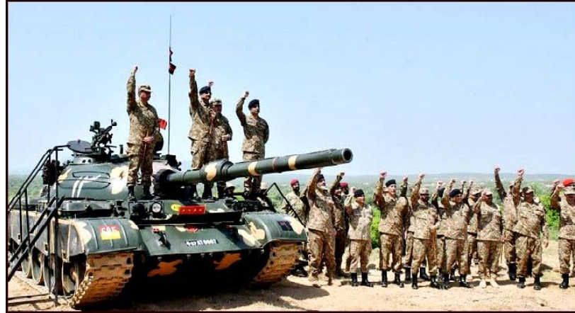
Chief of Army Staff (COAS) General Syed Asim Munir visited Tilla Field Firing Ranges near Jhelum on Wednesday, where he witnessed field fire and battle drills.

The chief justice said the court had to view the amendments in light of the provisions of Constitution.