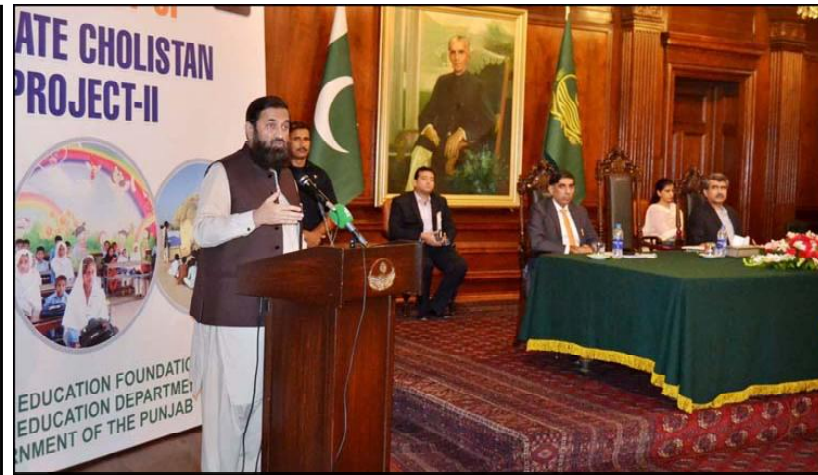
LAHORE: Governor Punjab Muhammad Balighur Rehman addressing the launching ceremony of Literate Cholistan Project Phase 2 organized by Punjab Education Foundation.

that his government will focus special attention on merit, transparency, and good governance in its day-to-day business, adding that the administrative secretaries of the provincial government has already been directed to take the necessary steps to this end. He urged the administrative secretaries to give honest and sincere advice to their concerned ministers with regard to the official business of the department. He further directed the cabinet members and administrative secretaries to identify corruption cases, if any, in their respective departments and initiate appropriate actions against those involved. The agenda for the meeting encompassed seven key points, notably the approval of project revisions, the establishment of a forensic science laboratory at Peshawar, the nomination of an administrative judge for anti-terrorism courts, and fixing matters relating to the Police Public School teachers' case in court. The meeting deliberations encompassed the approval of supplementary funding for the Forensic Science Laboratory in Peshawar and revisions to PCI for the Janikhel Bannu Police Station.