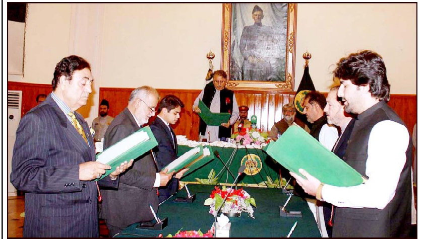
QUETTA: Balochistan Governor Malik Abdul Wali Khan Kakar administering oath of new Caretaker Ministers of Balochistan Assembly, Caretaker CM Ali Mardan Khan Domki is also present on the occasion

Soon after the oath taking, the Governor and caretaker Chief Minister greeted the new caretaker Provincial Ministers.