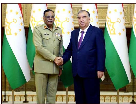
Chairman Joint Chiefs of Staff Committee (JCSC) General Sahir Shamsad Mirza meeting with President of Tajikistan Enomali Rahmon

While presenting the overview, the Deputy Chief of Naval Staff (Operations) outlined the objectives of the war game which was conducted in triservice format, with participants of relevant ministries and divisions as well.