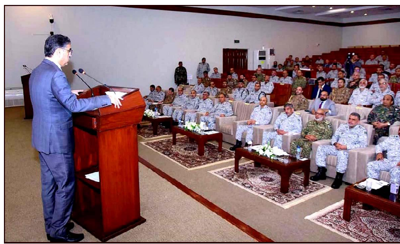
KARACHI: Caretaker Prime Minister Anwaar-ul-Haq Kakar addressing the debriefing session of Pakistan Navy's War Game "Shamsheer-e-Bahr IX".