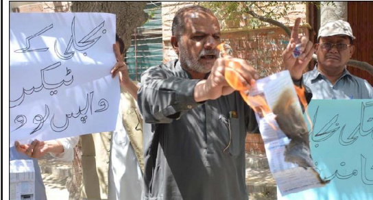
QUETTA: Activities of civil society burn electric city bill during protest outside QPC.

ISLAMABAD (INP): The National Electric Power Regulatory Authority (NEPRA) on Wednesday directed the power distribution companies (DISCOs) to improve their performance in 15 days and submit a report in that regard. "NEPRA will conduct a hearing after three weeks to review the performance of DISCOs", a news release said. NEPRA heard the request of Central Power Purchasing Agency (CPPAG) regarding monthly fuel adjustment charges of Rs 2.07 per unit for the month of July. However, during the hearing the CPPAG reviewed its request from Rs. 2.07 to Rs. 1.57 per unit raise on account of FCA.