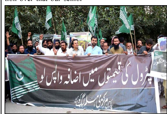
QUETTA: Activists of Pakistan Markazi Muslim League hold a protest rally against increase in electricity, gas and petroleum prices.