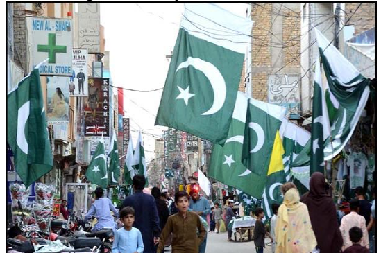
QUETTA: A view of national flag install on bazaar for selling purpose on ahead of 76th Pakistan Independence

the district officers and other concerned high ups reviewed the situation likely to be emerged due to the rains in coming days. He on the occasion asked all concerned to take necessary steps for removing encroachments and hurdles established on the nullahs in different parts of the city and its suburb. He also directed to prepare plan for presence of the necessary machinery and ensure their functioning. He mentioned that the survey of all small and big nullahs have been completed in Quetta and all the concerned administrative officers are fully alert to tackle any emergent situation and shift the people to the safer places in case of the rains.