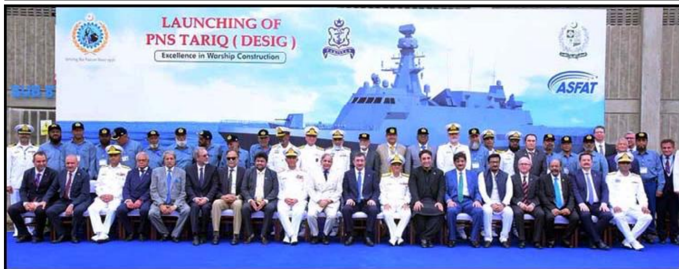
KARACHI: Prime Minister Muhammad Shehbaz Sharif, Turkiye's Vice President Cevdet Yilmaz and other dignitaries in a group photo at the launching ceremony of Pakistan's 4th MILGEM Corvette "PNS Tariq".