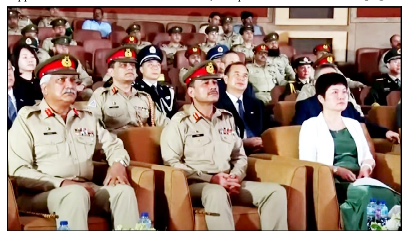
ISLAMABAD: Chief of Army Staff (COAS), General Syed Asim Munir attending 96th anniversary of the founding of the People's Liberation Army (PLA) of China commemorated at General Headquarters (GHQ)