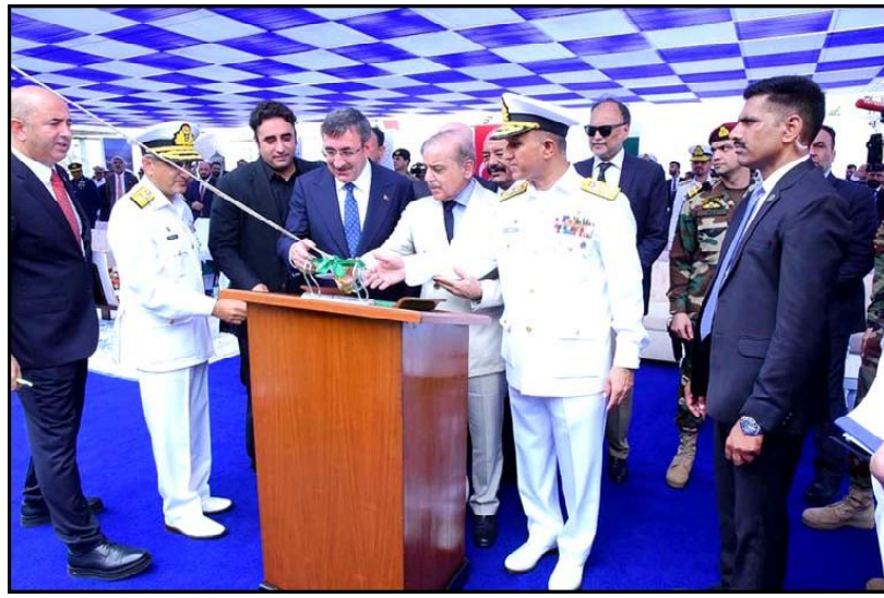
KARACHI: Prime Minister Muhammad Shehbaz Sharif, Türkiye's Vice President Cevdet Yilmaz and Chief of Naval Staff Admiral Muhammad Amjad Khan Niazi applaud after cutting a rope to launch Pakistan's 4th MILGEM Class Corvette "PNS Tariq" into sea at Karachi Shipyard & Engineering Works.

The SC maintained let high court decide first. If you don't get relief then the case is pending hearing in SC.