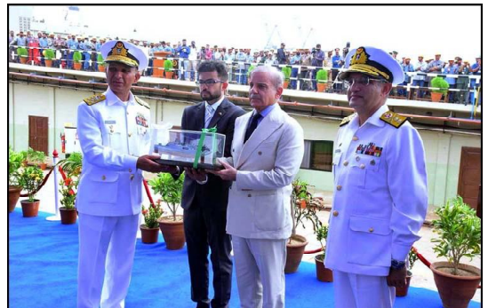
KARACHI: Chief of Naval Staff Admiral Muhammad Amjad Khan Niazi presenting a model of a ship to Prime Minister Muhammad Shehbaz Sharif during the launching ceremony of PNS Tariq.

He said that now the manufacturers have announced to lower the price of WHO prequalified hepatitis B and C drugs in low-and middle-income countries. This has been a concerted effort by partners to ensure affordability and accessibility to hepatitis treatment, he added. He said that these new drug prices will significantly reduce the cost of treatment to low and middle-income countries, and scale up hepatitis programs to meet growing demand, all towards eliminating hepatitis. He said that the WHO and all stakeholders will ensure the affordability and accessibility of medicines, testing and treatment to millions in low and middle-income countries.