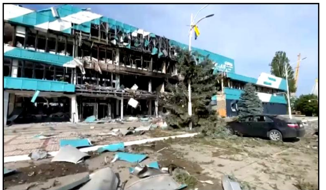
A general view of damaged property, following a Russian drone attack, amid Russia's attack on Ukraine, at Izmail, Odesa region, Ukraine.

Earlier on Wednesday, Russia attacked Ukraine's main inland port on the Danube River, sending global food prices higher as Moscow ramps up its use of force to reimpose a blockade of Ukrainian grain exports. The port, across the river from NATO-member Romania, has served as the main alternative route out of Ukraine for grain exports since Russia reintroduced its de facto blockade of Ukraine's Black Sea ports in mid-July.