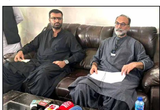
KHUZZAR: Former Senator Nawabzada Haji Lashkari Khan Raisani addressing a Press conference

The minister also introduced the Press Council of Pakistan (Amendment) Bill, 2023, advocating for the replacement of the term "Government" with the phrase "secretary of the division to which business of the Council stands allocated" in section 8, in subsection (1), in clause (xiii) of the Press Council of Pakistan Ordinance, 2002 (XCVII of 2002). The two bills underwent a thorough examination by the Standing Committee on Information and Broadcasting and its reports were presented in the House.