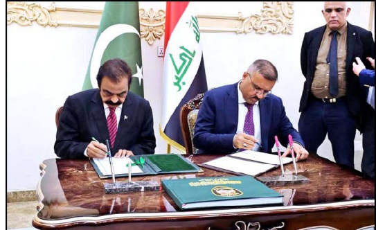
BAGHDAD: Federal Minister for Interior Rana Sana Ullah Khan and Interior Minister of Iraq Abdul Amir Al Shammari during an agreement signing ceremony.

Foreign Office expressed deep concern and condemnation over the continued involvement of Afghan terrorists in terrorist activities in Pakistan and the use of Afghan territory for terrorism within Pakistan.