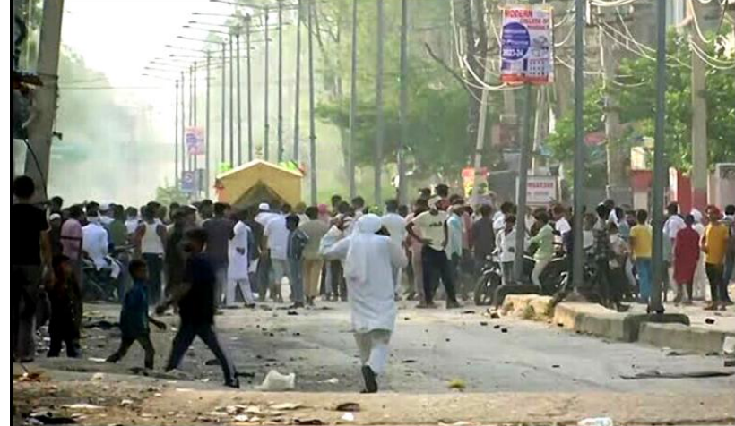
Communal clashes in Nuh, Haryana, during VHP procession. Anjuman Masjid set ablaze; 3 injured, 1 deceased. 2 home guards killed, dozen cops injured.