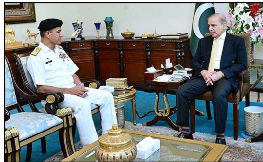
ISLAMABAD: Chief of Naval Staff Amjad Khan Niazi calls on Prime Minister Muhammad Shehbaz Sharif.

Minister for Parliamentary Affairs Murtaza Javed Abbasi moved the Toshkhana (Management and Regulation) Bill, 2023 and the Pakistan Airports Authority Bill, 2023. Both bills were passed by the House as the Senate has already approved both legislative proposals. The Toshkhana Management and Regulation Bill 2023 passed by the house today envisaged that the existing and future gifts to be received in Toshkhana shall be disposed of through an open auction. The proceeds of such an auction shall be kept in a separate account and will be utilized for promoting female primary education in the most backward areas of the country. Three private members' bills passed by the House included the Promotion and Protection of Gandhara Culture Authority Bill, 2023; the Margalla International University Bill, 2023 and the Thar International Institute Bill, 2023.