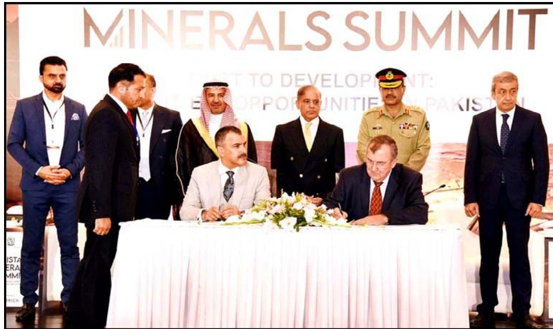
ISLAMABAD: Prime Minister Muhammad Shehbaz Sharif and COAS General Syed Asim Munir witnessing the signing of MoUs for increasing foreign investment in the mining industry of Pakistan during Pakistan Mineral Summit.

Ph: 2841470/2841473 Vol: XVI No. 80, Muharrumul Haram 14, 1445 AH Wednesday August 02, 2023, Pages 08, Price Rs.15