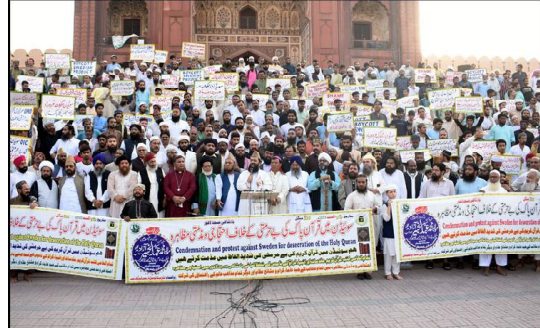
LAHORE: Activists of Majlis-e-Ulema Pakistan hold a protest against the burning of the Quran in Sweden, at Badshahi Mosque in Provincial Capital.

behind the Women Development Sector Plan is to eliminate the domestic violence and gender based discrimination through good governance and response to the gender based discriminatory attitude against women. This is also aimed at empowering women socially, economically and politically in the province, the official hand out mentioned.