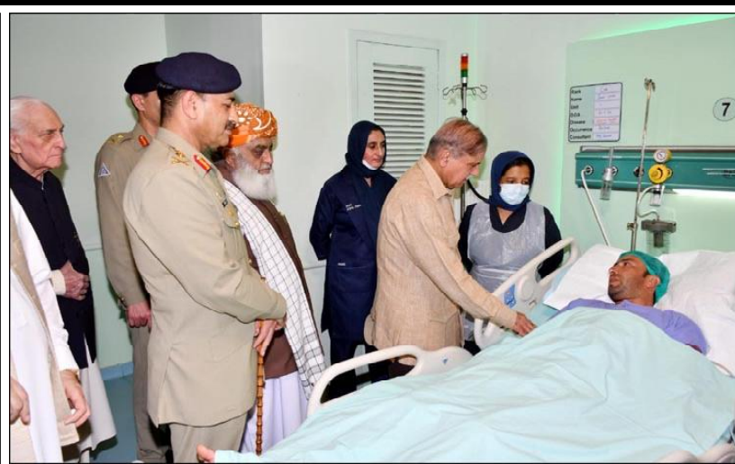
Prime Minister Muhammad Shehbaz Sharif and Chief of Army Staff General Syed Asim Munir visiting those injured in Khaar (Bajaur) suicide blast in CMH Peshawar