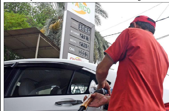
KARACHI: worker pumps petrol in a car at a fuel station, in Provincial Capital. As Pakistan announced an increase in petrol and diesel prices.

did not allow such heinous acts as well as terrorist attacks. He said the people of KP province had rendered immense sacrifices against terrorism. He reiterated that the elimination of terrorism and extremism from the country was inevitable. He said the terrorists were enemies of the country and the nation, and that they would never succeed in their evil designs.