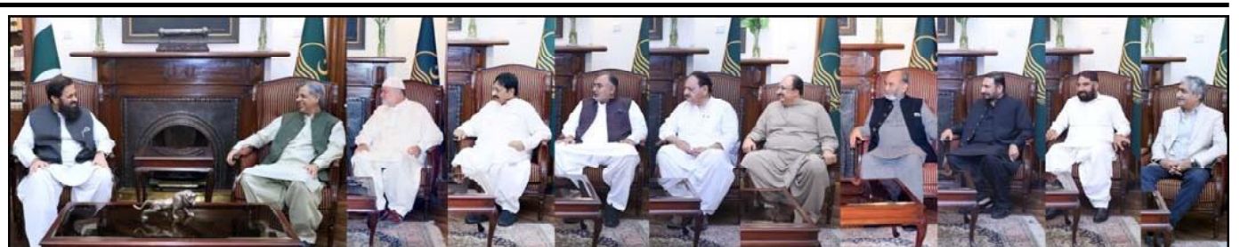
LAHORE: Federal Law Minister Azam Nazir Tarar, MNAs and former provincial ministers meeting with Governor Punjab Muhammad Balighur Rehman

PESHAWAR (APP): Chief of Jamiat Ulama-e-Islam (JUI), Maulana Fazal-ur-Rehman Tuesday visited Lady Reading Hospital Peshawar and enquired after the health of Bajaur blast victims. He prayed for early recovery of injured and extended cooperation to families of blast victims. He said we would not discourage and budge from resolve by these acts of cowardice. JUI Chief said that our party would not be deterred by these acts that are meant to disrupt peace and serenity in the country. He said we praised the composure of party workers who remained calm despite facing the tragedy.