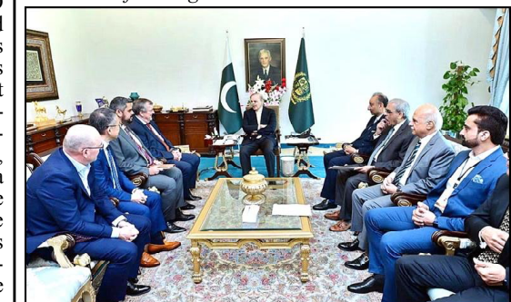
ISLAMABAD: A delegation of Barrick Gold led by CEO Mark Bristow calls on Prime Minister Muhammad Shehbaz Sharif.

ISLAMABAD (APP): The National Assembly on Tuesday passed three resolutions including renaming Gwadar International Airport as Feroz Khan Noon Airport and taking immediate steps to ensure payment of minimum wage to the employees in public and private institutions. The house also passed a resolution recommending the government to rename Gwadar International Airport as Feroz Khan Noon saying it will be a tribute to the former Prime Minister. The Caucus will serve as a liaison between the Federal government and the Pakistan Engineering Council, the resolution further said. The resolutions were moved by Aliya Kamran, Rana Asim Noon and Engineer Sabir Kaimkhani in the House respectively. The house also passed a resolution recommending the government to rename Gwadar International Airport as Feroz Khan Noon saying it will be a tribute to the former Prime Minister.