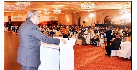
ISLAMABAD: Finance Minister Senator Mohammad Ishaq Dar addressed the closing session of Pakistan Minerals Summit "Dust to Development: Investing opportunities in Pakistan".

These centers would be established in different universities in Pakistan. Among them are National Center for Quantum Computing Lahore University of Management Sciences Lahore, Ghulam Ishaq Khan Institute of Engineering Sciences and Technology University of Engineering and Technology, Karachi and Institute of Computer Science, University of Engineering and Technology Lahore.