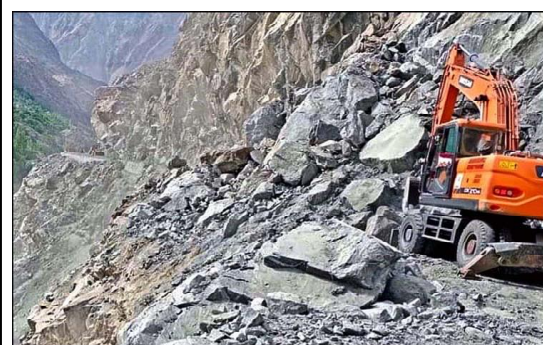
GILGIT: FWO workers busy in clearing block area of Juglote-Skardu road after land sliding during rain in city.

court. The judge inquired whether the accused was satisfied with his answers, and to this Imran Khan answered affirmation. As the hearing began, the judge asked the former prime minister if he was going to read the questions and he (Imran Khan) could answer if he wanted. In his statement, the former prime minister said that he had not heard the statements of the complainant as these were not recorded in his presence. He said that even the charges against him were not read in his presence.