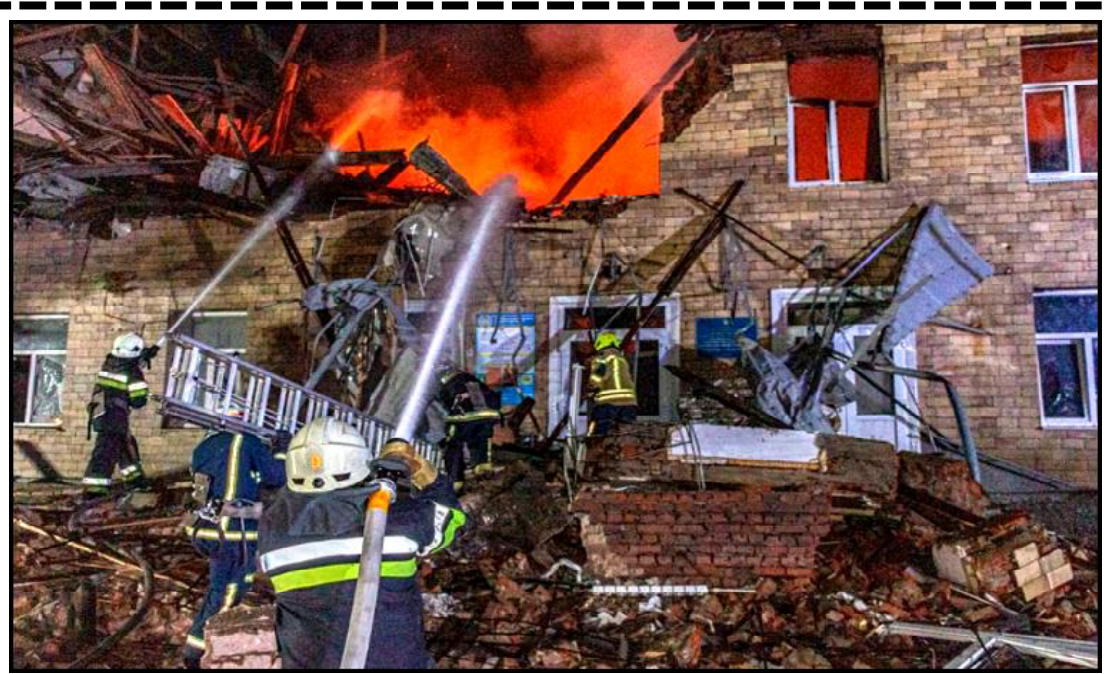
Rescuers work at a site of a building damaged by a Russian drone strike, amid Russia's attack on Ukraine, in Kharkiv, Ukraine.