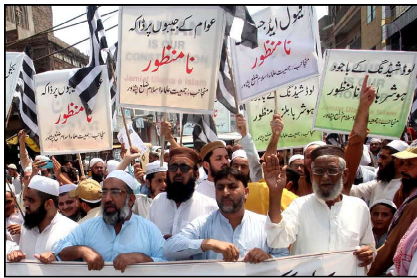
PESHAWAR: Members of Jamiat Ulema-e-Islam (JUI-F) are holding protest demonstration against the highly inflated electricity bills, held in Peshawar.

The region's untapped potential, brimming with natural resources will not only bring about positive change in the lives of the local population but open a gateway of prosperity for the whole country.