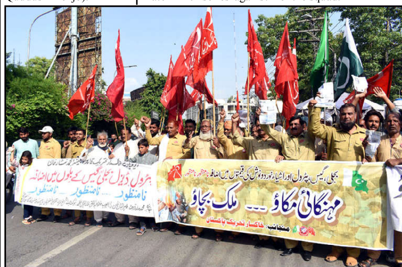
LAHORE: Activists of Khaksar Tehreek chanting slogans during protest against the surge in petrol and electricity prices as Pakistan endures soaring inflation, outside press club in Provincial Capital.

Officials of Power Division said that there was an increase of 7.5 rupees per unit for consumers falling in other categories. In July 2022, the maximum electricity tariff was 31.02 rupees per unit. In August 2023, the price of electricity is 33.89 rupees per unit.