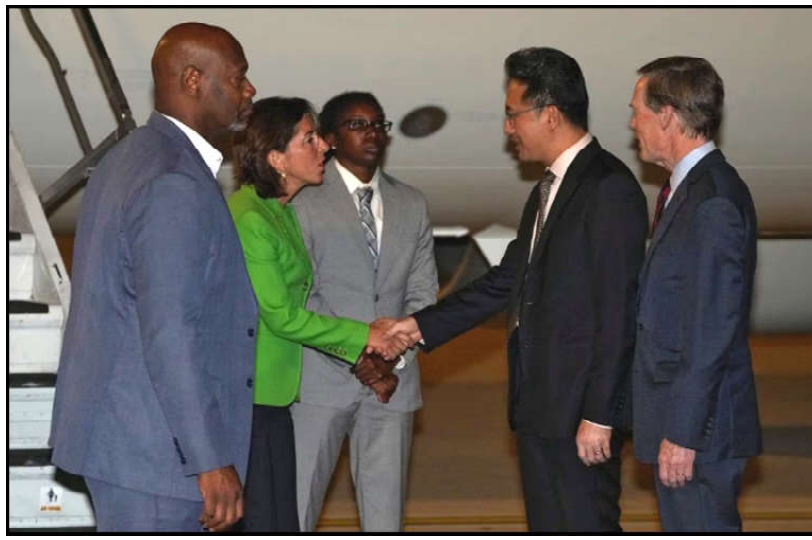
U.S. Commerce Secretary Gina Raimondo, shakes hands with Lin Feng, Director General of China Ministry of Commerce as U.S. Ambassador to China Nick Burns looks on as she arrives at the Beijing Capital International Airport in Beijing.