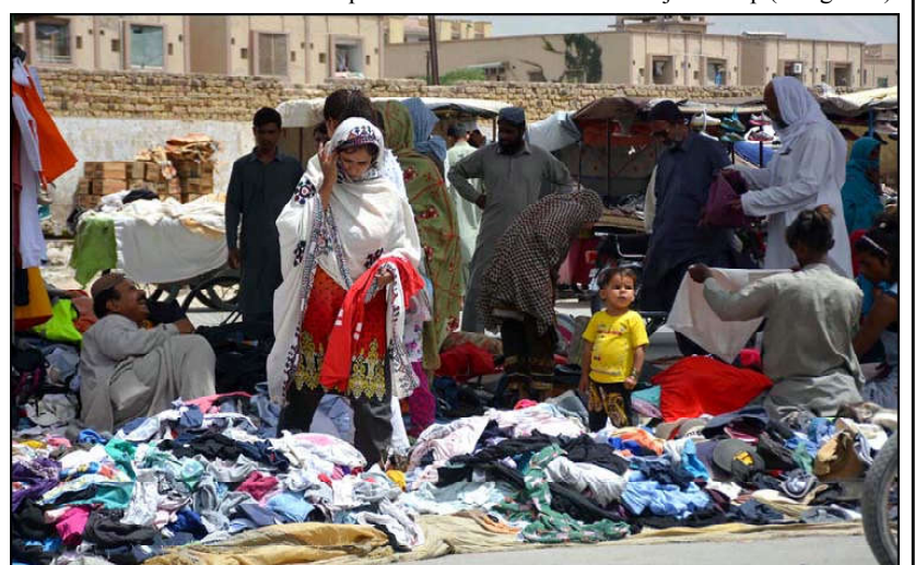
QUETTA: People buying used clothes from weekly Sunday Bazar at Joint road.

Giving the details, he said, "Two highly luxurious coaches have been allocated for the Prime Minister's Secretariat while four coaches have been allocated for the Minister for Railways, Secretary/Chairman of Railways, and another senior official in the ministry." The official said, "Only one salon has been allocated to the federal government while one each has been allocated to the Governors of Sindh, Balochistan, Punjab, and the provincial governments."