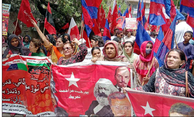
HYDERABAD: Members of Sindh Left Front (SLF) are holding protest demonstration against massive unemployment, increasing price of daily use products, inflation price hiking and the highly inflated electricity bills.