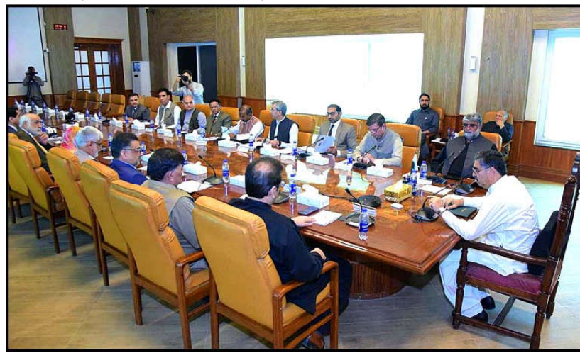
QUETTA: A delegation of Vice Chancellors of Public Sector Universities of Balochistan called on Caretaker Prime Minister Anwar-ul-Haq Kakar.