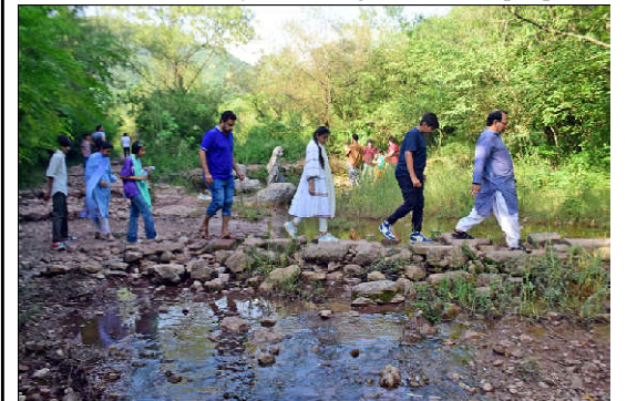
ISLAMABAD: Visitors are enjoying in waterfall at Trail-5, Federal Capital.

They urged the Kashmiris, living in Azad Jammu and Kashmir, Pakistan and abroad to hold protest rallies and demonstrations on the martyrdom anniversary of Syed Ali Gilani and draw the attention of the international community towards the plight of enslaved and besieged Kashmiri people.