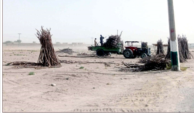
QUETTA: Laborers are busy in unloading woods from truck to earn their livelihood for support their families

Several members of England's provisional squad have had quiet tournaments in the Hundred - including Liam Livingstone, perhaps Brook's nearest equivalent as a power-hitter - but there is no obvious like-for-like switch which would maintain the balance of the squad.