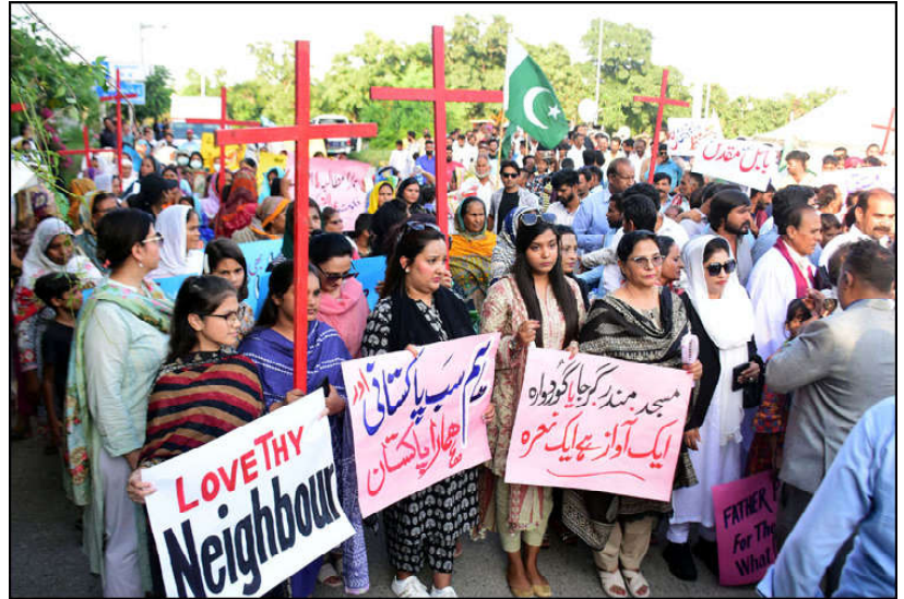
ISLAMABAD: Members of Christians community hold the holy cross and banner reading 'Justice should be given to the Christian community victims of Jaranwala tragedy' during a protest outside national press club.

"As and when these areas are developed and completed, the new parks will be there to meet the demand and requirement of the general public as per CDA approved layout plan," they added.