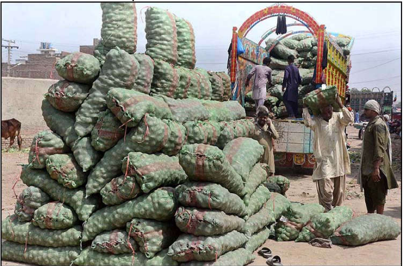
MULTAN: Labourers busy in unloading sacks of potatoes from delivery truck at Vegetable Market.

Amid the eco-political uncertainty, the Federal Investigation Agency (FIA) has been grappling with an increasing number of fake visa agents, human smugglers, and human traffickers. Over the last few years, the agency has