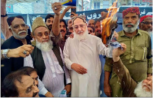
SUKKUR: Members of All Sukkur Small Traders Alliance are holding protest demonstration against massive unemployment, increasing price of daily use products, inflation price hiking and the highly inflated electricity bills, held in Sukkur.

"Mango is not only delicious but also boasts an impressive nutritional profile one of its most impressive nutrient facts is that just 1 cup (165 grams)