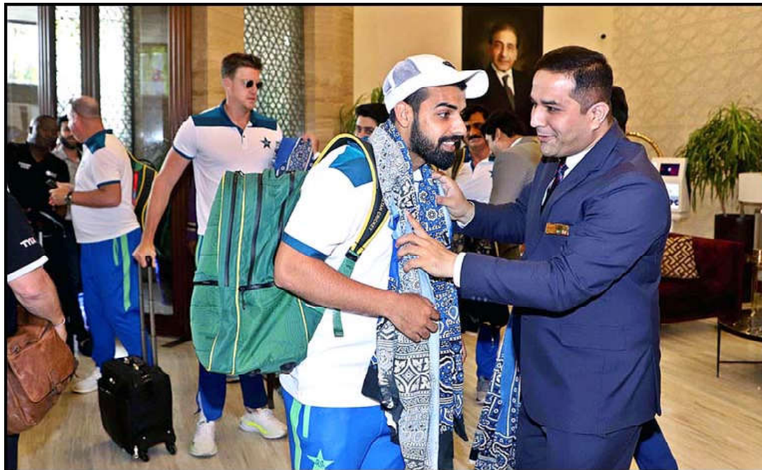
MULTAN: Pakistan cricket team arrived for the upcoming First match of Asia Cup 2023 between Pakistan and Nepal teams at Multan Cricket Stadium.

LAUDERHILL (INP): The New York Warriors became the first team to reach the US Masters T10 League Final after defeating California Knights by 8 wickets in Qualifier 1. The New York Warriors restricted the California Knights to 96/4 in their 10 overs before chasing down their target in 8.4 overs. The New York Warriors' opening batters Tillakarathne Dilshan and Kamran Akmal fell early in the innings as the Warriors were reduced to 28/2 in 3.3 overs. However, Misbah-ul-Haq brought the momentum towards his team's side through a six and a boundary off Devendra Bishoo's bowling in the sixth over.