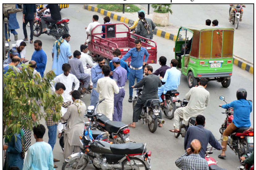
ISLAMABAD: Traffic wardens are issuing challan to motorcyclists against riding motorcycle without helmets at Raja Bazaar area in the city.

On December 17, 2012, the UN designated September 5 as the International Day of Charity, which was first celebrated in 2013.