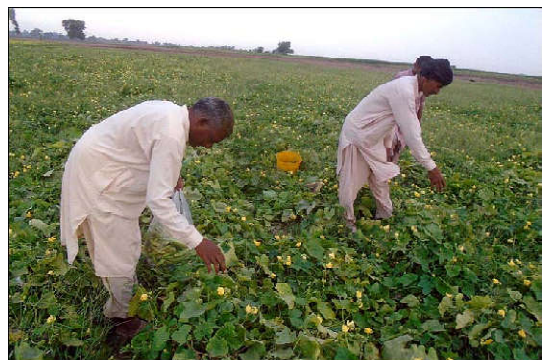
CHINIOT: Farmers busy in plucking vegetable from field to transport to vegetable market.

He said the season of sowing the wheat crop would start soon and requested the caretaker government to take action against hoarding and overpricing to prevent the common people from suffering food price.