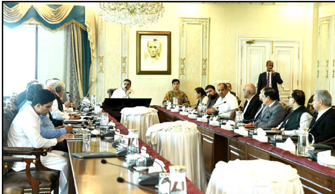
Caretaker Prime Minister Anwar-ul-Haq Kakar chairing an emergency meeting regarding electricity bills at the Prime Minister's House Islamabad.