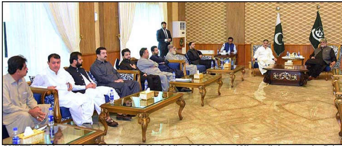
QUETTA: A delegation from Balochistan led by Sahibzada Muhammad Khan called on caretaker Prime Minister Anwaar-ul-Haq Kakar.

Ahmed's story reflects the experiences of many educated Pakistanis who are increasingly seeking opportunities abroad to escape the country's persistent economic crisis.