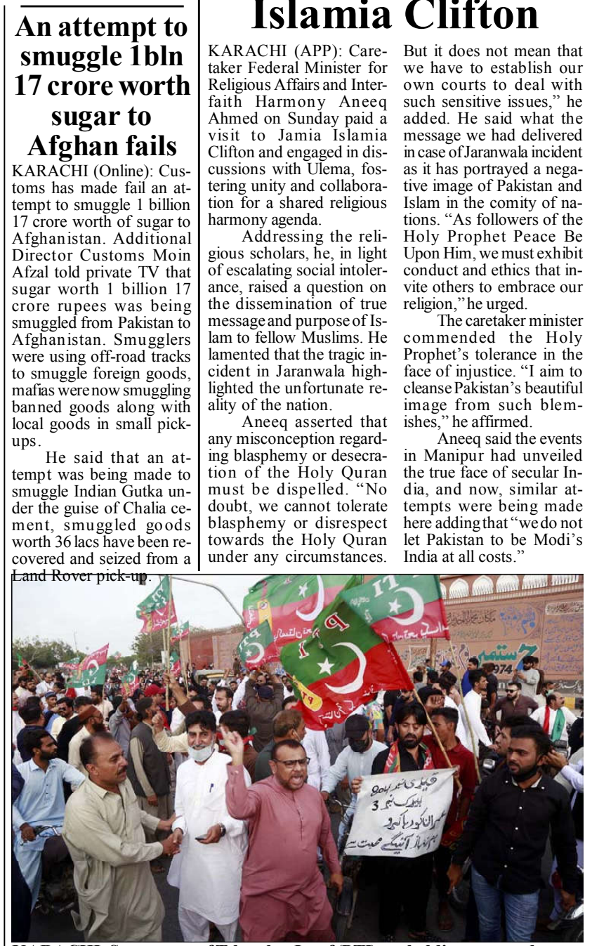
KARACHI: Supporters of Tehreek-e-Insaf (PTI) are holding protest demonstration in favor PTI Chief Imran Khan and demanding of released from Jail, held at M.A. Jinnah road in Karachi.