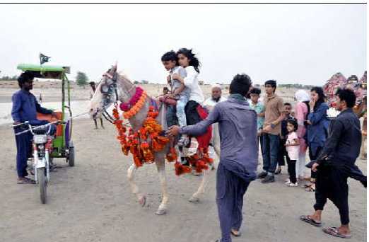
HYDERABAD: People are enjoying pleasant evening and cooling themselves during cloudy weather of summer season, at River Indus in Hyderabad.