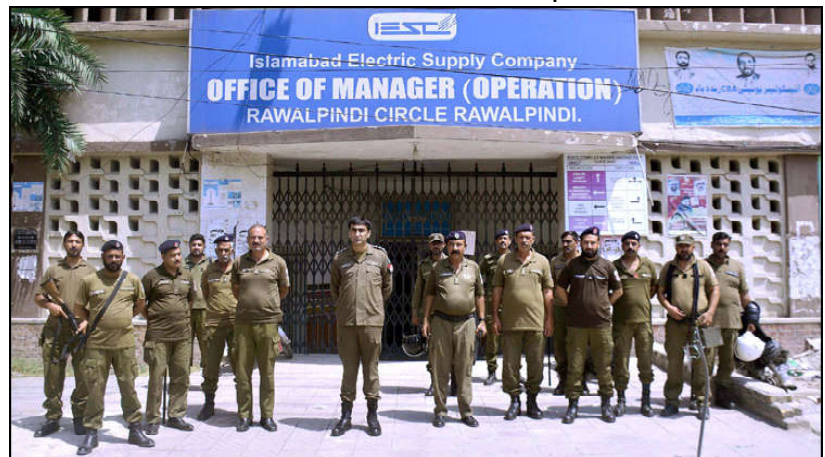
ISLAMABAD: Police personals stands alert outside IESCO office of Manager (Operation) Rawalpindi circle in the city. As IESCO's request, Rawalpindi police have deployed over 500 personnel to provide security for electricity offices to avoid "unpleasant" situations.