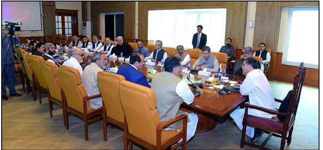
QUETTA: A delegation of Quetta Chamber of Commerce and Industry calls on Caretaker Prime Minister Anwaar-ul-Haq Kakar

During the meeting, the caretaker prime minister also assured the delegation of the resolution of their issues. Separately, a delegation led by Sahibzada Muhammad Khan also called on Caretaker PM Kakar. The delegation felicitated the prime minister on assuming his duties and expressed good wishes.