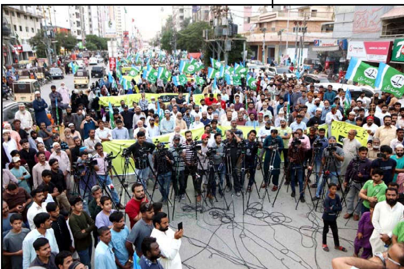
KARACHI: Leaders and activists of Jamat-e-Islami (JI) are holding protest demonstration against massive unemployment, increasing price of daily use products, inflation price hiking and the highly inflated electricity bills, held in Karachi.