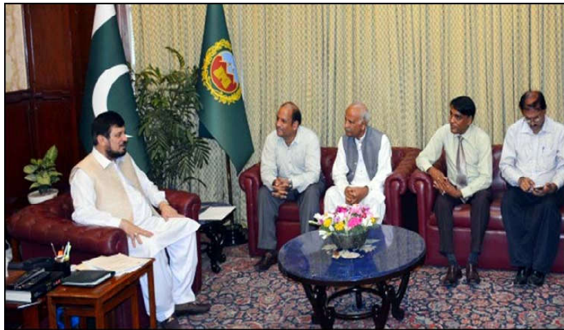
PESHAWAR: A delegation led by Priest Rauff Masih of the Seventh Day Adventist Church meeting with Governor Khyber Pakhtunkhwa, Haji Ghulam Ali.

Khosa hoped for relief measures from the caretaker government, and urged individuals to work for the country's betterment.