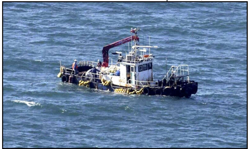
A boat collecting seawater for monitoring radioactive materials in the sea is seen near the Fukushima Daiichi Nuclear Power Plant, after the nuclear power plant started releasing treated radioactive water into the Pacific Ocean, in Okuma, Fukushima prefecture, Japan.

Monitoring Desk LONDON: Only two migrants who arrived in the UK by crossing the English Channel have been deported to Europe under the post-Brexit agreement, figures from the Home Office reveal. The post-Brexit returns policy, introduced in 2021, allows officials to deem migrants "inadmissible" if they travelled through a safe third country to reach Britain. But zero migrants were considered "inadmissible" in the past year and just two were deported.