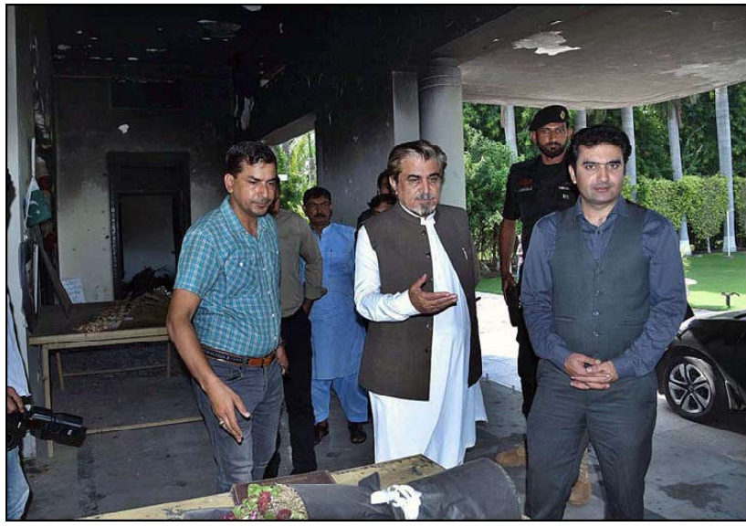
LAHORE: Caretaker Federal Minister for National Heritage & Culture Syed Jamal Shah is visiting Jinnah House.

The delegation expressed gratitude to the Governor for his willingness to address their concerns and offer cooperation in finding solutions. They also commended the steps taken by the Governor for promoting education in the province.