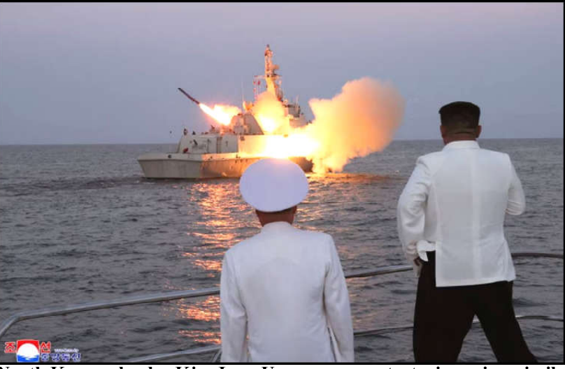
North Korean leader Kim Jong Un oversees a strategic cruise missile test aboard a navy warship this photo released by North Korea's Korean Central News Agency.

Nearly 50 plane flights in and out of the capital were disrupted after Russia said it jammed a Ukrainian drone in the Ruzsky district west of the capital and destroyed another one in the Istrinsky district nearby.