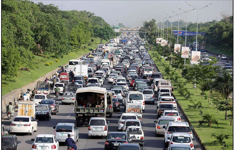
ISLAMABAD: A view of massive traffic jam at Expressway in the Federa Capital.

It further said that the petitioner had also not approached the relevant fo rum prior to filing the case before the SC. Moreover the petitioner also could not explain that which of his basic rights had been affected.