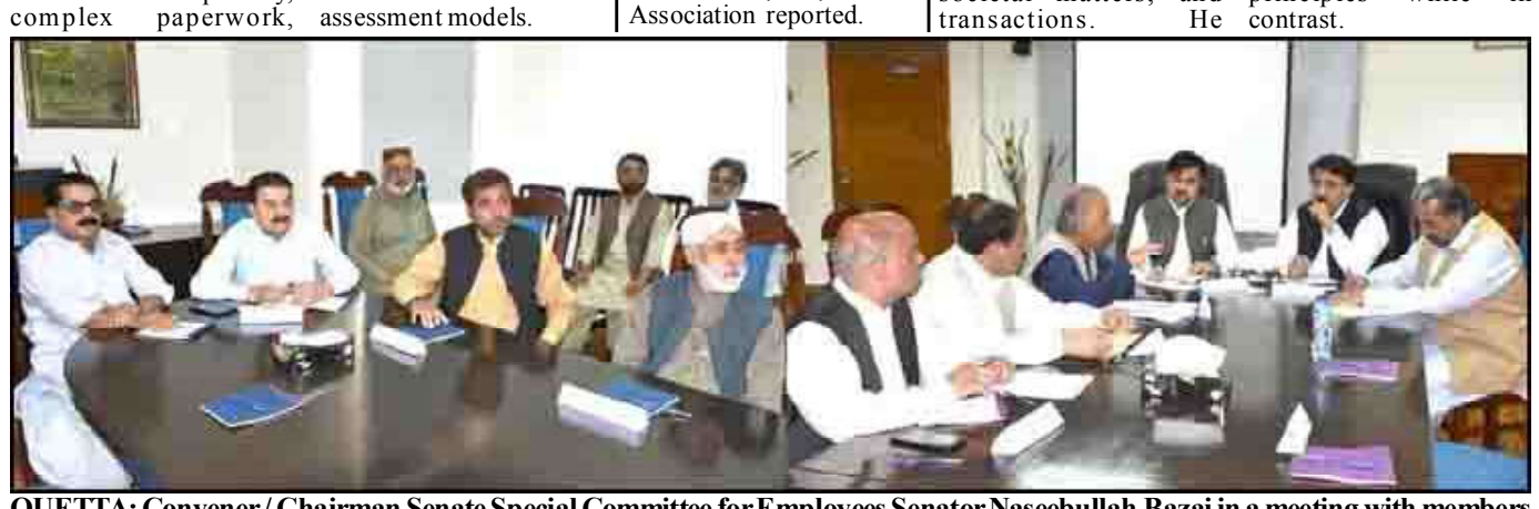
QUETTA: Convener / Chairman Senate Special Committee for Employees Senator Naseebullah Bazai in a meeting with members of National Bank Employees Union at NBP head office

commodities of exports commodities of imports during July, 2023 were during July, 2023 were petroleum products (Rs. 100,204 million).