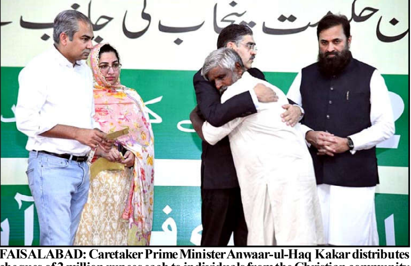
FAISALABAD: Caretaker Prime Minister Anwaar-ul-Haq Kakar distributes cheques of 2 million rupees each to individuals from the Christian community whose residences were damaged due to mob violence in Tehsil Jaranwala.