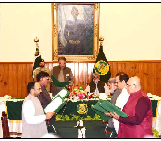
QUETTA: Governor Balochistan MalikAbdul Wali Khan Kakar administering the oath of office to members of the caretaker provincial Cabinet. Caretaker Chief Minister Balochistan Mir Ali Mardan Khan Domki is also present