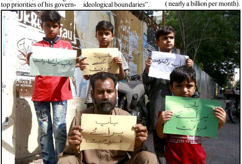
KARACHI: Resident of Orangi Town along with his children are holding protest demonstration against massive unemployment, increasing price of daily use products and inflation price hiking, held at Karachi press club.

Referring to the subsidy given on flour, the tomed to making false prime minister said that the government spent a huge chunk of money on subsidy (nearly a billion per month)