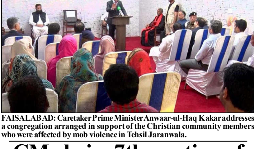
a congregation arranged in support of the Christian community members who were affected by mob violence in Tehsil Jaranwala.

thorough discussion decided to expedite work on the ongoing development schemes, and to accelerate work on the foreign-funded projects so As it was pointed out that they could be the dacoits had completed well in time.