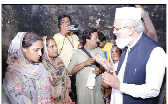
FAISALABAD: Ameer of Jamaat-e-Islami Sirajul Haq meet afftectees of Jaranwala incident during