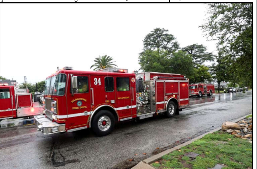
Pasadena Fire Department vehicles attend to a fire call following a magnitude 5.1 earthquake in Southern California, in the midst of the approach of Tropi cal Storm Hilary, in Pasadena, California, U.S.

The prosecution said Letby attacked her young and often prematurely born victims by either injecting them with air, overfeeding them with milk or poison ing them with insulin.