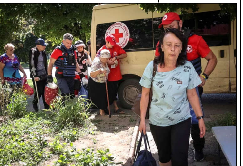
Red Cross volunteers help local residents to evacuate from the city of Kupiansk-Vuzlovyi in Kharkiv region, amid Russia's attack on Ukraine, in