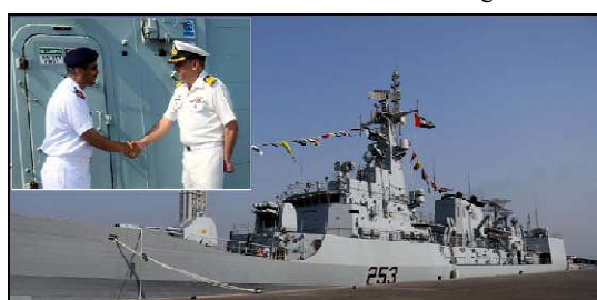
Commanding Officer PNS SAIF receiving Base Commander UAE Naval Forces on board during Pakistan Navy Ship's visit to UAE

During the port stay, various bilateral activities including exchange visits onboard UAE Naval units. orientation visits of miliwere discussed and en- tary installations and coor-