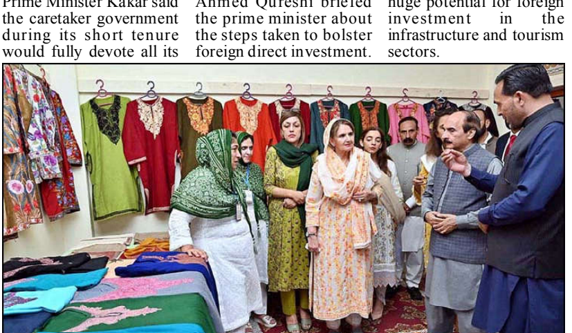
MUZAFFARABAD: First Lady Begum Samina Alvi viewing the handiwork of artisans during her visit to TEVTA Vocational Training Institute.