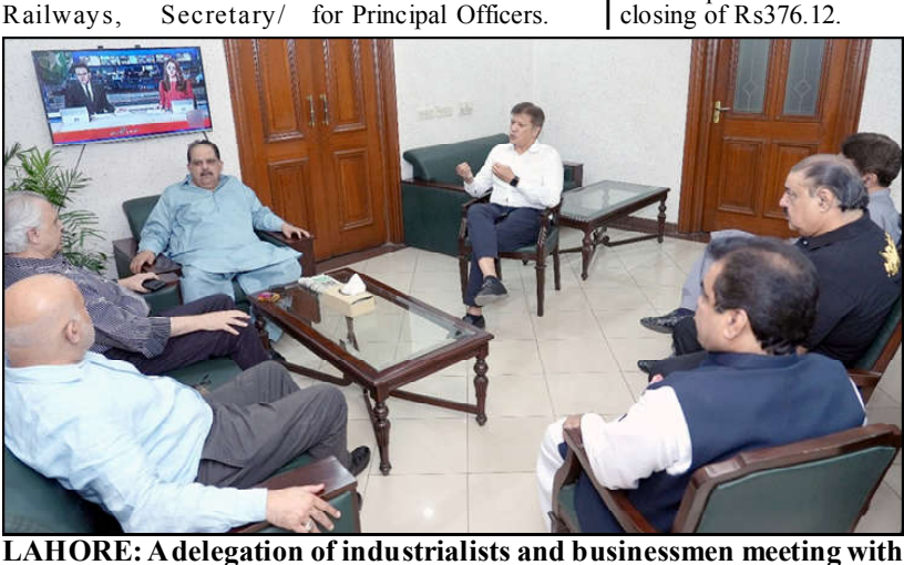
Provincial Minister Provincial Minister for Industries and Commerce

ISLAMABAD (APP): Pakistani rupee on Thursday gained 02 paisa against the US dollar in the interbank trading and closed at Rs294.91 against the previous day's closing of Rs294.93. However, according to the Forex Association of Pakistan (FAP), the buying and selling rates of the dollar in the open market stood at Rs302 and Rs304 respectively. The price of the Euro decreased by Rs1.61 to close at Rs320.75 against the last day's closing of Rs322.36, according to the State Bank of Pakistan (SBP). The Japanese Yen closed at Rs 2.01, whereas a decrease of 58 paisa was witnessed in the exchange rate of the British Pound. which traded at Rs375.54 as compared to the last closing of Rs376.12.