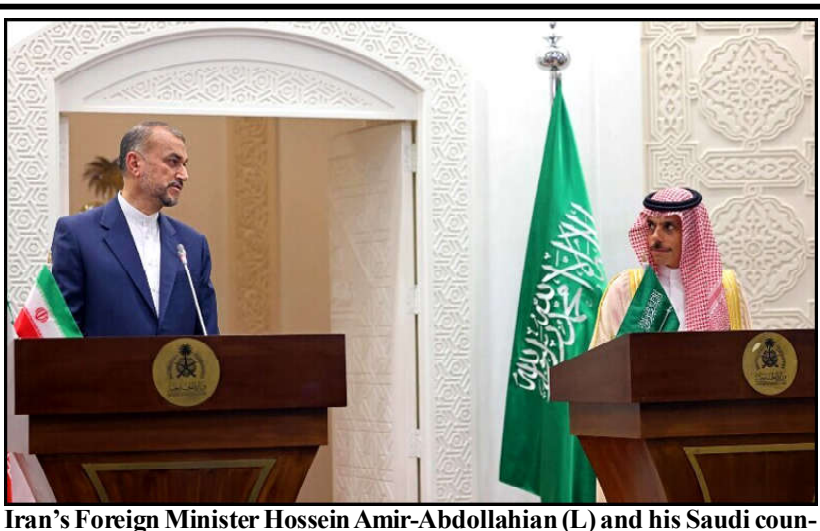
terpart Faisal bin Farhan hold a joint press conference in Riyadh.