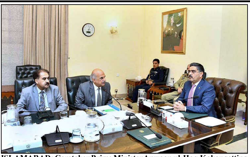
ISLAMABAD: Caretaker Prime Minister Anwaar-ul-Haq Kakar getting briefing about steps taken to bolster Foreign Direct Investment by SIFC officials.