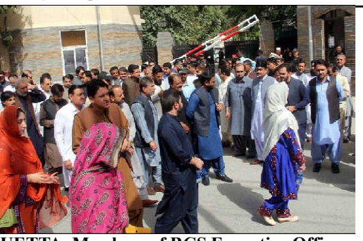
OUETTA: Members of BCS Executive Officers Welfare Association Balochistan are holding protest demonstration for acceptance of their demands, outside Chief Minister House in Quetta.