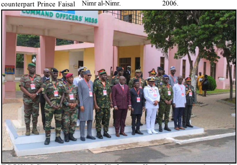
ECOWAS Committee of Chiefs of Defense staff pose for a group photo at the headquarters of the Ghana Armed Forces as they meet on the deployment of its standby force in the Republic of Niger, in Accra, Ghana.

one-day stop in Riyadh came two months after Prince Faisal became the first Saudi foreign minister to travel to Iran since