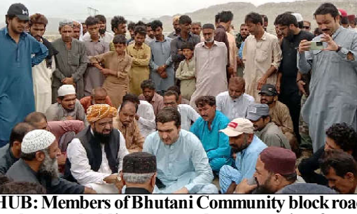
HUB: Members of Bhutani Community block road as they are holding protest demonstration for acceptance of their demands, at Hub river road.

regretted for any inconvenience to be caused to the consumers due to suspension of gas supply.