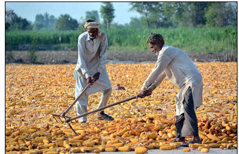
FAISALABAD: Labourers spreading corn cobs for drying purpose.