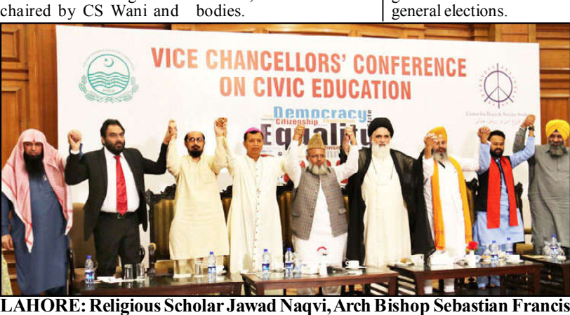
Shaw and scholars of religion rises hands to show solidarity during the Vice Chancellor Conference on Civic Education by Punjab Education Department at local hotel in Provincial Capital.

Pakistan People's Party will serve the people after get elected in the next general elections.