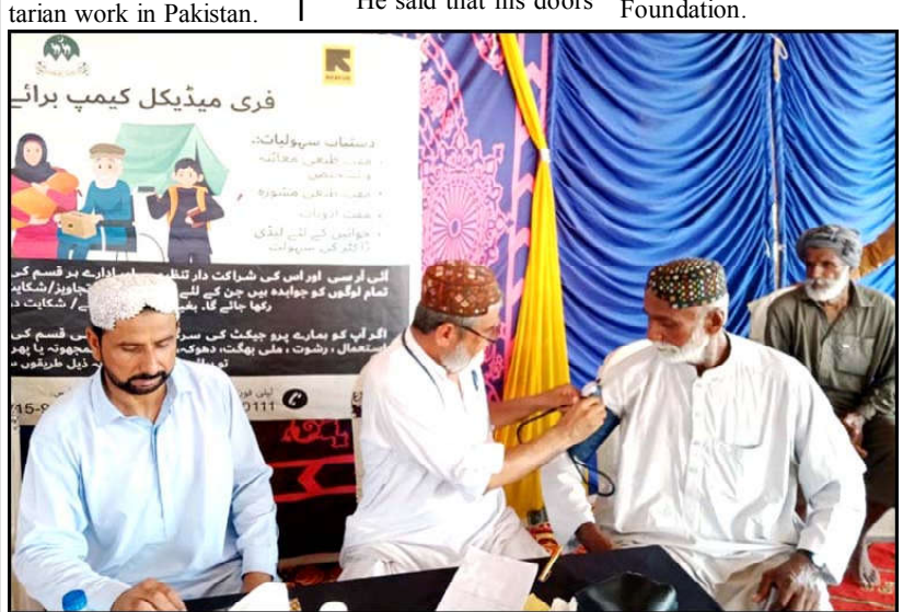
NASEERABAD: Patient is being examine by doctor during the free medical camp organized by International Rescue Committee, held in Naseerabad.

the Governor about overall performance and functioning of Khidmat-e-Khalq Foundation