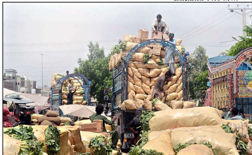
MULTAN: Labourers busy unloading vegetables on the delivery truck at the vegetable Market.

Swiftly following the accord's approval, the foreign exchange reserves strengthened as Saudi Arabia and the United Arab Emirates deposited $2 and $1 billion respectively, lifting the reserves up to around $13 billion from a very low.