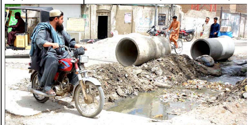
QUETTA: A view of sewerage water accumulated on Sirki Road Gawalmandi Chowk which creating problems for motorists need attention of concerned authorities.

with an effective mechanism that must ensure that every single decision or policy which directly or indirectly affects trade and industry, must be devised in consultation with the business and industrial community. They were of the opinion that the federal government has to pay attention to some of the most pressing issues of Balochistan particularly improving the infrastructure of Quetta and Gwadar. In order to ensure sustainable economic prosperity, the caretaker federal government has to review all the policies so that the sense of deprivation felt by Balochistan may be negated. They stressed that PM Kakar must gather a team of economic experts, reliable and honest members of the Business Community.