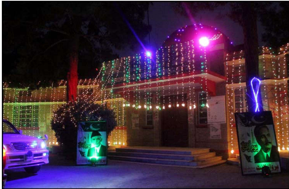
QUETTA: A beautiful illuminated view of lighting at Government building on the eve of Independence Day celebrations coming ahead, in Quetta.

Ph: 2841470/2841473 REG: No. BC-116 B/ID-445 Vd XXIV No. 352, Muharrumul Haram 26, 1445 AH Monday August 14, 2023 Pages 12, Price Rs.15