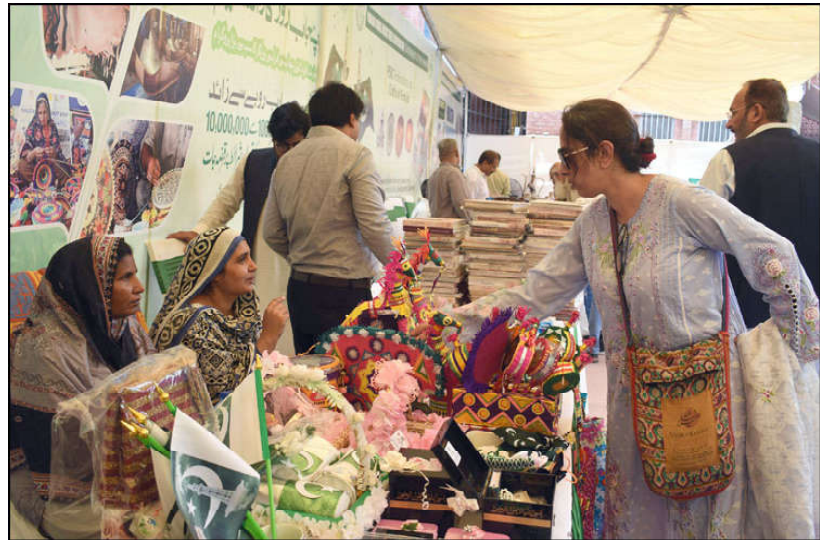
LAHORE: Visitors are busy buying handmade decorating items during an exhibition in connection with Independence Day, at Lahore museum in Provincial Capital.

Penalties have been levied by State Bank for non-implementation of prevailing rules during various inspections.