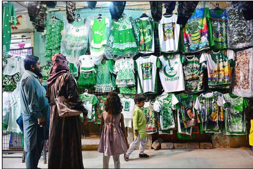
HYDERABAD: Family busy in selecting and purchasing National flag related stuff from vendor in connection with Pakistan Independence Day celebrations

The WAPDA is contributing 8158 MW to the national grid during peak hours on Saturday night. Effective operation and maintenance of WAPDA hydel power stations and better hydrological conditions are the other contributing factors behind this increase in WAPDA hydel generation. Tarbela Hydel Power Station generated 3478 MW, Tarbela 4th Extension 1410 MW.