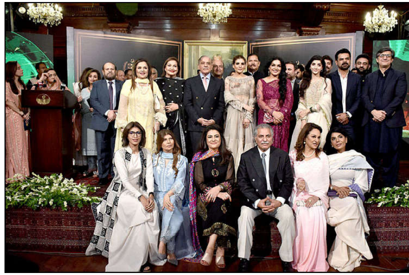
LAHORE: Prime Minister Shabbaz Sharif in a group photo with Journalists, Media workers, Artists and Technical resources during the launching ceremony of the Mobile App Radio Pakistan Awaz Khazana.

Local administration has issued alert as rescue and relief teams have reached to the areas under flooding threat. India had also released water in Nullah Dek in July, which had flooded several villages in Pasrur tehsil of Sialkot district. The flood water from the neighbouring country caused high level flood in Nullah Dek inundating several villages and submerged standing crops on hundreds of acres.