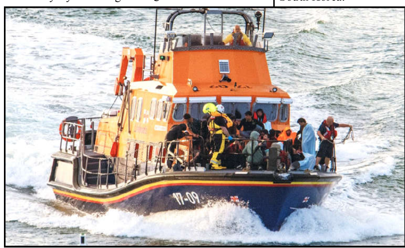
Rescue personnel bring survivors ashore, after a migrants' boat sank in the English Channel.