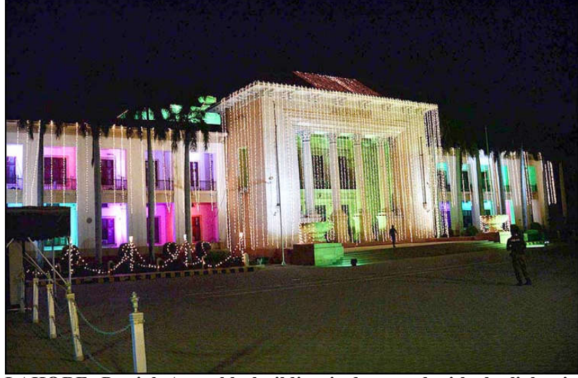
LAHORE: Punjab Assembly building is decorated with the lights in celebration of Independence Day

Mohsin Naqvi asserted that the shared responsibility of bequeathing a harmonious, robust, and flourishing Pakistan to the forthcoming generations. He underscored the pivotal role of exemplary unity and solidarity in confronting the challenges that lie ahead. Confidently, he envisioned a radiant future for Pakistan and emphasised that, through the benevolence of Allah Almighty, the Pakistani nation would triumph over every obstacle. He called upon all citizens to renew their commitment to prioritise the nation's growth over personal interests and collaboratively elevate the stature of Pakistan.