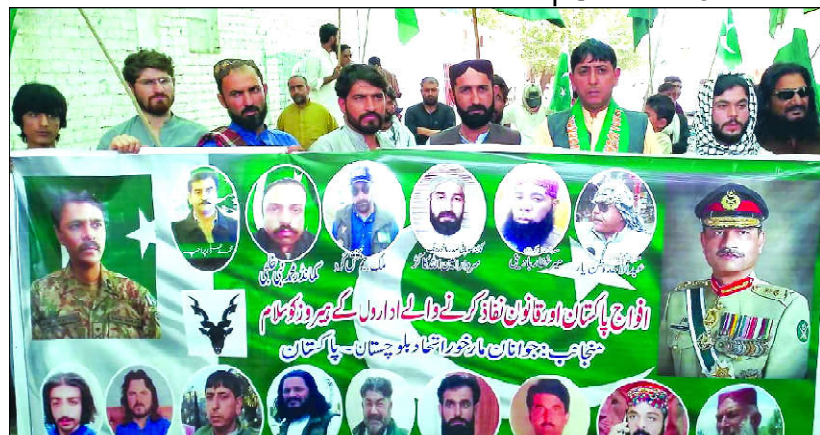
QUETTA: Participants of jawanan Itihad Balochistan take part in the rally in connection with the Independence Day celebration.

The walk through gates would be installed on the entry and exit points of the Railway Station. The special arrangement would also be made for parking of the vehicles visiting the Railway Station for Independence Day celebrations. The activities to be part of the event are included: firework, food festival, musical show, etc.