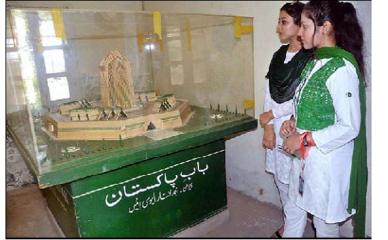
LAHORE: Visitors seeing the model of Bab-e-Pakistan Monument, the first stay of refugees in 1947.

According to the data, 1,145 motorbikes, 92 auto-rickshaws,