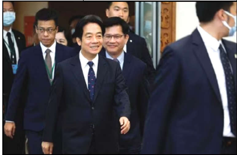
Taiwan's Vice President William Lai arrives at Taoyuan International Airport before his departure to the United States for a stopover in New York on his way to Paraguay, in Taoyuan, Taiwan.

Russia said in a statement that its Vasily Bykov patrol ship had fired automatic weapons on the Palau-flagged Sukru Okan vessel after the ship's captain failed to respond to a request to halt for an inspection. Russia said the vessel was making its way towards the Ukrainian port of Izmail.