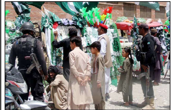
QUETTA: Pakistan flags, bunting, printed shirts and other items are being selling on roadside stalls in connection of Independence Day of Pakistan coming ahead, at Bacha Khan Chowk in Quetta.

QUETTA (INP): In a tragic incident, two workers on Sunday lost their lives due to a lethal build-up of toxic gas within a mine at Harmai district, Balochistan. According to the Levies force, the incident took place within the confines of mines area no 151, Block no. 4. The suffocating grasp of poisonous gas proved fatal and the two miners lost their lives as a result. The deceased were close relatives, hailing from Shangla, Swat