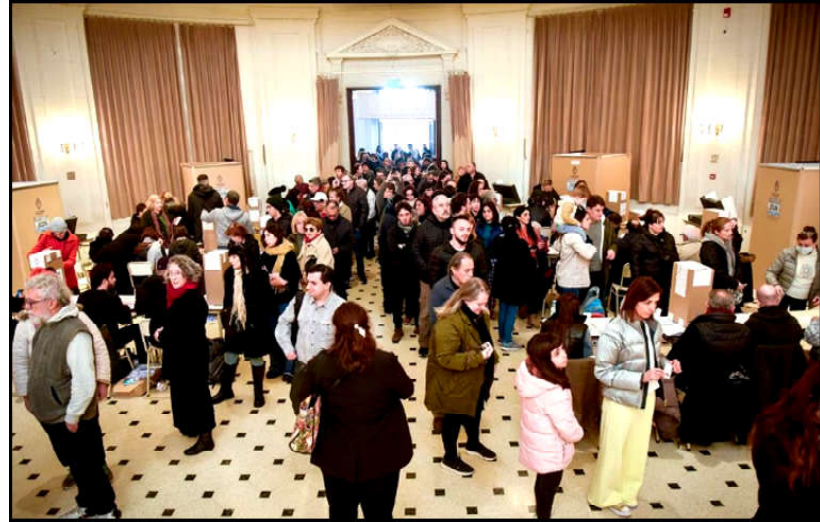
People wait to cast their votes during Argentina's primary elections, in Buenos Aires, Argentina.

Sabatier said 49 survivors were rescued - 36 by the French coastguard and 13 by their British counterparts.