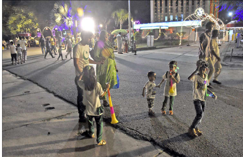
ISLAMABAD: People are enjoying during celebration Independence Day, in Federal Capital.

She also said that as a Pakistani progress of country is our duty, I am separating myself from Pakistan Tereekh e Insaaf