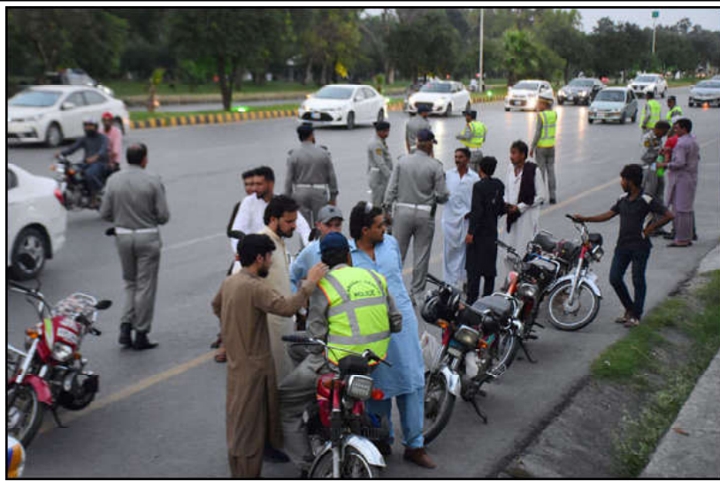
ISLAMABAD: Traffic police wardens busy in issuing challan ticket to motorcyclists for violating traffic rules, in Federal Capital.