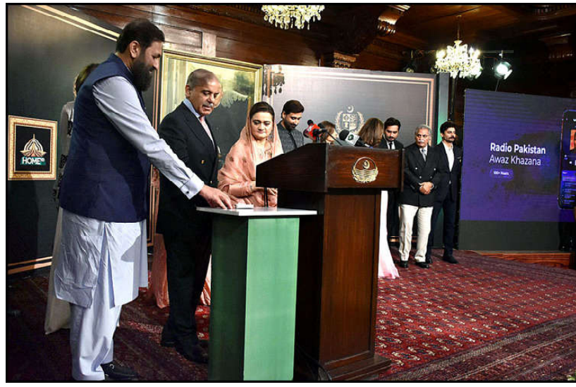
LAHORE: Prime Minister Shahbaz Sharif launches the Mobile App "Radio Pakistan Awaz Khazana".