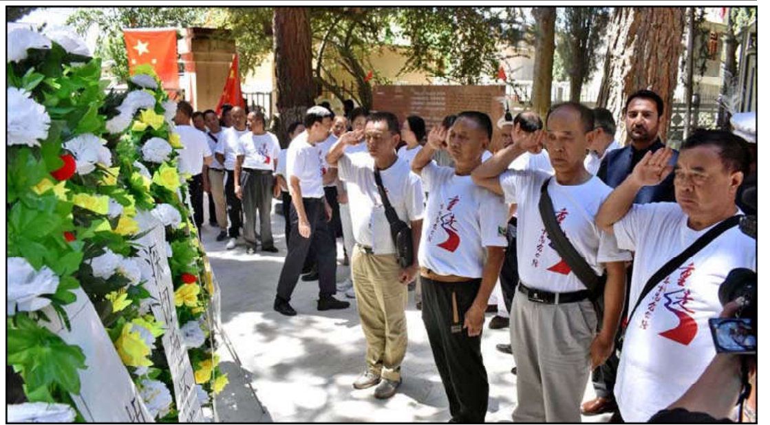
GILGIT: Chinese delegation paying tribute to their relatives who lose their lives during the construction of Karakoram Highway (1959-77) during their visit to Chinese Graveyard Daniyor.

wanted a homeland for themselves where they could freely order their individual and collective lives in accordance with the teachings of Islam, he added. "The stories of those people, who faced hardships, endured oppression and braved immense challenges to reach Pakistan, serve as a source of inspiration for our future generations. We should value the sacrifices of our forefathers for the creation of Pakistan and work for the prosperity of our people," the president observed.