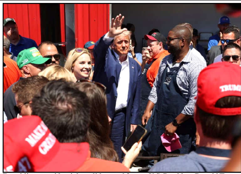
Republican presidential candidate and former U.S. President Donald Trump campaigns at the Iowa State Fair in Des Moines, Iowa, U.S.

White House spokesperson John Kirby said Iran could only access the funds "to buy food, medicine, medical equipment that would not have a dual military use." An estimated $6 billion in Iranian assets have been held in South Korea.