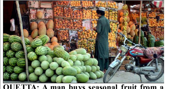
QUETTA: A man buys seasonal fruit from a roadside vendor at Airport Road.

Airline Spokesperson said Dubai Skardu flight will operate once a week on Saturdays. The flight time is approximately four hours and 30 minutes. PIA is introducing special introductory fares on this route. "We are confident that this new flight route will be a success. Skardu is a truly unique destination,