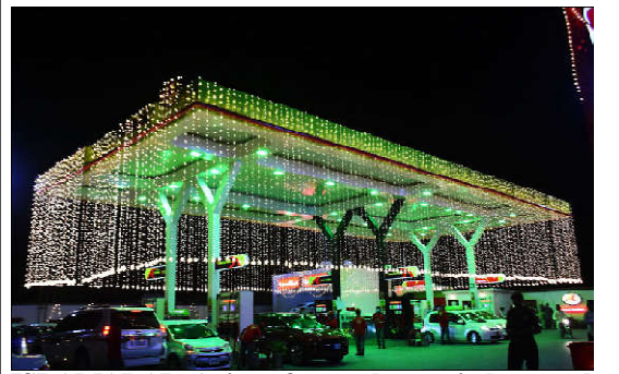
ISLAMABAD: View of a petrol pump is decorated with the colorful lights in celebration of Independence Day.

In view of the low level of available FX reserves, the debt management strategy of Pakistan may have to be revisited, to ensure the stability of Pakistani rupee and restoration of international capital markets' confidence in the economy of Pakistan.