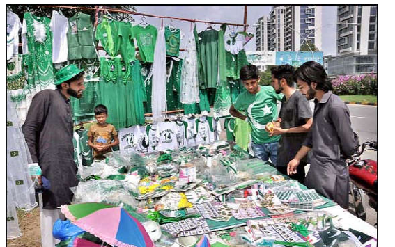
ISLAMABAD: Youngsters busy in selecting and purchasing National flag and related stuff from vendor in connection with Pakistan Independence Day celebrations.

The under-construction Stage-I is with an installed generation capacity of 2160 MW and the stage-II will be of 2160 MW capacity.