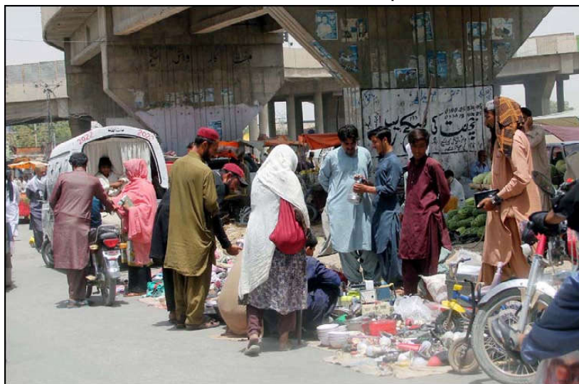
QUETTA: People purchase used goods due to price hiking, at makeshift weekly market located on Benazir Flyover road in Quetta.