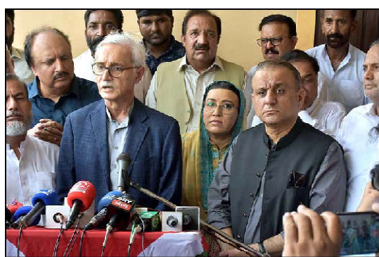
SIALKOT: The Chief Executive of Istehkam-e-Pakistan Party Jahangir Tareen, along with President Aleem Khan and Dr. Firdous Ashiq Awan addressing to the media in Kobey Chak.

Allama Dr. Muhammad Iqbal. He said that on the eve of Jashne Azadi, we should also pay homage to our those martyrs who rendered sacrifice of their lives for defence of the country and its peace. The Chief Minister said that this day reminds us that how big blessing of the independence is. He said that the people of Balochistan stand by their Kashmiri brethren in their just struggle. He also strongly condemned the Indian state barbarism and cruelties against the Kashmiris in the Occupied Kashmir.