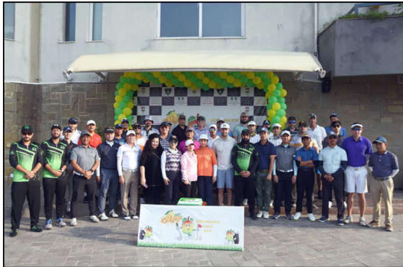
ISLAMABAD: Participants posing for a group photograph before Golf match title "Mango Fest Diplomat Golf Cup" at Bahria Golf city in Federal Capital.

According to the documents, the fire brigade department of CDA in the federal capital only has fire extinguishing equipment on buildings 68 meters high, while the height of some buildings in the capital is up to 113 meters, where there is no provision for fire extinguishing by the relevant departments of CDA.