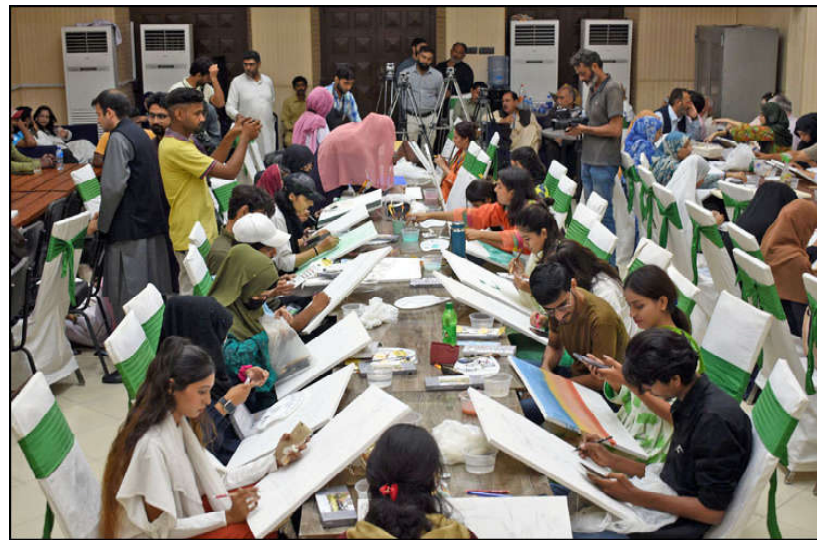
LAHORE: Students busy in painting competition in connection with Independence Day, at Lahore museum in Provincial Capital.

The IGP also ordered to form special teams for action against those involved in one-wheeling, aerial firing, rioting and immoral acts. "Those who display arms in public and perform aerial firing will be arrested and punished."