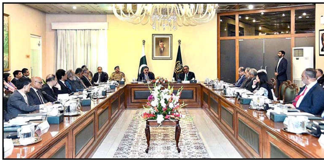
ISLAMABAD: Caretaker Prime Minister Anwaar-ul-Haq Kakar being briefed during his visit to the Ministry of Foreign Affairs.

It is to remember that former PM Nawaz Sharif while talking to media in London said that there are testimonies coming from inside about Former Chief Justices of Supreme Court.