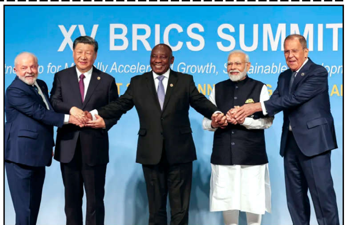
Brazil's President Luiz Inacio Lula da Silva, China's President Xi Jinping, South Africa's President Cyril Ramaphosa, India's Prime Minister Narendra Modi and Russia's Foreign Minister Sergei Lavrov pose for a BRICS group photo during the 2023 BRICS Summit at the Sandton Convention Centre in Johannesburg, South Africa.

While there has been momentum for a BRICS expansion for months - pushed largely by China and Russia.