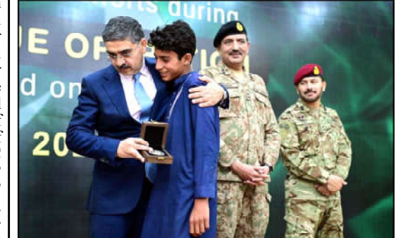
ISLAMABAD: Caretaker Prime Minister, Anwaar-ul-Haq Kakar distributing awards among the survivors of Battagram Chairlift incident for their bravery during a ceremony held in Islamabad.

terms of seeds and fertilizer, and helps repair damaged critical irrigation infrastructure. "$2 million was given in humanitarian assistance for the United Nations High Commissioner for Refugees (UNHCR) flood response in Pakistan to provide lifesaving resources to Afghan refugees and host communities in Pakistan." More than $1.9 million was provided in US Department of Defense funding to help airlift USAID supplies while $3 million for new early recovery, risk reduction, and resilience funding to support Pakistan's ability to mitigate the impacts of natural disasters such as floods. An additional $16.4 million in nutrition and food security support, early recovery, resilience, and risk reduction assistance was announced in June 2023.