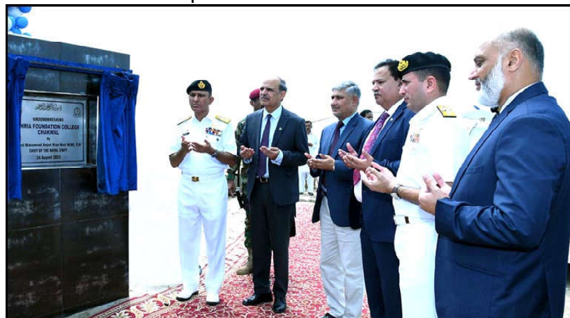
CHAKWAL: Chief of the Naval Staff Admiral Amjad Khan Niazi performs the ground breaking of Bahria Foundation College at Chakwal.