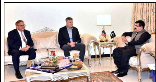
ISLAMABAD: US Congressman Darlin Lahood accompanied by US Ambassador Donald Blome exchanging views with Chairman Senate, Muhammad Sadiq Sanjrani.