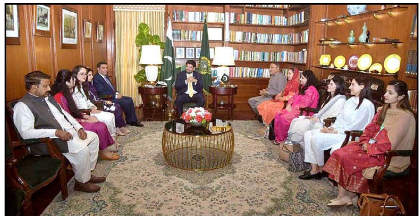
KARACHI: Under Training Officers from Information Services Academy Islamabad are meeting Governor Sindh Kamran Khan Tessori at Governor House.

EPZA was playing a proactive role in increasing the exports and several incentives and facilities were being provided to industries and investors in the EP zones. The EPZA offered industrial and trading units exemption from custom and other duties on import of raw materials, equipment and machinery while laws and regulations pertaining to import export, foreign exchange, labour and banking were not applicable in the EP zones, he informed adding that past restrictions on import had not affected trading units established in EPZ's.