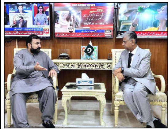
ISLAMABAD: Caretaker Federal Minister for Interior Sarfraz Ahmad Bugti in a meeting with the Caretaker Federal Minister for Information Murtaza Solangi.

Decisions are also expected to be taken regarding reactivating PPP organisations in Punjab and Lahore and to fill the vacant slots immediately.