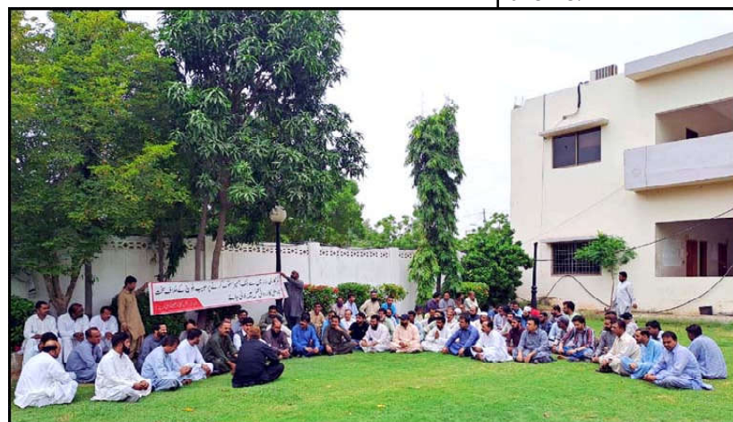
KARACHI: Members of Employee Action Committee District Council Karachi are holding protest demonstration for acceptance of their demands, held in Karachi.

SWAT (APP): The district administration Swat under Section 144 has imposed ban on carrying out rallies by winning candidates of Local Government (LG) elections and branding of arms as part of enhancing security measures. According to a statement issued by office of District Magistrate here Thursday, the ban has been imposed for a period of ten days hence forthwith and the violators would be prosecuted under Section 188 of CrPC.