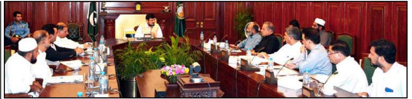
PESHAWAR: KP Governor Haji Ghulam Ali presides over the meeting of PESCO Officials regarding load shedding in Peshawar and suburb areas.

Referring to Quaid Speech he said that "it is the responsibility of the civil servants to work with utmost dedication, integrity, and impartiality. They should serve the nation without any bias, fear, or favor."