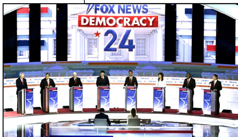
The candidates at their podiums for the first Republican primary debate of the 2024 cycle in the midwestern US city of Milwaukee.

"We have nothing to do with it. Everyone understands who is involved," Zelenskyy said.