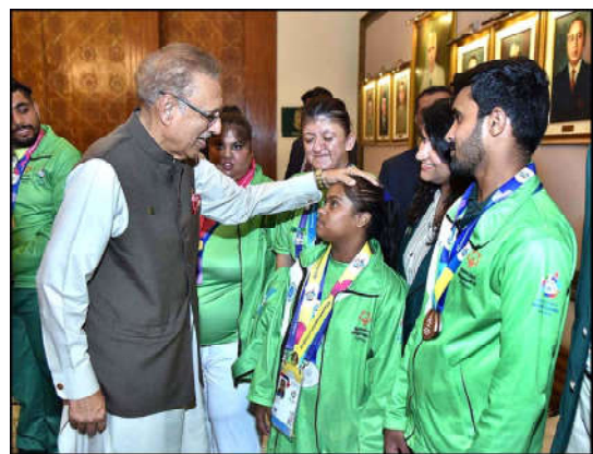
ISLAMABAD: President Dr. Arif Alvi meeting with the members of Pakistan Special Olympics Team, who participated in Berlin Special Olympics, at Aiwan-e-Sadr.

In the meeting, the officers of the Sindh Revenue department gave a detailed briefing to the minister about their respective fields.