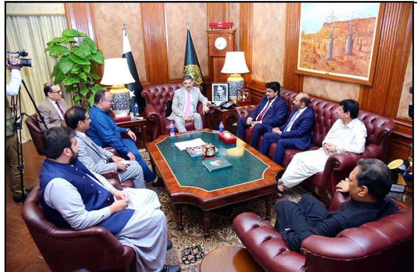
KARACHI: A delegation of MQM called on Caretaker Prime Minister Anwaar-ul-Haq Kakar.