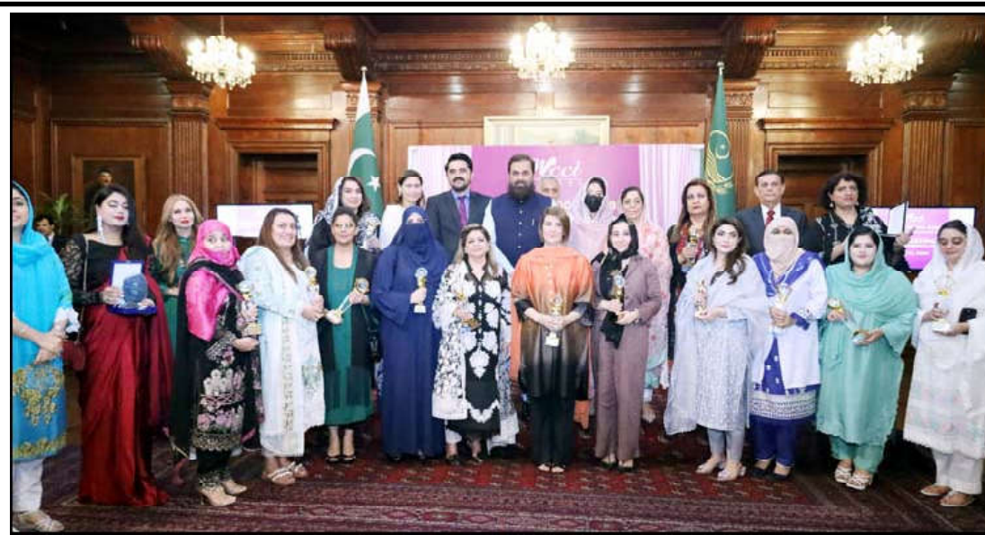
LAHORE: Governor Punjab Muhammad Balighur Rehman in a group photo with the women who got Laurels of Honour Awards organized by Women Chamber of Commerce and Industry here at Governor House.

This tailored strategy, he believes, will yield more favorable results.