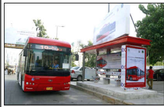
KARACHI: View of newly constructed bus stop point of the Intra-District Peoples Bus Service project, bus on its way after started the operation of buses located on Clifton area in Karachi.

He said that earlier the ombudsman had initiated "Informal Resolution of Dispute" programme which had provided tangible results in resolving public grievances speedily. Now, one-window operation was being launched under which all departments would be bound to resolve complaints of overseas Pakistanis, including their immigration issues, he added.