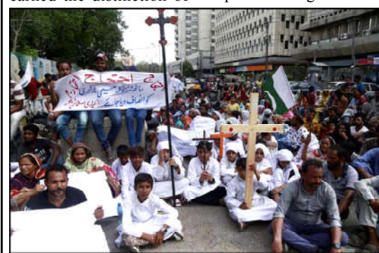
KARACHI: Members of Christian Community are holding protest demonstration against attack on churches in Jaranwala incident and demanding for Justice, held at Karachi press club.