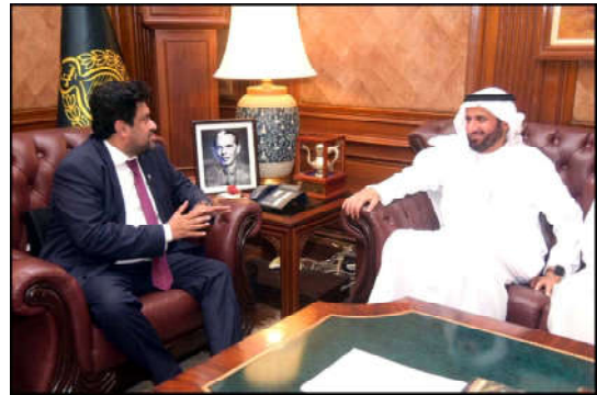
KARACHI: Governor Sindh, Kamran Tessori exchanging views with Dr. Tawfiq Bin Fawzan Al-Rabiah, Saudi Minister for Hajj and Umrah during meeting held at Governor House in Karachi.