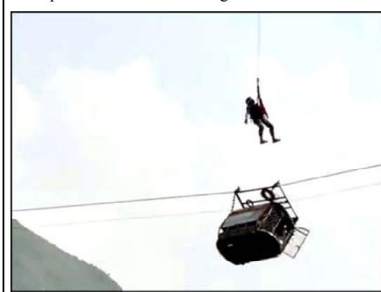
BATTAGRAM: Pakistan Army Special Service Group (SSG) Commandos take part in rescue operation after a cable car incident in Battagram.