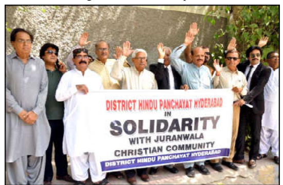
HYDERABAD: Members of District Hindu Panchayat Hyderabad are holding protest demonstration against attack on churches in Jaranwala, at Hyderabad press club.