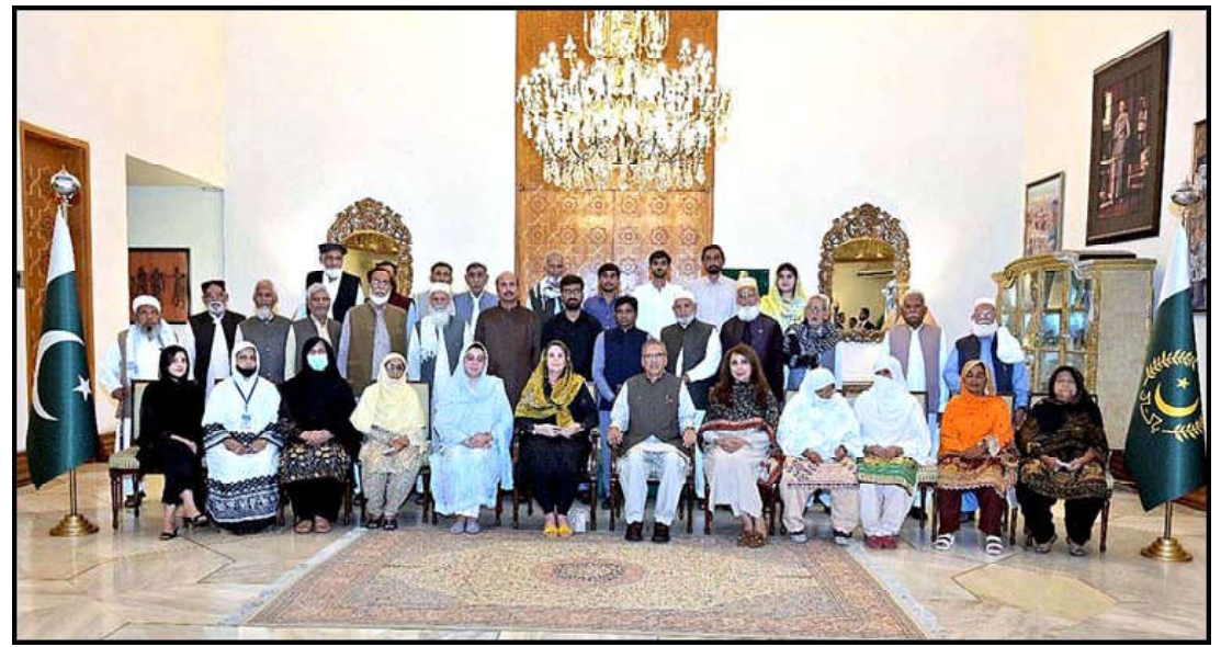
ISLAMABAD: President Dr Arif Alvi in a group photo with a delegation of Old Age Home, Aafiyat Multan, at Aiwan-e-Sadr.

an important milestone for the promotion of inter-faith harmony in Pakistan. Earlier addressing the cabinet, the prime minister said the caretaker government's prime mandate was to assist and monitor the electoral process which was the constitutional requirement. He said keeping in mind the prime mandate, the caretaker government would monitor its day-to-day activities to the best of its abilities. "We are here as a constitutional continuation for a limited period of time and we are not here to design the government model or structure," the prime minister said while addressing the cabinet meeting here. He maintained that as a continuation of the previous government, the caretaker setup was generally supposed to carry on with the general policy until and unless there were any violations of rules or business. "The National Assembly has retired and we are waiting for the new elections," he said adding the second arm of the parliament-the Upper House was still there but it could not do legislation alone till there was the Lower House.