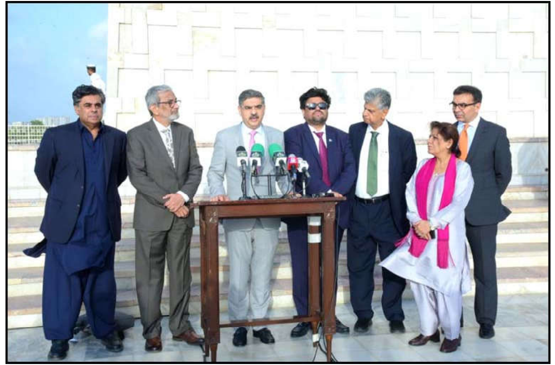
KARACHI: Caretaker Prime Minister Anwaar-ul-Haq Kakar talking to media after visiting Mazar-e-Quaid.

He said keeping in mind the prime mandate, the caretaker government would monitor its day-to-day activities to the best of its abilities.