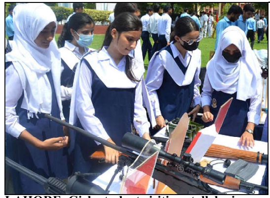
LAHORE: Girls student visiting stall during an event "A day with Pakistan Navy" organized by Pakistan Navy War College, Lahore.