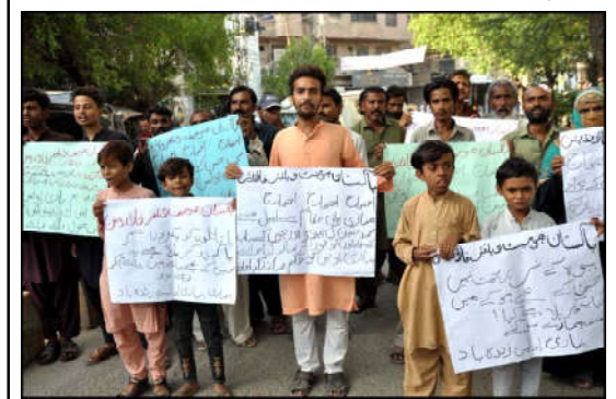
HYDERABAD: Members of Pakistan Humanist Welfare-Foundation are holding protest demonstration against high handedness of Pinyari Police, at Hyderabad press club.