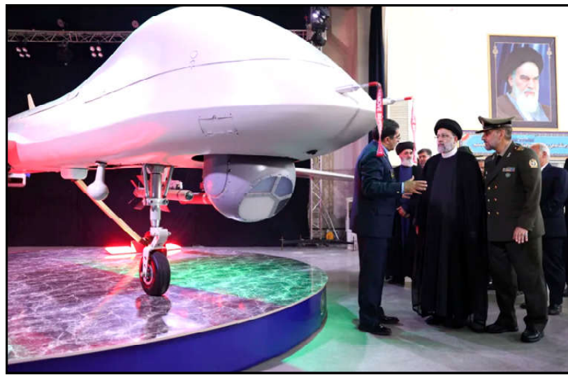
President Ebrahim Raisi listens to Chief of Aviation Industries of Armed Forces Gen. Afshar Khajehfard, as Defense Minister Gen. Mohammad Reza Gharahi and Ashtiani listens, during a ceremony unveiling a drone called the Mohajer-10.

Monitoring Desk ANKARA: Turkish President Recep Tayyip Erdogan on Monday accused United Nations peacekeepers of instigating violence in which several members of the agency's mission were assaulted on Cyprus. The United Nations said Turkish Cypriot forces on Friday attacked peacekeepers who were attempting to block construction of a road in the buffer zone separating the divided east Mediterranean island. The confrontation occurred in an ethnically mixed village in the UN-patrolled area between the internationally recognised Republic of Cyprus in the south and the breakaway Turkish Cypriot statelet in the north.