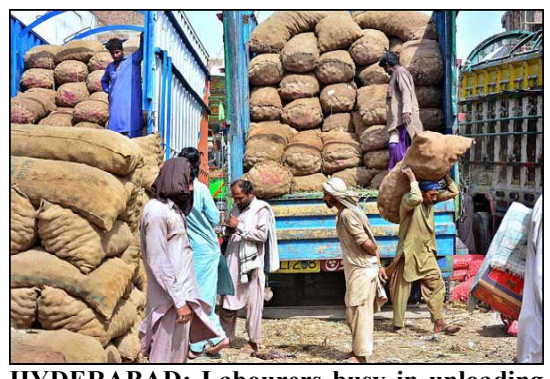
HYDERABAD: Labourers busy in unloading potatoes bags on the delivery track at vegetables market.

He said the institution should also assist the of Pakistan presented to government in the promotion of good report of the institution for governance.