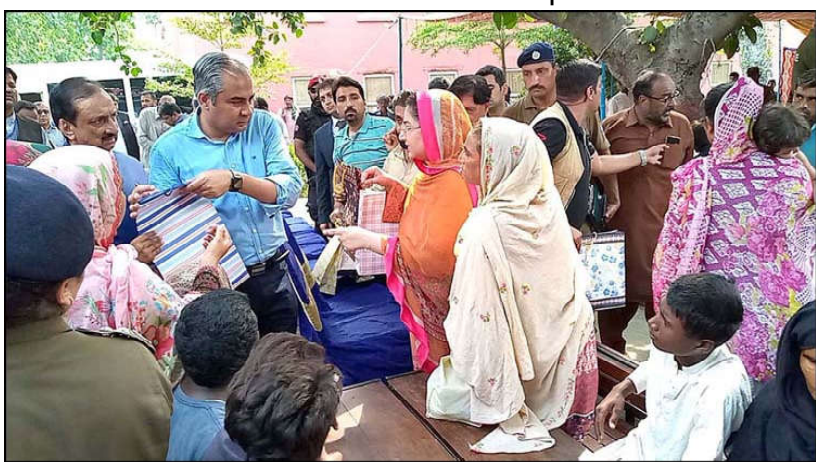
FAISALABAD: Punjab Chief Minister Syed Mohsin Naqvi is distributing supplies during his visit Danish School Camp regarding the incident Christian Colony Jaranwala.

Besides poverty and socioeconomic imbalances especially in rural areas, he said most of poor students left education due to the expensive cost of books and other education expenses.