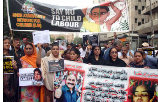
KARACHI: Members of civil society holds placards during protest in favor of their demands outside press club in Provincial Capital.

KARACHI (INP): The 52nd martyrdom anniversary of Pilot Officer Rashid Minhas Shaheed, Nishan-e-Haider, was observed on Sunday. He is the youngest recipient of Nishan-e-Haider, who embraced Shahadat at Goth Ahmed Shah, Sujawal on August 20, 1971. On his 52nd martyrdom anniversary, Armed Forces of Pakistan, Chairman Joint Chiefs of Staff Committee and Services Chiefs have paid glowing tribute to Pilot Officer Rashid Minhas Shaheed. The ISPR said that Pilot Officer Rashid Minhas' martyrdom anniversary serves as a powerful reminder of the extraordinary sacrifices made by the armed forces of Pakistan. It said that Pilot Officer Rashid Minhas lived up to great traditions of Pakistan armed forces in defending.