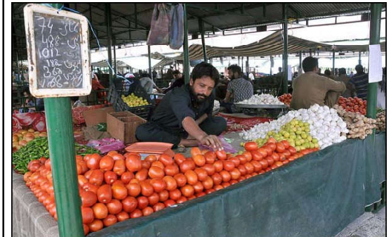
ISLAMABAD: A vendor selling vegetables on his stall at Sunday bazaar Abpara Market.