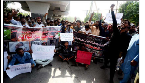
PESHAWAR: Members of the Christian minority hold placards as they shout slogans during a protest against mob attacks that erupted the day before in Jaranwala, near Faisalabad, in Peshawar.