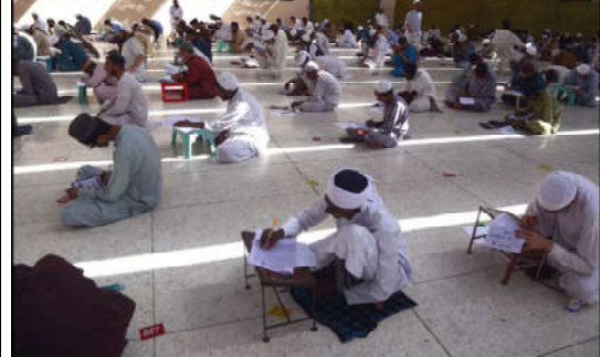
KARACHI: Students of the Jamia Binoria Alalamia Islamic are solving paper during the seminary first term exam held in Karachi