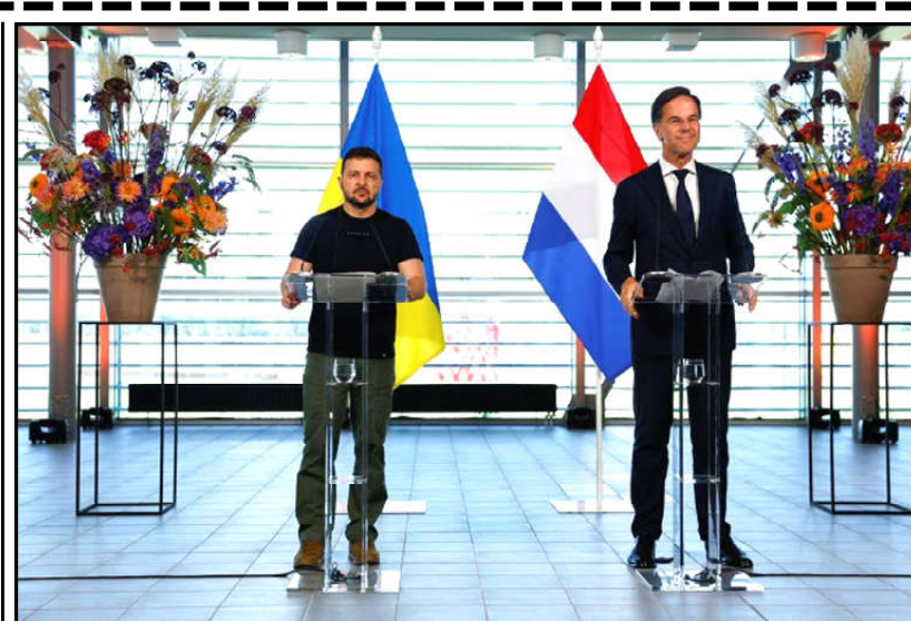
Ukrainian President Volodymyr Zelenskyy and Dutch Prime Minister Mark Rutte attend a press conference, in Eindhoven, Netherlands.

They were also intended to serve as "a stern warning to the collusion of 'Taiwan independence' separatists with foreign elements and their provocations", it added. A social media video published by the PLA on Saturday showed soldiers in fatigues sprinting through a military facility and fighter jets soaring above clouds, set to action-movie-style music.