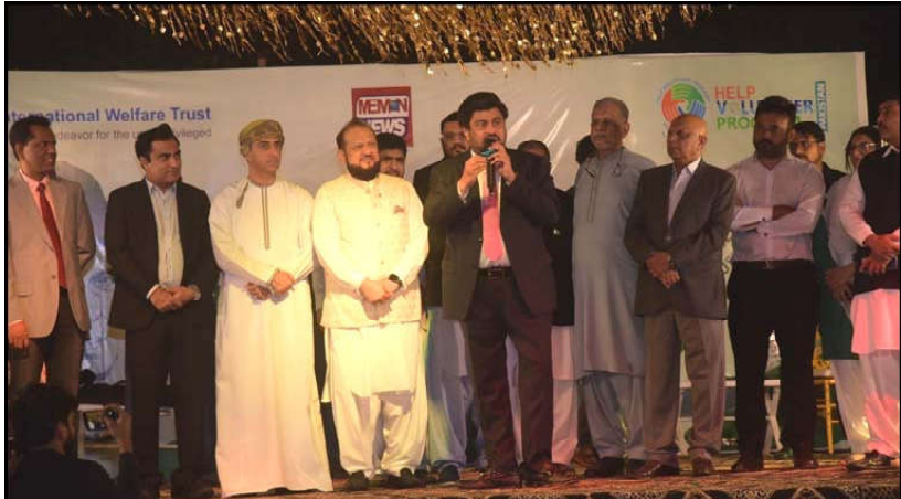
KARACHI: Governor Sindh Kamran Khan Tessori addressing a ceremony held on "Uniting against Thalassemia for Healthier Pakistan".