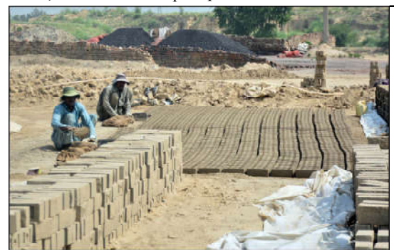
RAWALPINDI: Labourers make bricks at a bricks factory outskirts area of the city.