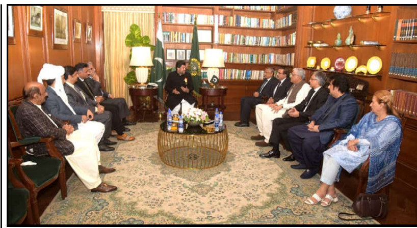
KARACHI: Caretaker Chief Minister Sindh Justice (Retd) Maqbool Baqar and caretaker Provincial Ministers meeting with Governor Sindh Kamran Khan Tessori.

During the last 16 months in Pakistan, the evil tradition of deviating from the constitution, breaking the law, fleeing from democracy and subordinating the state to personalities has been reinforced. It was said in statement.