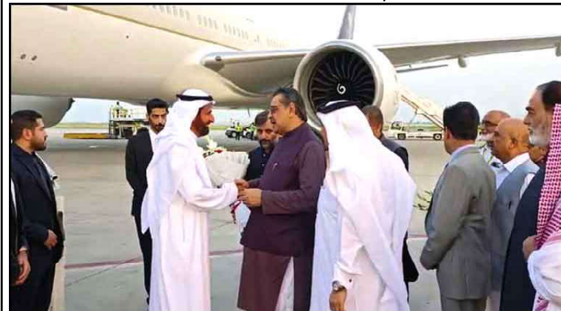
ISLAMABAD: Caretaker Federal Minister for Religious Affairs Aneeq Ahmad receiving Saudi Minister for Hajj and Umra Dr. Taufeeq Bin Fawzan Al-Rabiya who arrived in Islamabad on Sunday evening on a four-day visit.