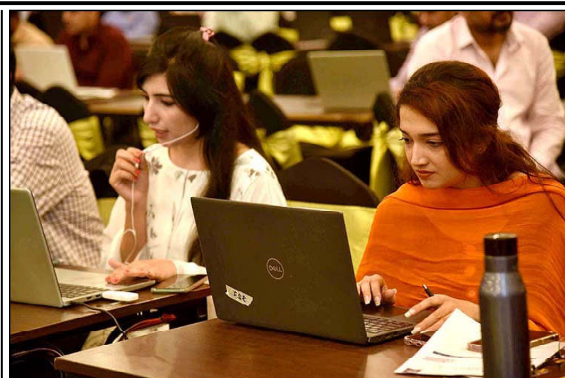
LAHORE: Women are actively engaged in work during a Property Sale Event hosted at a local hotel.

The exhibition was organised under the aegis of Event and Conference International Pvt. Ltd and Rainbow Group in collaboration with the Asia Dyestuff Industry Federation. The event was supported by the Federation of Pakistan Chambers of Commerce & Industry (FPCCI).