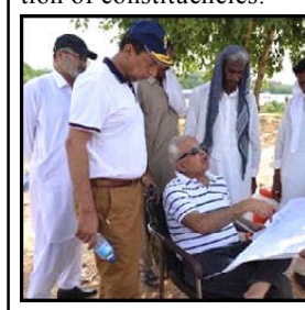
ISLAMABAD: Caretaker Federal Minister for Communications Minister Shahid Ashraf Tarar giving the instructions to facilitate the the Motorways on his visit hazara Motorways and Peshawar.

MQM-P summoned an important meeting of Rabta Committee at 05:00 pm in Pakistan House, PECHS. Meeting summoned to deliberate on country's political situation and upcoming general elections. Matters related to delimitation of constituencies of national and provincial assemblies will also be discussed. The meeting will also formulate a strategy to raise strong voice for 'fair' delimitation of constituencies.