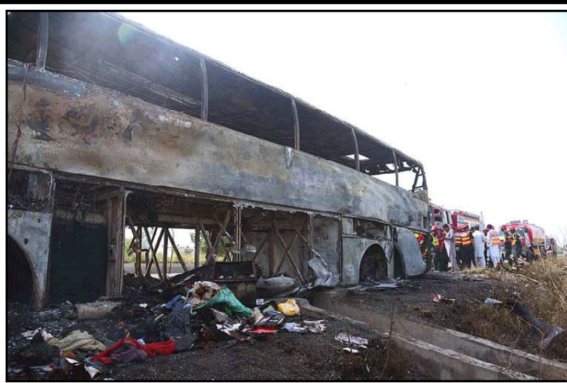
SARGODHA: A view of burned bus after incidence while eighteen people were killed and fifteen others injured when a passenger bus caught fire after being smashed into a pick-up carrying diesel drums at Motorway near Pindi Bhattian.