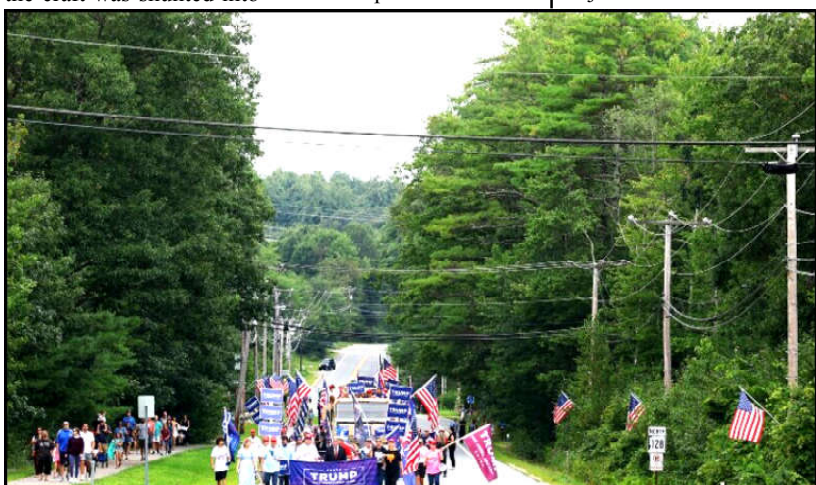
Supporters of Republican presidential candidate and former U.S. President Donald Trump arrive for the Old Town Day Parade in Londonderry, New Hampshire, U.S.

Monitoring Desk TOKYO: Japanese Prime Minister Fumio Kishida and Iranian President Ebrahim Raisi will meet in New York in September to discuss Iran's nuclear programme among other issues, Kyodo news agency said on Sunday, quoting unnamed Iranian diplomatic sources. Iran aims to promote relations with Japan, traditionally a friendly nation, to avoid international isolation as Iran's talks with the United States and Europe over their nuclear deal have stalled.