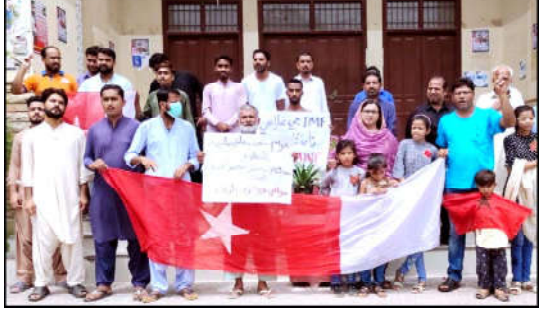
LARKANA: Activists of Awami Workers Party (AWP) are holding protest demonstration against inflation, unemployment and price hike of petroleum and other products, at Jinnah Bagh in Larkana