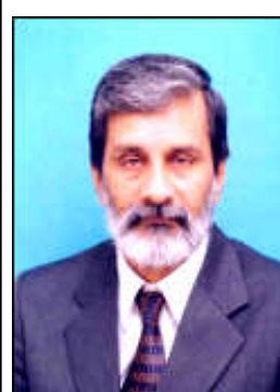
KARACHI (INP): Sindh caretaker Chief Minister designate Justice Retired Maqbool Baqar will take the oath in his office in a swearing-in ceremony to be held on August 16 (tomorrow).

Sindh Governor Kamran Khan Tessori approved the appointment of