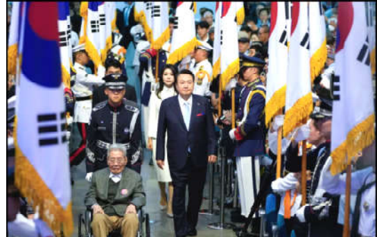
South Korean President Yoon Suk Yeol and his wife Kim Keon Hee arrive at a ceremony to celebrate the 78th anniversary of the Korean Liberation Day from Japanese colonial rule in 1945, in Seoul, South Korea.

Monitoring Desk BEIJING: China and India agreed to maintain peace and tranquillity on the ground in the border areas, China's defence ministry said in a joint statement on the 19th round of the China-India Corps Commander Level Meeting on Tuesday. Both sides had a positive, constructive, and in-depth discussion on the resolution of the remaining issues along the LAC (line of actual control) in the Western Sector.