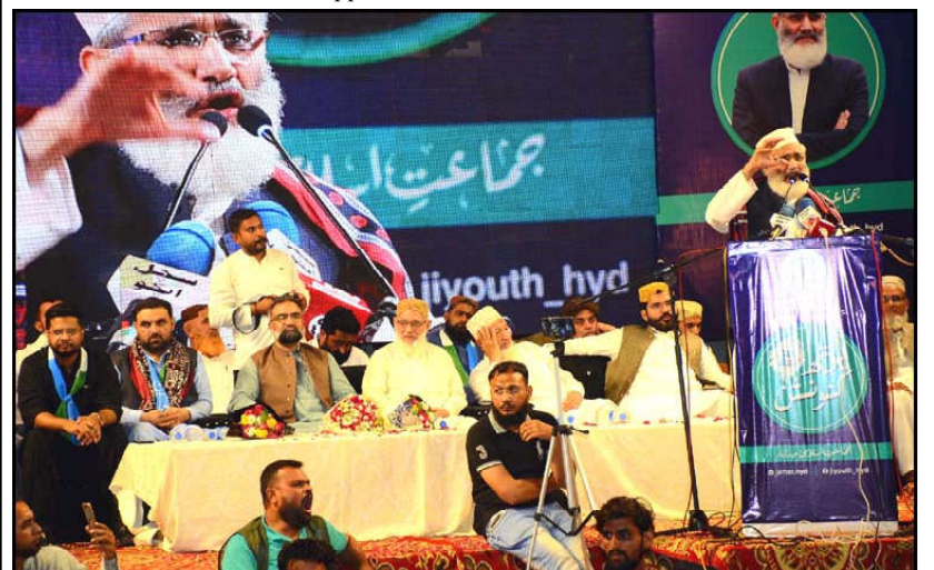
HYDERABAD: Jamaat-e-Islami (JI) Chief, Siraj-ul-Haq addresses during the Youth Convention held in Hyderabad.

dation of Sindh Chief Minister Syed Murad Ali Shah, who sent the name to the governor on Monday night. Outgoing Chief Minister Shah and Opposition Leader in Sindh Assembly Rana Ansari reached a consensus on the name of Justice @ Baqar as a caretaker chief minister after hectic three-day consultations which ended yesterday. According to a statement issued by Sindh CM Office, "After three-day consultations between Sindh Chief Minister Syed Murad Ali Shah and Leader of Opposition in the dissolved provincial assembly Rana Ansari, the two have agreed on the appointment of retired justice Maqbool Baqar as caretaker chief minister."