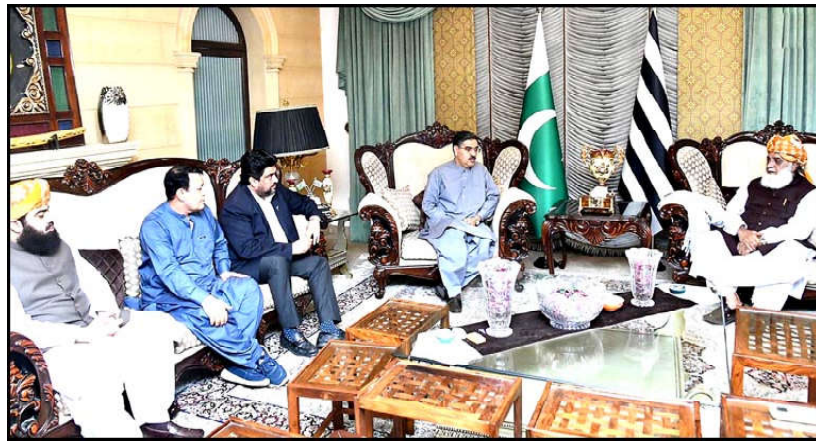
Caretaker Prime Minister Anwaar-ul-Haq Kakar visited the residence of President JUI-F Maulana Fazal Ur Rehman to express his condolences for those martyred in suicide attack in Khar, Bajaur at the JUI-F Workers' Convention Islamabad.