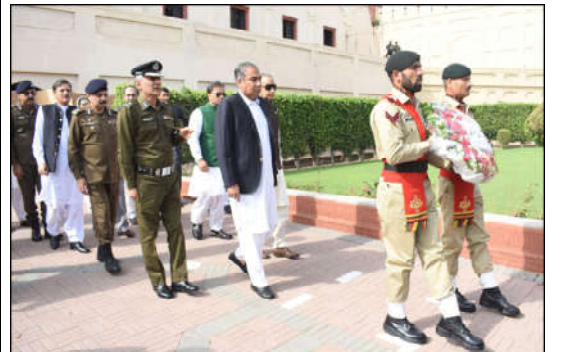
LAHORE: Caretaker Chief Minister Punjab Mohsin Naqvi arriving to the Mazar-i-Iqbal for laying floral wreath during the celebrations of 76th Independence Day in Provincial Capital.

LAHORE (Online): Pakistani should play his role in the development of the country. He said that this day reminds us of the immense sacrifices rendered by our forefathers for a separate homeland. He said that today is the day to renew our pledge to forget mutual differences and get united. He reiterated that the challenges facing the country can be overcome only by promoting unity, mutual tolerance and brotherhood. Today, we have to reaffirm the commitment that we will live up to the guiding principles of Quaid-e-Azam Muhammad Ali Jinnah, Unity, faith and discipline. Punjab Governor Muhammad Balighur Rehman while congratulating the entire nation on the 76th Independence Day of Pakistan said that every