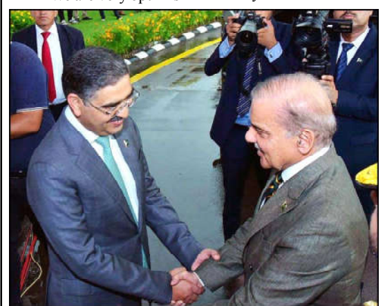
ISLAMABAD: Caretaker Prime Minister Anwaar-ul-Haq Kakar bidding farewell to the outgoing Prime Minister Muhammad Shehbaz Sharif.

The COAS said there is hope for the best, adding that everything will be good, as Pakistan was moving forward in a very positive way.