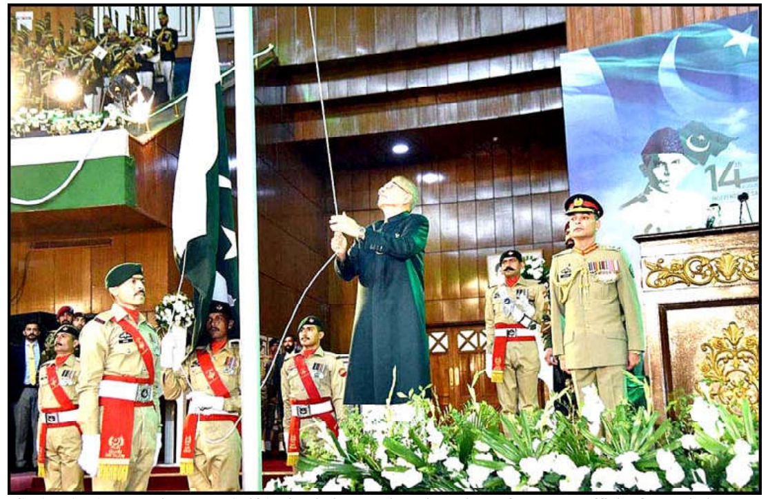
ISLAMABAD: President Dr. Arif Alvi hoisting Pakistan's national flag at the official flag hoisting ceremony on the 77th Independence Day of Pakistan.

Referring to the Kashmiris' ongoing struggle against Indian imperialism, the AJK premier said that India wants to oppress the people of Occupied Kashmir through the use of its military might. The observance of Pakistan's independence day on both sides of the line of control (LOC), he said, ignites the passion of our Kashmiri brothers and sisters and rekindles their hope that the sacrifices made by them in the ongoing freedom struggle would never go in vain.