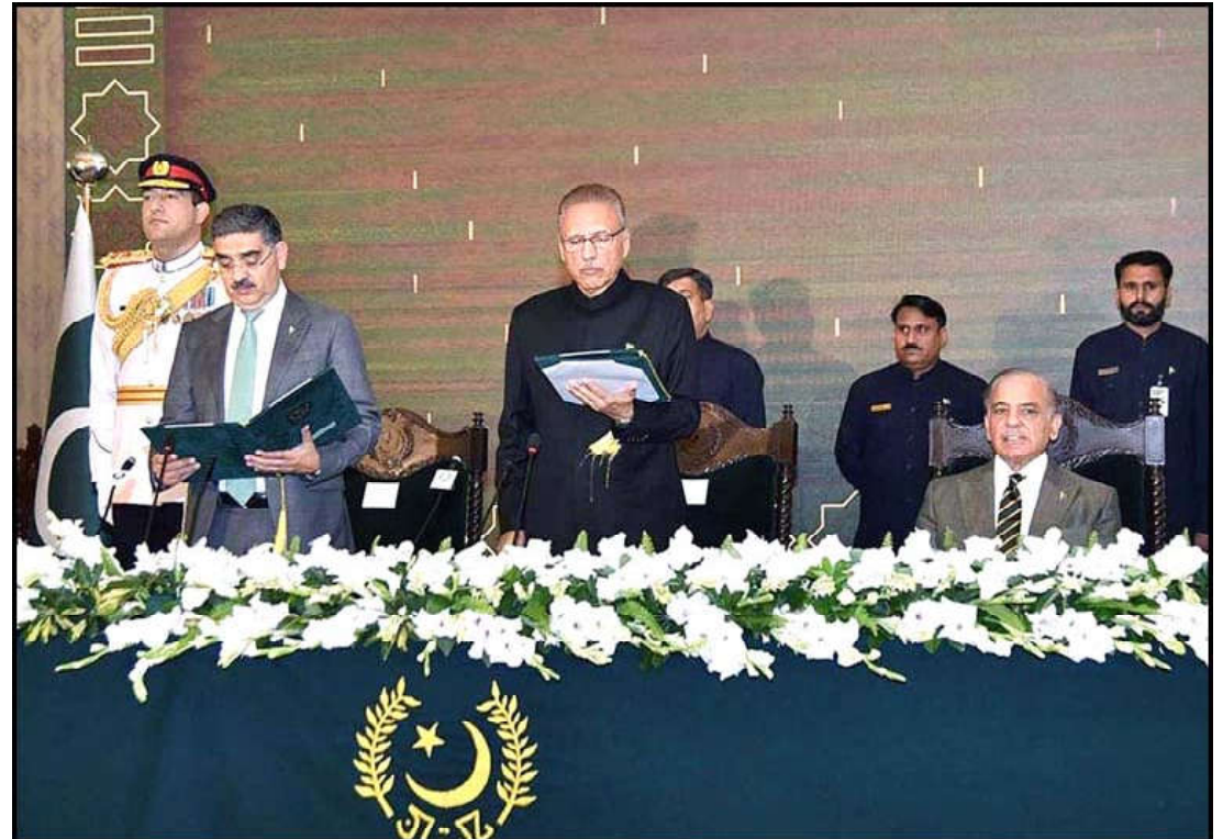
ISLAMABAD: President Dr. Arif Alvi administering the oath of office to Anwaar-ul-Haq Kakar as the Caretaker Prime Minister of Pakistan at an oath-taking ceremony held at Aiwan-e-Sadr.

prime minister. Meanwhile Caretaker Prime Minister Anwaar-ul-Haq Kakar Monday here assumed his responsibilities after taking the oath of office. The PM sought briefing from all ministries on important matters. It is worth mentioned here that Anwaarul Haq Kakar, who hails from Qilla Saifullah, was one of the original architects of the Balochistan Awami Party. He is the second person from Balochistan to spearhead the interim set-up after Mir Hazar Khoso, who became the caretaker premier in 2013.