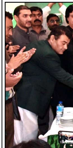
ISLAMABAD: Chairman Senate Sadiq Sanjrani cutting a cake on the occasion of 76th Independence Day of Pakistan inn samaa News Bureau Office.