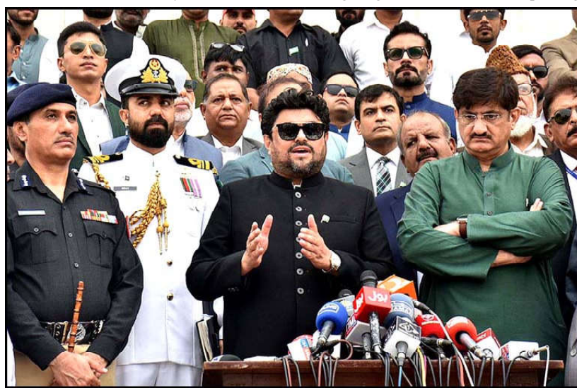
KARACHI: Sindh Governor Mohammed Kamran Khan Tessori and Chief Minister Syed Murad Ali Shah talking to media persons at the Quaid-e-Azam mausoleum on the occasion of 77th Independence Day celebration.