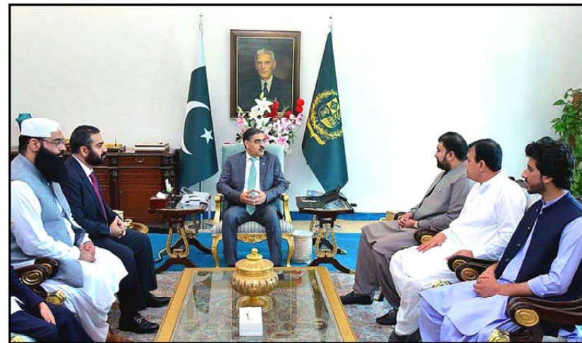
ISLAMABAD: A delegation from Balochistan comprising Senator Sarfraz Bugti and Mir Khalid Lango called on Caretaker Prime Minister Anwaar-ul-Haq Kakar.