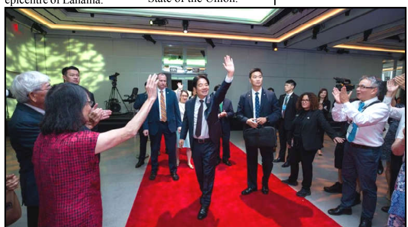
Taiwan's Vice President William Lai waves while attending a luncheon in New York City, New York, U.S.

Monitoring Desk TOKYO: Japan and the United States will jointly develop new missile systems to intercept hypersonic projectiles currently being developed by China, Russia, and North Korea, Japanese newspaper Yomiuri reported on Aug. 13. The agreement is set to be announced at the trilateral summit between the leaders of Japan, the U.S., and South Korea on Aug. 18. The cooperation is aimed at strengthening the capabilities of both countries to counter potential threats and will represent the second joint missile development between Japan and the United States, following the completion of the Standard Missile-3 Block 2A in 2017, Yomiuri reported. Prime Minister Fumio Kishida and U.S. President Joe Biden are expected to hold separate talks before the summit, which could affect the details of the deal's announcement. Hypersonic missiles are capable of reaching speeds five times higher than the speed of sound (Mach 5), and follow irregular trajectories at low altitudes, making it difficult to detect and track with existing radars.