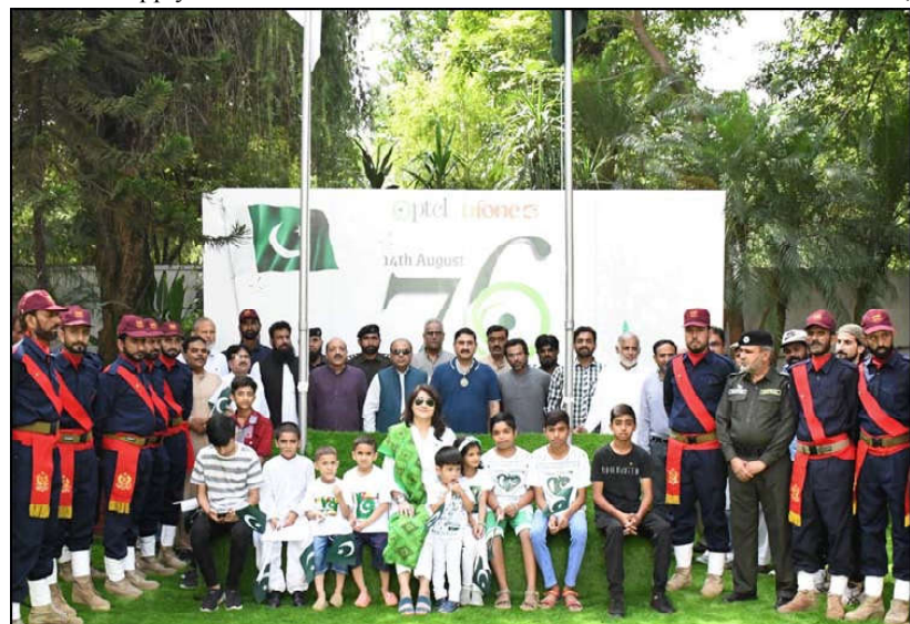
PTCL group celebrated the 76 th Independence Day of Pakistan with great zeal and fervor, followed by a flag hoisting ceremony. Management, staff and their families were present during the occasion.