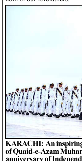
KARACHI: An inspiring Change of Guard ceremony was held at mausoleum of Quaid-e-Azam Muhammad Ali Jinnah as the entire nation celebrated 76th anniversary of Independence of Pakistan.

The message said, "This day reminds us of the vision, fortitude, and countless sacrifices which our ancestors offered, to realize our elder's and great Quaid's dream of a free and independent country. Thousands of sons of the soil have laid down their lives for the defense of the motherland and to preserve the cherished dream of freedom of our forefathers."