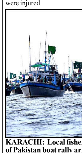
KARACHI: Local fisherman participated 76th anniversary of Independence of Pakistan boat rally arranged by Pakistan Navy at Karachi harbour.