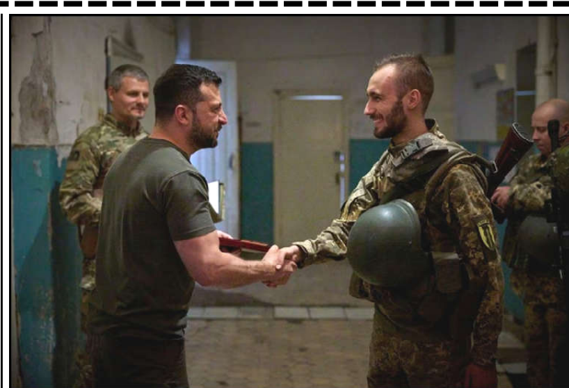
Ukraine's President Volodymyr Zelenskyy awards a Ukrainian service member as he visits a frontline, amid Russia's attack on Ukraine, near the city of Soledar in Donetsk region, Ukraine.