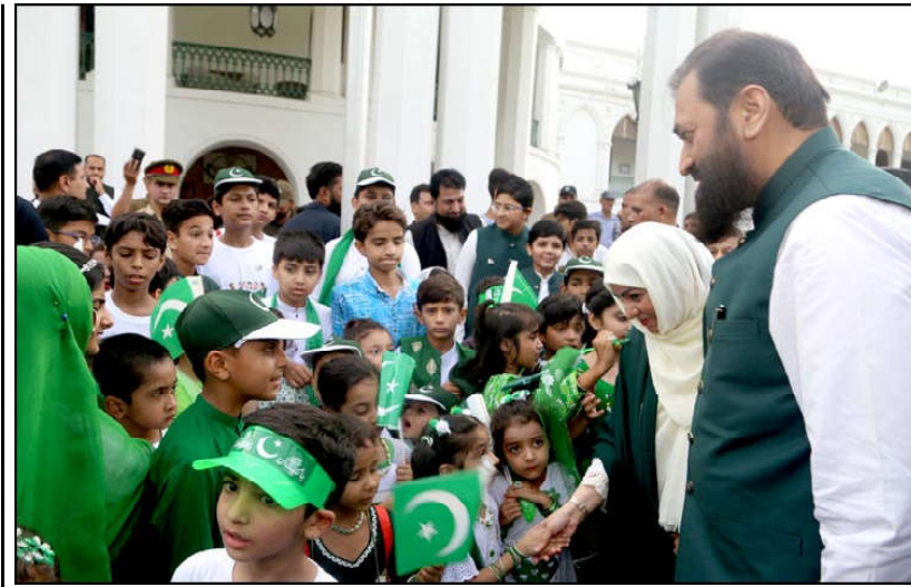
LAHORE: Governor Punjab Muhammad Balighur Rehman talking to children on the eve of flag hoisting ceremony on the occasion of 76th Independence Day of Pakistan at Governor House.

significant improvements if honesty becomes the cornerstone of all efforts. He emphasized that teachers' dedication in imparting knowledge with integrity would lead to a promising future for the children. Reflecting on the grand Independence Day ceremony held at Shahi Qila the previous night, Mohsin Naqvi highlighted the participation of officers from diverse institutions, including the judiciary, military authorities, civil administration, police, and gave a message of unity and solidarity. Drawing inspiration from Quaid-i-Azam's emphasis on unity, Mohsin Naqvi emphasized that the nation's progress hinges on collective strength and consensus.