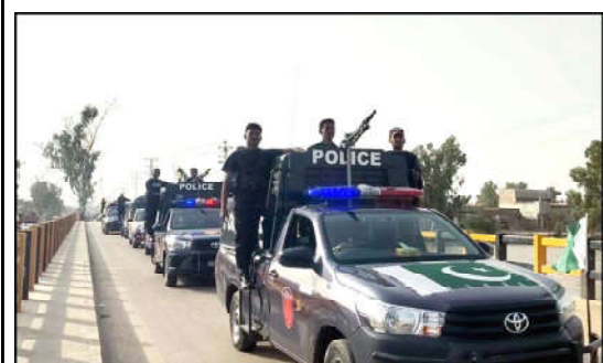
LARKANA: Security officials convoy patrol at road during flag march decorate their vehicles with national flags to maintain law and order situation in connection of the Independence Day of Pakistan coming ahead, held in Larkana.