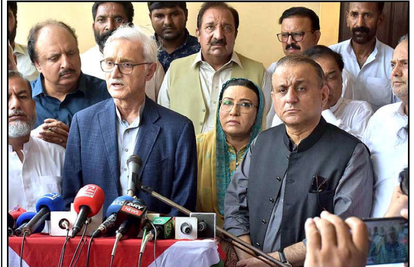
SIALKOT: The Chief Executive of Istehkam-e-Pakistan Party Jahangir Tareen, along with President Aaleem Khan and Dr. Firdous Ashiq Awan addressing to the media in Kobey Chak.

He pledged his commitment that the PPP would continue to play its full role for the supremacy of the constitution and parliament, economic equality, social justice and national harmony in the country, and will ensure that no citizen is deprived of the fruits of freedom.