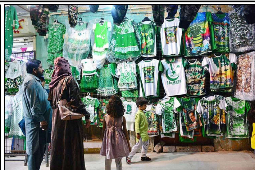
HYDERABAD: Family busy in selecting and purchasing National flag related stuff from vendor in connection with Pakistan Independence Day celebrations