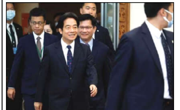
Taiwan's Vice President William Lai arrives at Taoyuan International Airport before his departure to the United States for a stopover in New York on his way to Paraguay, in Taoyuan, Taiwan.

There was little immediate sign that Garland's decision meaningfully changed Biden's standing within his party. If anything, it underscored the unprecedented nature of the next election. Rather than a battle of ideas waged on the traditional campaign trail, the next push for the presidency may be shaped by sudden legal twists in courtrooms from Washington to Delaware and Miami.