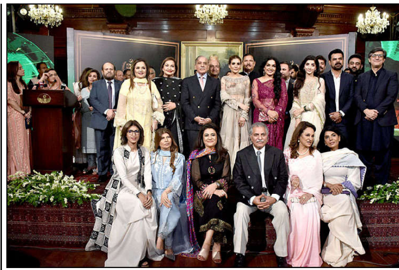
LAHORE: Prime Minister Shahbaz Sharif in a group photo with Journalists, Media workers, Artists and Technical resources during the launching ceremony of the Mobile App Radio Pakistan Awaz Khazana.

Mohsin Naqvi asserted that the shared responsibility of bequeathing a harmonious, robust, and flourishing Pakistan to the forthcoming generations. He underscored the pivotal role of exemplary unity and solidarity in confronting the challenges that lie ahead. Confidently, he envisioned a radiant future for Pakistan and emphasised that, through the benevolence of Allah Almighty, the Pakistani nation would triumph over every obstacle. He called upon all citizens to renew their commitment to prioritise the nation's growth over personal interests and collaboratively elevate the stature of Pakistan.