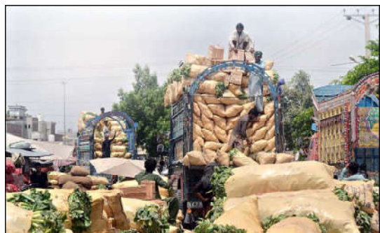
MULTAN: Labourers busy unloading vegetables on the delivery truck at the vegetable Market.

According to a press release issued on Sunday, he expressed these sentiments while addressing a cake-cutting ceremony held in connection with Independence Day at the Secretariat of HCSTSI.