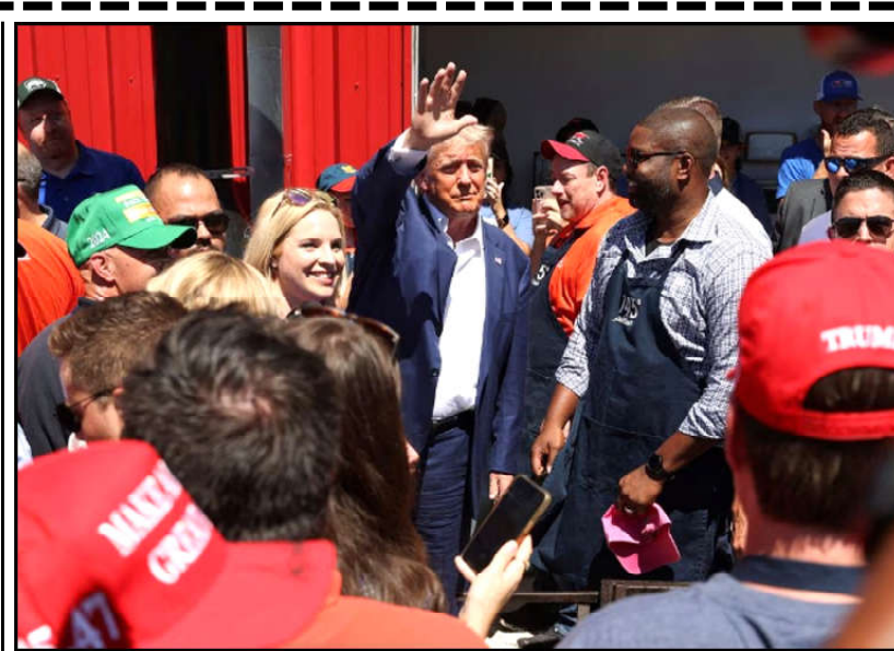
Republican presidential candidate and former U.S. President Donald Trump campaigns at the Iowa State Fair in Des Moines, Iowa, U.S.