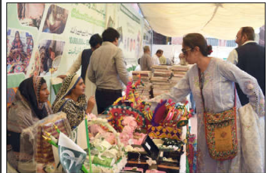
LAHORE: Visitors are busy buying handmade decorating items during an exhibition in connection with Independence Day, at Lahore museum in Provincial Capital.