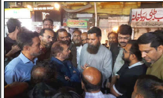
KARACHI: Muttahida Qaumi Movement (MQM) Senior Deputy Convener, Dr. Farooq Sattar along with others visit to Frisco Chowk during a celebration ceremony in connection of Independence Day of Pakistan coming ahead, held at Burns Road in Karachi.

This day also gave the opportunity for introspection, he said, stressing that they should reflect on the nation's progress so far, prevailing challenges, and opportunities for growth.