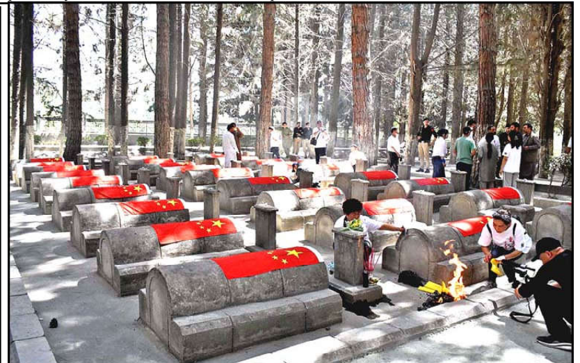
GILGIT: Chinese delegation paying tribute to their relatives who lost their lives during the construction of Karakoram Highway (1959-77) during their visit to Chinese Graveyard Daniyar.

In the process, the prime minister said, they established a glorious example of commitment and devotion to the cause of Pakistan.