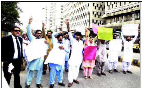
KARACHI: Members of Sindh Shagird Forum are holding protest demonstration for acceptance of their demands, held at Karachi press club.