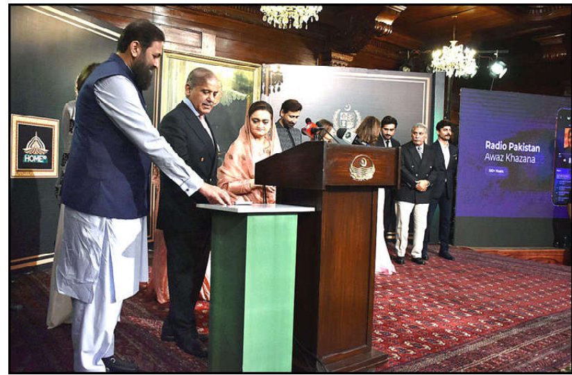
LAHORE: Prime Minister Shahbaz Sharif launches the Mobile App Radio Pakistan Awaz Khazana.