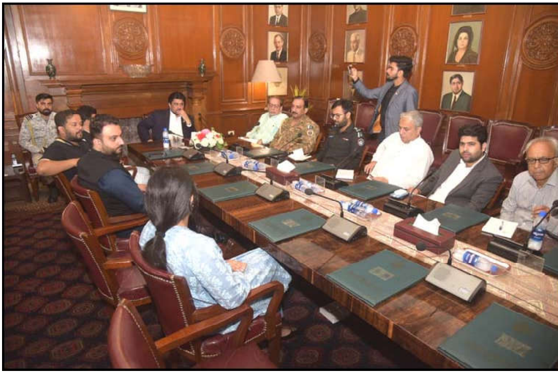
KARACHI: Sindh Governor Mohammed Kamran Khan Tessori presides over a meeting of arrangements for the independence day rally.