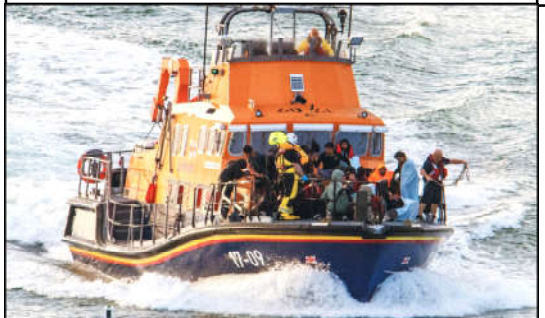
Rescue personnel bring survivors ashore, after migrants' boat sank in the English Channel.

Russia said in a statement that its Vasily Bykov patrol ship had fired automatic weapons on the Palau-flagged Sukru Okan vessel after the ship's captain failed to respond to a request to halt for an inspection. Russia said the vessel was making its way towards the Ukrainian port of Izmail.