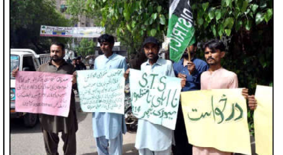
HYDERABAD: IBA passed candidates are holding protest demonstration for appointment letters, at Hyderabad press club.

"The water level consistently increasing in Nullah Dek at Kangara," irrigation department further said. Irrigation officials have apprehended that the floodwater could submerge Chahor, Dogri, Ropowali, Tambah Ghalib and Kalowali Syedan areas. Local administration has issued alert as rescue and relief teams have reached to the areas under flooding threat. India had also released water in Nullah Dek in July, which had flooded several villages in Pasrur tehsil of Sialkot district. The flood water from the neighbouring country caused high level flood in Nullah Dek inundating several villages and submerged standing crops on hundreds of acres.