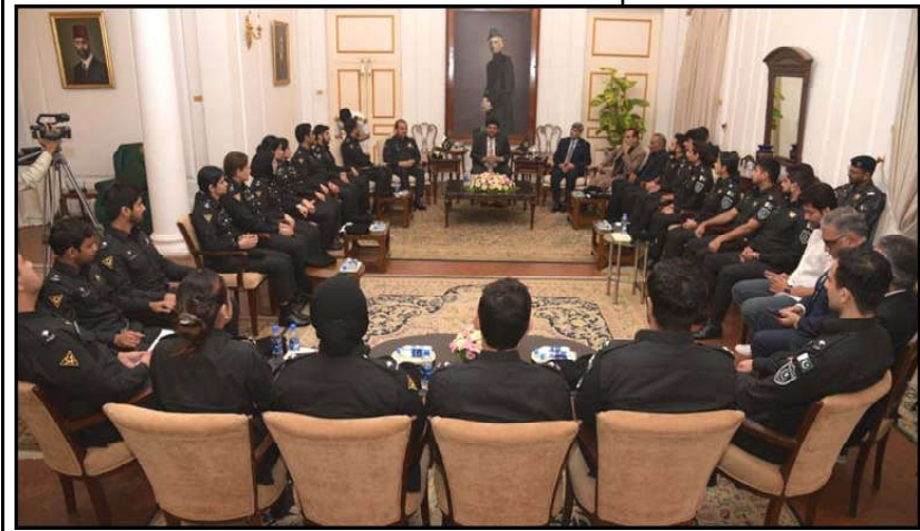
KARACHI: A delegation of under trainee Assistant Collectors meeting with Sindh Governor Kamran Khan Tessori.

On this solemn occasion of National Minorities Day, the speaker renewed the nation's commitment to construct a harmonious, progressive, and inclusive Pakistan, firmly grounded in the foundational principles laid down by the nation's visionary father, Qaid-e-Azam Muhammad Ali Jinnah.