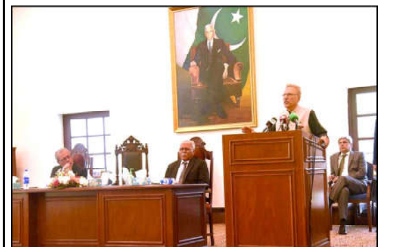
LAHORE: President Dr. Arif Alvi addressing Graduation Ceremony of NMC at National School of Public Policy.

in order to address their problems. This principle has been practised by great caliphs of Islam," Dr Alvi said, adding that welfare of the community should be the first priority of a civil servant. He said that brilliant civil servants were an antidote to the state's ills and that people with the right attitude could change the world around them. He remarked that the country needed such people more than before as the country was faced with multiple challenges. Dr Alvi urged the civil servants to follow in the footsteps of the former great civil servants and become a source of resistance against hypocrisy and corruption, besides ensuring good governance.