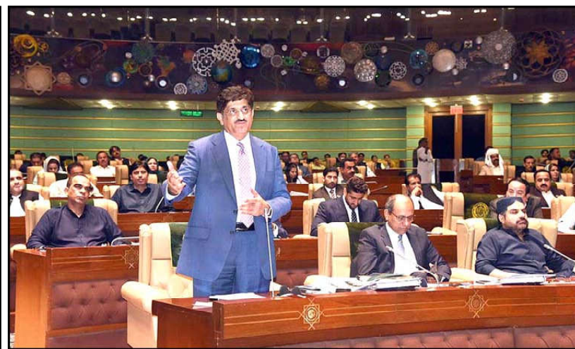
KARACHI: Upon the conclusion of assembly's five-year tenure, Sindh Chief Minister Syed Murad Ali Shah, as the leader of the House, delivers a farewell speech on the floor of the house.

The driver of the said vehicle was taken into custody. Further legal proceedings were underway.