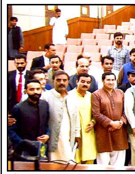
ISLAMABAD: Prime Minister Muhammad Shehbaz Sharif in a group photo with Beat Reporters at his office.

According to source both leaders discussed appointment of interim prime minister.