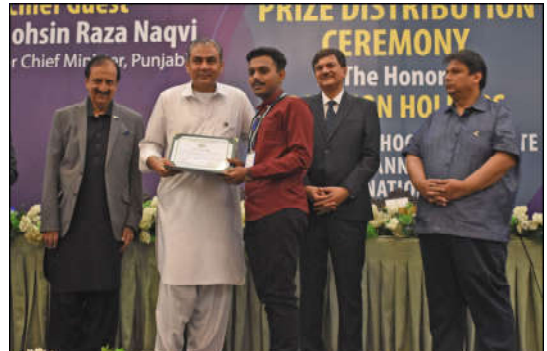
LAHORE: Caretaker Chief Minister of Punjab Muhsin Naqvi conferring the Gold medals and presenting certificates to position holders of Secondary School Examination, at local hotel in Provincial Capital.