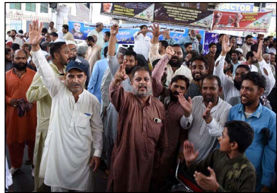
MULTAN: Members of Multan Chamber of Small Traders are holding protest demonstration against IMF policies, massive unemployment, increasing price of daily use products and inflation price hiking, in Multan.