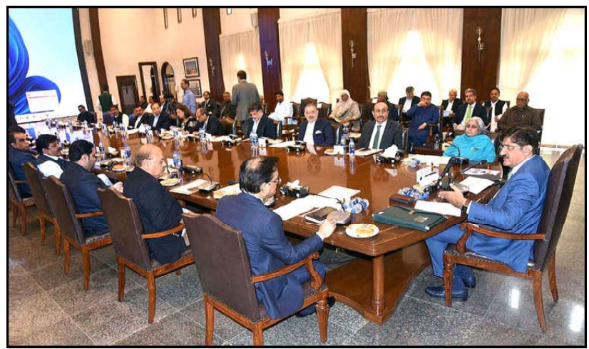
KARACHI: Sindh Chief Minister Syed Murad Ali Shah presides over a farewell cabinet meeting at CM House.