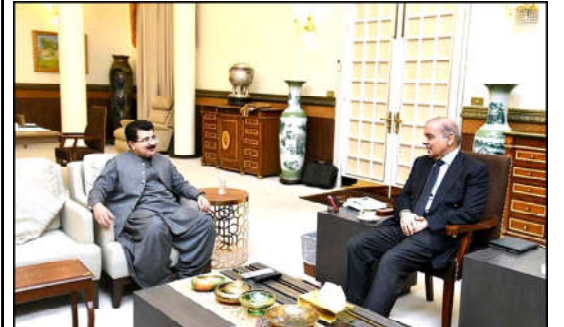
ISLAMABAD: Chairman Senate Muhammad Sadiq Sanjari called on Prime Minister Muhammad Shehbaz Sharif.