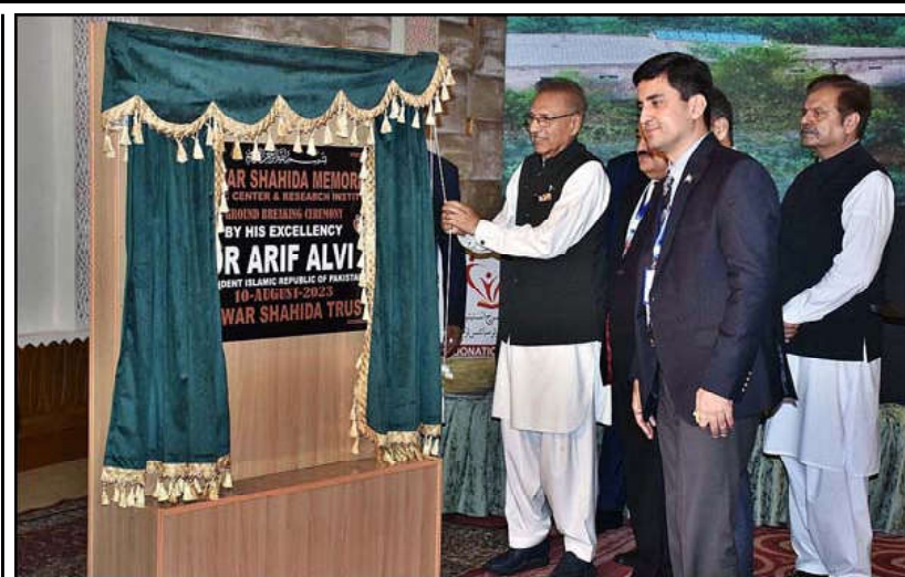
LAHORE: President Dr. Arif Alvi unveiling plaque during ground breaking ceremony the Sarwar Shahida Memorial Cardiac & Research Institute.

The president encouraged virtues such as charity, truthfulness, respect for elders, empathy, and cooperation, particularly in the younger generation. While acknowledging the government's role in addressing major issues, he emphasised that every individual in the Islamic framework has a role to play in serving others.