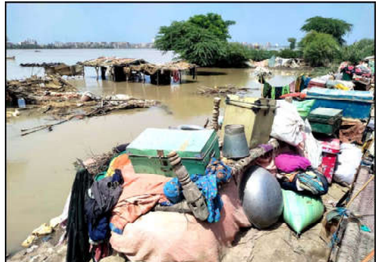
SUKKUR: View of stagnant water after low-level flood at Indus River, while flood water entered riverside settlements, showing negligence of concerned authorities, in Sukkur.

Among them, foreign reserves held by the central bank were US$ 8,153.8 million while net foreign reserves held by commercial banks were US$ 5,309.9 million.