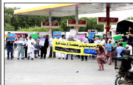
KARACHI: Victims of ASF Tower/Arabian Vista are holding protest demonstration for demanding ownership rights, at Shahrah-e-Faisal near Natha Khan Bridge in Karachi.