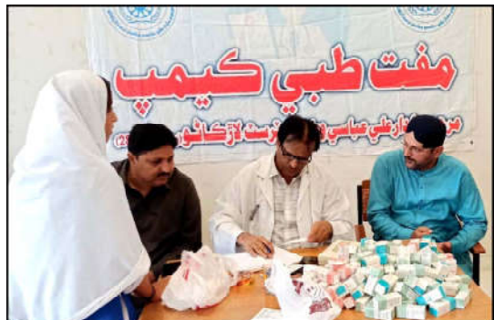
LARKANA: Students are being examine by doctors during the free medical camp organized by Late Dildar Ali Abbasi Welfare Trust held at Government High School Kehar in Larkana.