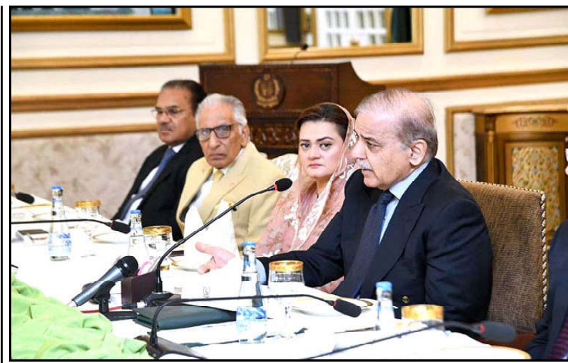
ISLAMABAD: Leader of the Opposition, Raja Riaz Ahmad calls on Prime Minister Muhammad Shehbaz Sharif as part of the consultation process for selection of the Caretaker Prime Minister.