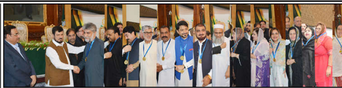
PESHAWAR: Governor Khyber Pakhtunkhwa Haji Ghulam Ali distributing awards under the auspices of the Federation of Pakistan Chambers of Commerce & Industry (FPCCI) at Governor's House.

According to the SCCCI press release, the award was given in recognition of the SCCCI meritorious services in domains of trade, commerce, and industrial development.