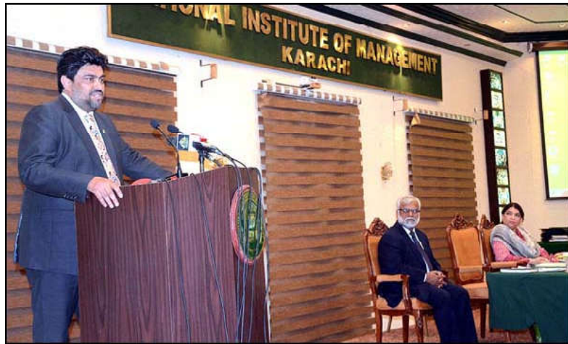
KARACHI: Governor Sindh, Muhammad Kamran Khan Tessori addressing as a Chief Guest of the Graduation Ceremony for the participants of 33rd Senior Management Course at National Institute of Management (NIM).

"Imran Niazi's narrative was that America tried to topple his government because he was more attracted to China and Russia, so tell me that if our government was formed through the American conspiracy.