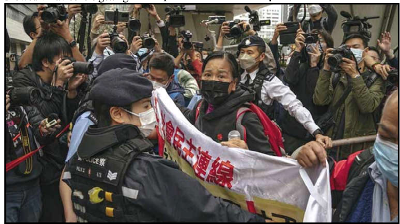
Hong Kong arrests 10 for 'foreign collusion' over violent pro-democracy protests.

The council would meet on Aug. 17 and be briefed by U.N. High Commissioner for Human Rights Volker Turk and the U.N. Special Rapporteur on the Situation of Human Rights in the DPRK, Elizabeth Salmón, said Thomas-Greenfield. China and Russia object to the issue being raised in the council, which is charged with maintaining international peace and security. They say rights issues should be confined to other bodies such as the U.N. Human Rights Council or General Assembly. China and Russia could call a procedural vote next week, but a senior U.S. official said they were confident they have the minimum nine votes needed to hold the meeting.