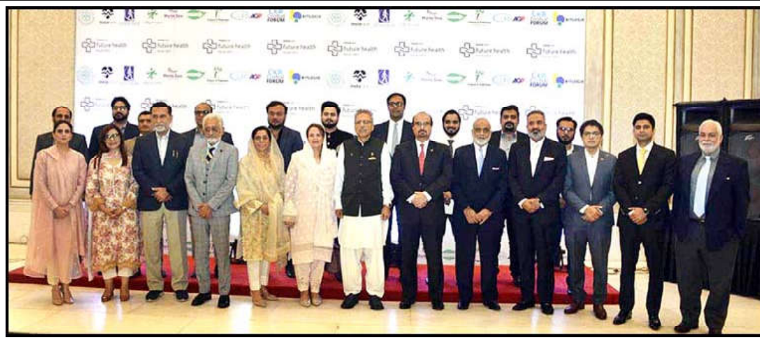
LAHORE: President Dr. Arif Alvi in a group photo with healthcare professionals attending the Instacare Future Health Forum 2023 on Advancing Healthcare with Artificial Intelligence and Machine Learning.