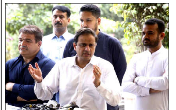
KARACHI: Mayor Karachi, Barrister Murtaza Wahab addresses to media persons during press conference, at Sindh Assembly in Karachi.

The meeting to consult the name of the caretaker prime minister was held in a cordial environment, said a press release issued by the Prime Minister Office.