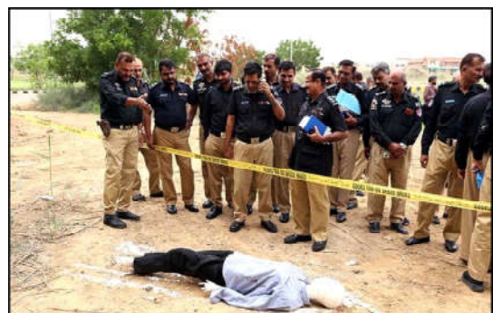
KARACHI: Police officials from Crime Scene Unit and Police Investigation Department are being given hands-on training at the mock crime scenes in Sindh Forensic DNA and Serology Laboratory (SFDL) held at ICCBS University of Karachi.

Talking to APP, she said that "We always buy clothes for ourselves and kids at the sales offered on Independence Day and other such occasions for the next season".