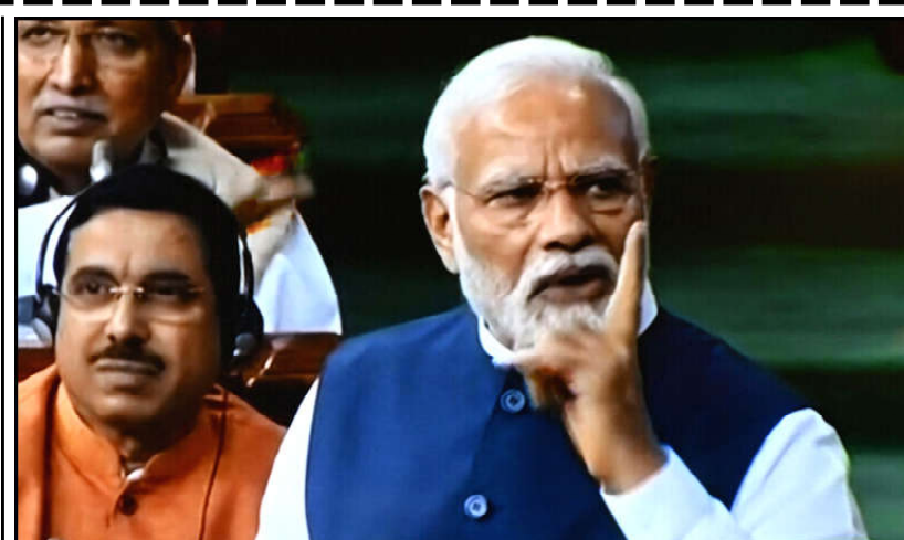
India's Prime Minister Narendra Modi (R) is seen on a television screen as he addresses the lower house Lok Sabha in New Delhi.

But Putin hasn't ruled out his attendance, the Kremlin official told NBC News, seeking to "re-launch himself on the world stage" ahead of next year's election. Likewise, the official claimed that Putin is keen to win over countries that aren't solid in their support for Russia in its invasion of Ukraine.