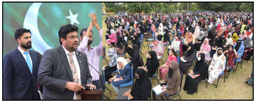
KARACHI: Governor Sindh Kamran Khan Tessori addressing candidates of 24th tests of IT courses at Governor House.